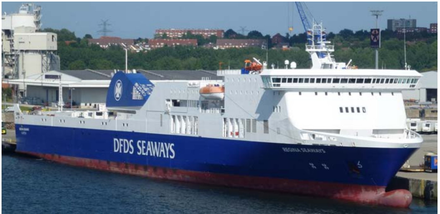
The REGINA SEAWAYS moored in Rostock