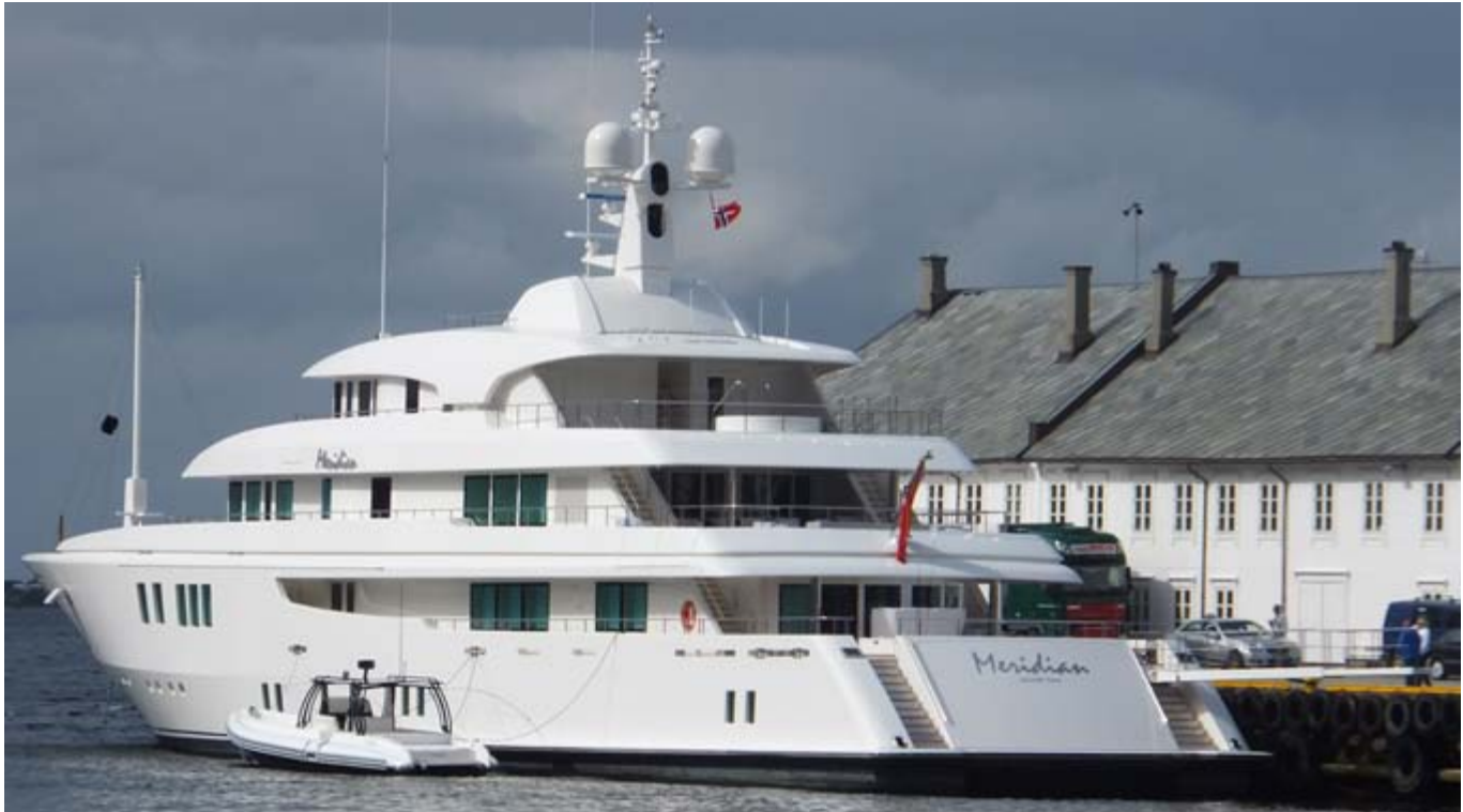
MY MERIDIAN moored in Aalesund, Norway on 19.08.2013