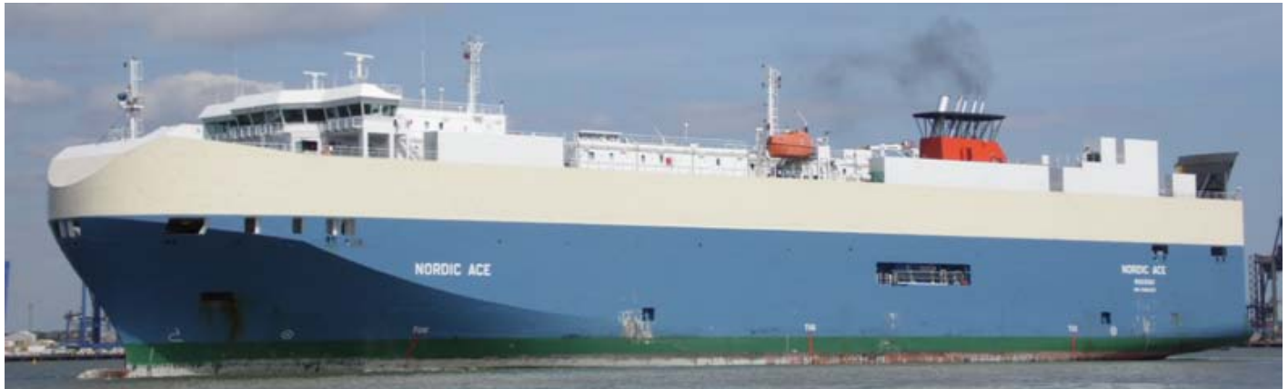
The NORDIC ACE arriving in Harwich - Photo : Andrew Moors – RNLI Harwich lifeboat ©