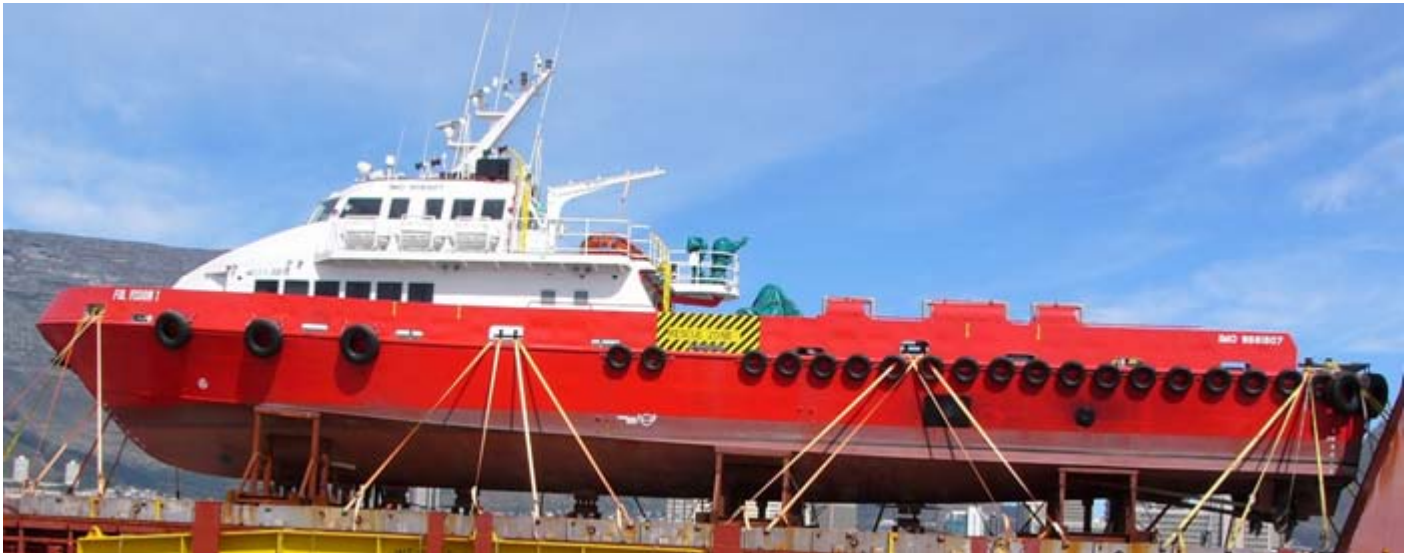
The FLEX 38 SL crewboat FOL VISION 1 onboard THORCO CELEBRATION in Cape Town