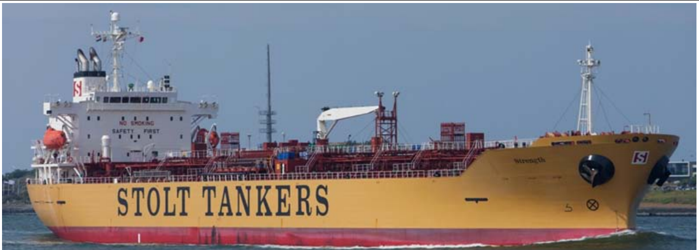
The STRENGTH enroute Rotterdam

ALSO INTERESTED IN THIS FREE MARITIME NEWSCLIPPINGS ? PLEASE VISIT THE WEBSITE : WWW.MAASMONDMARITIME.COM AND REGISTER FOR FREE !