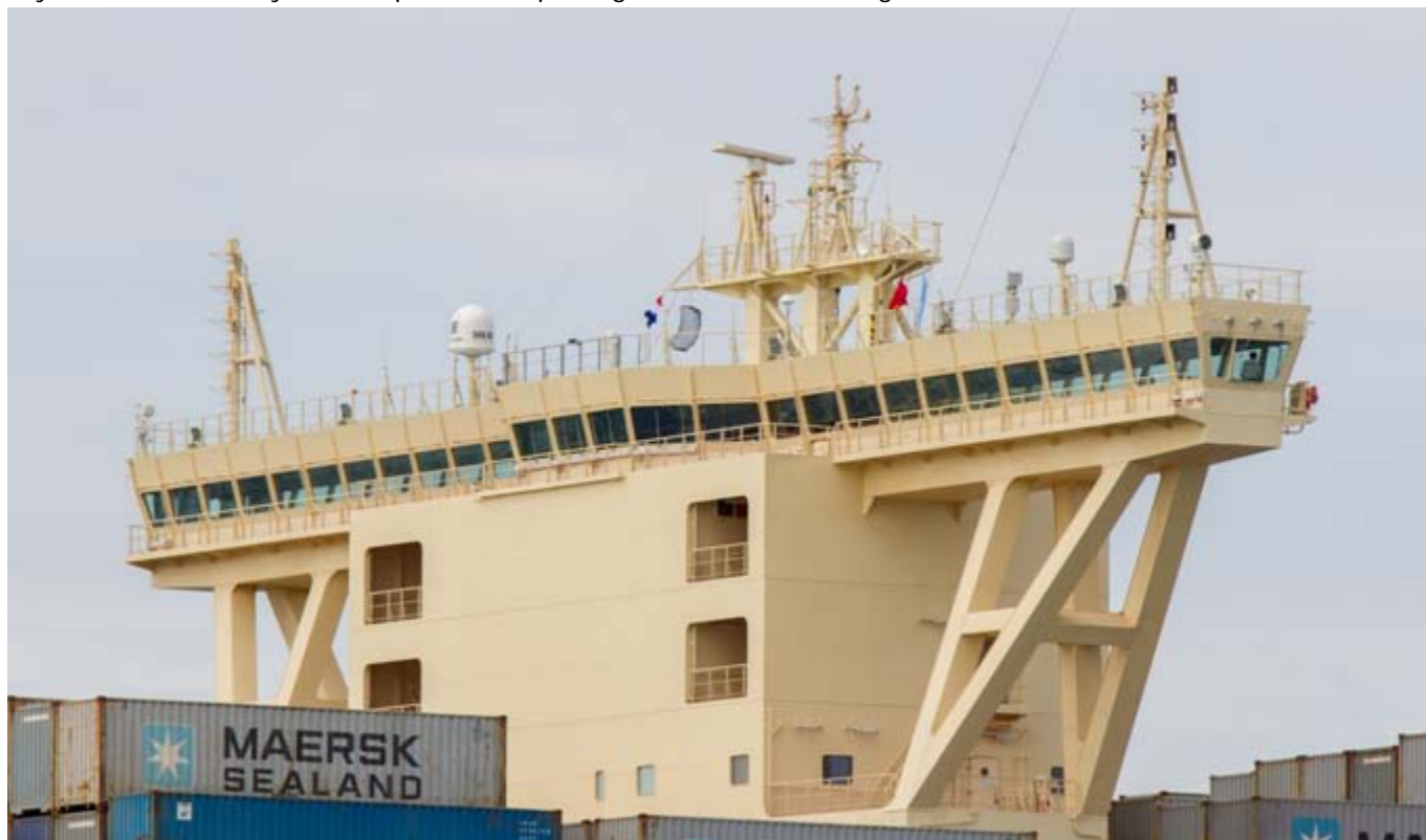
The Maersk Mc Kinney Moller in Rotterdam last week – Photo : Marijn van Hoorn ©

The selloff also followed a collapse in China's export gains in May. In July, China's Finance Minister Lou Jiwei said the government might be able to tolerate economic growth as slow as 6.5 percent, compared with an official target of 7.5 percent. The remarks were subsequently retracted on state radio. Since then, several key indicators have signaled that growth in the largest emerging-market economy may be set to accelerate again. Industrial output in China beat analyst estimates in July while export and import figures were also stronger than forecast.