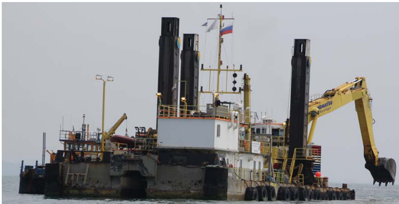
The backhoe dredge MARICAVOR deepening the entrance channel for Sochi Main Port

info@dutchharbour.nl www.dutchharbour.nl