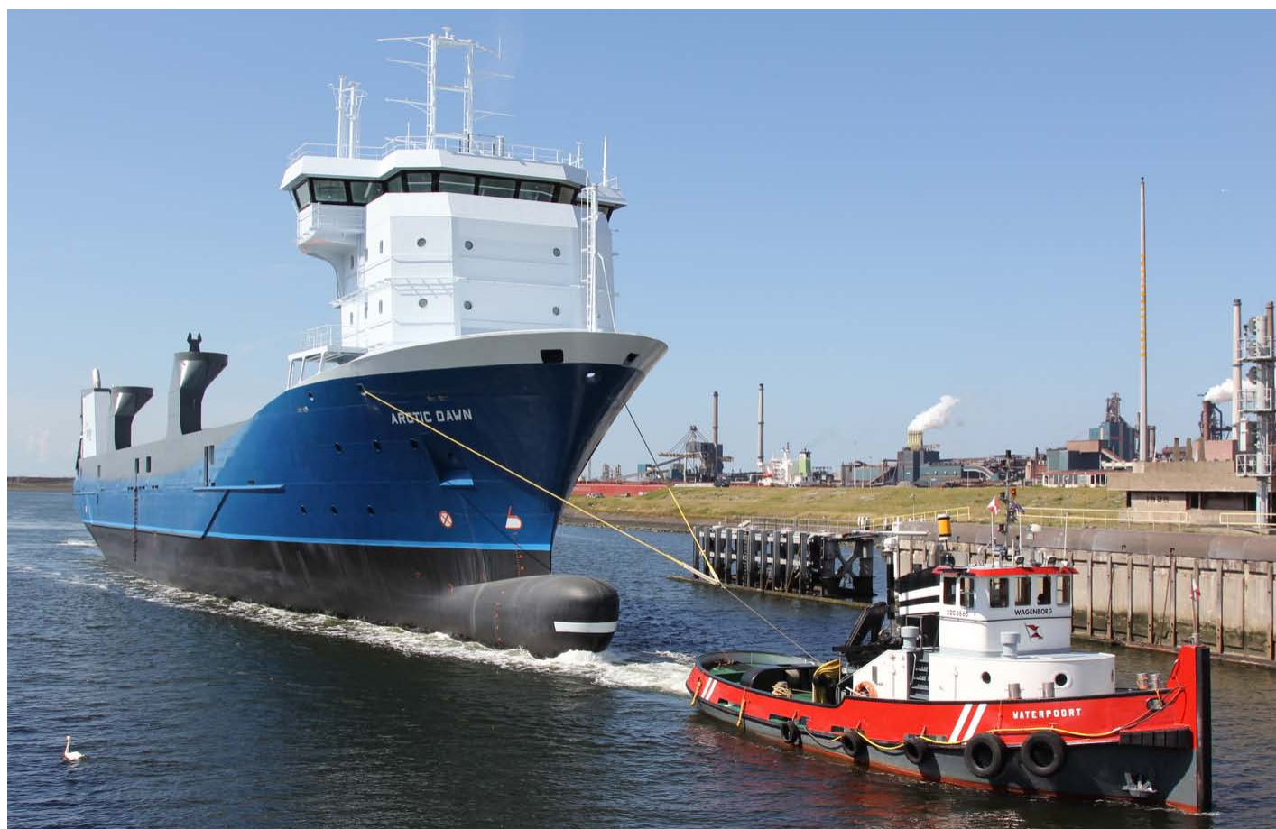
The WATERPOORT with the ARCTIC DAWN enroute Urk - Photo : Jan Plug ©