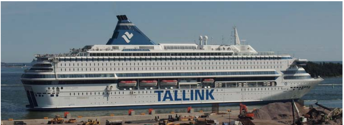
The SILJA EUROPA in Helsinki