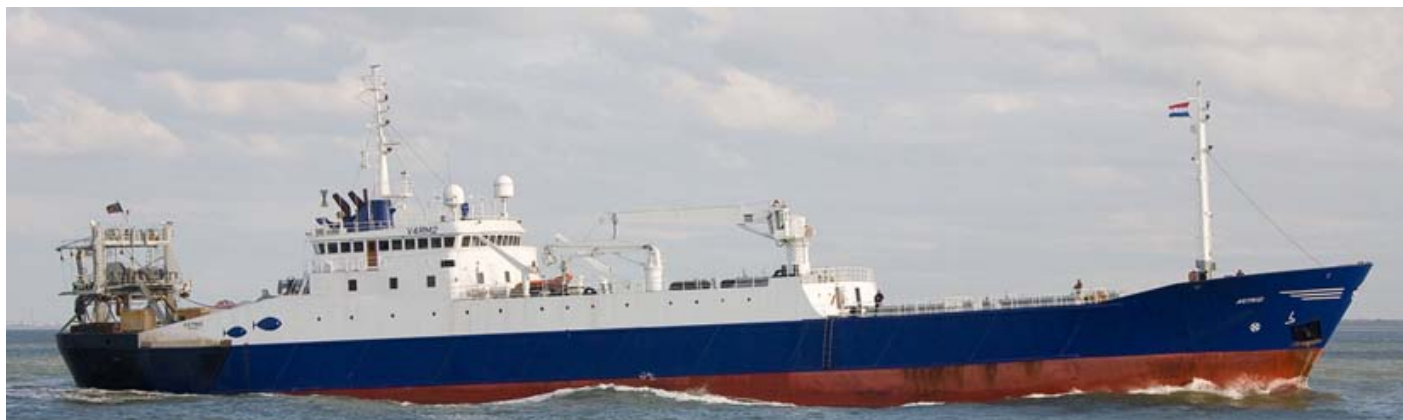
The ASTRID enroute from Poland to Mauretania made a bunker stop at the Everingen (Westerschelde)

Aker Solutions has previously conducted concept studies for the Johan Castberg field, which is estimated to hold between 400 million and 600 million barrels of oil. The Statoil-operated field is located about 240 kilometres north-west of Hammerfest.