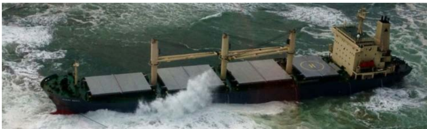
The KIANI SATU aground off Buffels Bay near Knysna

Campbell said at this depth the water temperature was between 3°C and 5°C, which it was hoped would be cold enough to “solidify” the oil on board the ship so that it could limit the spread of oil. “When she sinks it will be up to the Department of Environmental Affairs to monitor the situation,” Campbell said.