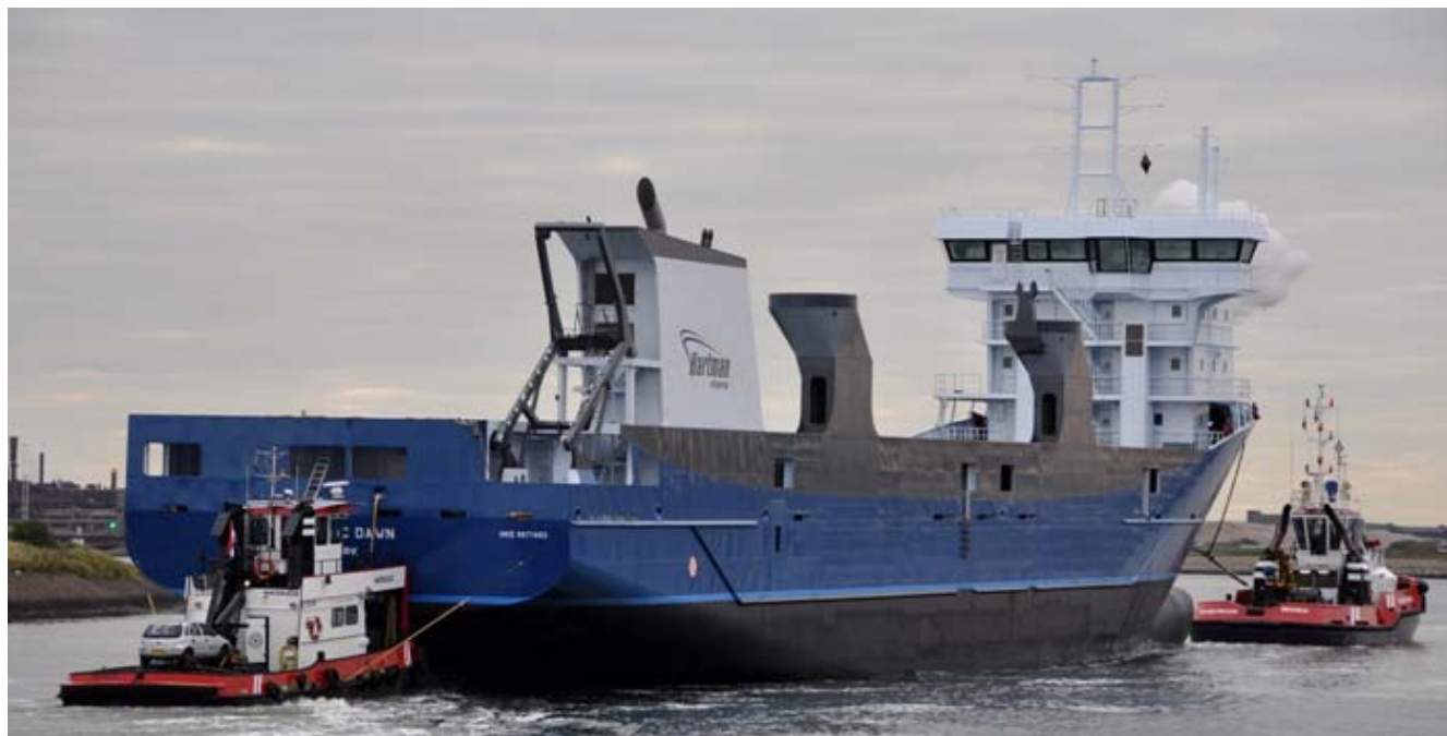
The ARCTIC DAWN under tow of the tug WATERSTROOM and pushed by the pusher tug WATERLELIE enroute the IJmuiden locks for further transportation to Urk for outfitting – Photo : Marcel Coster ©

'Kara-Summer 2013 is the third expedition commissioned by Rosneft. In August alone, Rosneft used 12 vessels, three aircraft, air drones, submersibles, subsea and floating self-contained stations, satellite surveillance systems and other equipment for the Kara Sea studies,' reads the note. In 2013, Rosneft's total investments in the Kara Sea studies will exceed 1.5 bln rubles (30 million euros). The explorations in the Kara Sea are part of a wider mid-term plan to develop offshore projects in the Fas East. Source: Natural Gas Europe