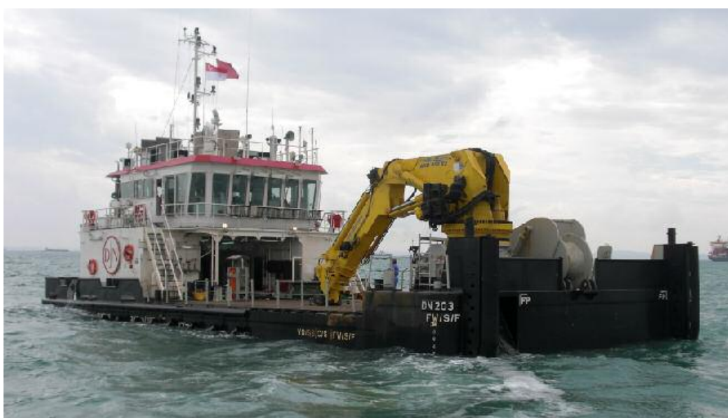
Jan de Nul's DN 203 seen at the Singapore Eastern anchorage

Your feedback is important to me so please drop me an email if you have any photos or articles that may be of interest to the maritime interested people at sea and ashore PLEASE SEND ALL PHOTOS / ARTICLES TO :