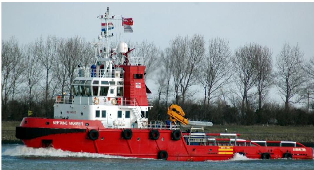
The NEPTUNE MARINER seen departing from Rotterdam - Photo : Ruud Zegwaard ©