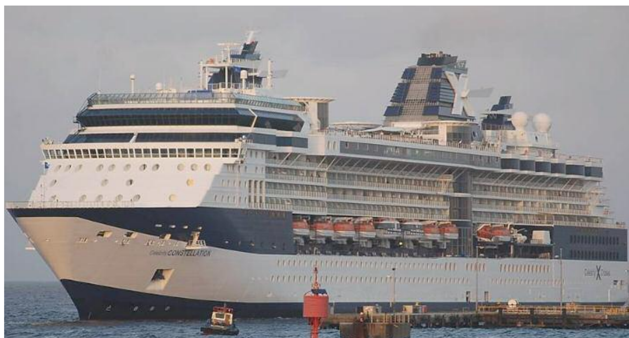
The CELEBRITY CONSTELLATION seen in Willemstad (Curacao)