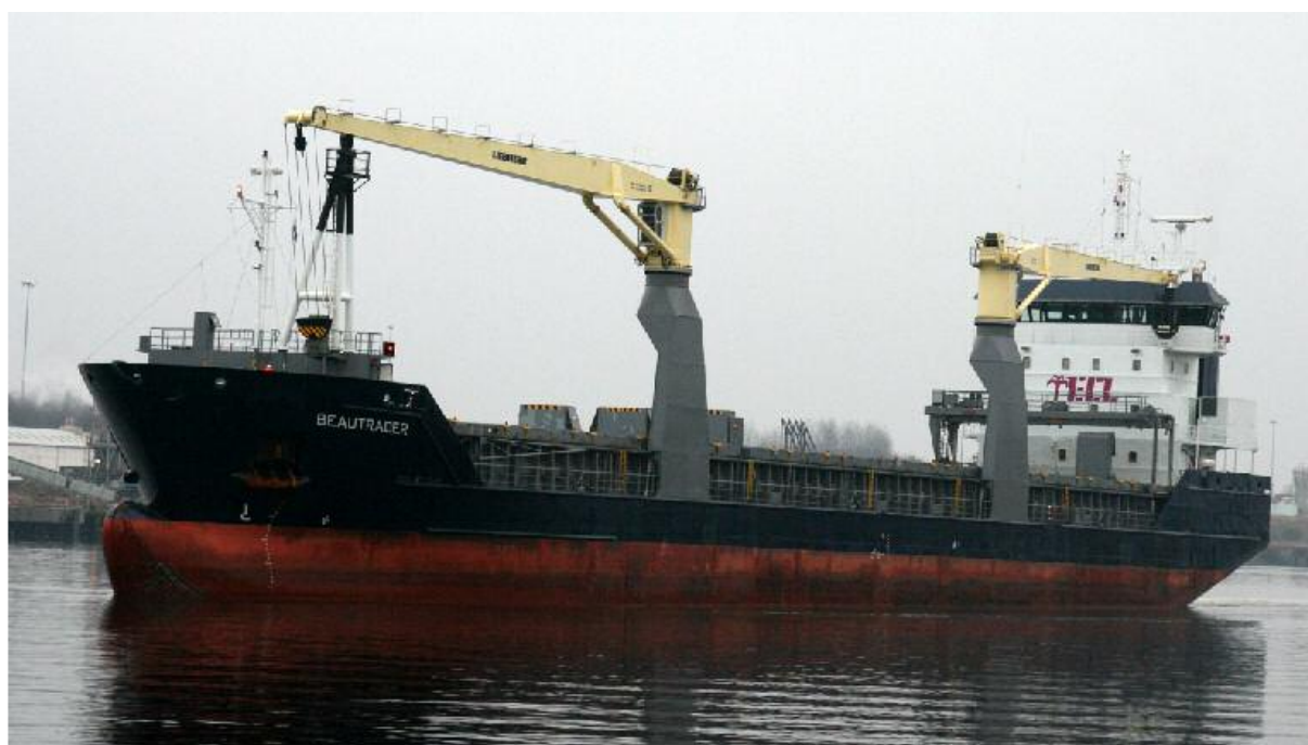
The BEAUTRADER seen at the river Tyne