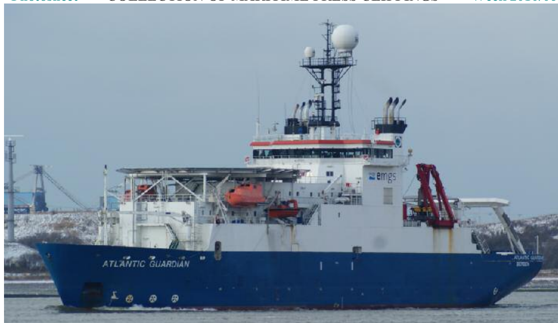
The ATLANTIC GUARDIAN seen enroute Rotterdam

Photosheet *** COLLECTION OF MARITIME PRESS CLIPPINGS *** Week 2010/06