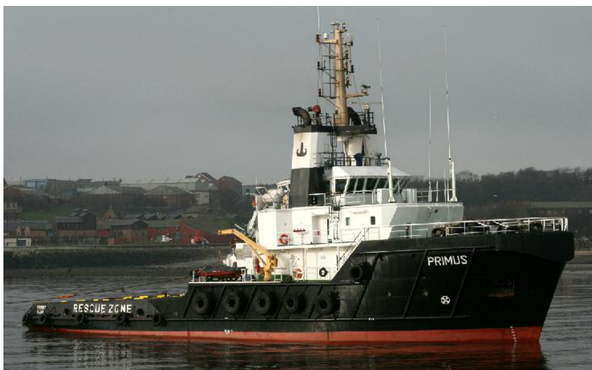
Harm's PRIMUS seen at the river Tyne