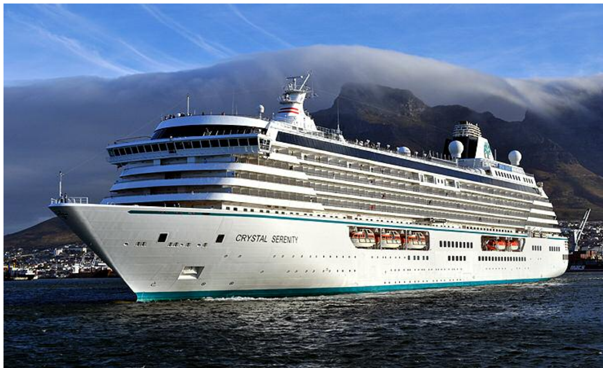
Beautiful shot of the CRYSTAL SERENITY seen departing from Cape Town Port