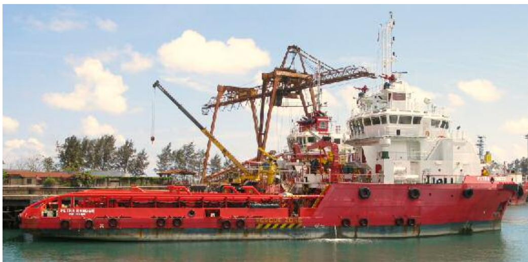
The PETRA RANGER seen moored at KSB supply base in Malaysia

after receipt of this e-mail I will remove you from the distribution list soon as possible