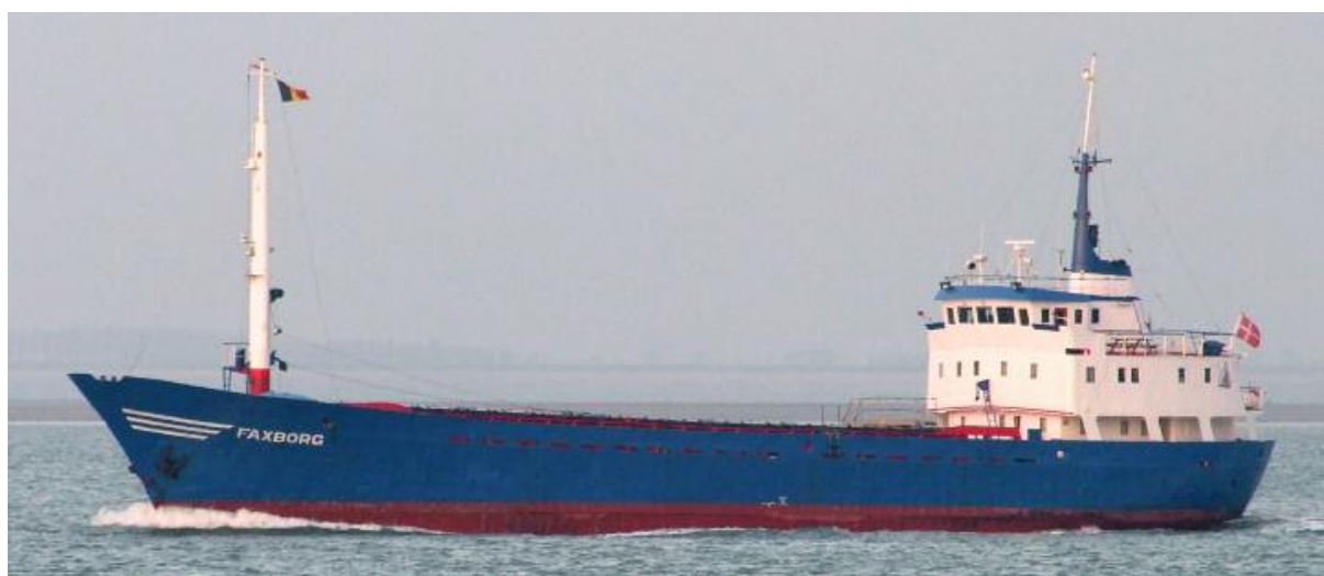
The Danish flagged FAXBORG seen at the Westerscheldt River