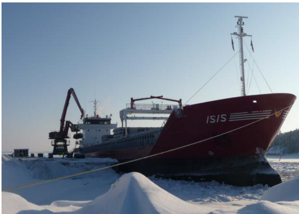
6000 tons m/v ISIS seen in Dalsbruk, Finland, loading wire rods for Italy in nice winter conditions.