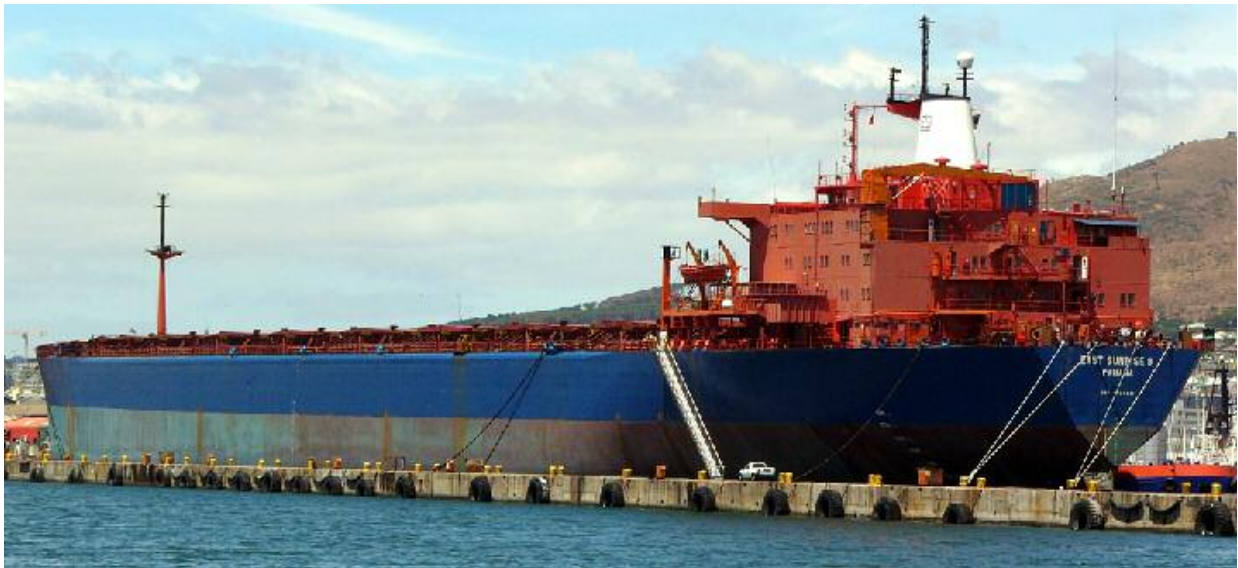
The EAST SUNRISE 9 seen in Cape Town for bunkers