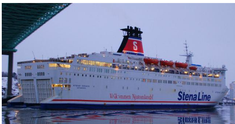
The STENA DANICA seen in Gothenburg – Photo : Rob de Visser ©