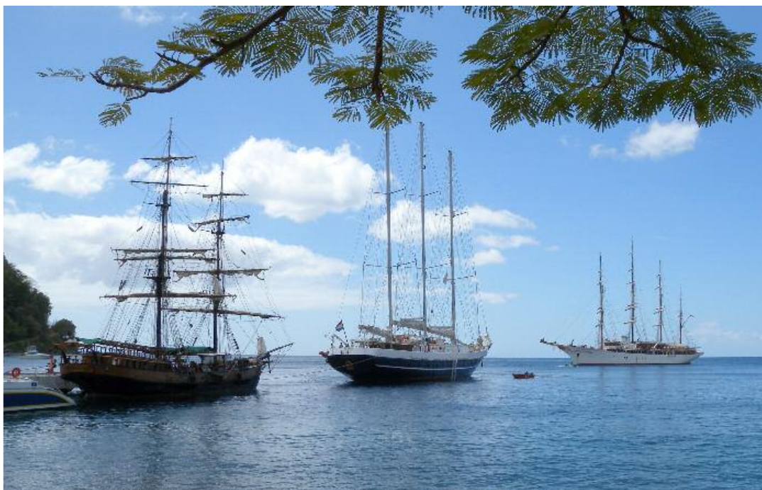
Seen in Souffriere, St.Lucia, Caribbean. The old brik Únicorn, the schooner Eendracht and the fourmasted Sea Cloud.

Thank you for sending the photos, and all have a nice weekend !!