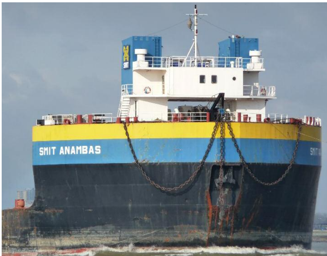
The SMIT ANAMBAS seen shifting from location in the Port of Rotterdam