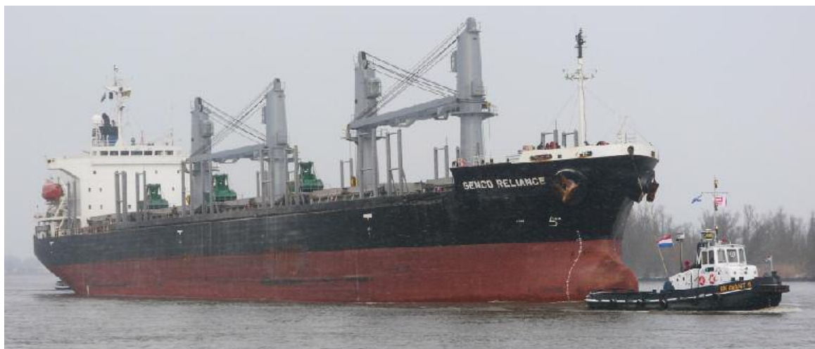
The GENCO RELIANCE seen enroute Moerdijk