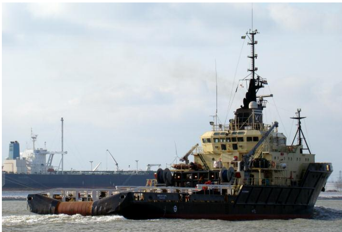
A stern shot of the departing ANGLIAN EARL as seen yesterday enroute Folkstone