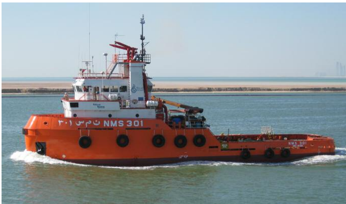
Esnaad's NMS 301 seen in Abu Dhabi