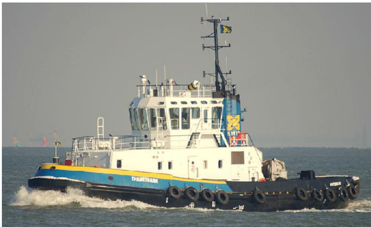
The THAMESBANK completed her maintenance / dry docking period in Antwerp and returned to Rotterdam, above seen the tug passing Terneuzen