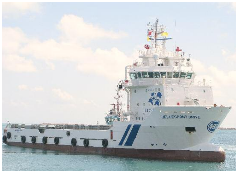
The new 5450 bhp / 73 mtr HELLESPONT DRIVE arrived from the builders in India at KSB (Malaysia) for the first time