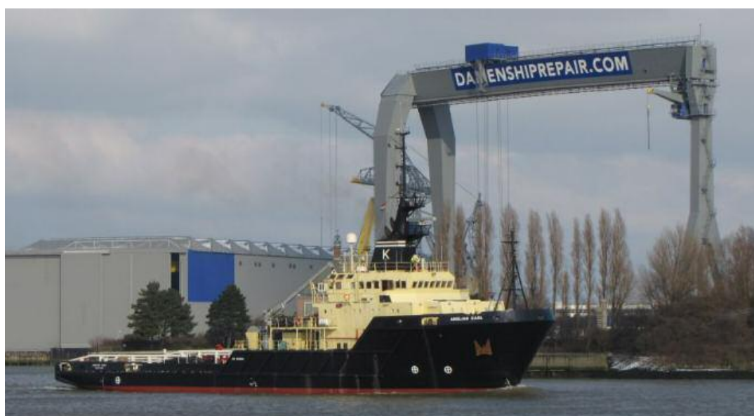
The ANGLIAN EARL completed her maintenance period at the Damen Ship repair yard in Schiedam and after some dancing steps at the river she departed Thursday afternoon in her new J.P Knight colours from Schiedam enroute the UK