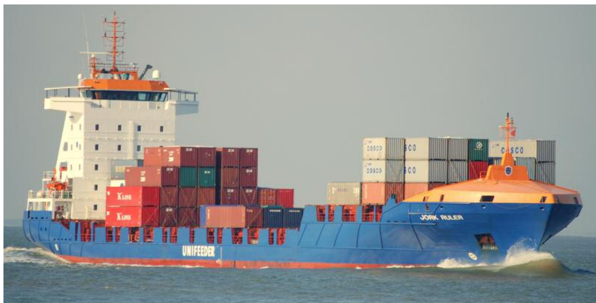
The JORK RULER seen enroute Antwerp