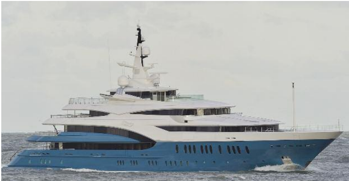
OCEANCO's latest newbuilding (Yard number 705) is named SUNRAYS seen above during trials off Hoek van Holland

Over the past few years, Chinese spy ships have often appeared around Taiwanese waters. Taipei has requested to buy diesel-electric submarines from the United States, but they were not included in a US$6.4 billion weapons package for Taiwan announced by the Obama Administration last Friday. Source : Taiwan News