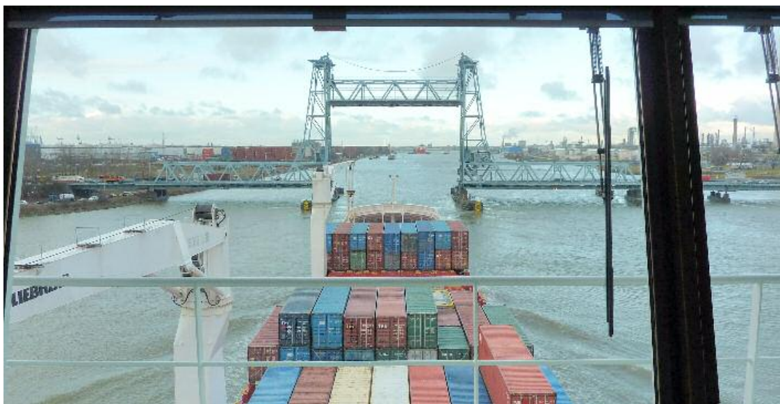
The REECON WOLF seen passing the Botlek Bridge in Rotterdam - Photo : Marijn van Hoorn ©