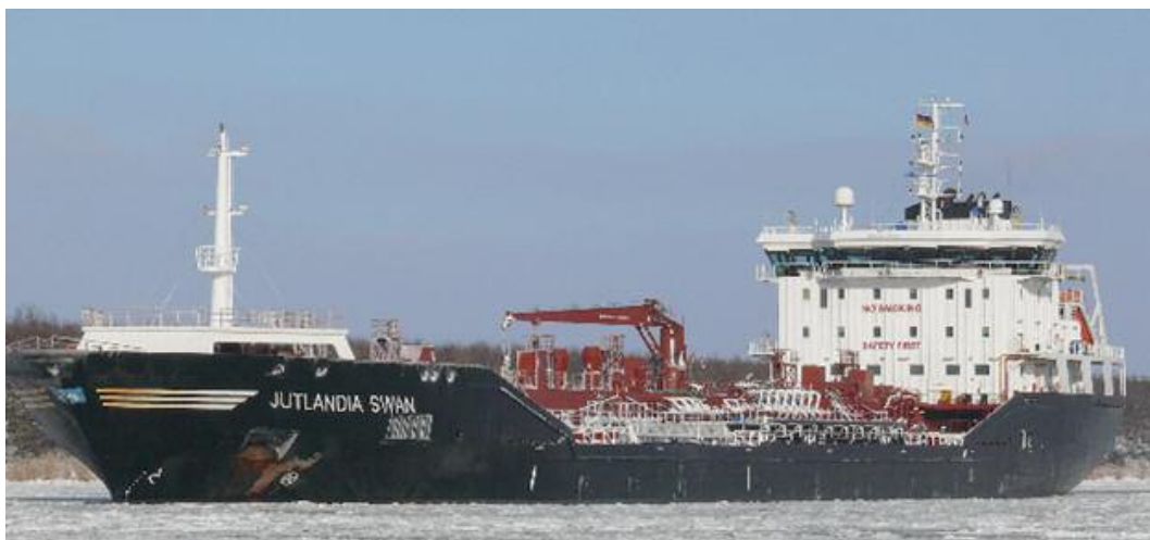
The JUTLANDIA SWAN , IMO 9350757, after Kiel-Canal transit, seen at Brunsbüttel on January 30th, 2010.