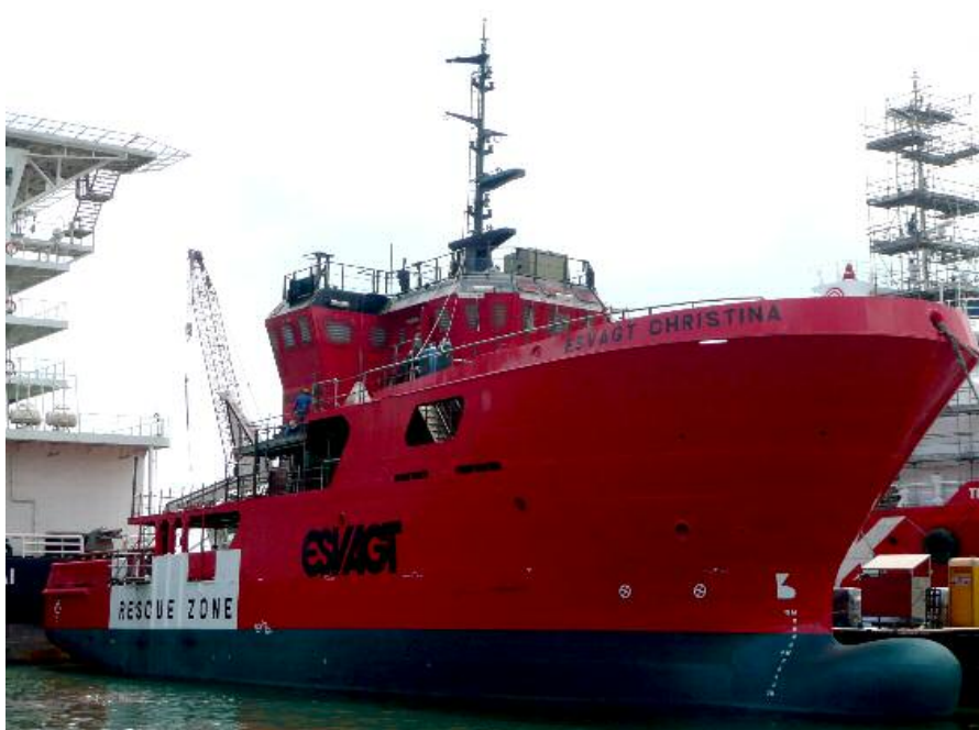
The ESVAGT CHRISTINA seen fitting out at the ASL shipyard in Singapore

above photo can also be seen in high resolution in the photo album at my website www.maasmondmaritime.com or via the direct link http://www.flickr.com/photos/33438735@N08/show/