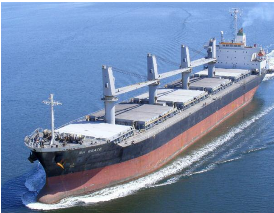
SH Grace seen about to pass under the Tasman Bridge after unloading Concentrates at Nystar zinc processing plant at Risdon.