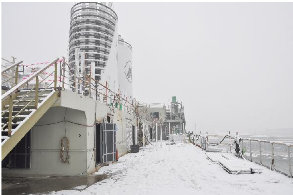
HAL's NIEUW AMSTERDAM seen fitting out at the Fincantieri Shipyard in a wintery Marghera / Venice