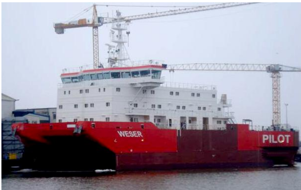
The new German (SWATH) pilot cutter WESER seen fitting out at the builders