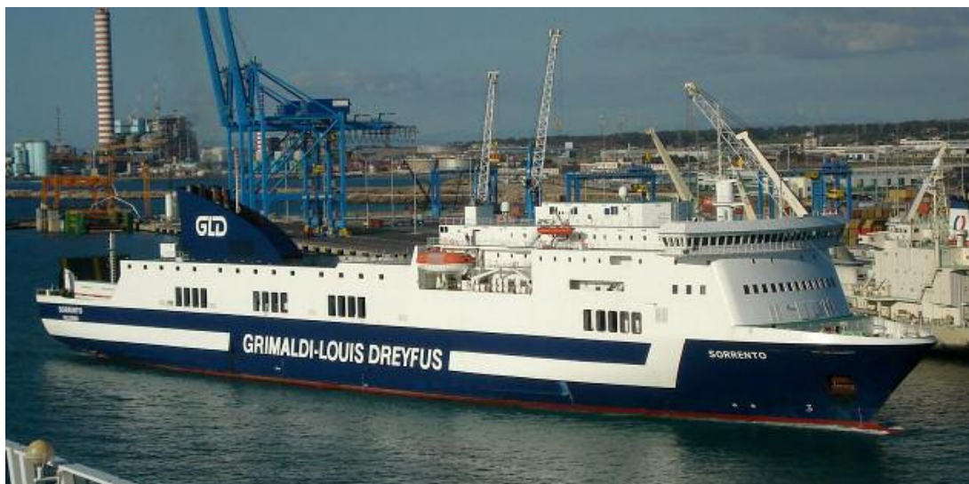
The ferry SORRENTO seen in Civitavecchia