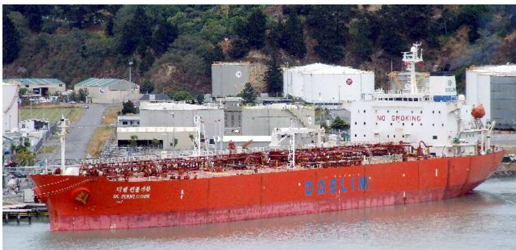
The DL SUNFLOWER seen moored in Littleton