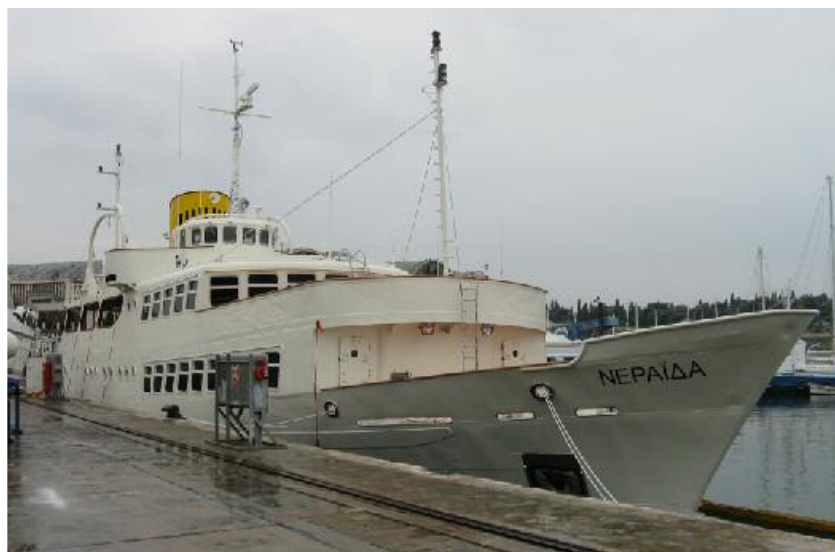
Outfitting MY Neraida at NCP refit yard in Sebenik Croatia the vessel is renovated and all old details are back Almost ready for its new life it will become a private yacht and museum