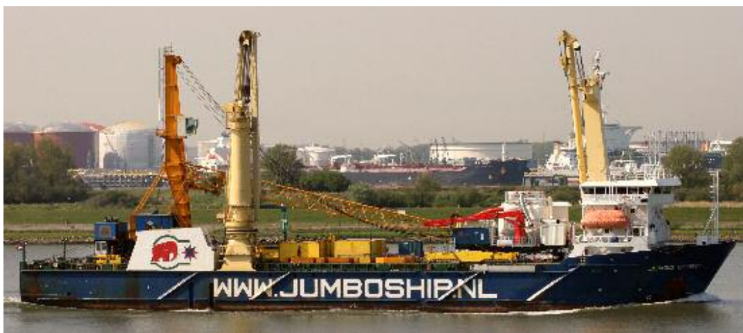
The JUMBO SPIRIT seen departing from Rotterdam - Photo : Cees Kloppenburg ©

REDWISE Shipdelivery reports that the 3 rd Canadian ferry named COASTAL CELEBRATION will depart May 9 th from Flensburg around 09:00 hrs LT