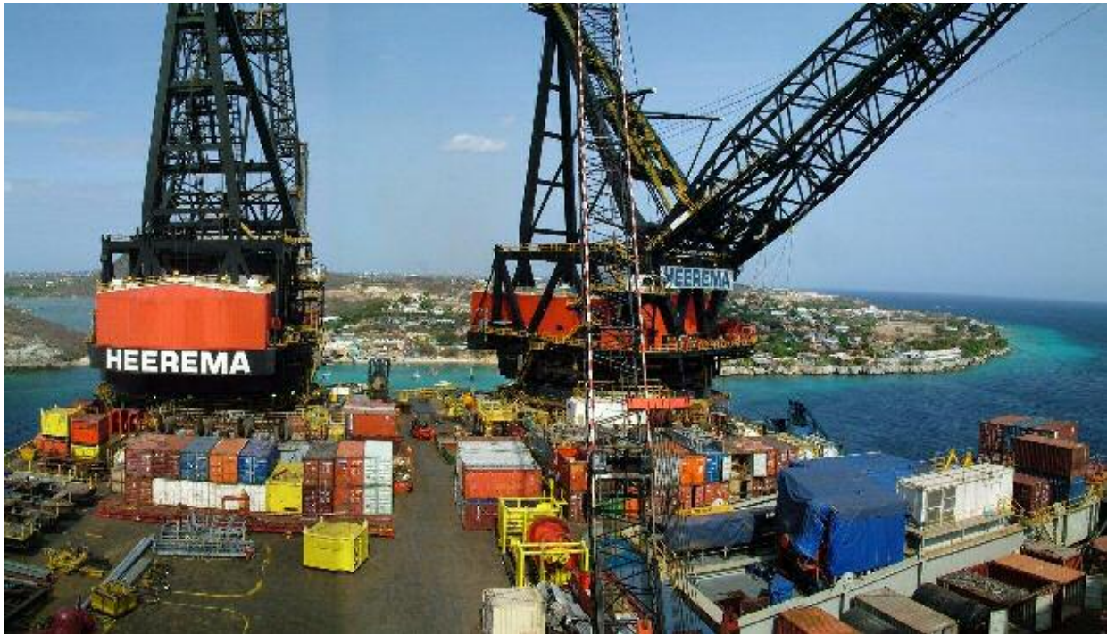
Curacao seen from the deck of the THIALF

The compiler of the news clippings disclaim all liability for any loss, damage or expense however caused, arising from the sending, receipt, or use of this e-mail communication and on any reliance placed upon the information provided through this free service and does not guarantee the completeness or accuracy of the information. If you want to no longer receive this bulletin kindly reply with the word "unsubscribe" in the subject line.