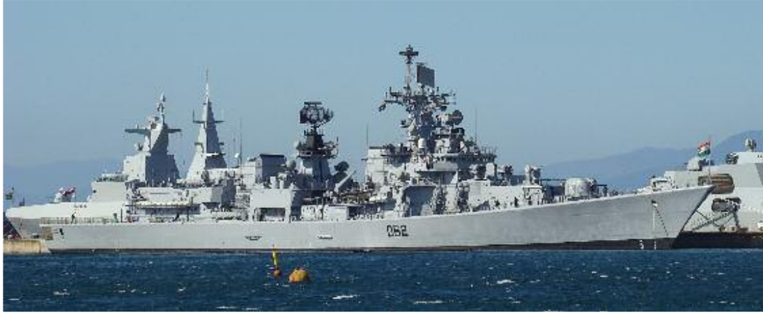
The INS MUMBAI seen moored in Simonstown

The Brazilian Navy have deployed two " NITEROI CLASS" frigates BNS INDEPENDENCIA and BNS DEFENSORA as well as a SEA KING and CHETAK helicopters.