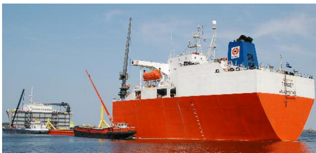
Dockwise TARGET seen after offloading of the MOPU GBS in Rotterdam-Europoort