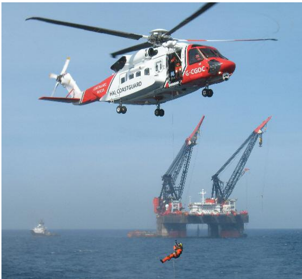
The HM Coastguard SAR S92 G-CGOC Helicopter seen from Heerema's tug Retriever 13 NM East of Sunbrough (Shetland Islands) performing a rescue exercise. On the background the crane barge Hermod .