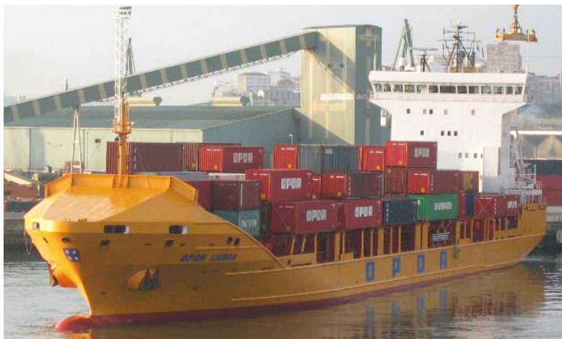
The OPDR LISBOA seen arriving in La Caruna

Telephone : + 31 2555 627 11 Telefax : + 31 2355 718 96 E-mail: oceantowage.sales@svitzer.com