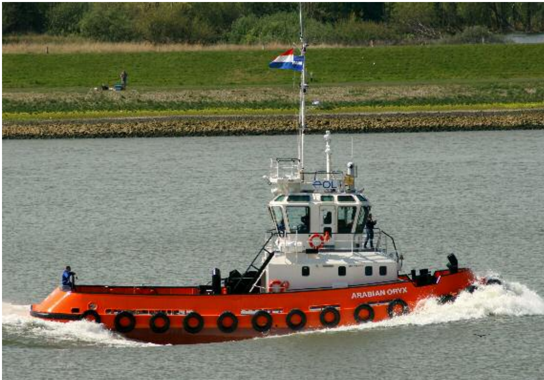
The ARABIAN ORYX seen during yard trails in the Rotterdam-area