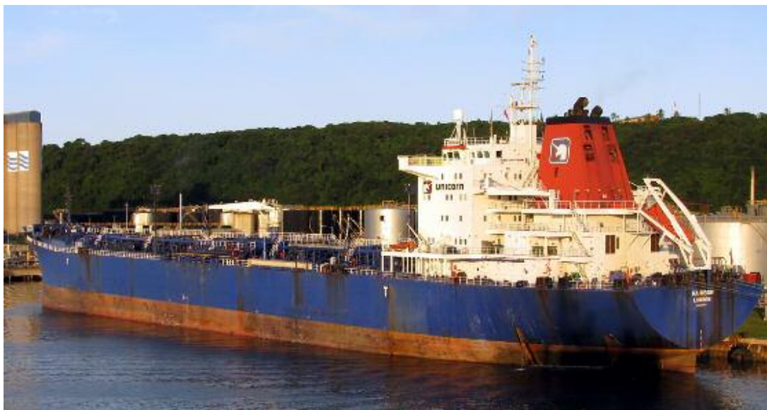
The M/T Rainbow , seen alongside in Durban. A regular caller to the port.

Bunker prices are expected to remain high and volatile, and the group will continue its effort to reduce costs by implementing fuel surcharges and entering into forward contracts when appropriate. The group has taken delivery of two container vessels of 1,100 TEU each this year, and will receive six more ships with an aggregate capacity of 9,000 TEU by 2009. These vessels, both owned and under long-term charter, will enable the group to introduce more services while better managing capacity and vessel operating costs. Samudera offers container shipping services to the Middle East, Indian subcontinent, South and West Africa, southeast Asia, Indochina and the Far East. Source: Schednet