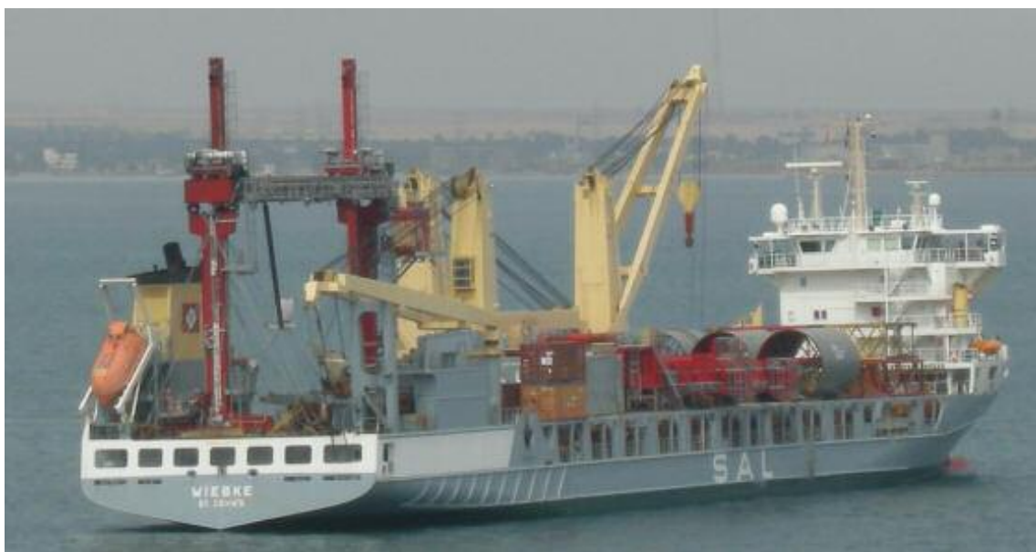
SAL's WIEBKE seen in the Suez canal