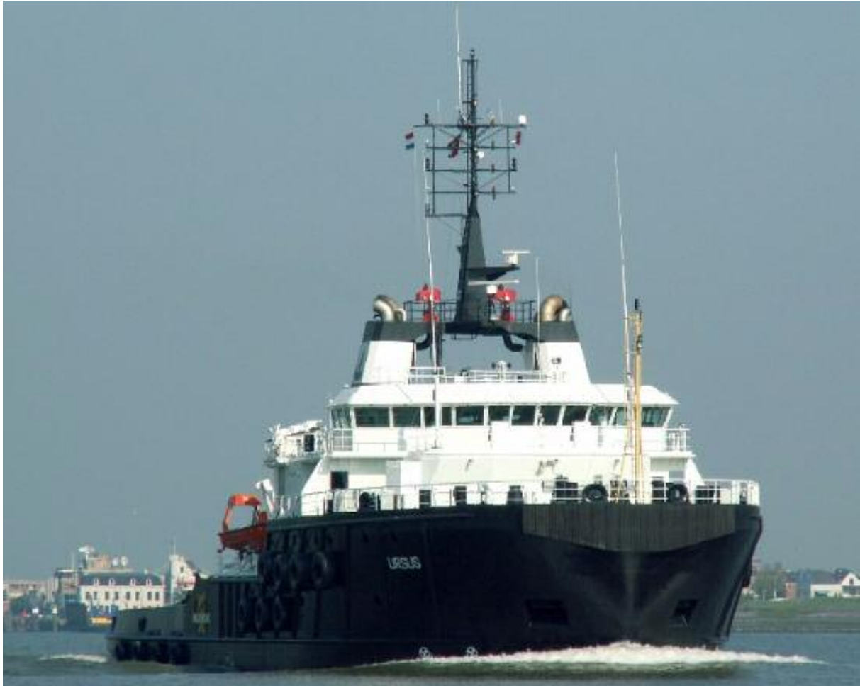
Harm's latest fleet addition, the URSUS arrived in Rotterdam-Waalhaven

Essar Shipping Ltd (ESL), which is going through an elaborate reorganisation programme to become an integrated shipping and logistics company, has lined up a capital expenditure programme of about $800 million to acquire 14 ships between 2008 and 2011. Source: sify.com