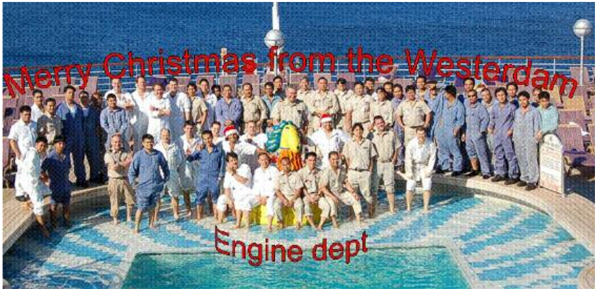
HAL's WESTERDAM engineroom department wishing you a Merry Christmas .