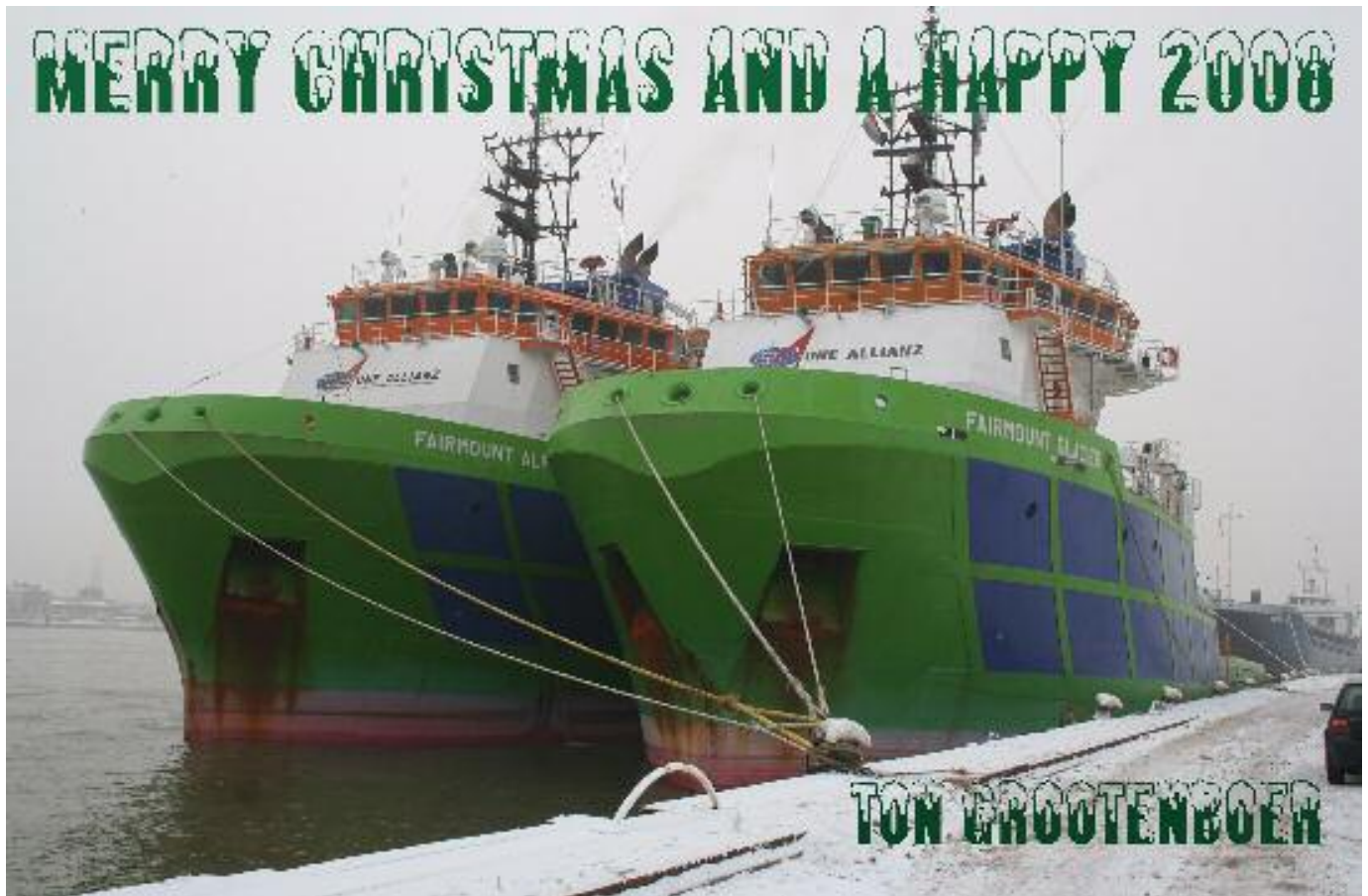
Ton Grootenboer wishes everybody a Merry Christmas and a Happy 2008