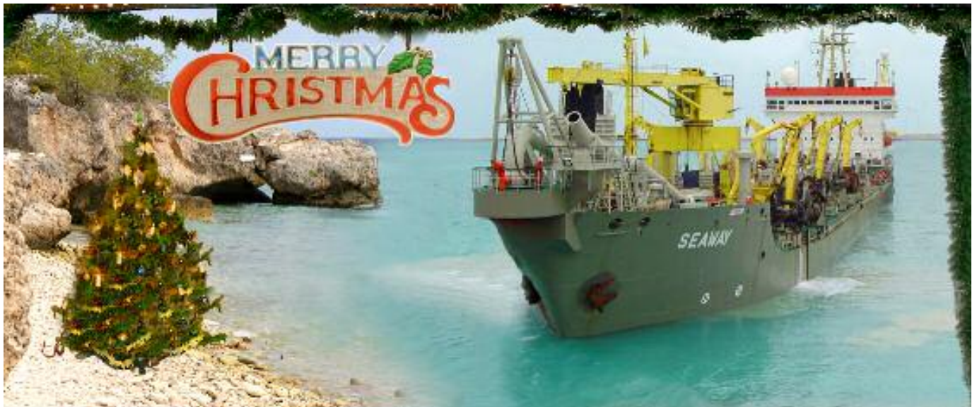
Master and crew of the SEAWAY wishing all readers a Merry Christmas and a happy New Year

MERRY CHRISTMAS AND A HAPPY NEW YEAR FOR ALL READERS ONSHORE AND OFFSHORE