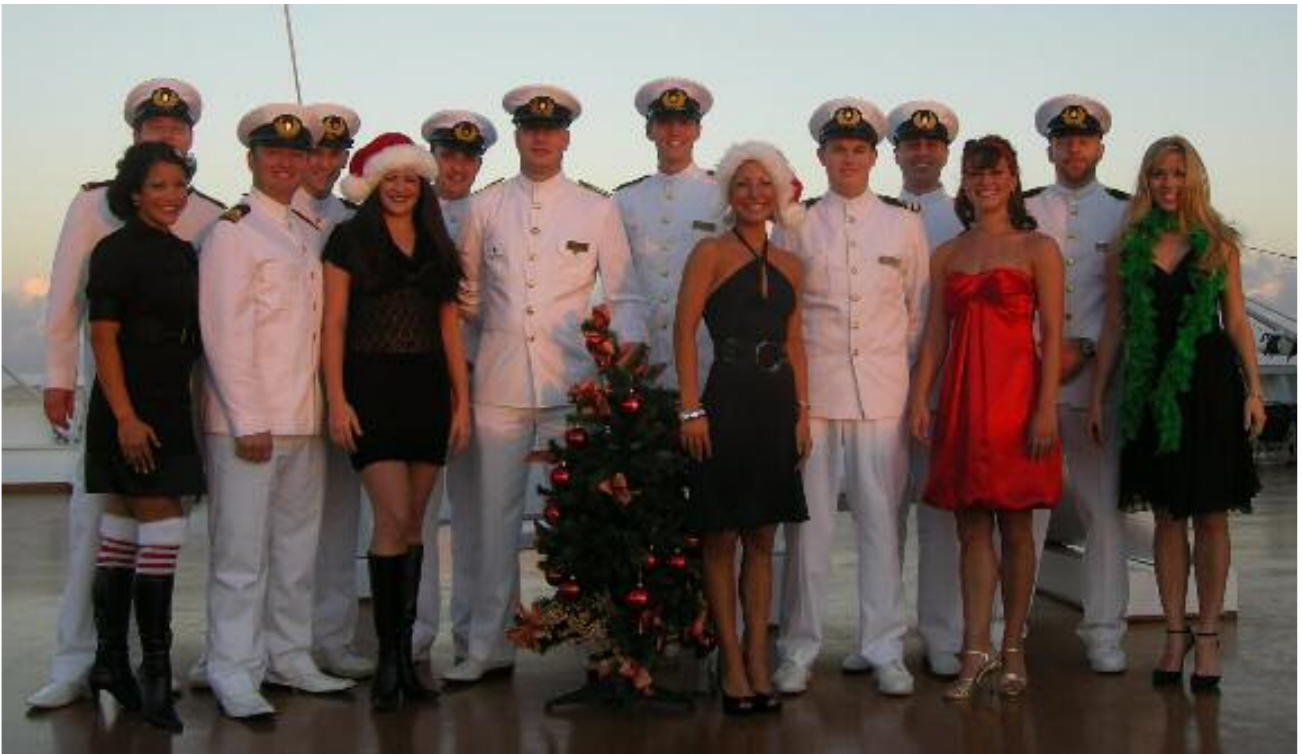
HAL's Zuiderdam Deck Department wishes you Happy Holidays and best wishes for 2008