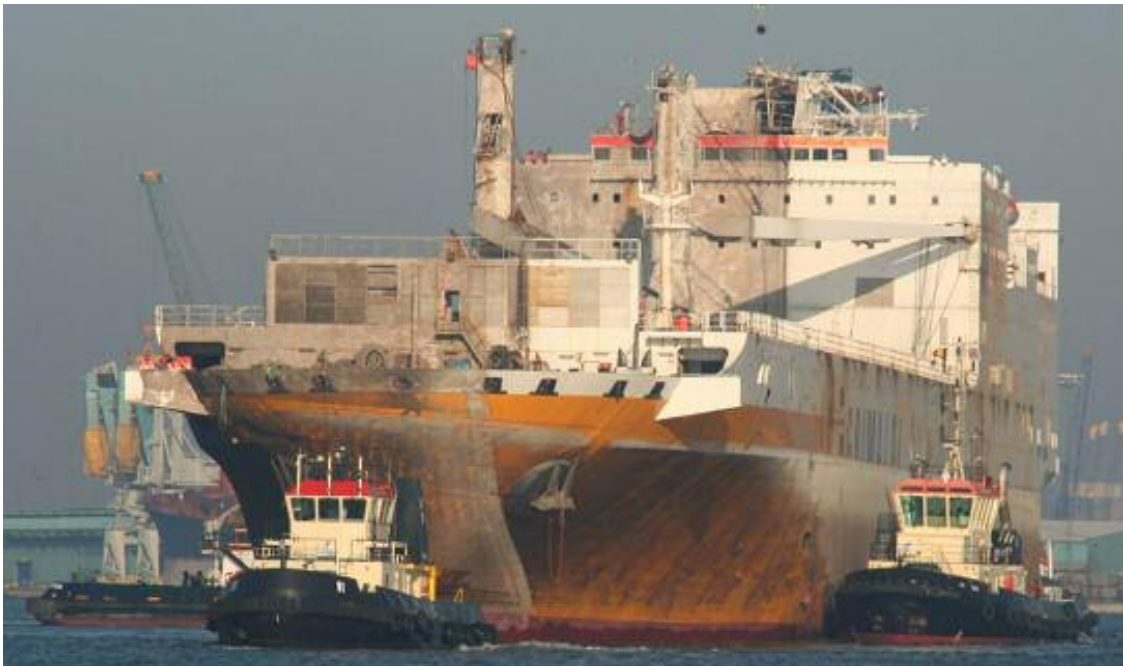
Beste wensen van de Technische Afdeling van het Sleepbedrijf van het Gemeentelijk Havenbedrijf Antwerpen