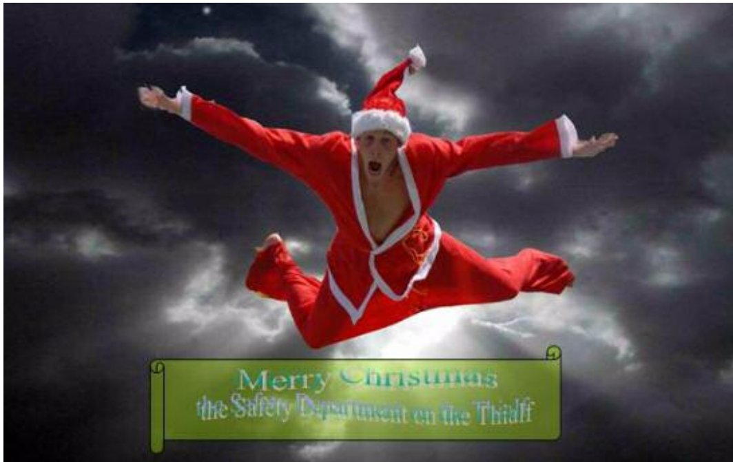
The safety department of the THIALF wishing you a Merry Christmas