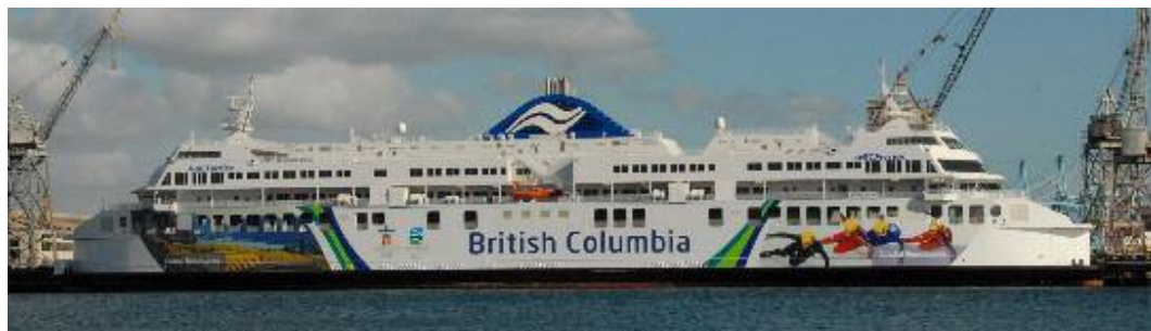
The BC Ferries Coastal Renaissance seen Saturday, 8 December 2007.

The company website showed the ferry stopped in Los Angeles, apparently back on track on its 45-day journey from the Flensburger Schiffbau-Gesellschaft shipyard in Germany.