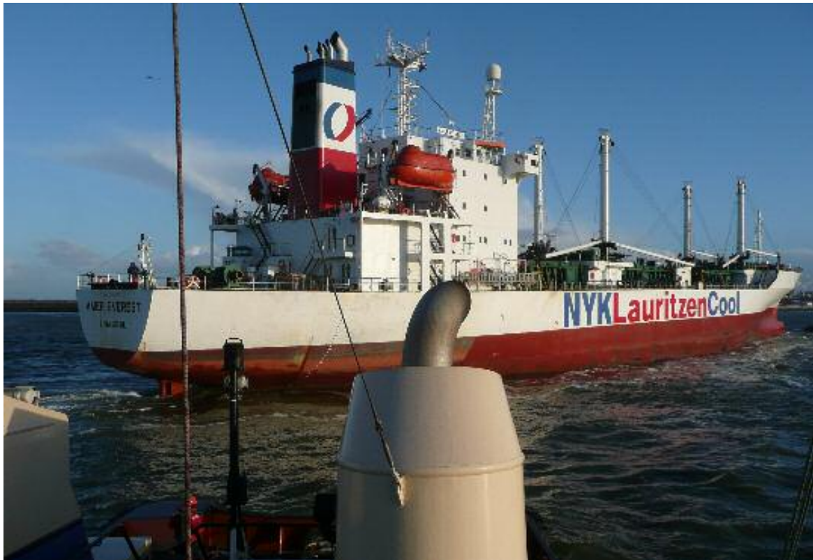
The AMER EVEREST seen assisted by the tug ARION into the Ijmuiden locks

The compiler of the news clippings disclaim all liability for any loss, damage or expense however caused, arising from the sending, receipt, or use of this e-mail communication and on any reliance placed upon the information provided through this free service and does not guarantee the completeness or accuracy of the information. If you want to no longer receive this bulletin kindly reply with the word "unsubscribe" in the subject line.