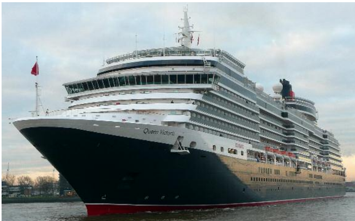
The QUEEN VICTORIA seen arriving in the Port of Rotterdam during her maiden voyage