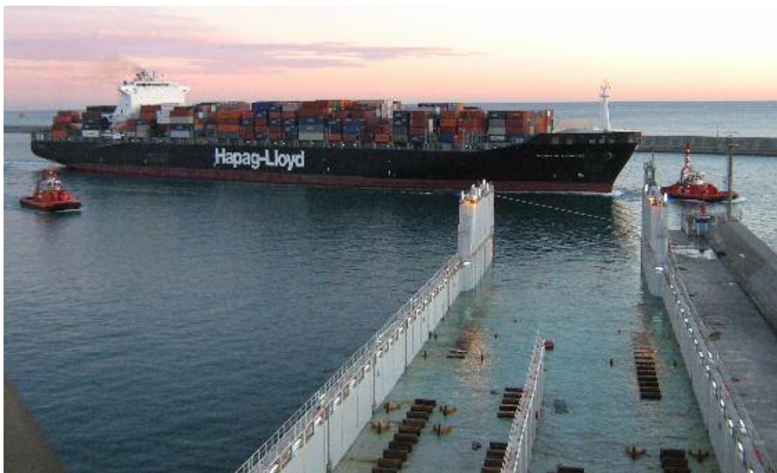
The HAPAG-LLOYD container liner BANGKOK EXPRESS seen passing the submerging YACHT EXPRESS in the port of Genoa where Dockwise latest will load her first yachts for transportation to the USA