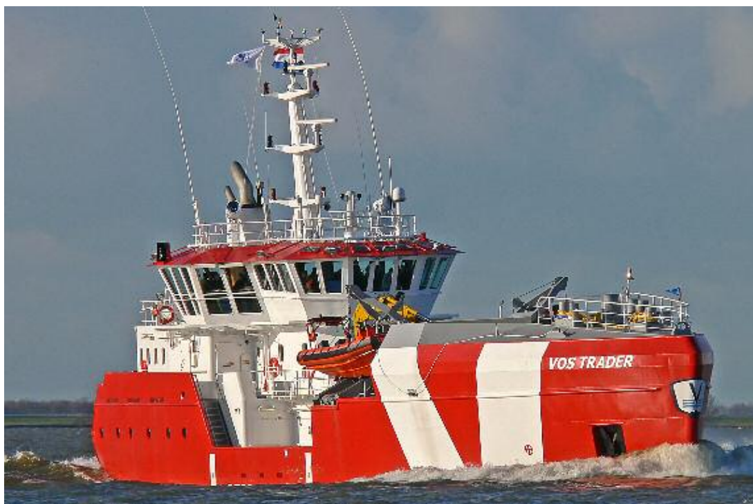
The VOS TRADER commenced yard trials