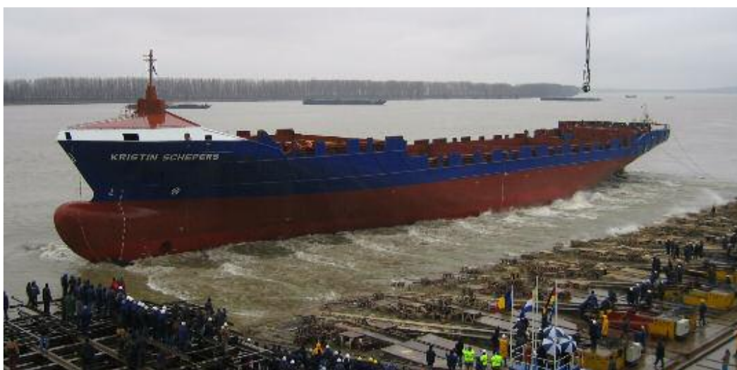
The KRISTIN SCHEPERS was launched at the Damen-Galati yard December 12th

The six remaining Rigdon 4000-class PSVs will be delivered in approximate 45-day intervals through 3Q 2008.