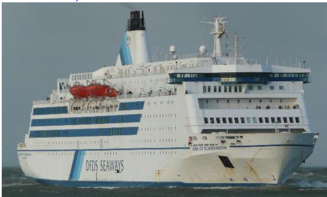
The KING OF SCANDINAVIA seen approaching IJmuiden Port