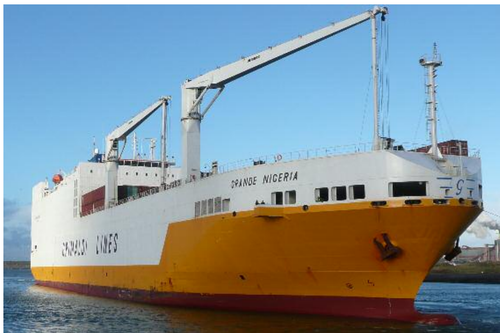
The GRANDE NIGERIA seen approaching the IJmuiden locks