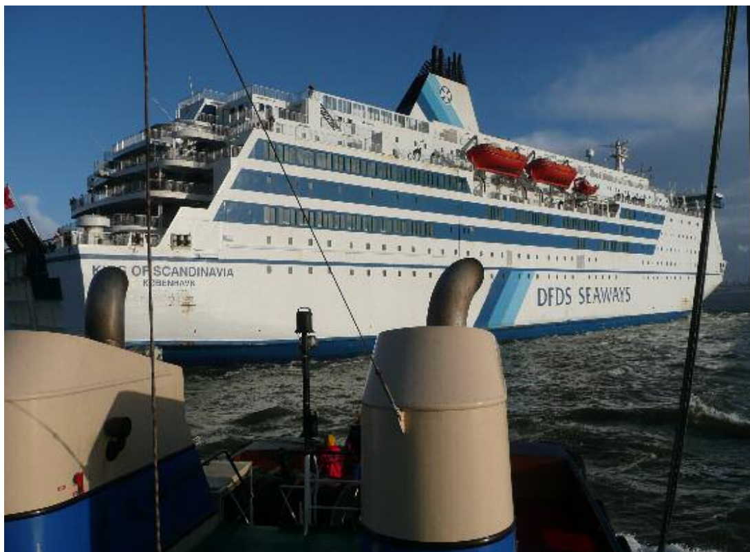
The KING OF SCANDINAVIA seen assisted by the tugs ARION and SVITZER MARKEN into the port of IJmuiden