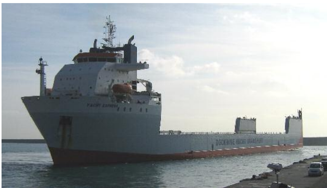
Dockwise Yacht Transport's YACHT EXPRESS seen arriving in Genoa