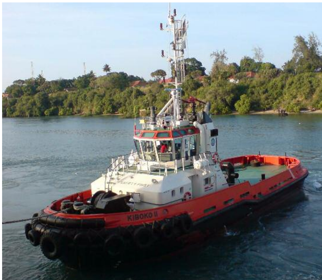
The KIBOKO II seen assisting the JO SYPRESS in the port of Mombassa (Kenya)