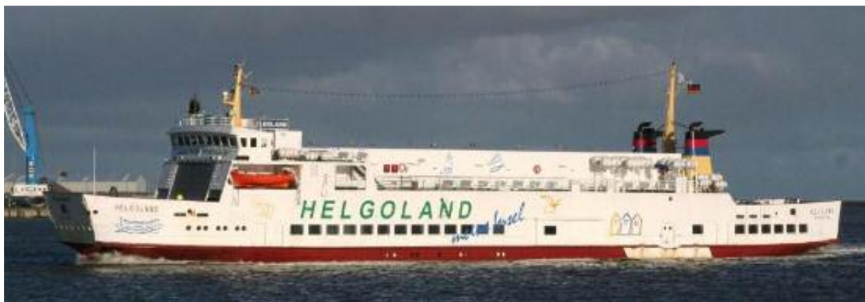
The HELGOLAND serves the route Eemshaven <> Borkum