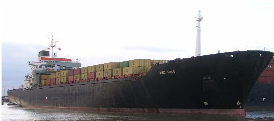
The MSC TOGO seen in Liverpool, the container liner was formerly named Nedlloyd Zeelandia , and later P&O Nedlloyd Los Angeles .