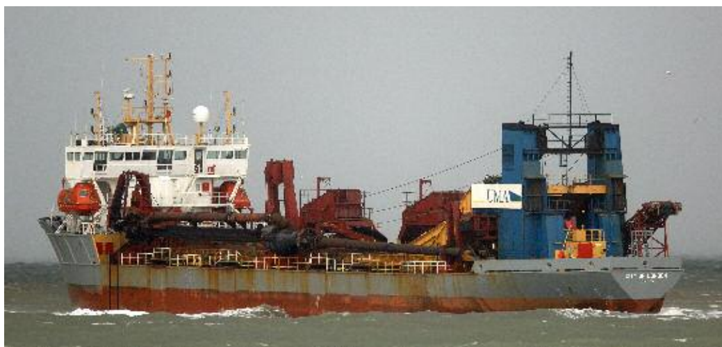
The CITY OF LONDON seen departing from Rotterdam-Europoort