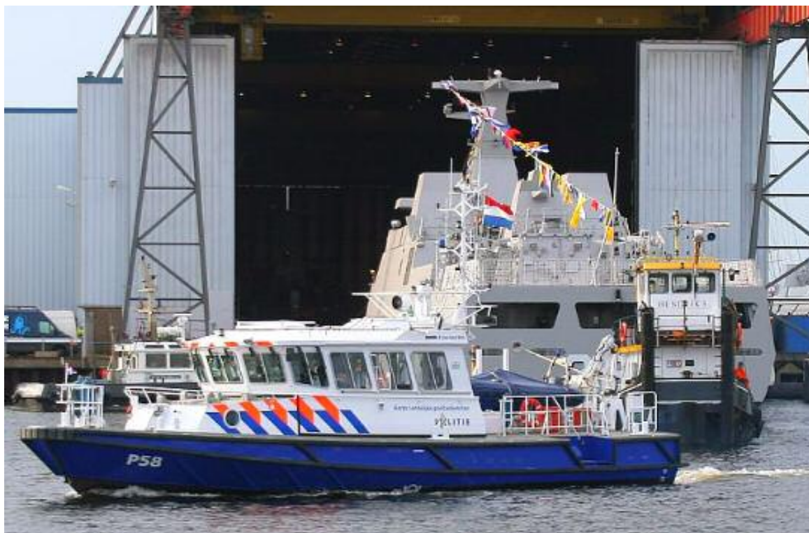
At the Schelde Shipyard in Flushing the Indonesian Frigate 367 SULTAN ISKANDAR MUDA was towed out of the building dock for out-fitting along the quay