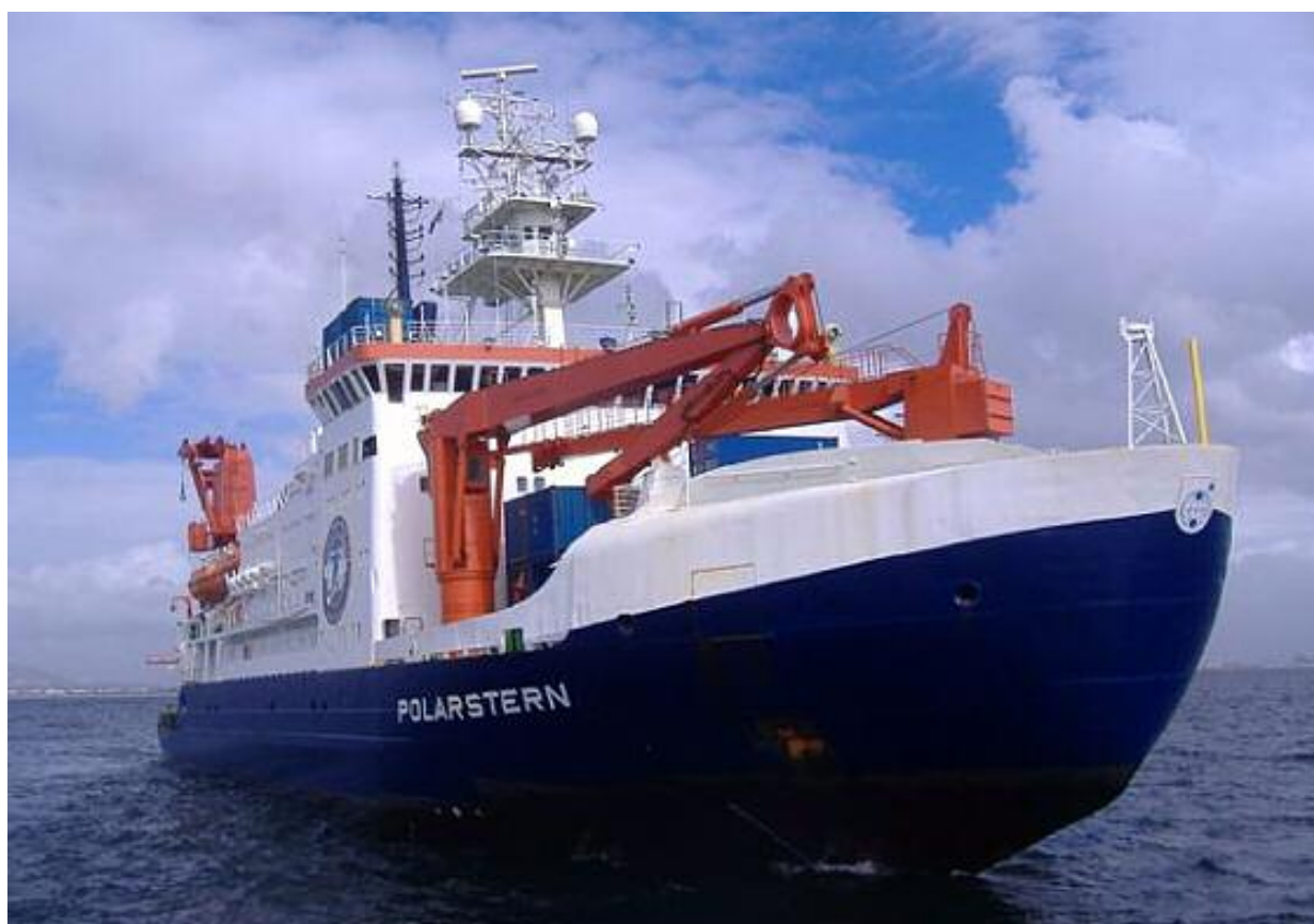
The German Icebreaker POLARSTERN seen off Cape Town

The maritime security is improved to fight against drug trafficking, human trafficking, terrorism acts, cross-border crimes, pirates, oil leaking and ship accidents and to protect sea transportation, he said. Source : Xinhua