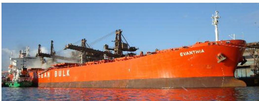
The EVANTHIA seen in Santos (Brazil)