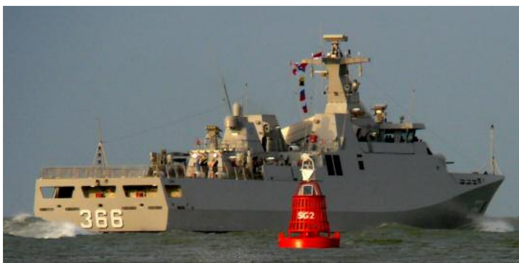
The Indonesian frigate 366 HASANUDDIN seen at the Westerscheldt River passing Flushing

He said this potent platform equipped with an advanced weapon system would strengthen the PN’s defence capabilities. He observed that the security situation in the region remained unpredictable and “we cannot afford to lower our guard.” Source : PPI