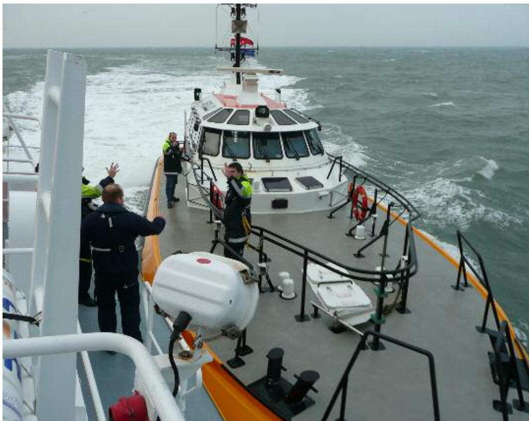
Pilot tender APOLLO seen after delivery of some pilots onboard the SWATH PERSEUS at Maas Pilot station

The vessels are highly versatile and can handle a wide range of cargoes such as offshore structures, drilling rigs, topsides, jackets, FPU's, FPSO's, barges and other floating and non-floating structures. In addition to these two vessels, DNV is responsible for classing another sixty ships, all MR tankers, in the GSI order book. Source : Offshore Shipping online