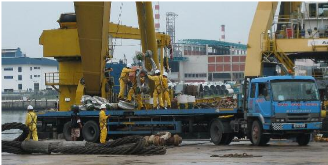
Above seen in Singapore the sheerleg Asian Hercules II loading new top quality Green Pin® Sling shackles