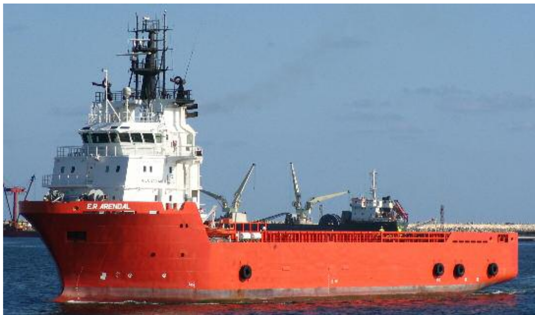
The E.R.ARENDAL (ex. AEOLUS) seen in Abu Qir