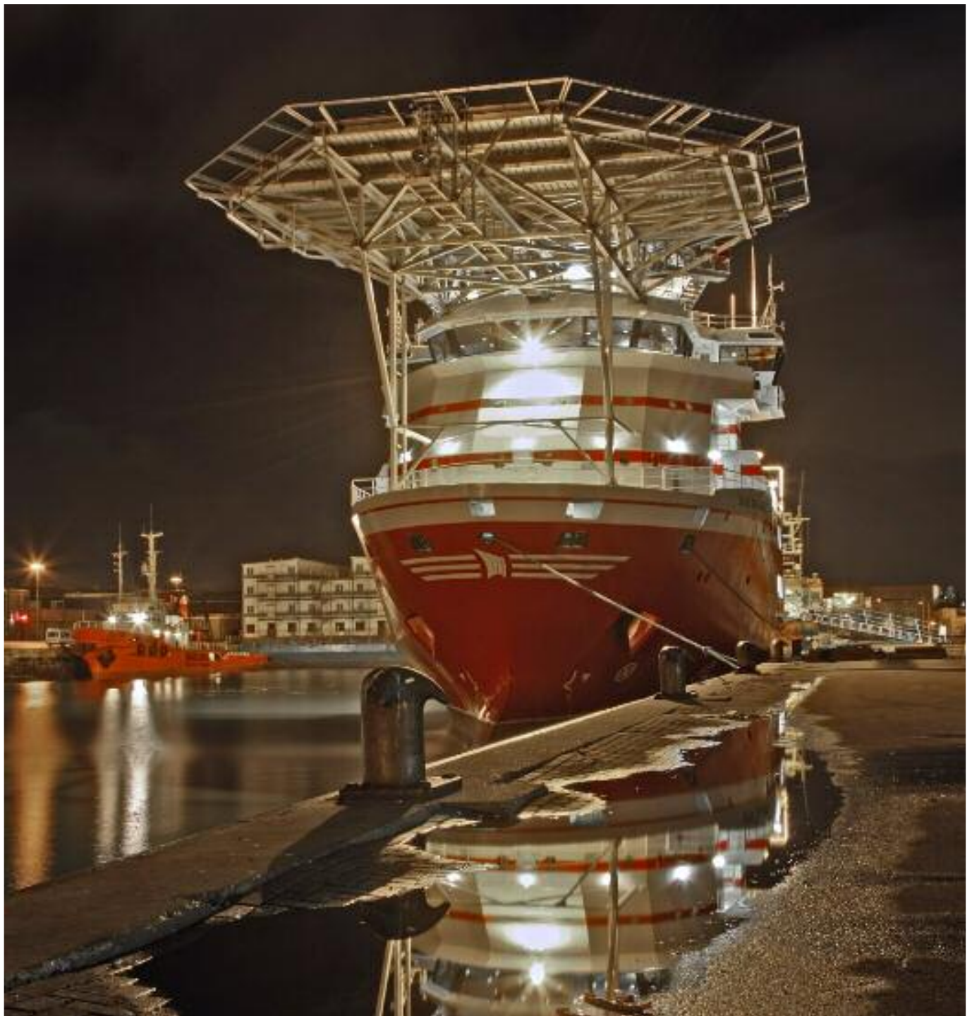
The SIEM MARINER seen moored in IJmuiden