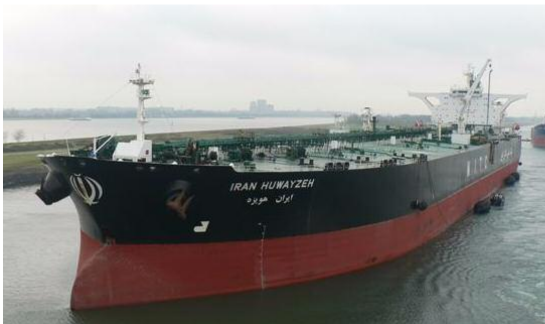
The IRAN NUWAYZEH seen in Rotterdam-Caland Canal

"Port Botany expansion is set to deliver 9,000 jobs to NSW and boost the state's economy by A$16 billion during the next two decades," Mr Iemma told reporters. Source : Dredging online