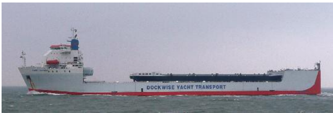
Dockwise YACHT EXPRESS seen at Maaspilot station enroute Rotterdam-Waalhaven

The bulletin says it has been noticed that the number of fines issued nationwide by the CBP has increased. It has also been noticed that the CBP is now issuing fines for infractions which would have previously warranted no more than a warning. Source : MarineLog