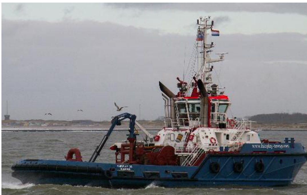
The FAIRPLAY 28 seen in Rotterdam-Europoort