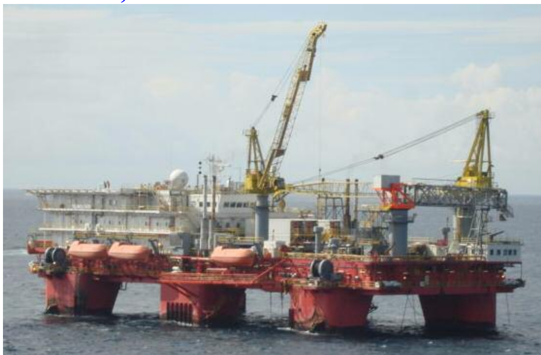
The SAFE CONCORDIA seen in the Gulf of Campeche