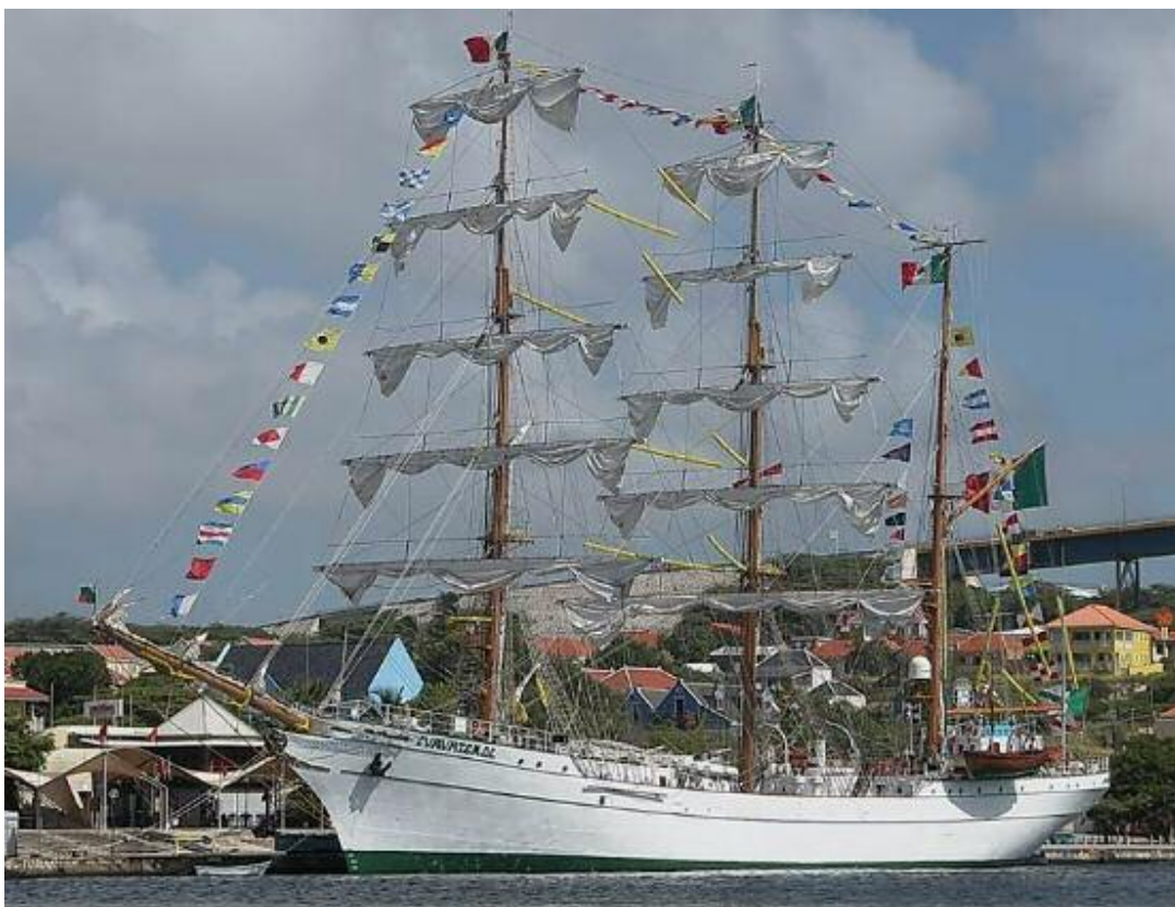
The 1981 built Mexican Navy sail trainer BE-01 Cuauhtémoc seen moored in Willemstad (Curacao)