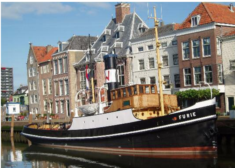
The steam powered tug FURIE seen moored in her homeport Maassluis