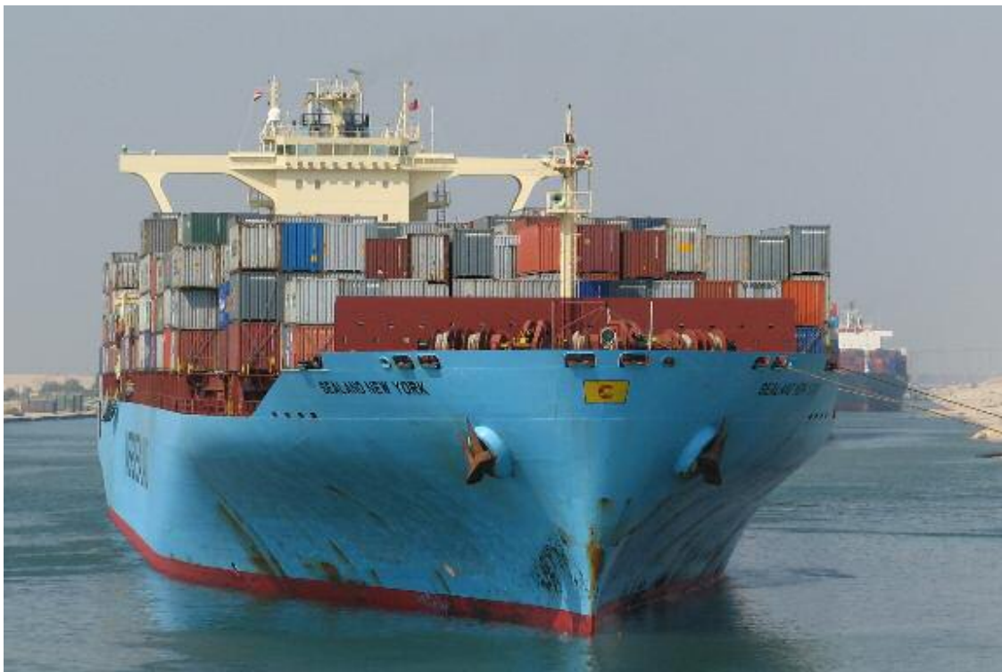
The SEALAND NEW YORK seen tied up in the Ballah by-pass (Suez Canal)