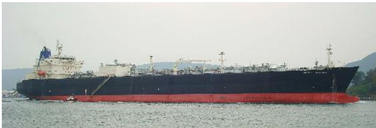
The Berge Nantong seen leaving Santos after here maiden call.

"[The] port was the nearest to the stranded seamen. ... It took the rescue boat two days to reach the spot. The tug-master requested the rescue team to tow them to safety," said Singh.