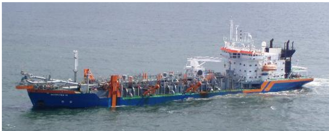
The GEOPOTES 15 seen off Den Helder