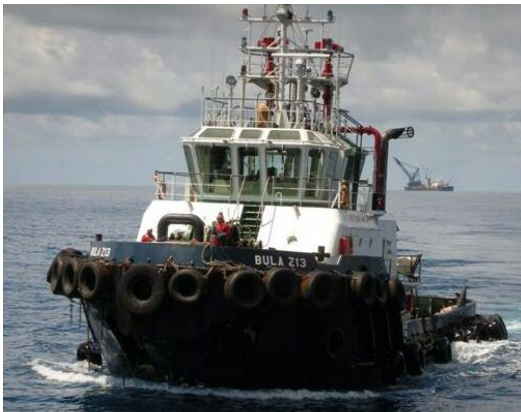
The Indonesian tug BULA Z13