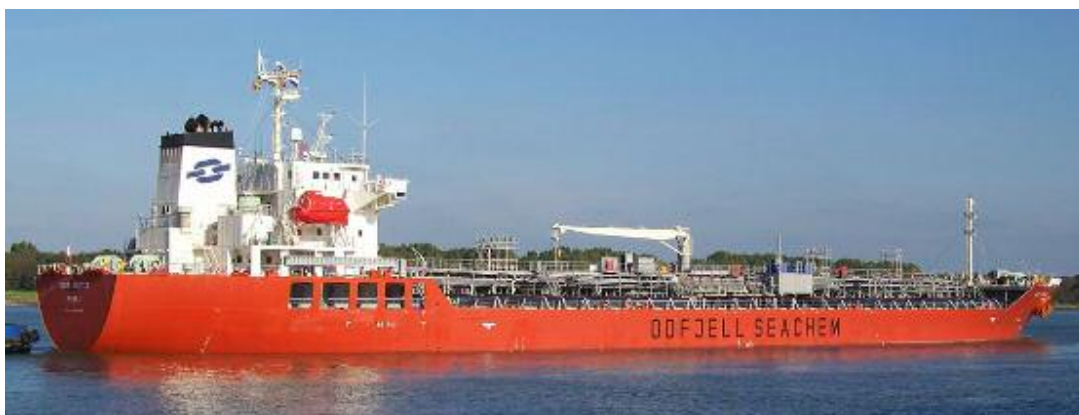
The BOW OLIVIA seen enroute Rotterdam-Botlek