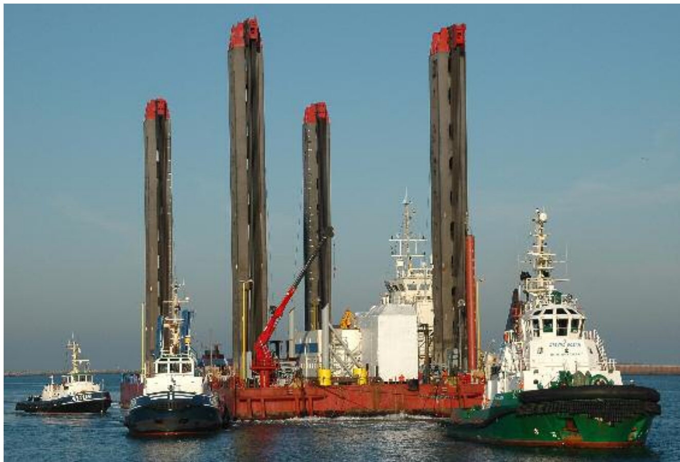
The STEVNS OCEAN , assisted by Iskes tugs ARION and ARGUS seen arriving in IJmuiden