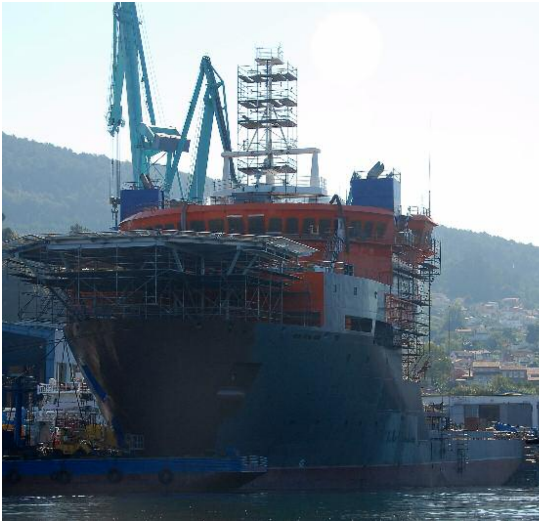
The BOURBON OCEANTEAM 101 seen under construction