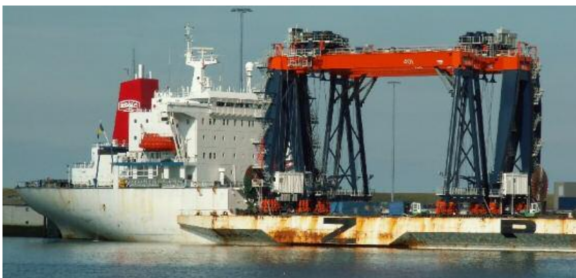
The ZHEN HUA 17 seen in the Yangtzeharbour in Rotterdam-Europoort

Net income was 66.7 billion won (US$73 million) in September, a turnaround from a net loss of 51.1 billion won a year earlier, the company said in a regulatory filing. Source : Yonhap News