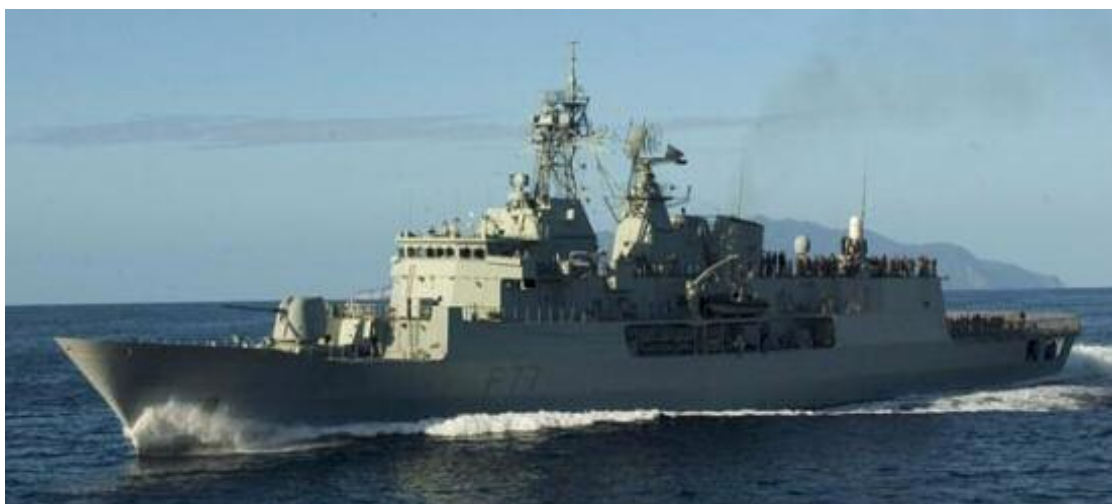
The New Zealand Frigate TE KAHA