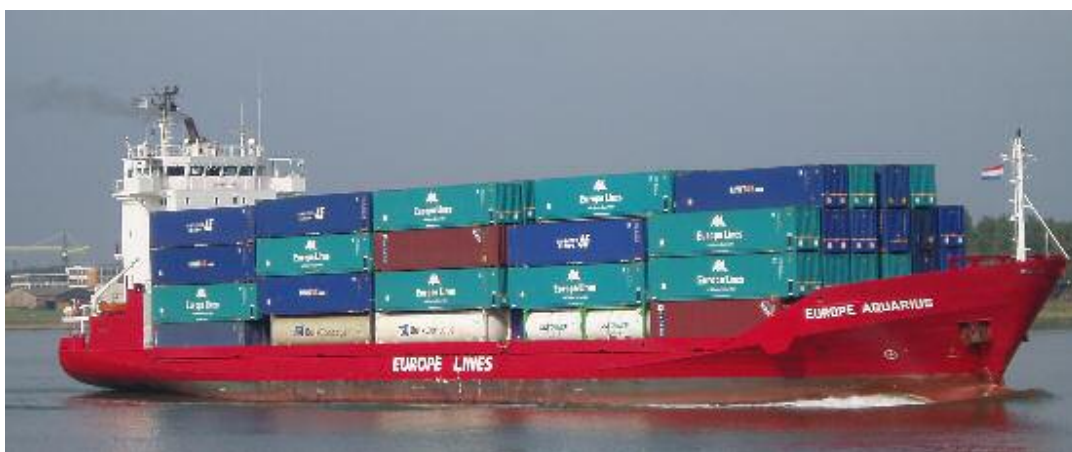
The EUROPE AQUARIUS seen enroute Rotterdam