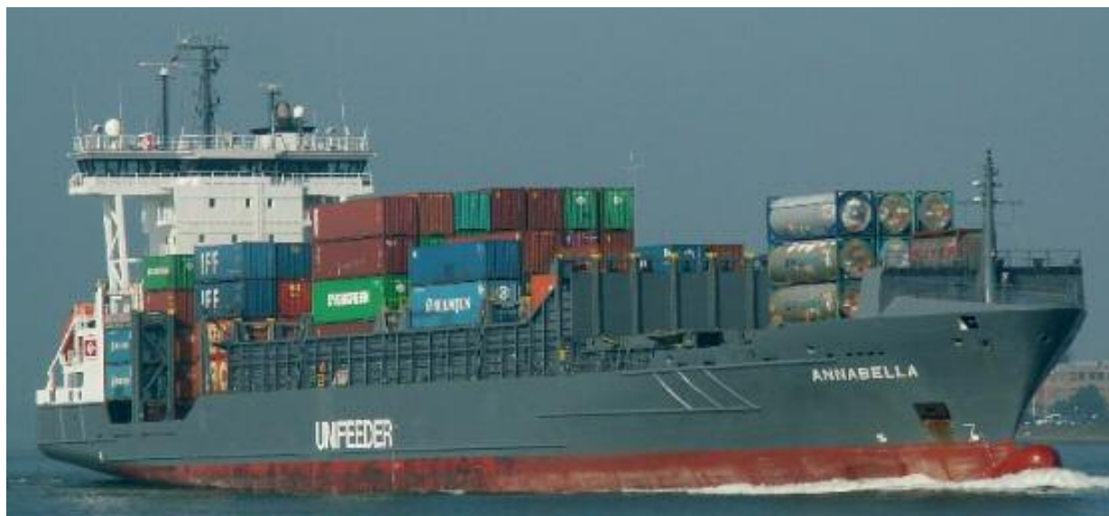
The ANNABELLA seen enroute Rotterdam