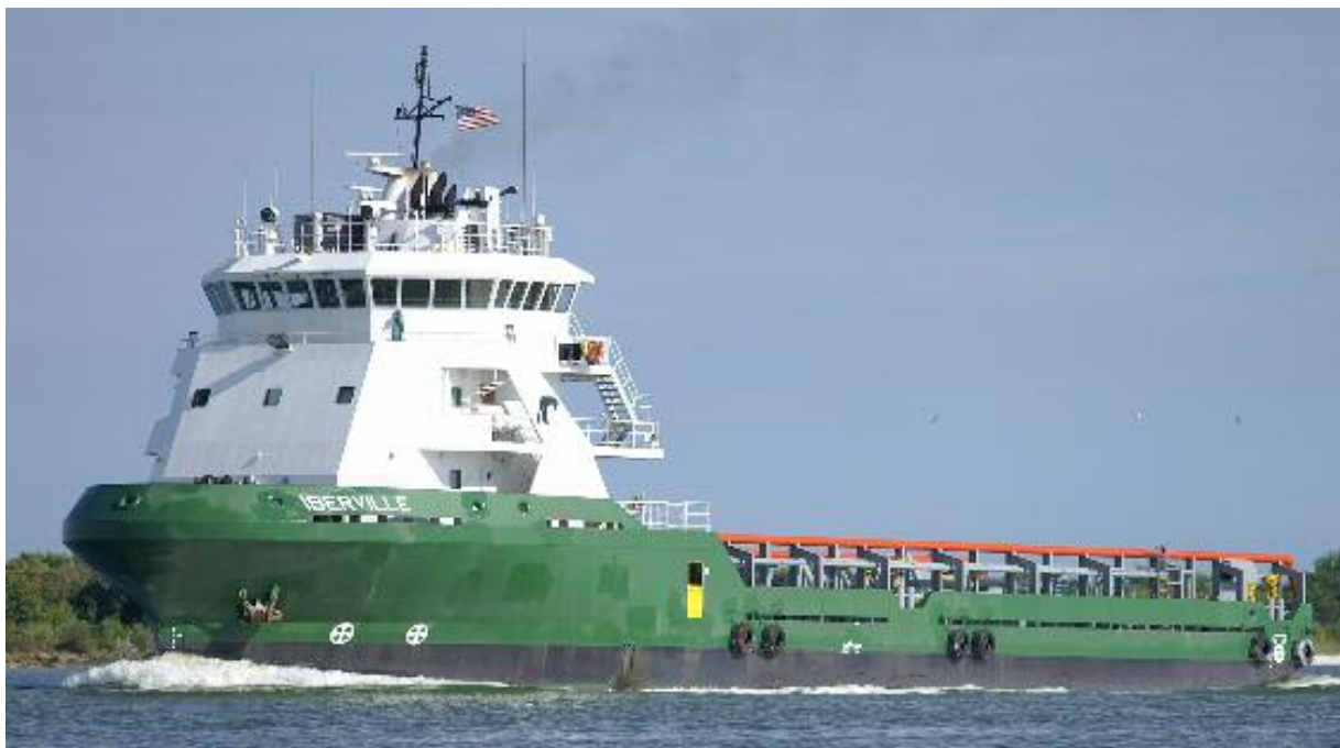
The IBERVILLE seen in Houston waters – Photo : Chris Rombouts ©

It should be pointed out that on August 15 the yard won the tender to build 2 drilling rig for Gasprom. The contract will have closed by October, 15. The sum of the contract totales 60 bn rubles. Source : SeaNews