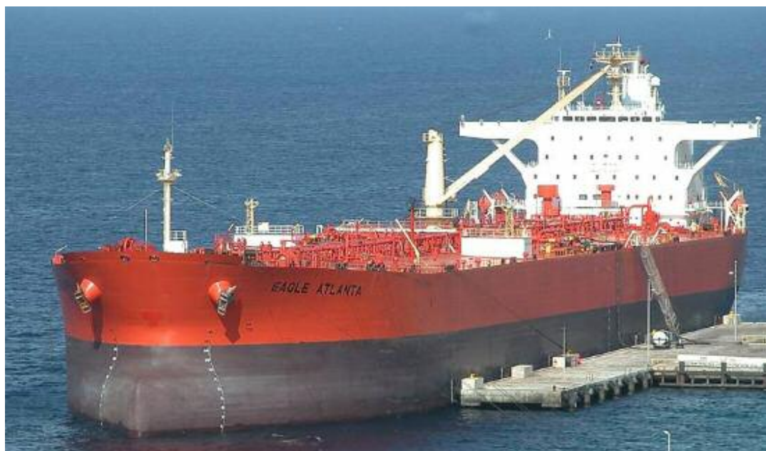
The EAGLE ATLANTA seen moored in Curacao