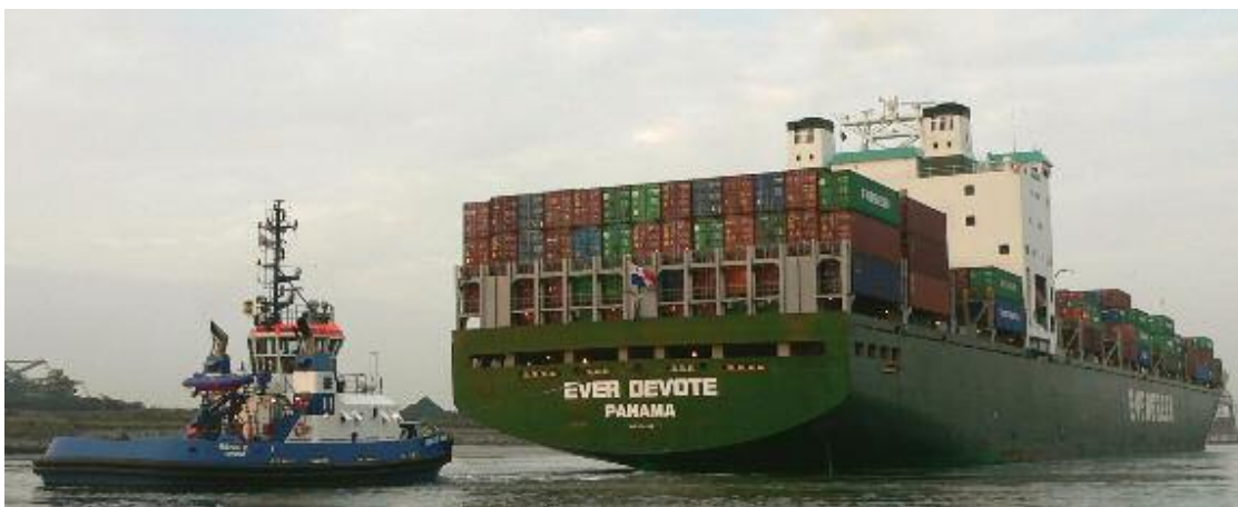
The FAIPLAY III seen assisting the EVER DEVOTE in Rotterdam-Europoort