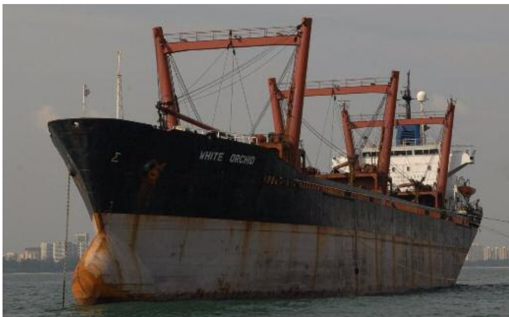
The WHITE ORCHID seen at Singapore roads