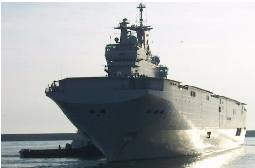
The French " Mistral " leaving Le Havre Port Sunday 07/10/07