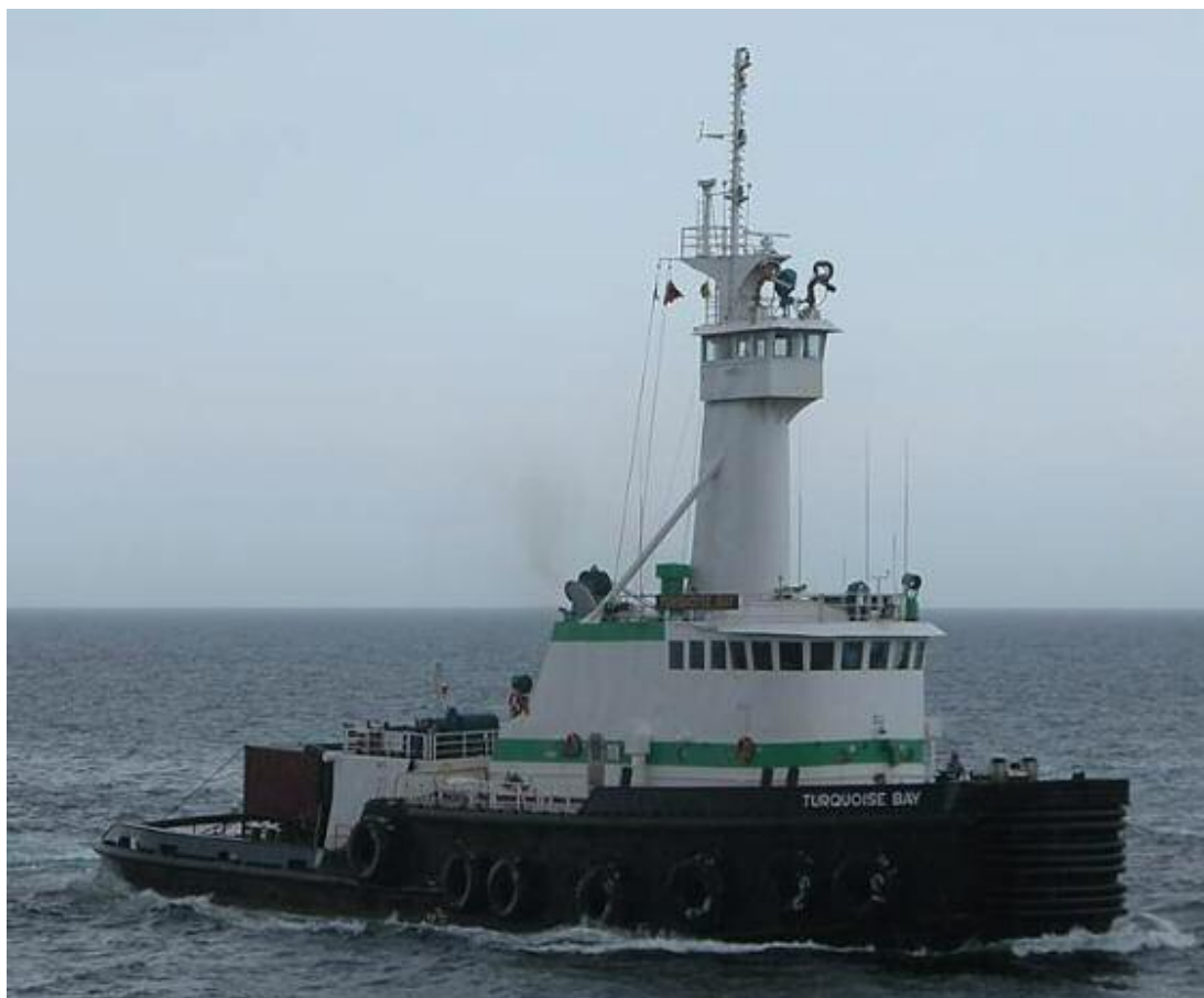
The tug TURQUOISE BAY seen arriving in Willemstad (Curacao)