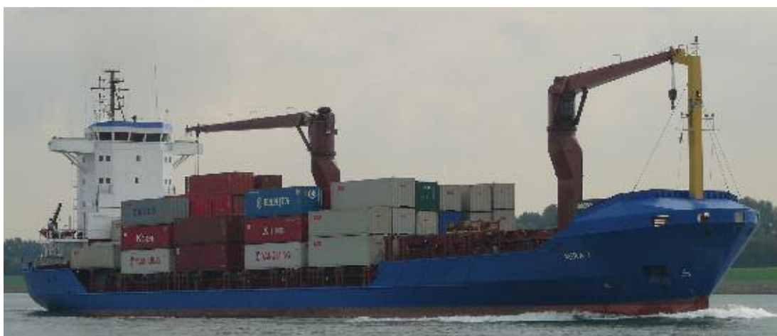
The MIRA J seen enroute Rotterdam

Het Korps Landelijke Politiediensten (KLPD) stelt een onderzoek in naar de toedracht van de aanvaring. Source : Vaart