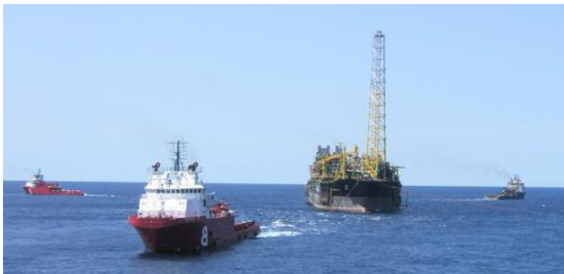
The installation of the Petrobras FPSO Cidade de Vitoria op het Golfinho2 Field

Telephone : (31) 10 - 453 03 77 Fax : (31) 10 - 453 05 24 E-mail : mail@workships.nl Website : www.workships.nl