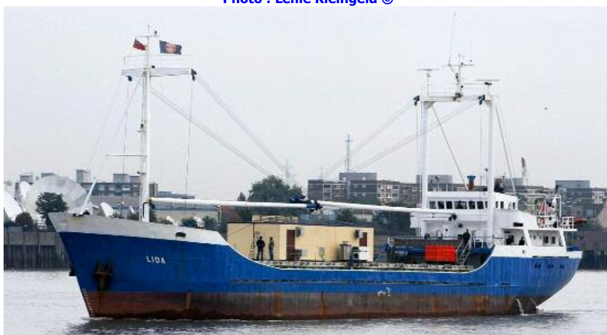
The Pub Boat LIDA 992/1974 IMO 7392907 passing Woolwich London on Oct 8th 2007 after her epic voyage from New Zealand which started on July 23rd 2007.