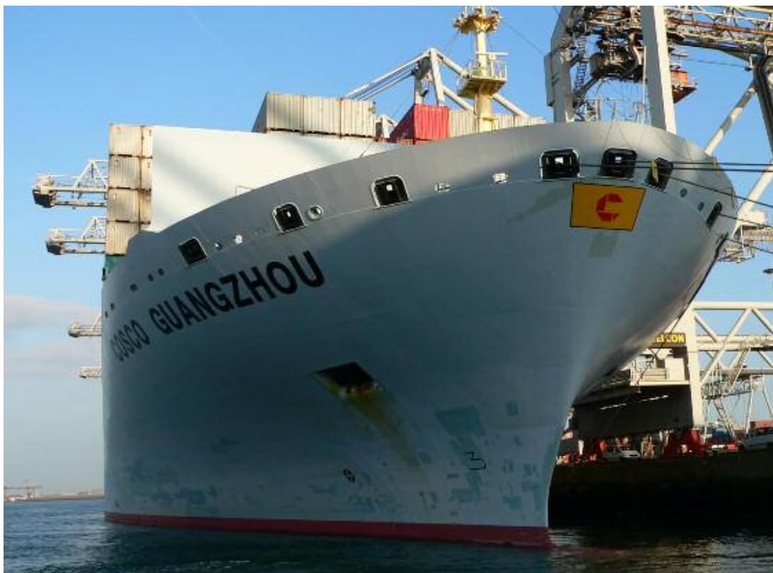
Costamare's COSCO GUANGZHOU seen in Rotterdam – Europoort.