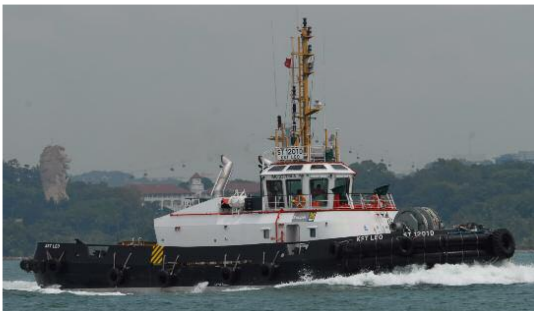
The KST LEO seen off Sentosa Island (Singapore)