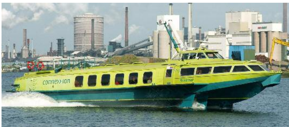
File foto van de ROSANNA

De draagvleugelboot was met 33 passagiers onderweg van Velsen naar Amsterdam. Drie van de gewonden aan boord van de Rosanna zijn er ernstig aan toe. Vier andere, waaronder de schipper van de marechausseeboot, zijn licht gewond. De hulpdiensten hebben alle opvarenden van boord gehaald. Degenen die niet naar het ziekenhuis hoefden, worden opgevangen in de kantine van een bedrijf in een van de havens langs het Noordzeekanaal. De draagvleugelboot, die aan de achterzijde ernstige schade heeft en water maakt, is door een boot van de havendienst naar de kant gesleept. De boot van de marechaussee heeft flinke schade aan de boeg. Beide schepen liggen afgemeerd aan de Siciliëweg.