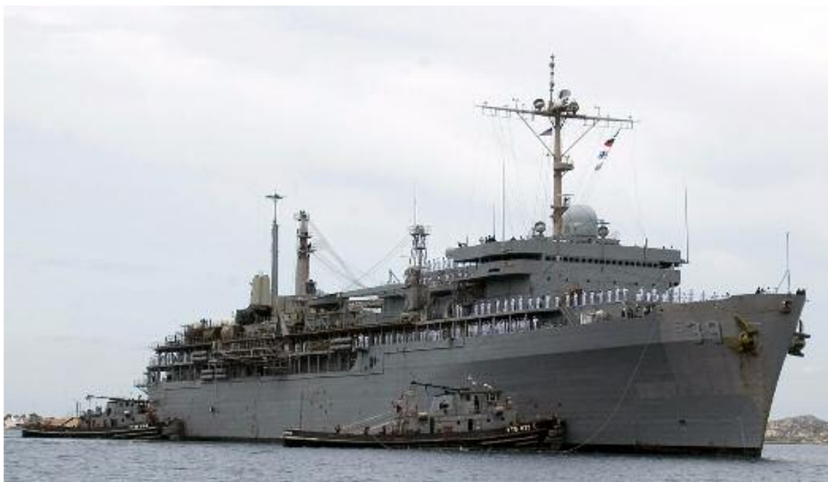
Submarine tender USS Emory S. Land (AS 39) is assisted by tugs as she departs her homeport in Italy for the final time. Emory S. Land left after eight years of providing mobile fleet support to submarines and surface ships in the 6th Fleet area of responsibility