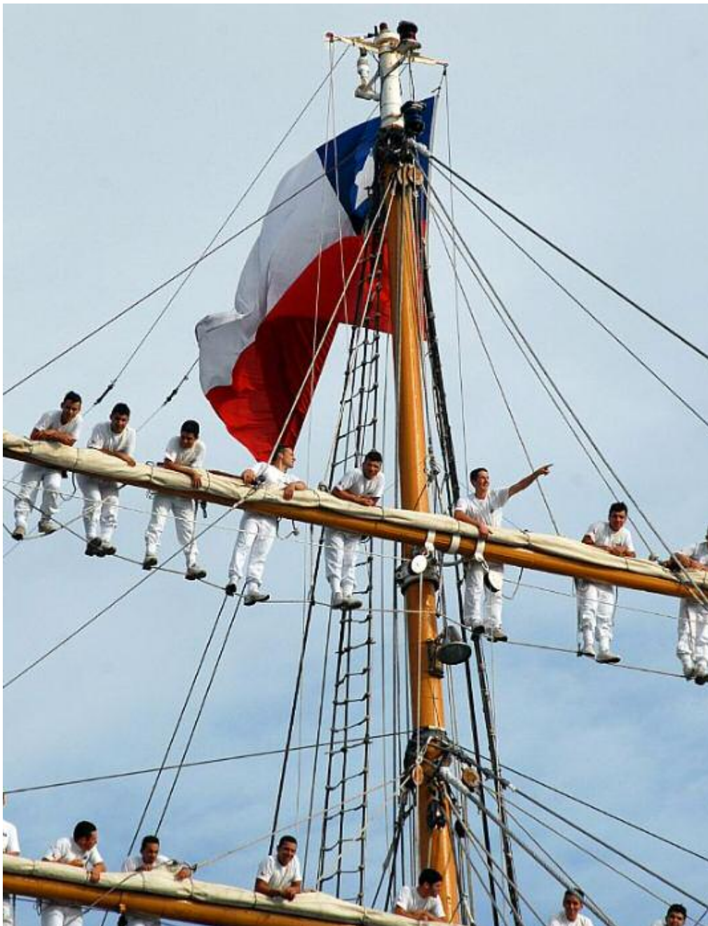
Chilean tall ship Esmeralda (BE 43) makes her way pierside to Naval Station Pearl Harbor. Esmeralda acts as both a training ship for the Chilean navy and as a floating embassy for Chile, visiting more than 300 ports worldwide since its commissioning on May 12, 1953.

Libertad has spots on two; sixth place for largest tall ships, at 356-feet in length, and second-place for most-heavily armed, with four 47 mm cannons, older than the ship itself.