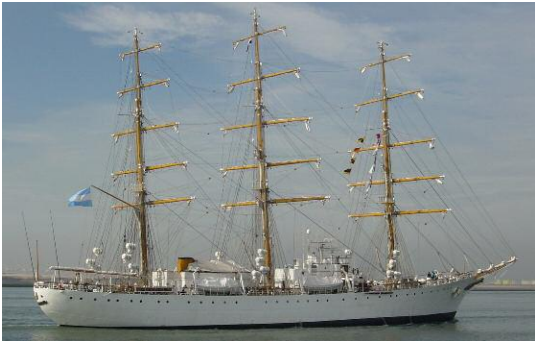
The LIBERTAD

The ship, in the midst of its 38th training cruise and under command of Capt. Pablo Vignolles, docked at 9:15 a.m. at Otter Beth, next to Waterside.