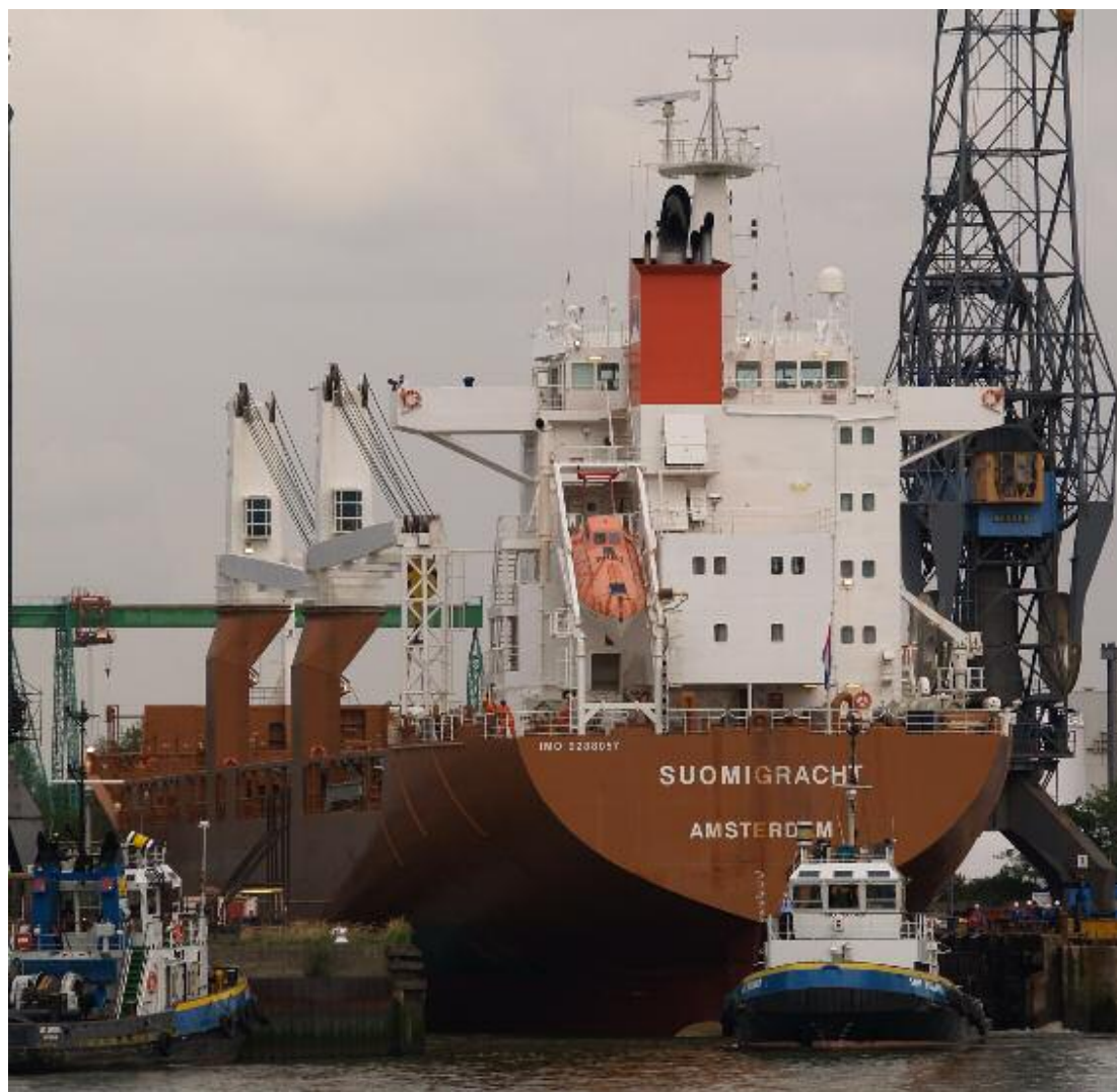
Spliethof's SUOMIGRACHT seen leaving the dry-dock at Damen Shiprepair in Schiedam Photo : Piet Sinke ©

SSG-TALLINN. On October 3, Western Shipyard in Klaipeda laid the keel of its first turnkey ferry, i.e. the ferry will be ready to be put into operation when it leaves the Lithuanian shipyard. The ice-classed, double-ended ferry is being built in accordance with the terms of a deal between the shipyard's parent company BLRT Grupp and the Åland government. It is intended for traffic between Åland and Föglö and delivery is scheduled for the end of next year. The value of the order is EUR 12.5 million. Western Shipyard has built 14 ferries as a sub-contractor for other shipyards, mainly Fiskerstrand Verft in Norway. Source : Scandinavian Shipping Gazette