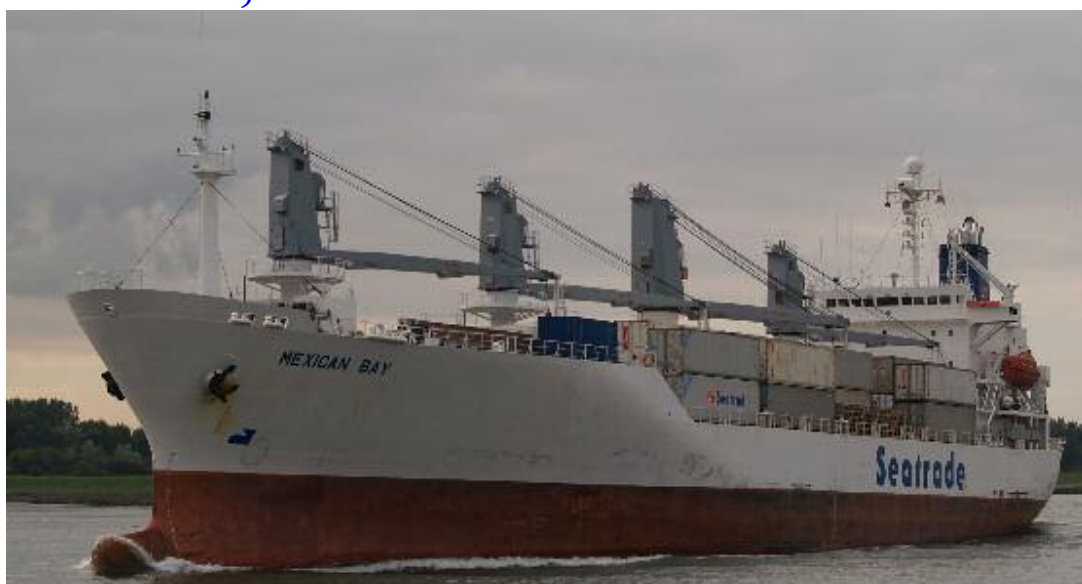
The MEXICAN BAY seen enroute Rotterdam – Photo : Piet Sinke ©