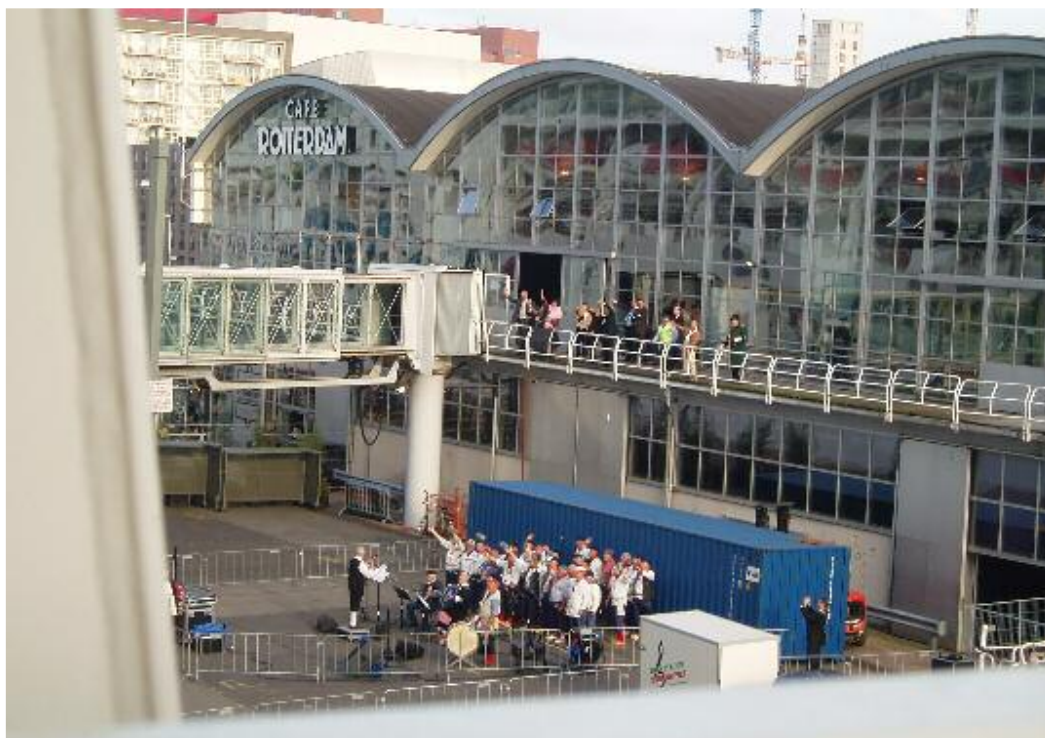
The departure from the Rotterdam cruise terminal seen from the NORWEGIAN GEM for her maiden voyage from Rotterdam to Dover