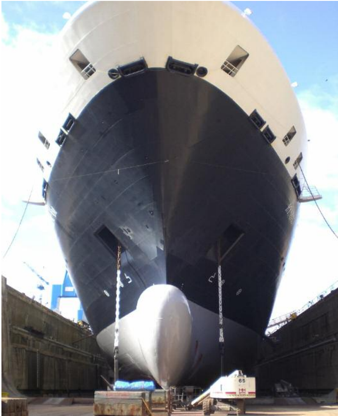
HAL's RIJNDAM completed her drydocking period at the Victoria Drydock and was returned into her element again

able to drydock Virginia-class vessels, and advances in automation will ensure the dockings can take place with fewer people.” With improved stealthiness, surveillance and special warfare enhancements and an emphasis on littoral warfare operations, the Virginia-class (SSN 774) fast attack submarines can excel in a wide range of warfighting missions: including anti-submarine and surface ship warfare; special operations; strike; intelligence, surveillance, and reconnaissance; carrier and expeditionary strike group support; and mine warfare. Source : MarineLink