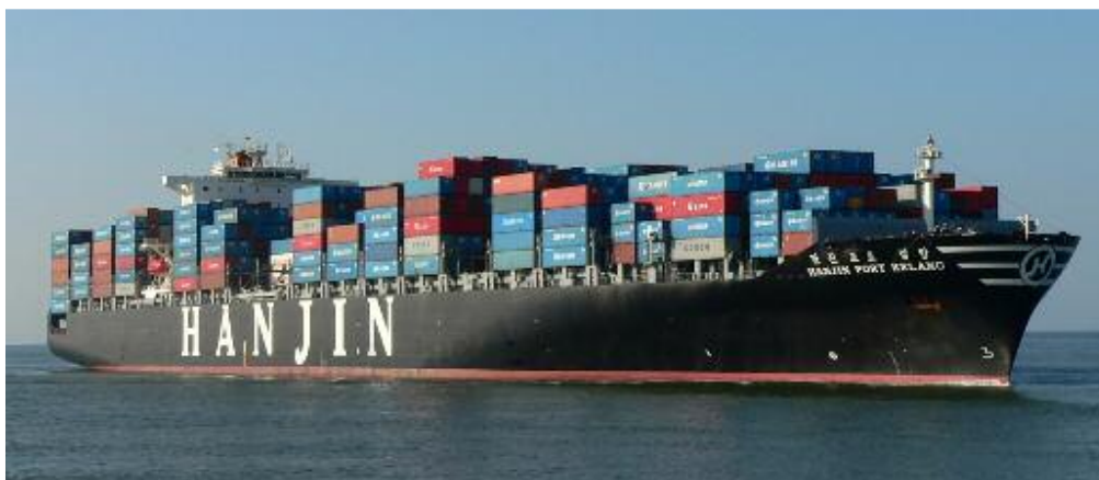
The HANJIN PORT KELANG seen arriving in Rotterdam-Europoort