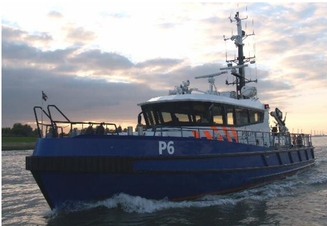
The "zeehaven politie" patrol vessel P-6 seen off Maassluis