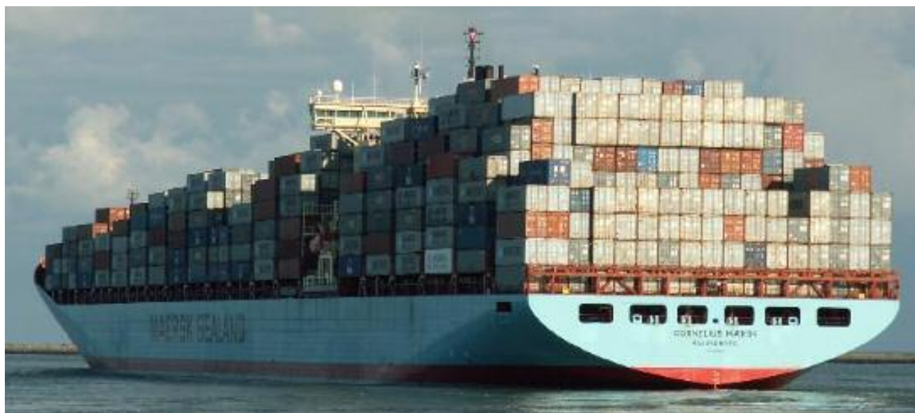
The CORNELIS MAERSK seen departing from Rotterdam-Europoort