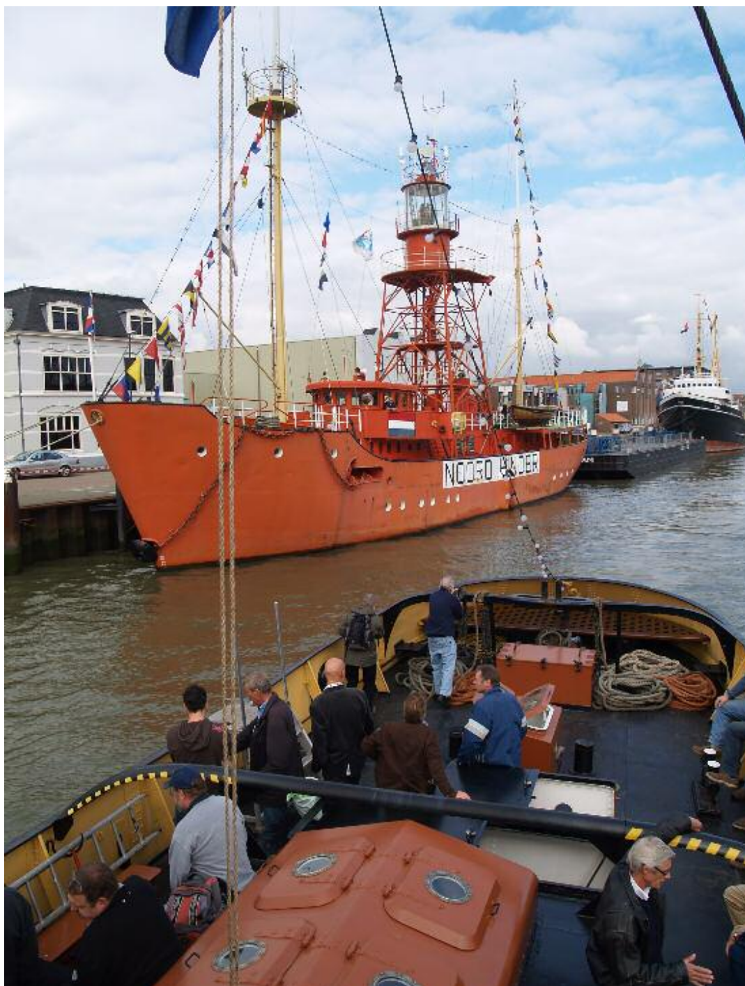
The steam driven tug FURIE is leaving the port of Maassluis with in de background the lightship NOORD HINDER and the tug ELBE

Fulltankers is listed as also having four MR tankers built between 2003 and 2006. It also has two 51,000-dwt tankers on order at SLS Shipbuilding for delivery this year and in 2008. Source : Tradewinds