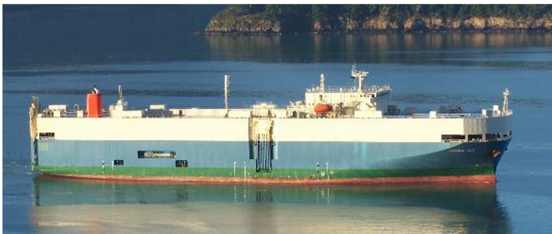
Astral Ace arriving Lyttelton, New Zealand 15.07.07 to discharge second hand vehicles from Japan.