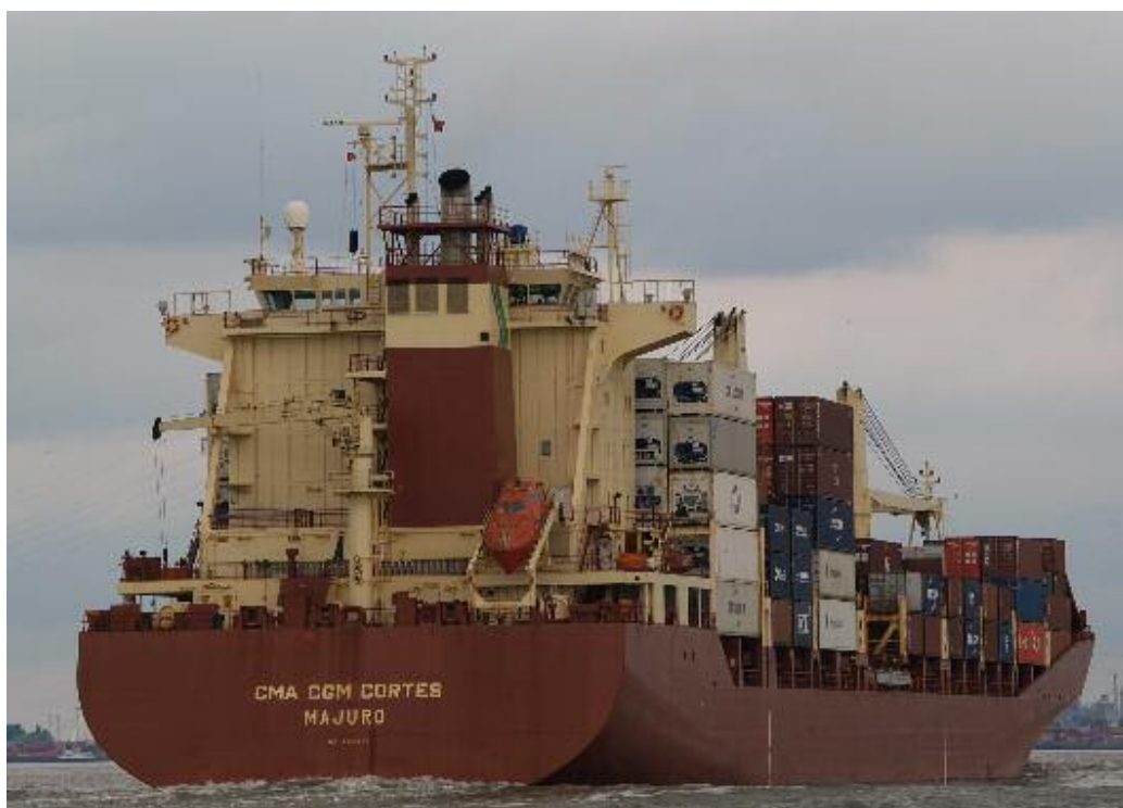
The CMA CGM CORTES seen departing from Antwerp

Container volume at ports in China has tripled since 2001, as US and European consumer buy more low-cost goods made in the country. China's surging