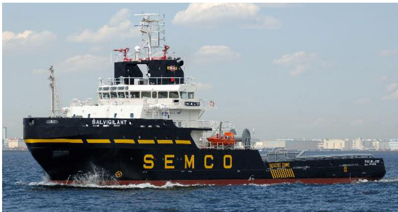
SEMCO's SALVIGILANT