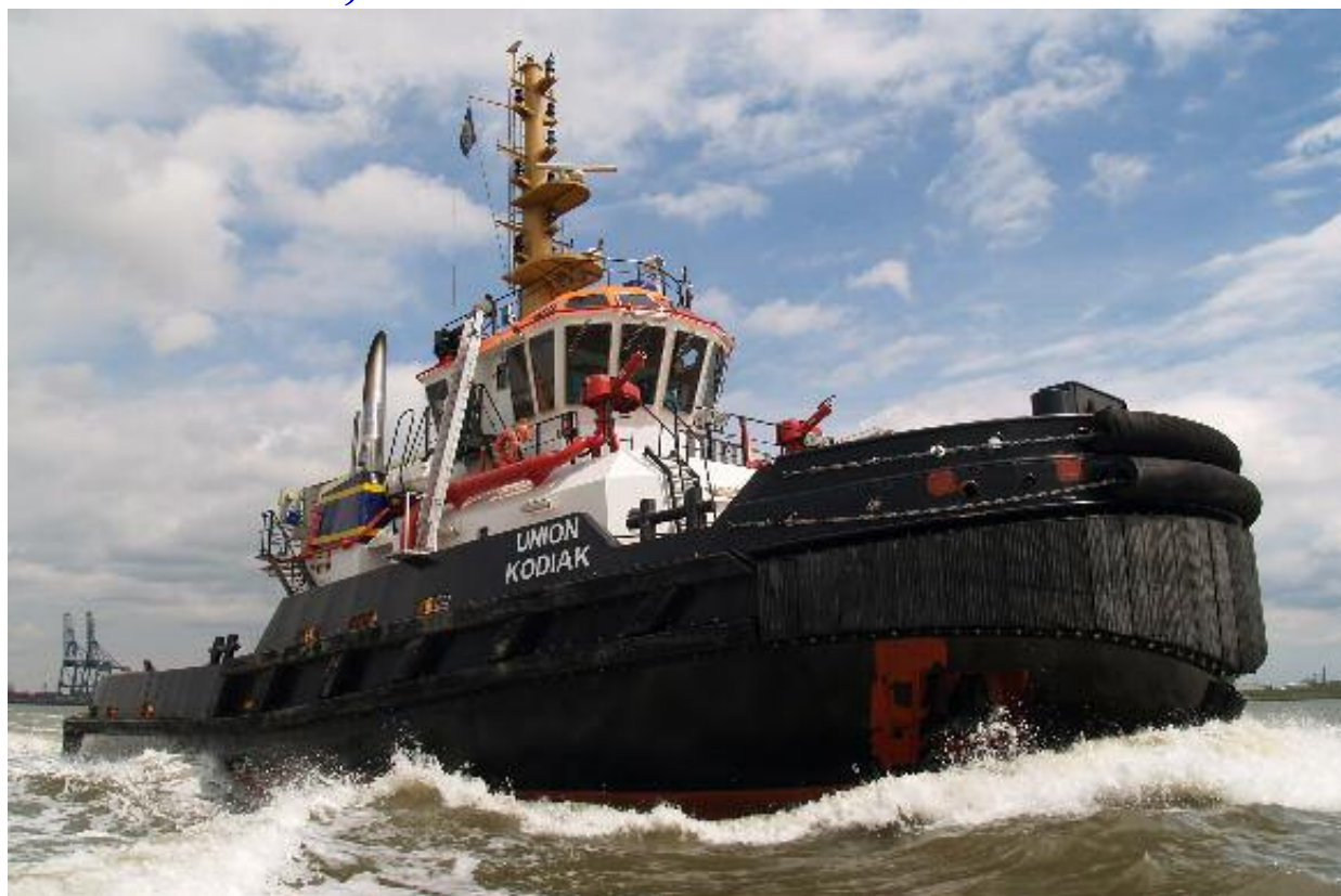
The URS latest is the UNION KODIAK seen above operating in the Port of Antwerp