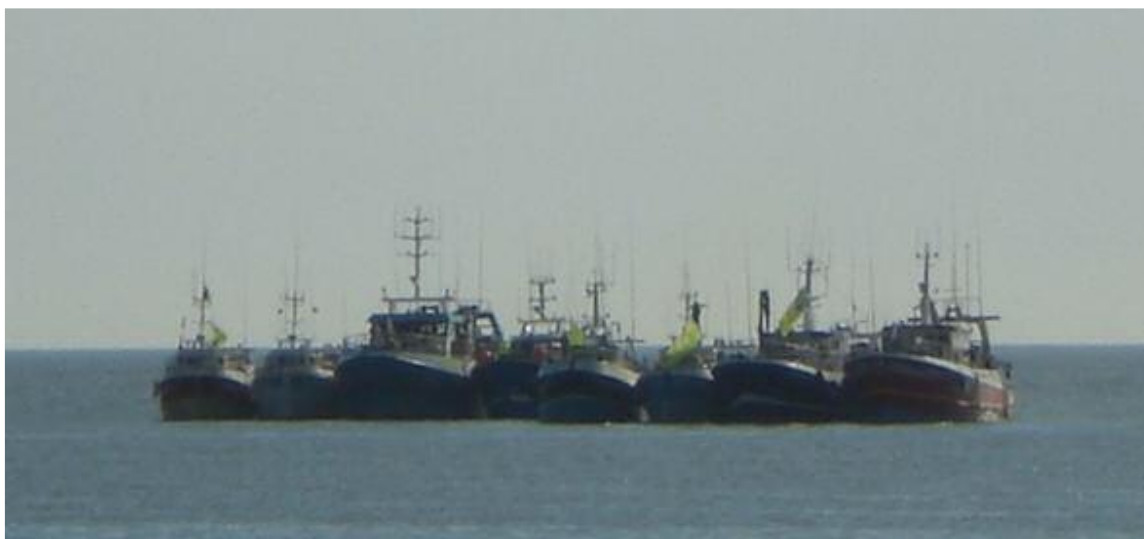
Angry fishers have blocked the port of La Rochelle (La Pallice)

The ship is due back in Auckland in the middle of next week.