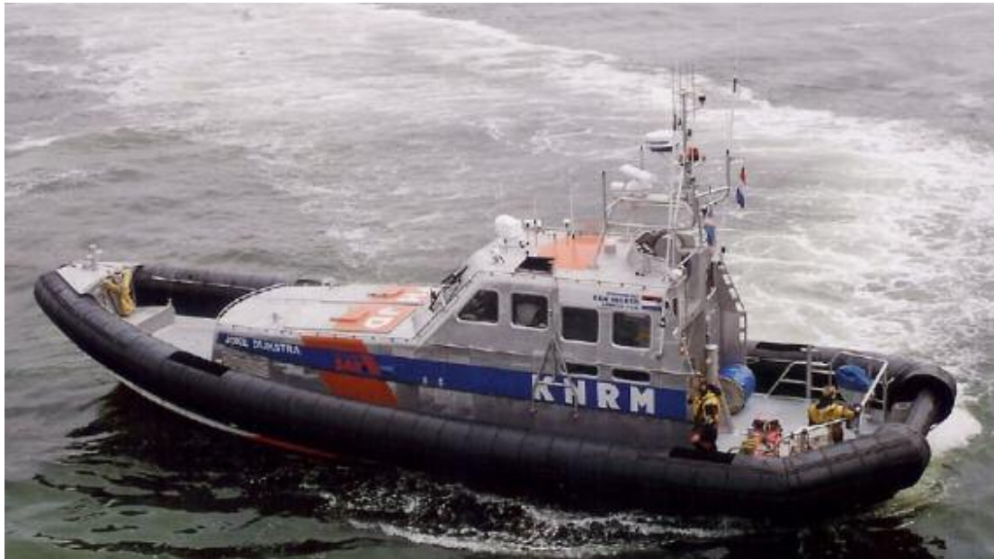
The KNRM Den Helder lifeboat JOKE DIJKSTRA seen in action during the Dutch Navy days 2007

It said it had kept in touch with the Coast Guard after being notified by the latter about the incident.