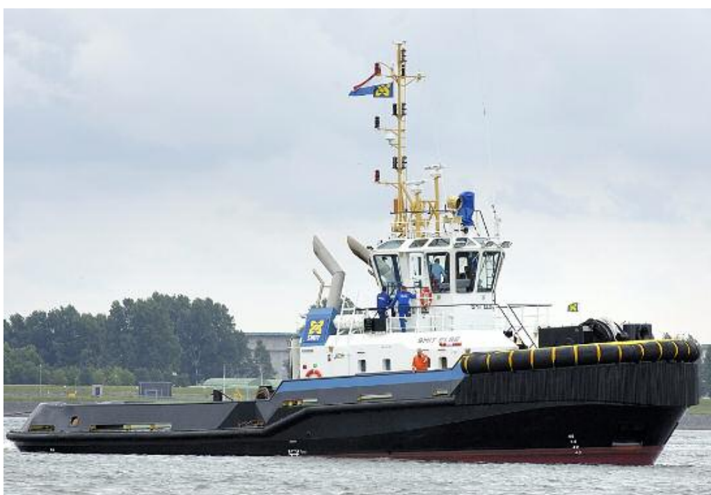
Damen's latest the SMIT ELBE seen during trials in Rotterdam Europoort