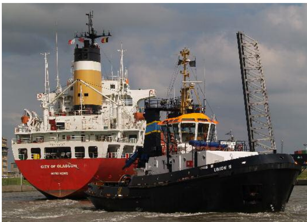
The URS tug UNION 9 seen assisting the CITY OF GLASGOW into the locks to enter the docks of Antwerp