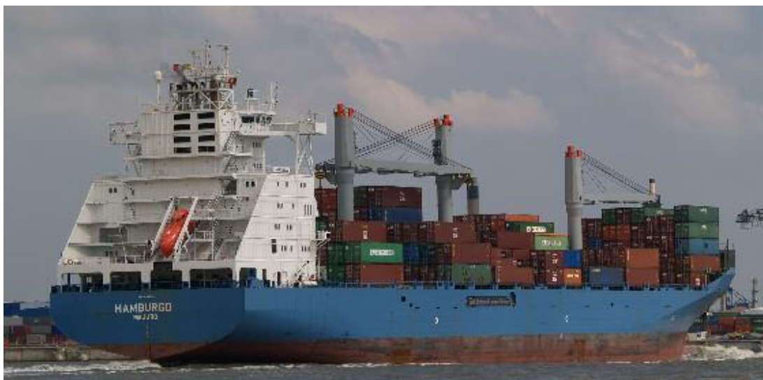
The HAMBURGO seen arriving in Antwerp