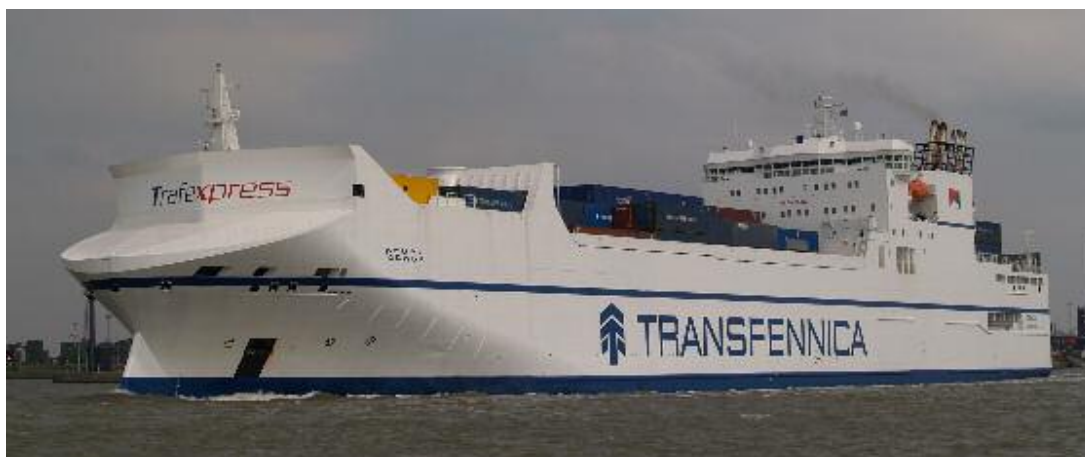
Transfennica's GENCA seen departing from Antwerp