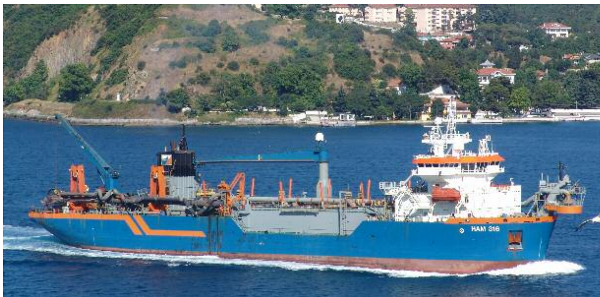
The HAM 318 seen passing the Bosphorus

The compiler of the news clippings disclaim all liability for any loss, damage or expense however caused, arising from the sending, receipt, or use of this e-mail communication and on any reliance placed upon the information provided through this free service and does not guarantee the completeness or accuracy of the information. If you want to no longer receive this bulletin kindly reply with the word "unsubscribe" in the subject line.