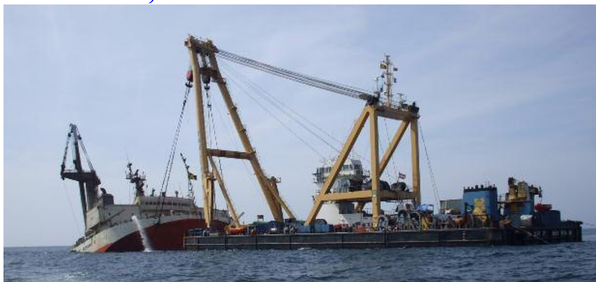
The TAKLIFT 7 seen with the partly re-floated MIGHTY SERVANT 3 in Angola