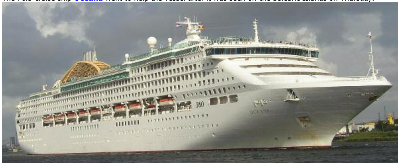
File photo of the OCEANA

A British cruise ship rescued seven Algerians from a small boat spotted drifting in the Mediterranean. The P&O cruise ship Oceana went to help the vessel after it was seen off the Balearic Islands on Thursday.