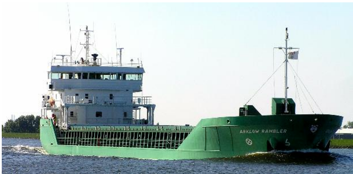
The ARKLOW RAMBLER seen enroute the Coen harbour in Amsterdam