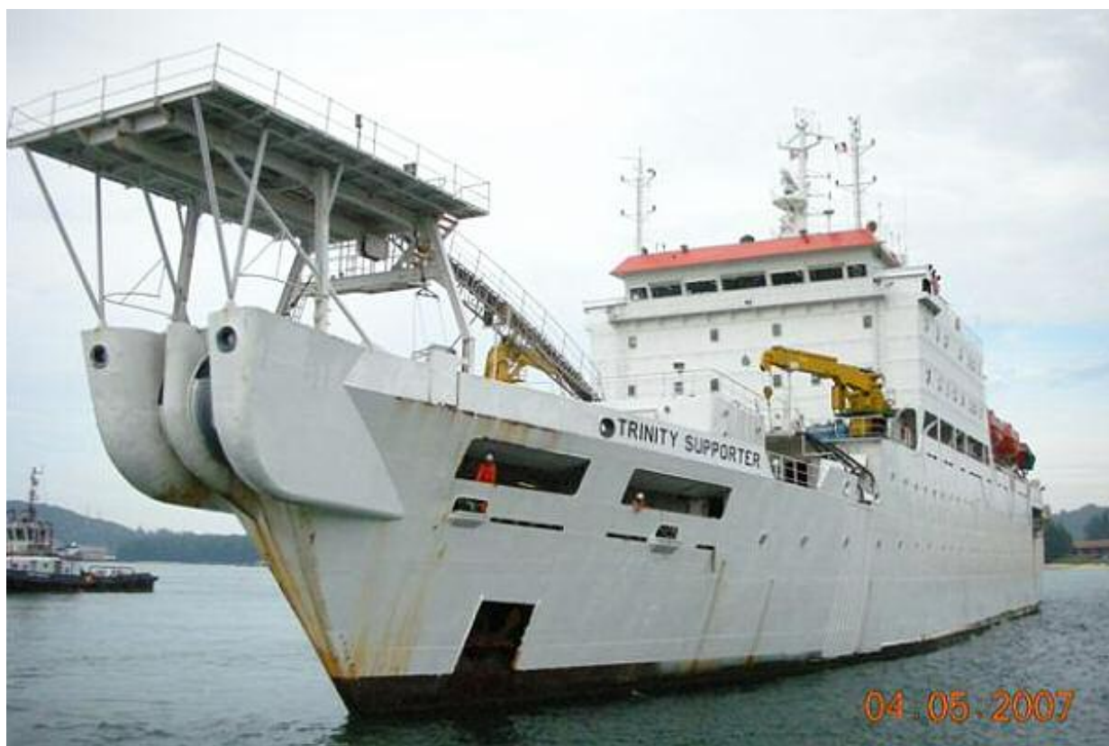
The TRINITY SUPPORTER seen arriving in Kemaman Supply Base – Kuantan (Malaysia)

"In general, youngsters shouldn't be left alone when playing by the water," added the spokesman.