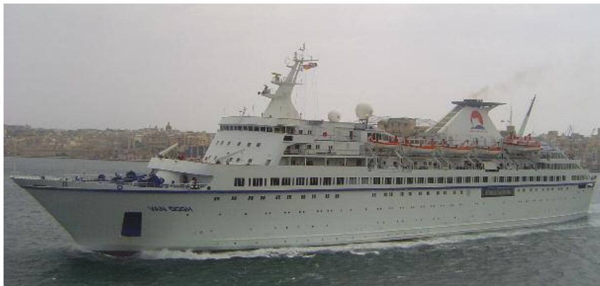
The VAN GOGH seen in Valetta (Malta)