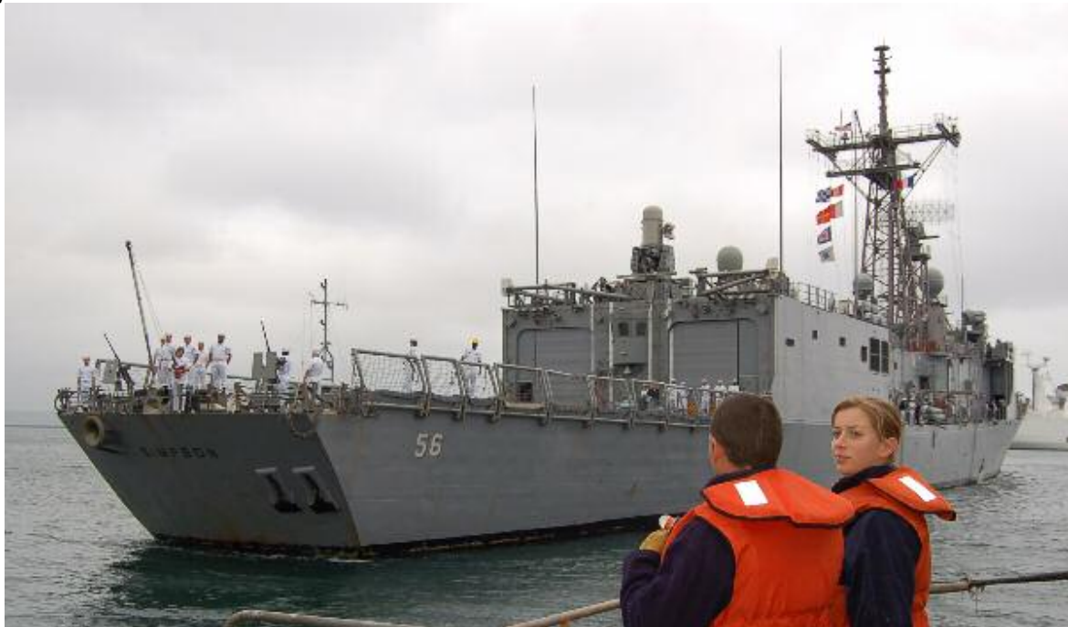
The USS SIMPSON (FFG 56) seen in the port of Brest after exercise Neptun Warrior

NATO is to stage an exceptionally large military exercise in the Baltic Sea later this month, according to Finnish media report Sunday. The exercise will be held between May 14 and May 25 in the territorial waters of Denmark, Sweden, Germany and Poland.