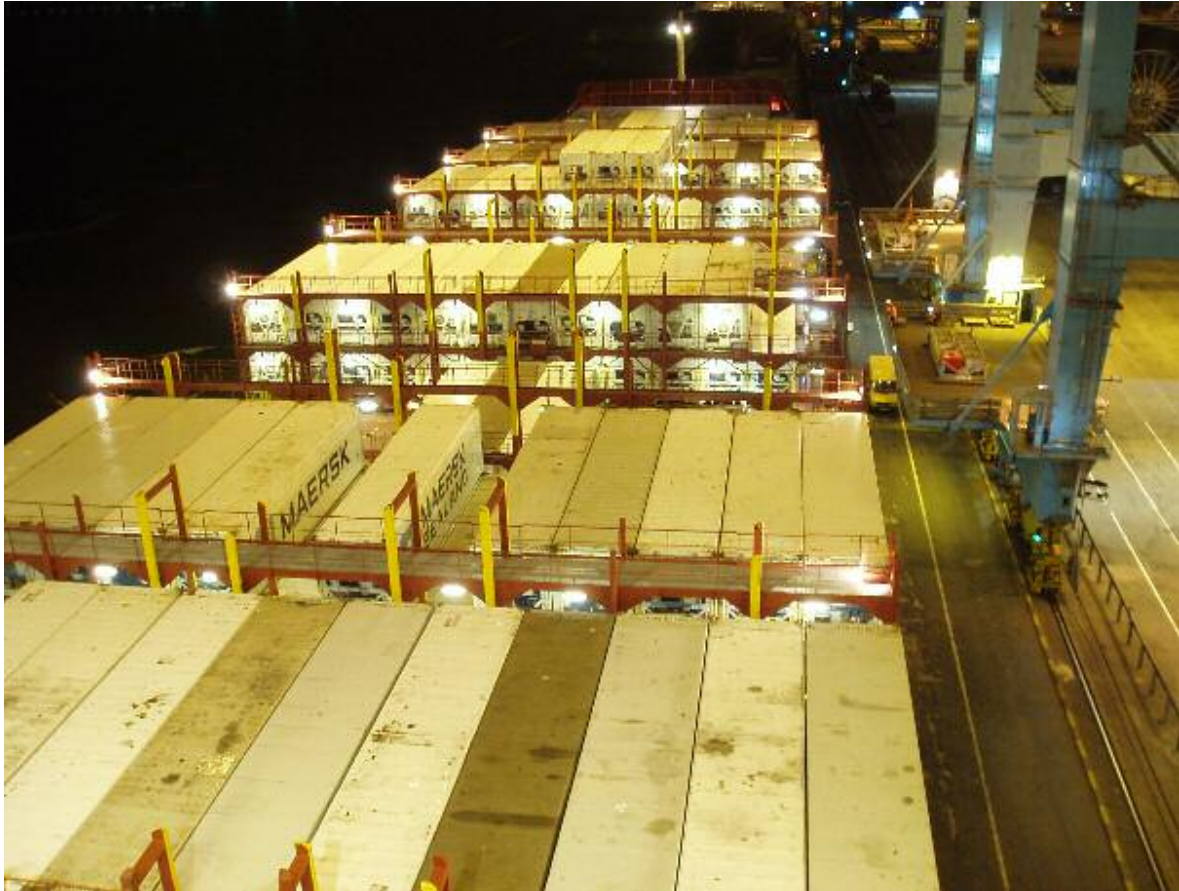
Above seen the m.s. JEPPESEN MAERSK moored at the APM Terminals at Rotterdam-Maasvlakte.

Note the large amounts of reefer units on deck (and in hold). Vessel is maintaining Maersk Line's ANDEAN service on South America. A lot of full reefers coming to Europe and a lot of empty reefers going to South America.