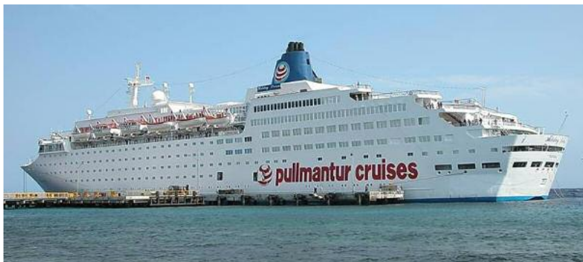
The HOLIDAY DREAM seen moored at Curacao