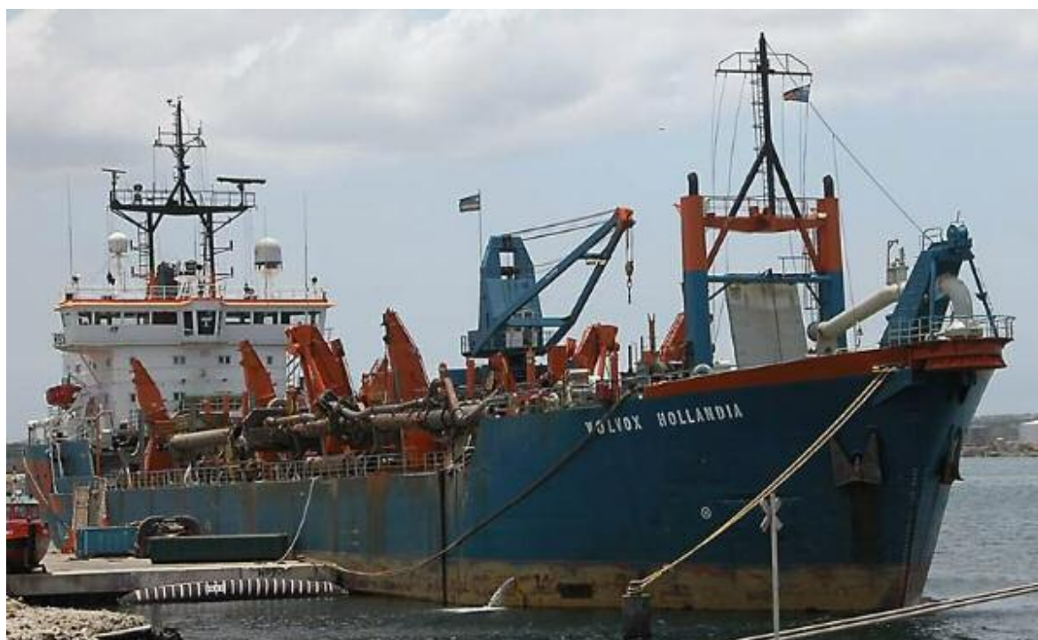
The VOLVOX HOLLANDIA seen moored in Willemstad – Curacao

Euronav NV announced that the company sold the double-hull VLCC Savoie (1993–306,430 dwt), for USD 82.2 million. The capital gain of this sale transaction of about USD 44.4 million will be recorded in the second quarter of 2007. The vessel is foreseen to be delivered to its new owner in early June of this year. This sale is part of the ongoing fleet renewal program of Euronav and the strategy to maintain a young fleet.