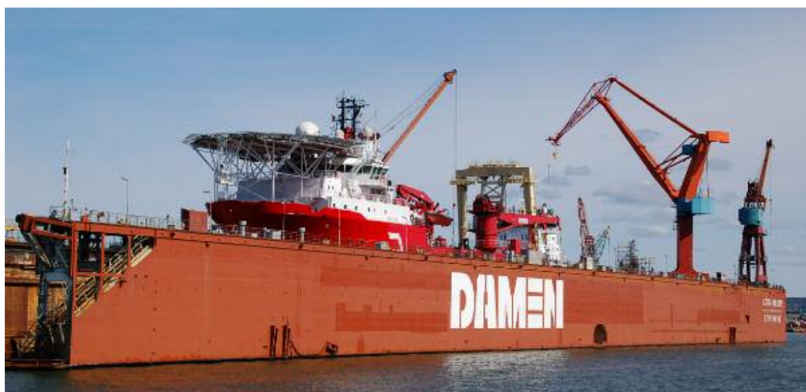
The FAR SOVEREIGN seen in drydock in Gotenborg