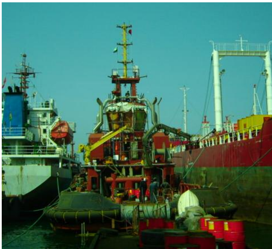
The SMIT EUROPE seen fitting out in Turkey