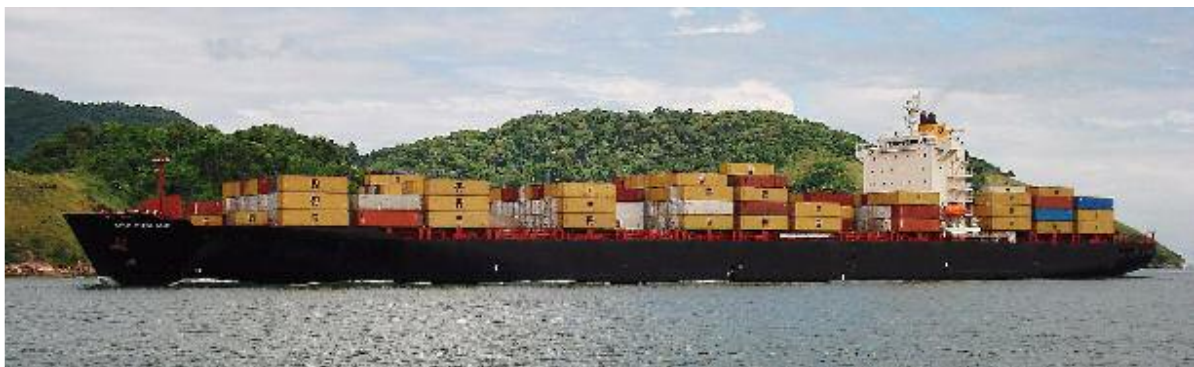
The MSC ENGLAND seen in Santos – Photo : Bruno Pricoli ©

Most of the cocaine leaves the country by sea, on go-fast boats that transport the drugs up along the Central American coast for their eventual smuggling into the United States overland through Mexico.