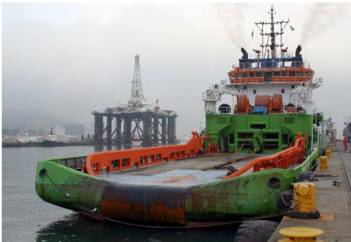
The FAIRMOUNT SHERPA arrived in Cape Town