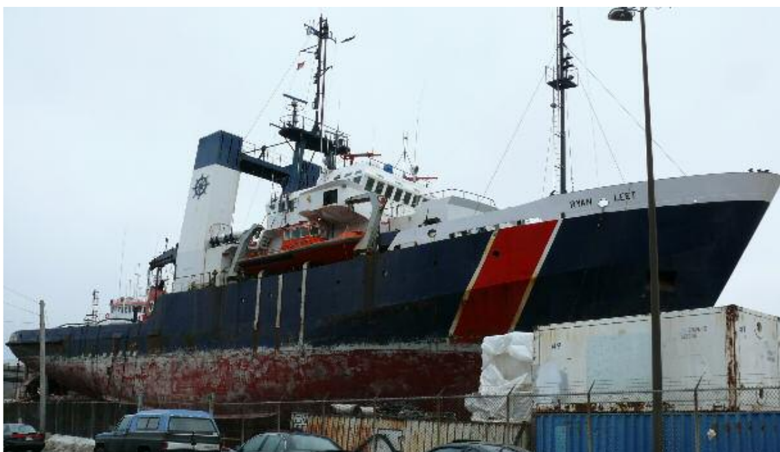
The RYAN LEET seen at the slip in St. John (New Foundland)