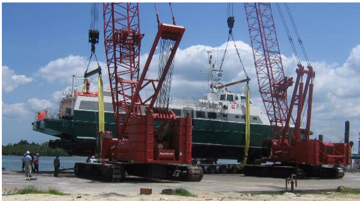
Spotted May 2 nd at FLT facility Onne Nigeria the new Bourbon crew boat, ' Surfer 322 ' being prepared for launching. The vessel was built by 'West Atlantic Shipyard' at Onne port Nigeria.