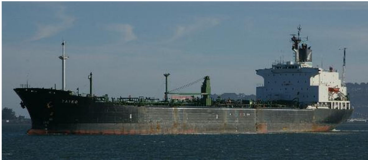
The New Zealand registered tanker " Taiko " seen departing Dunedin, New Zealand for the last time before being sold and renamed Atlantia and registered in Panama. The Taiko served 22 years carrying petroleum products around the New Zealand coast.