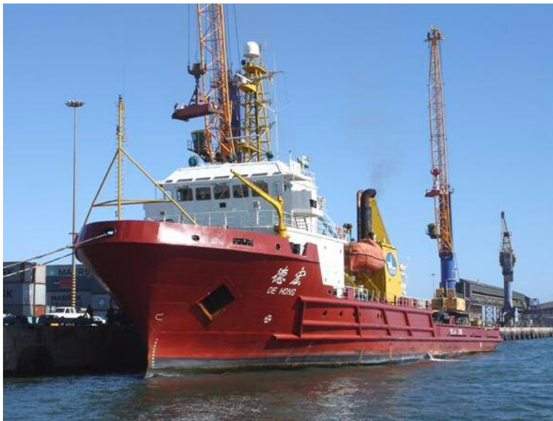
The MV De Hong was loading bunkers in the Port of Walvis Bay on its way to Angola to fetch the Mighty Servant 3 after the refloating and to tow her to South Africa.

At around 8am on Wednesday, the SA Agulhas was 190 nautical miles from the stranded yacht, which is drifting at two nautical miles per hour. The yacht left Cape Town on April 23 for Australia. Hellenburg says the rescue ship is in contact with the surviving crew members.