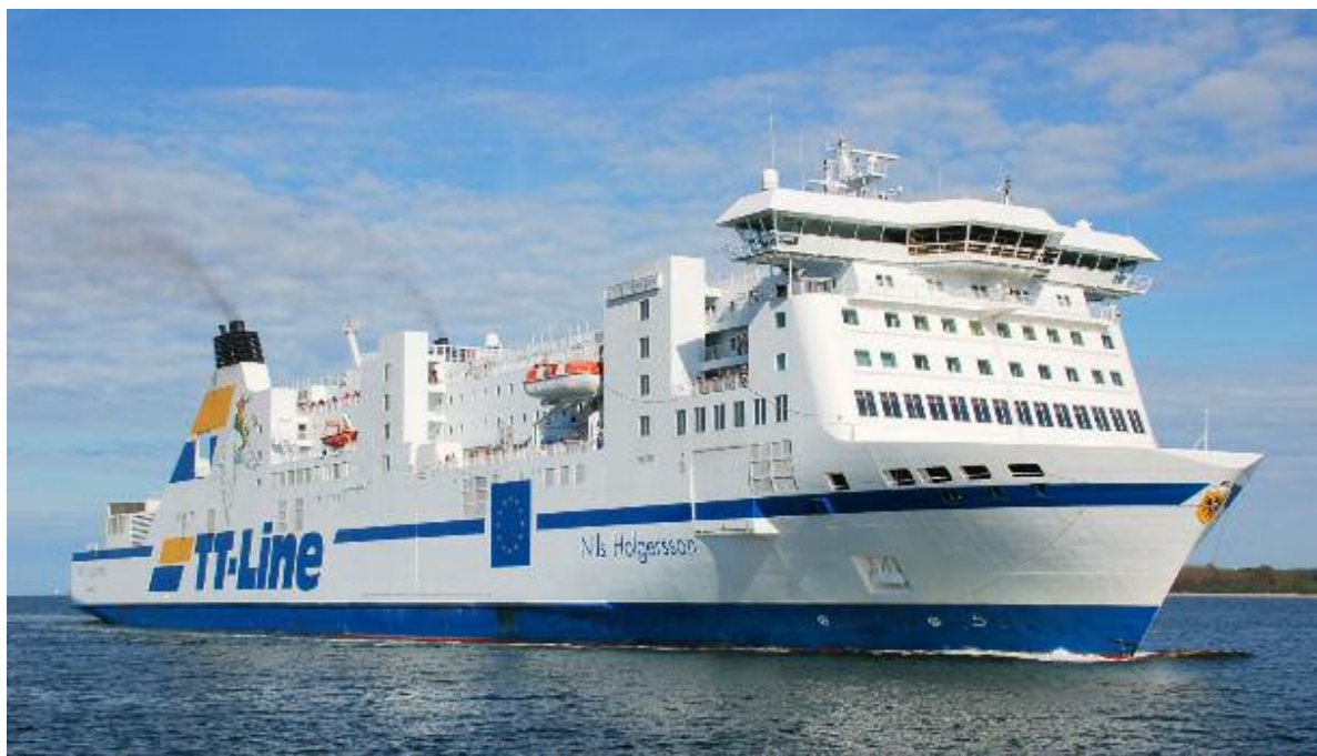
The NILS HOLGERSSON seen in Travemünde

The compiler of the news clippings disclaim all liability for any loss, damage or exense however caused, arising from the sending, receipt, or use of this e-mail communication and on any reliance placed upon the information provided through this free service and does not guarantee the completeness or accuracy of the information. If you want to no longer receive this bulletin kindly reply with the word "unsubscribe" in the subject line.