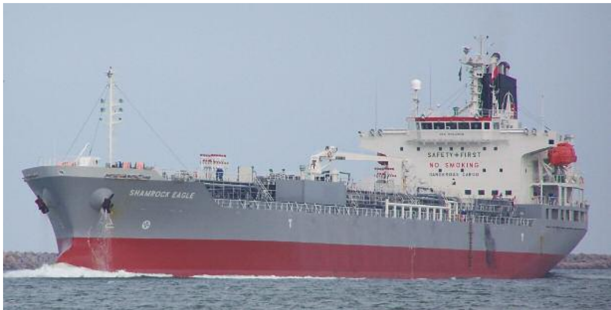
The SHAMROCK EAGLE seen in Rio Grande