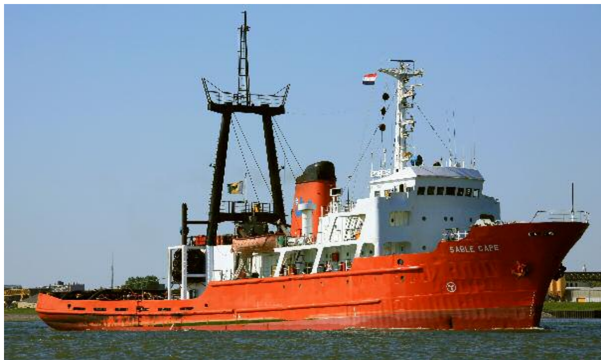
The SABLE CAPE seen enroute Rotterdam