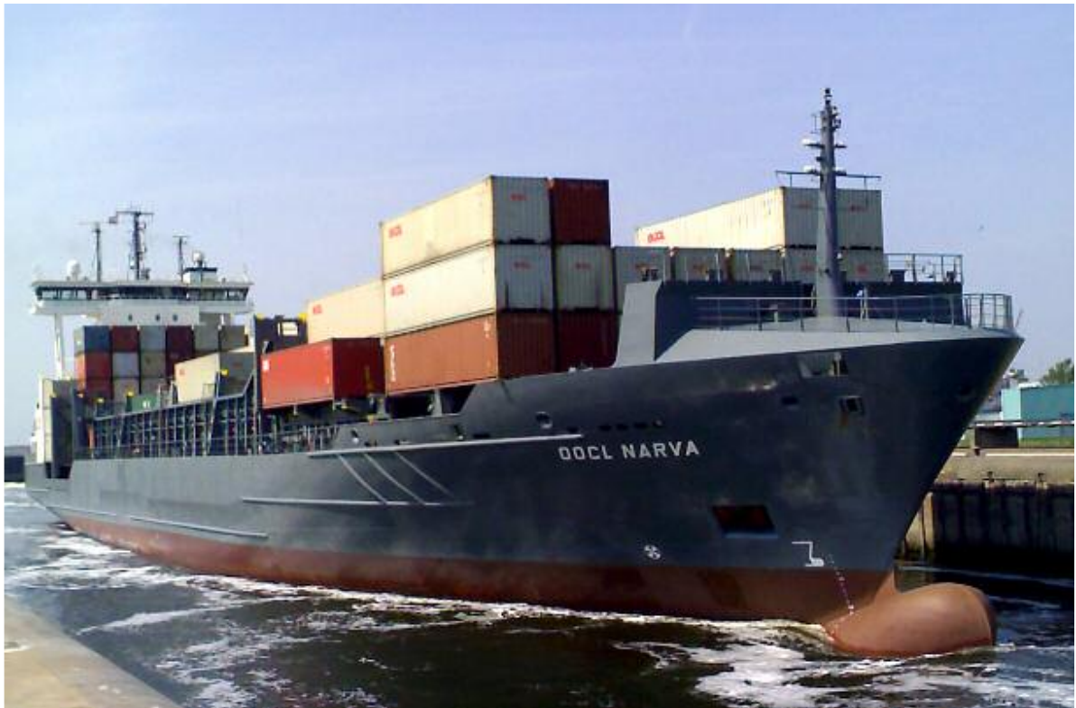
The OOCL NARVA