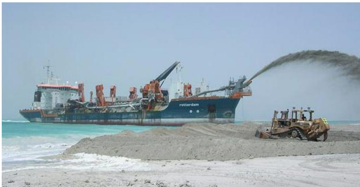
The Trailing Suction dredger Rotterdam seen operating in Dubai at the "Deira Corniche"

Five Voith Schneider propellers will provide a very accurate and stable positioning system and low fuel consumption compared to other propulsion systems. The ship will also have a helicopter deck with refueling plant, and a mix of executive cabins, offices, conference rooms, satellite communication, internet cafe, wireless net, television, fitness rooms, sauna, swimming pool, recreation areas, and a cinema. The value of the vessel is approximately Nkr 850 million, and the yard that will build the vessel will be announced later this month.