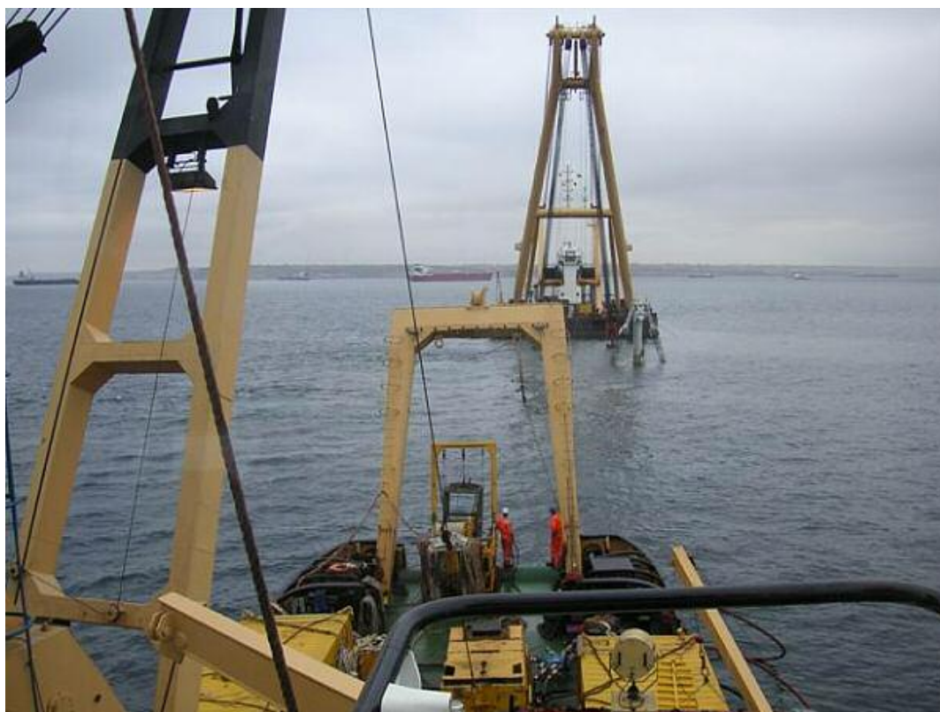
The SMIT ORCA with the TAKLIFT 7 in position ready for re-floating operation of the MIGHTY SERVANT 3

The company has determined that given the status of the investigation, it is premature for it to determine whether it needs to make any financial reserve for any potential liabilities that may result from these activities.