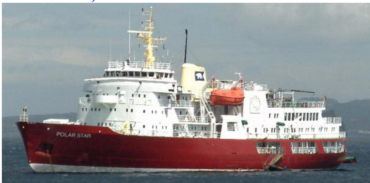
The POLAR STAR seen anchored off Horta (Azores)

M/V Polar Star was built in Finland, and served in the Swedish Maritime Administration's fleet of icebreakers under the name of Njord . Today, the M/V Polar Star , an expedition cruise ship, is owned and operated by Polar Star Expeditions , formed in 2000 and a company of Karlsen Shipping. When the M/V Polar Star was purchased in 2000, she underwent a complete retrofit and upgrades, and was then renamed after her namesake that served Karlsen's Arctic cruise program.