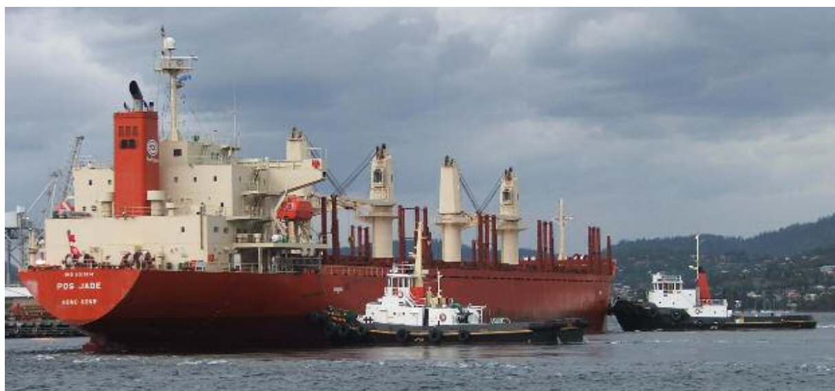
The POS JADE seen arriving in Hobart assisted by the tugs Storm Cove and Taragal

De sneldiensten van de Koegelwieck zijn de laatste jaren steeds populairder geworden ten koste van de langzamere veren De Friesland en De Vlieland . De sneldienst vaart in drie kwartier de Waddenzee over, de veren zijn twee uur onderweg. Vooral omdat toeristen vaker maar korter op vakantie gaan vroegen de eilander ondernemers voor meer ruimte op de sneldienst.