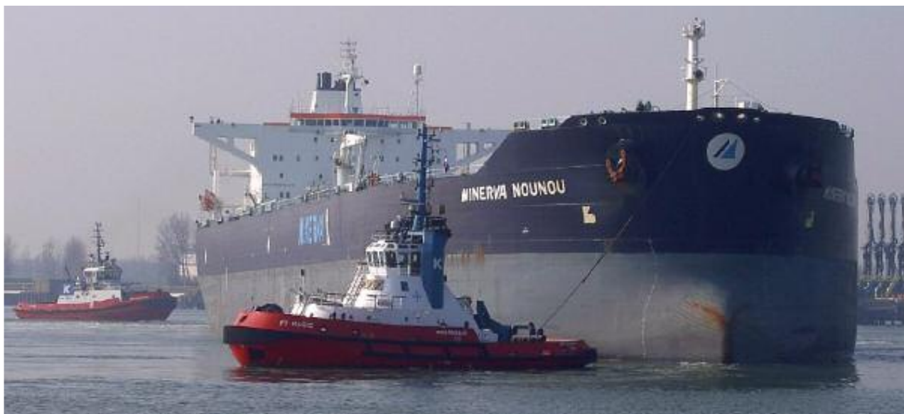
The MINERVA NOUNOU seen in Rotterdam-Europoort