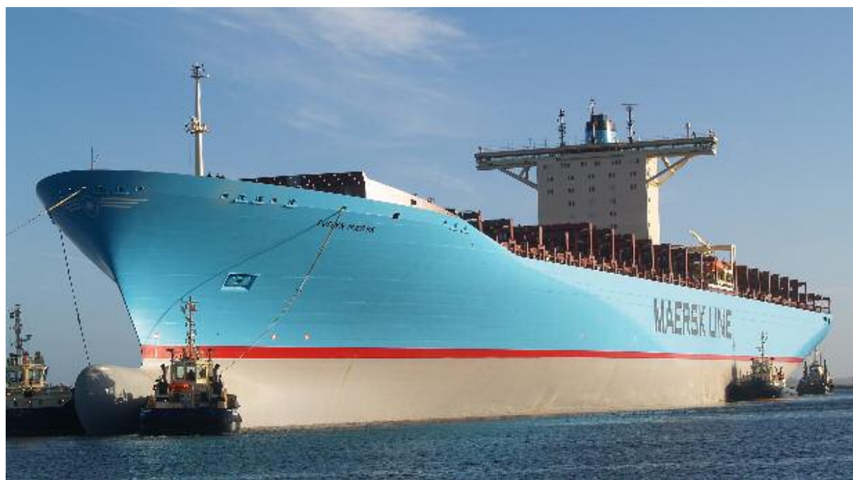
The EVELYN MAERSK left the builders for trails