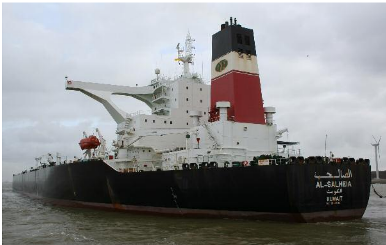
The AL SALHEIA seen arriving in Rotterdam-Europoort