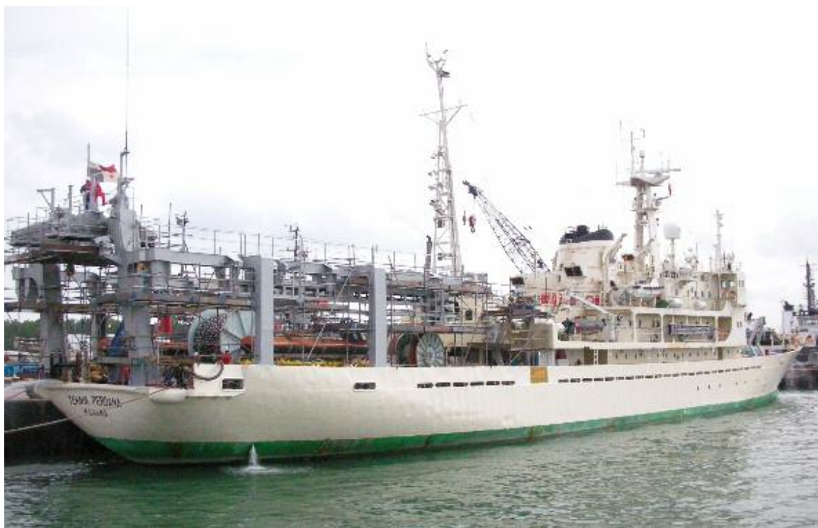
The TEKNIK PERDANA moored at Loyang Marine base (Singapore) – Photo : Capt Jelle de Vries ©