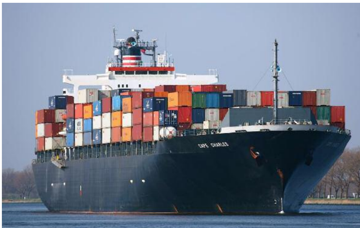
The CAPE CHARLES arrived in Amsterdam

's Ochtends bel ik even met mijn moeder, die vooral zeker wil weten dat ik altijd aangeliend zit. Even later heb ik mijn eerste radio interview vanaf de Pacific op Radio 1 bij het KRO programma: "Dingen die gebeuren". Net als op de Atlantic zal ik daar wekelijks te horen zijn op vrijdagmiddag tussen 14.30 en 15.00 uur. Bij de wereldomroep ben ik wekelijks op dinsdag te horen en ieder eerste zaterdag van de maand om 7.20 bij de NCRV op radio 2.