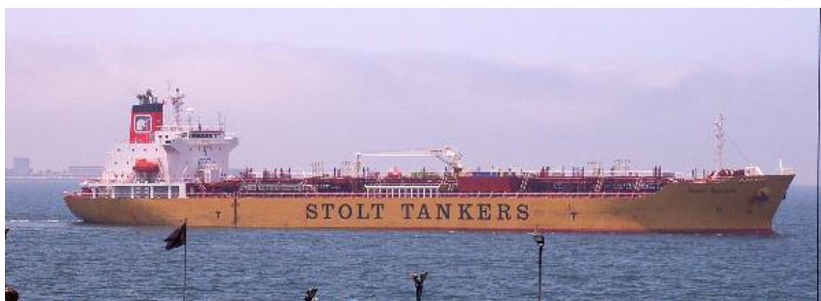
The STOLT BASUTU seen leaving Callao Port ( Note the Unicorn funnel )