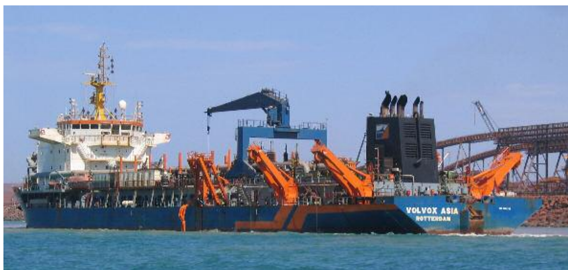
The Trailer hopper dredger VOLVOX ASIA seen dredging in the port of Dampier (Australia)