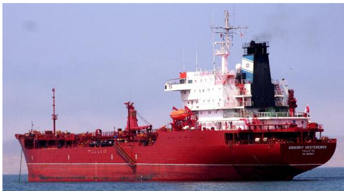
The Peruvian government purchased the 2 nd NOVOSHIP tanker GRIGORIY NESTERENKO , the tanker arrived at the Callao Anchorage and will be renamed soon in BAP ZORRITOS and will sail for the Peruvian Navy in the coastal trade, the same as the sistership PETR SCHMIDT which was renamed BAP BAYOVAR last month.