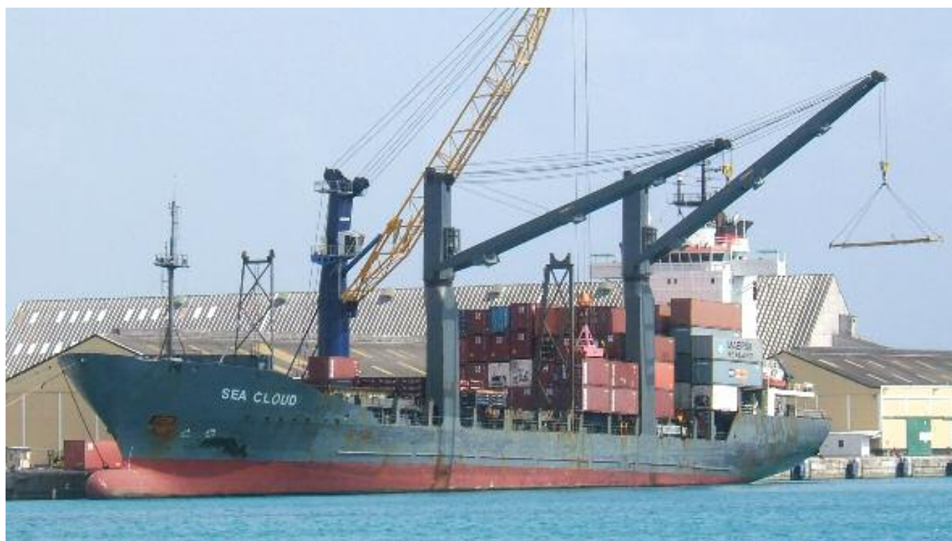
The SEA CLOUD seen in Bridgetown (Barbados)

DP World announced in December it had reached a deal to sell its US port operations to a subsidiary of AIG. The deal was reportedly delayed as US port authorities slapped an 84-million-dollar transaction fee on it, which DP World said in February it would not pay. DP World did not refer to any settlement that may have been reached over the transaction fee.