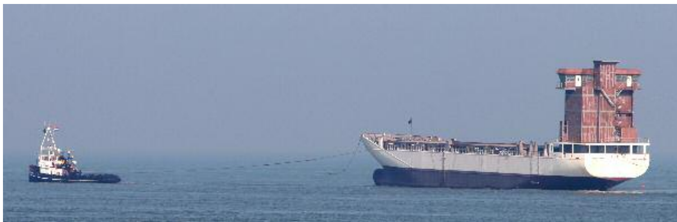
The tug BROEDERTROUW XVI seen departing with the VANTAGE from Rotterdam bound for IJmuiden

The union wants a pay rise of 45 euros ($59) a month and a one-time net payment of 800 euros for each of the unit's workers. According to a Smit statement last month, the union is demanding a 16 percent overall raise for a one-year agreement, whereas Smit is offering 16 percent for two years.