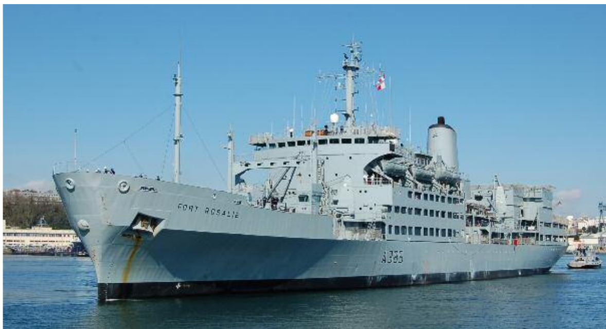
The FORT ROSALIE visited the port of Brest

Waterstraat 16 2970 SCHILDE BELGIUM Tel : + 32 3 464 26 09 Fax : + 32 3 297 20 70 e-mail : anglodutch@pandora.be