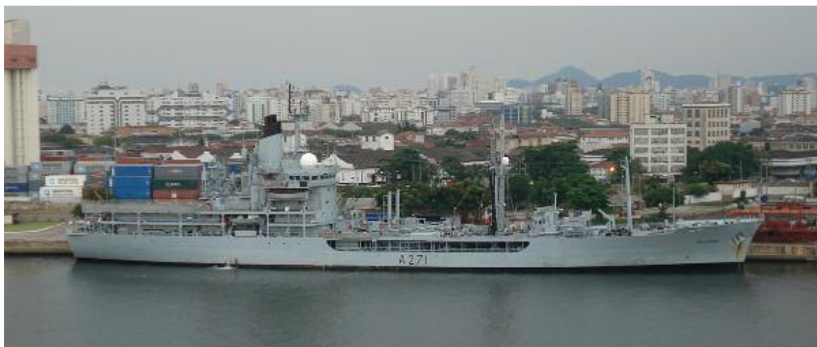
The A 271 GOLD ROVER seen in Santos (Brazil)