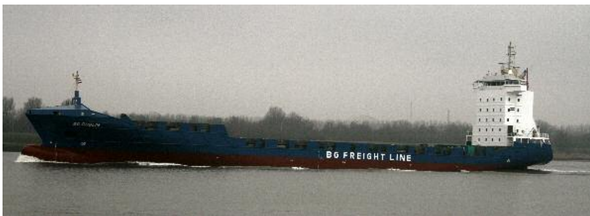
The BG DUBLIN seen during her maiden voyage arrival in Rotterdam

De Spaanse autoriteiten hebben erop gewezen dat de gasen niet giftig zijn. Er is geen gevaar voor de bevolking of de bemanning.