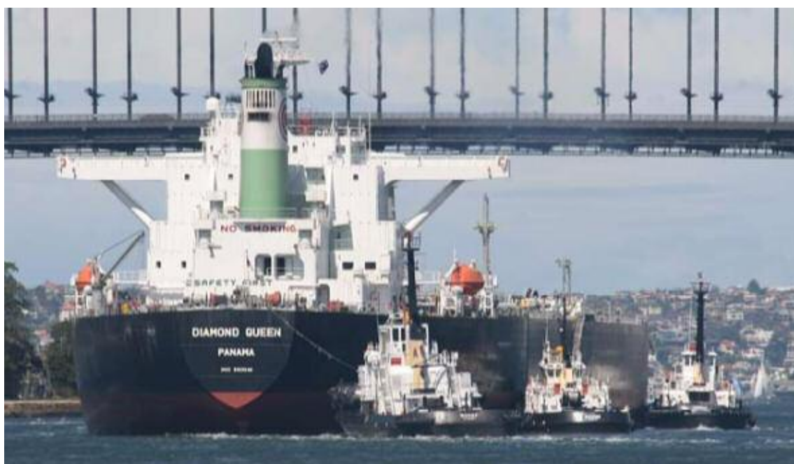
The DIAMOND QUEEN seen arriving in Sydney