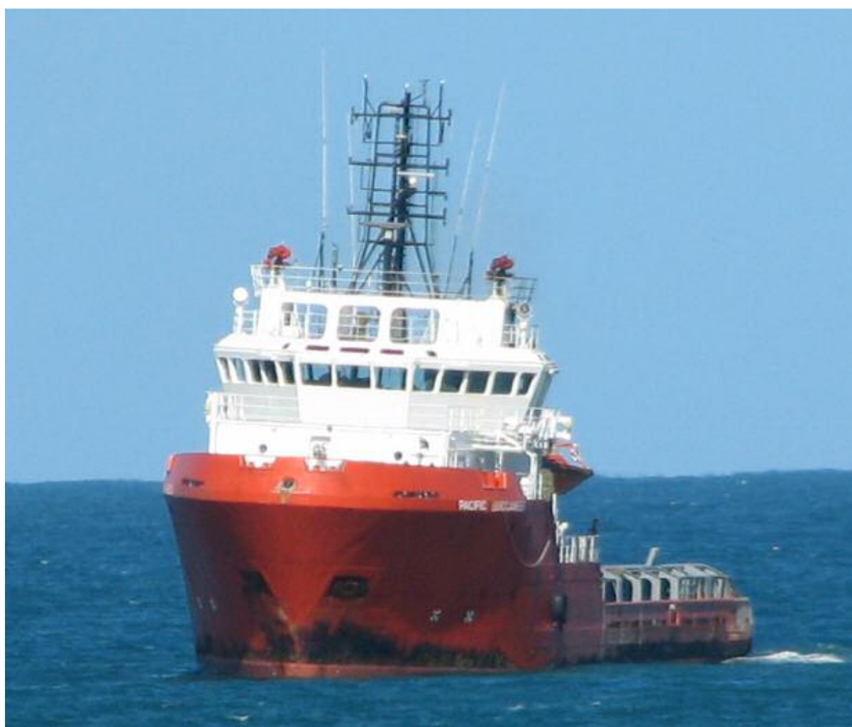
The PACIFIC BUCCANEER seen working in Mossel Bay