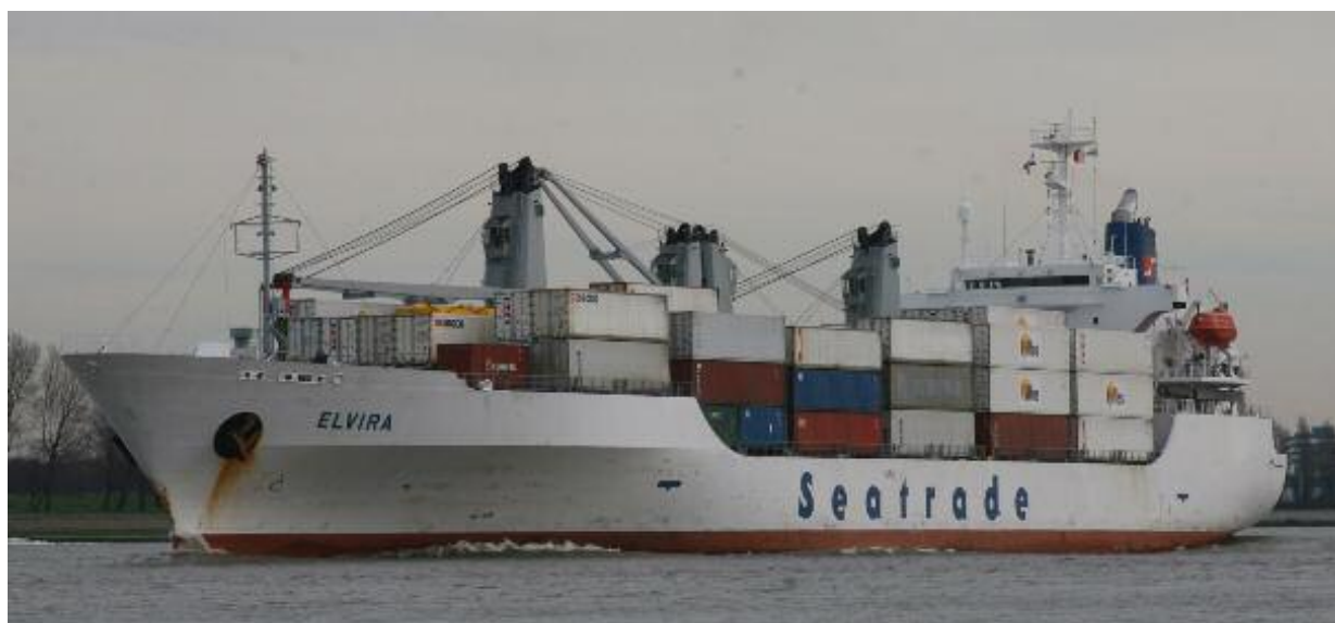
The ELVIRA seen enroute Rotterdam

Telephone : (31) 10 - 453 03 77 Fax : (31) 10 - 453 05 24 E-mail : mail@workships.nl Website : www.workships.nl