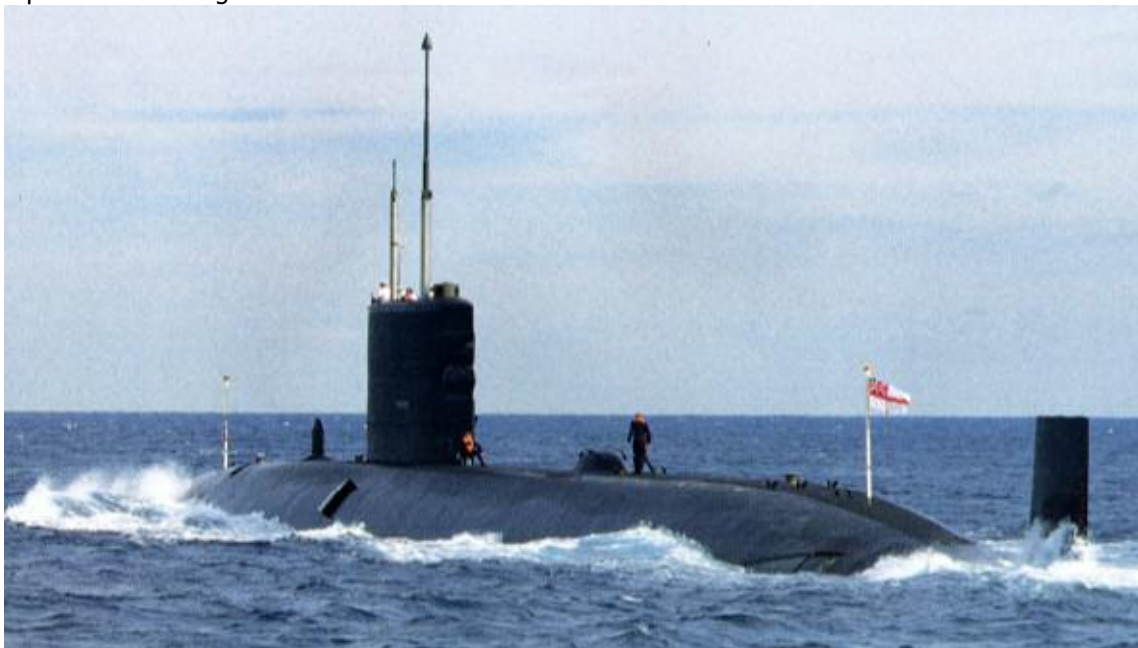
Top ; The HMS S 110 TURBULENT – Photo : George Arra ©

HQBF announced the arrival of HMS TURBULENT . The submarine is visiting Gibraltar for a short stay as part of her scheduled operational tasking.