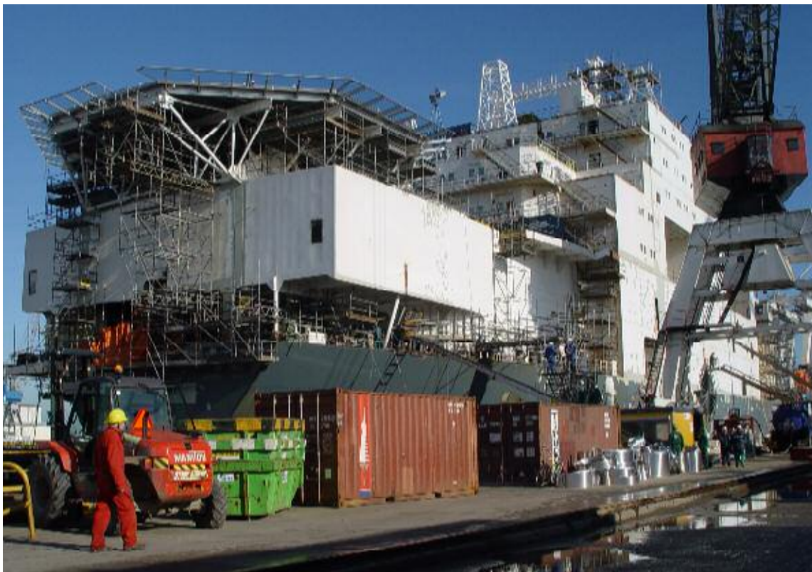
Ongoing works on ALLSEAS AUDACIA at the Keppel-Verolme shipyard in Rotterdam-Botlek