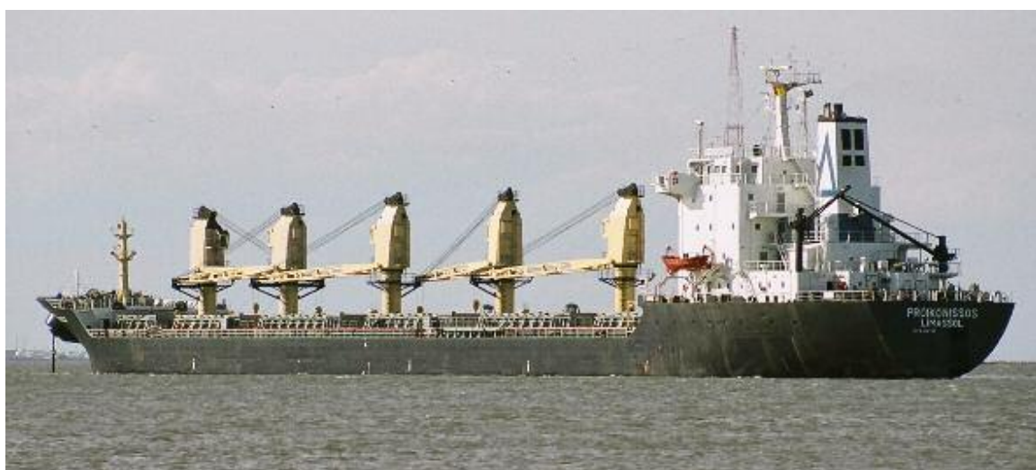
The PROIKONISSOS seen in Rio Grande