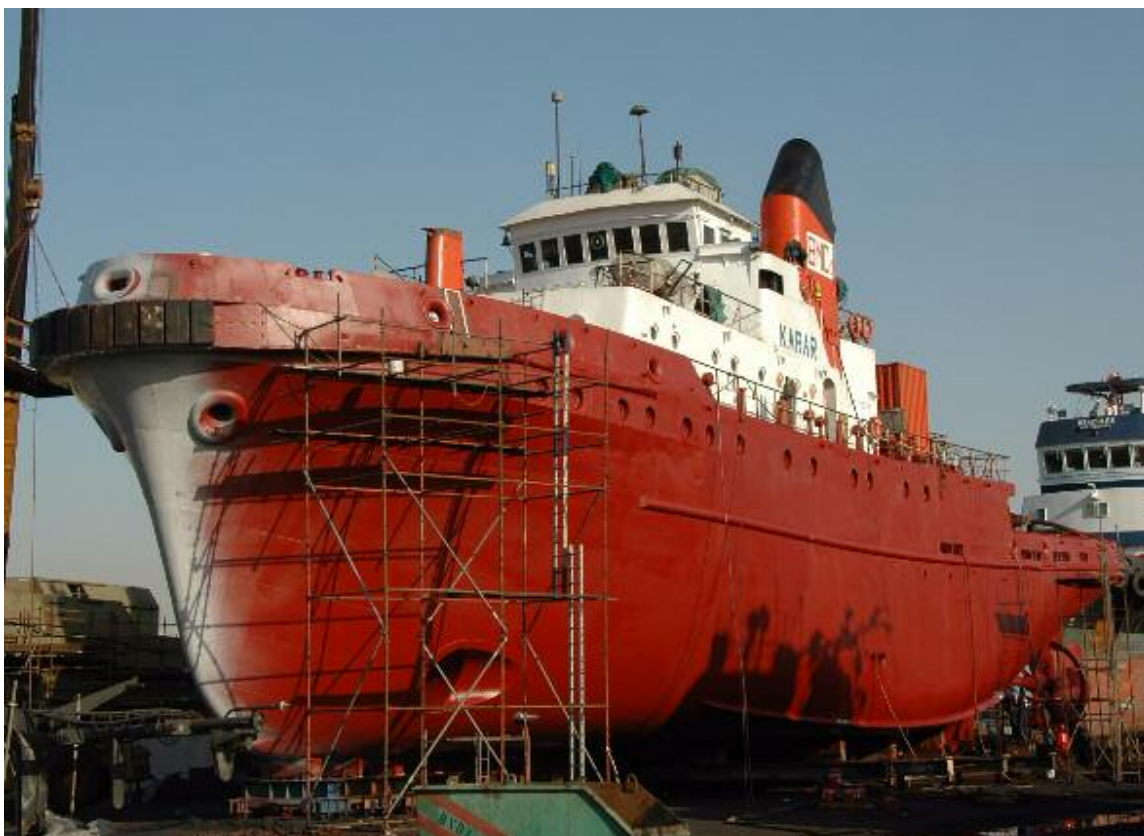
The KARAR (former SOLANO) seen on the synchro-lift in Dubai - Photo : Reinier Meuleman ©