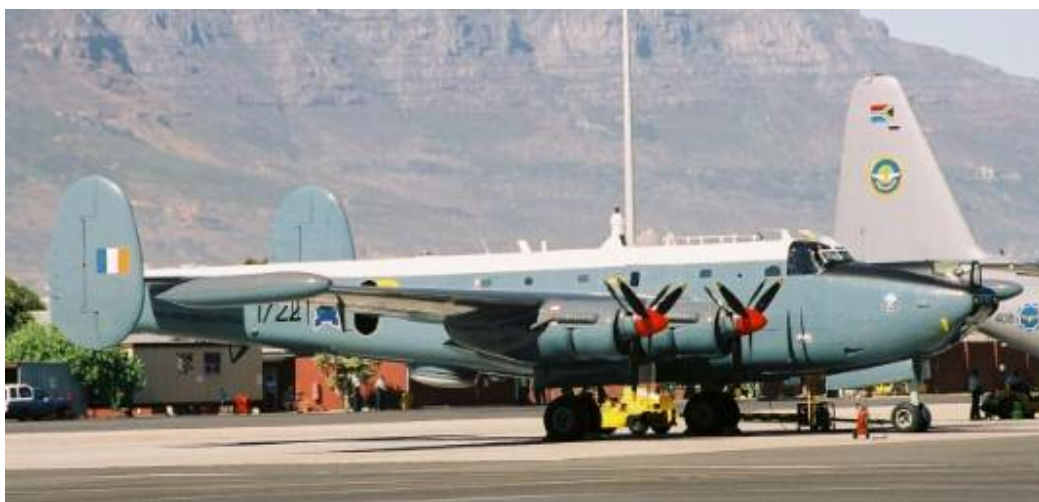
The last flying Shackleton Mk3 Pelican 22 seen at Cape Town airport

A DVD recalling this dramatic event is available for purchase from the Museum website http://saairforce.co.za/shop/product_info.php?cPath=31&products_id=141