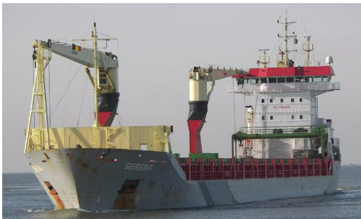
The SERENA seen at the Westerscheldt river - Photo : Pierre-Alfred Caille ©