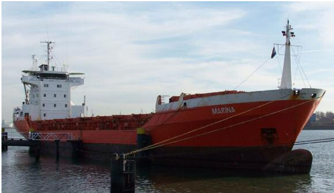
The MARINA seen moored in the Caland Canal