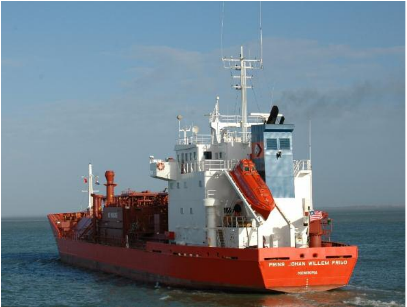
The PRINS JOHAN WILLEM FRISO of Anthony Veder seen at the Westerscheldt River, note the flag change from Dutch to Liberian flag and homeported now Monrovia, the Dutch crew onboard is replaced by Russian nationals and the ratings onboard are from Indonesia.