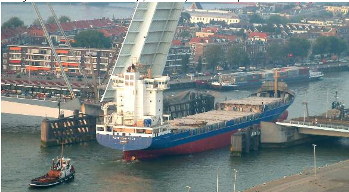
The ASTROSPRINTER seen in Rotterdam, which will be renamed in TRANSANUND

TransAtlantic, a Swedish shipping company, has expanded its operation in Oulu considerably. On 6th January, new line traffic connections began from Oulu to Gothenburg and Lübeck with two brand-new and one older container/RoRo vessel, operating three times a week: on Mondays, Wednesdays and Saturdays.