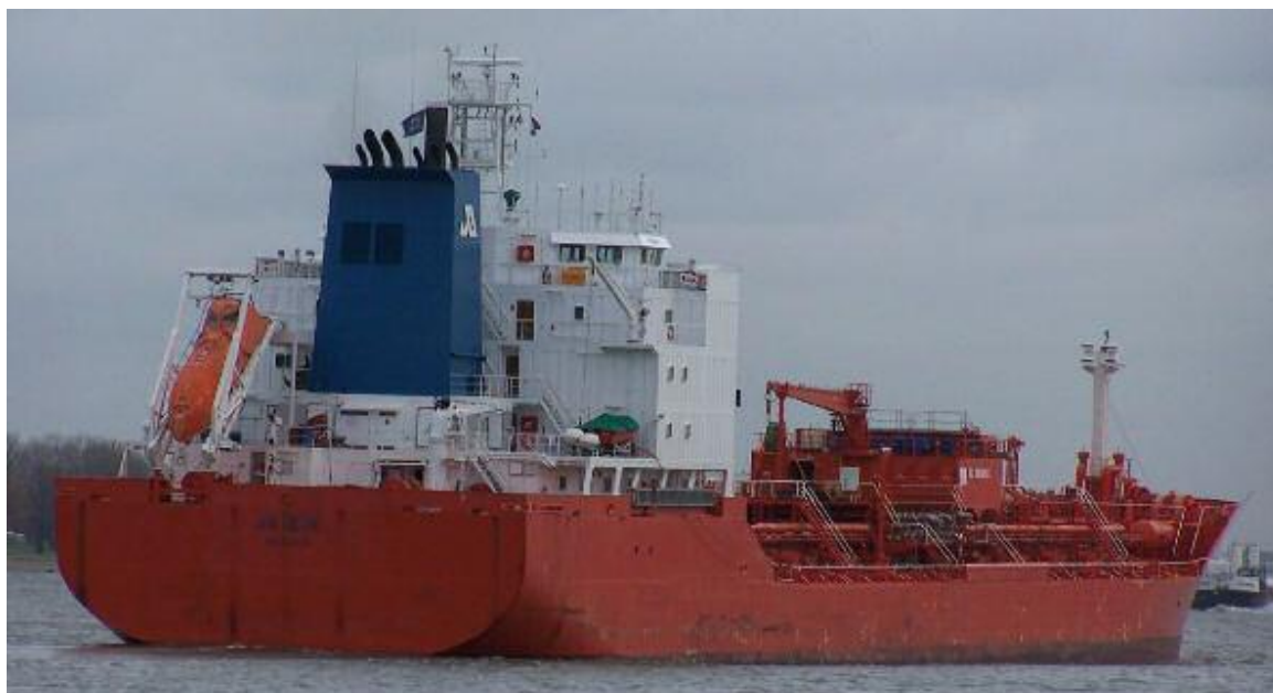
The JO EIK seen enroute Rotterdam