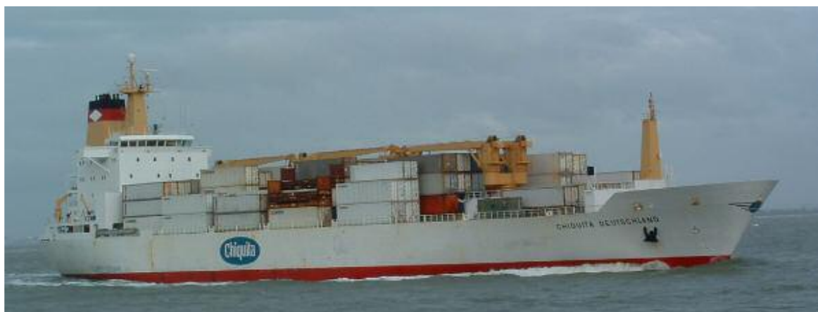
The CHIQUITA DEUTSCHLAND seen enroute Antwerp

De Club Med II komt maandagochtend om zeven uur aan en vertrekt weer om vijf uur. Dit najaar keert het schip nog een keer terug naar Willemstad. Dit bezoek staat gepland op 29 november. De agent die de afhandeling verzorgt is Admiral Shipping.