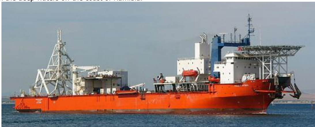
Top : The PEACE IN AFRICA

The new vessel gave De Beers "two strings to our bow" in being able to explore for diamonds off the west coast of SA as well as in the deep waters off the coast of Namibia.