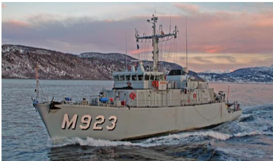
Boven : de Belgische mijnenjager M 923 NARCIS