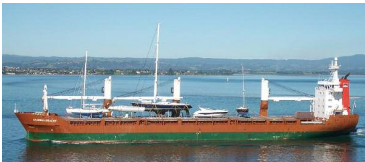
The ERASMUSGRACHT seen arriving in Tauranga (New Zealand)