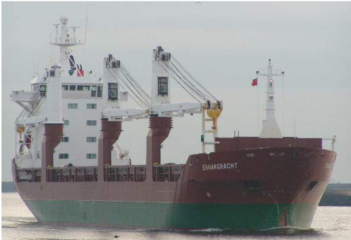
Spliethof's EMMAGRACHT seen at the river Tyne bound for OTP Walker.

Ze heeft geen idee wanneer beide partijen weer met elkaar praten.