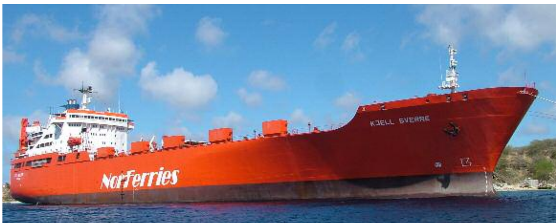
Norferries KJELL SVERRE seen moored in Caracas Bay (Curacao)

Het chique zeilcruiseschip Club Med II bezoekt volgende week maandag voor het eerst Curaçao. Tijdens het bezoek meert de vijfmaster af aan de Matheywerf.