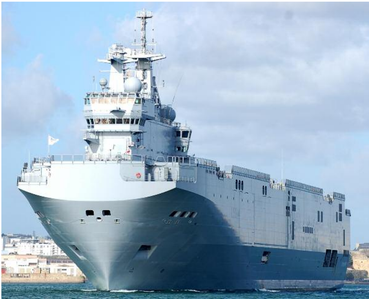
The French L 9014 TONNERRE seen leaving the port of Brest

Cdr Jaco Theunissen said the frigate's crew would begin with operational duties, which would include training operations, peace support operations, escorts, diplomatic missions, operational exercises with African and other navies, and any other duty that they might be assigned to perform.