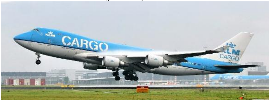
Boven : De Boeing 747-400 PH-CKB in de start op Schiphol

De vrachtomzet bij Air France-KLM daalde over het derde kwartaal van het lopende boekjaar met 3 procent tot 789 miljoen euro. Het resultaat van het bedrijfsonderdeel kromp zelfs met eenderde van 98 miljoen naar 62 miljoen euro vergeleken met jaar eerder.