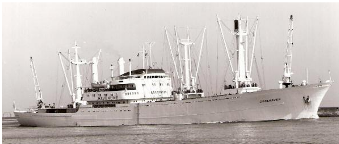
The COOLHAVEN (Havenline-Van Uden) seen departing from Rotterdam, the ship was built during 1961 as the Cap San Augustin for Hamburg-Sud, sold to Van Uden during February 1983 and sailed for them for just over 1 year.