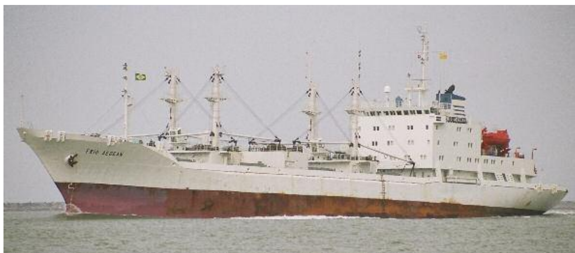
The FRIO AGEAN seen in Rio Grande