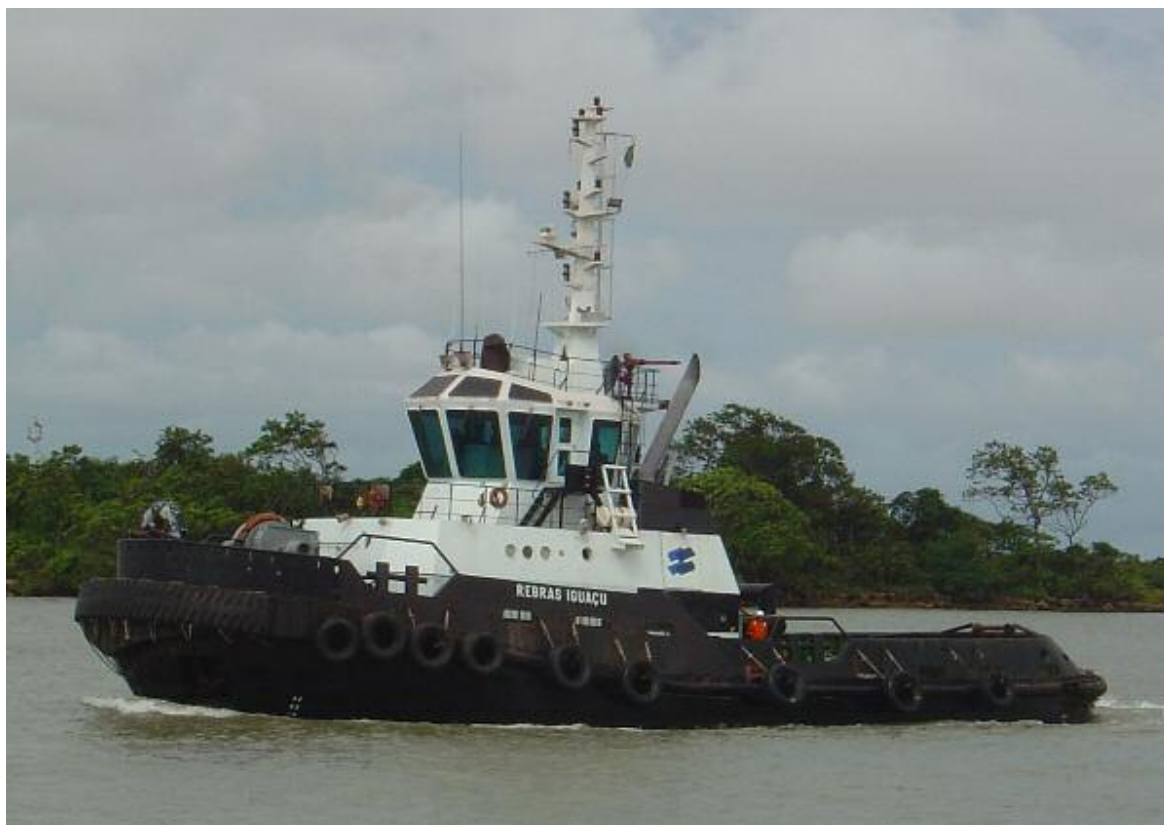
The REBRAS IGUAÇU seen in Brazilian waters