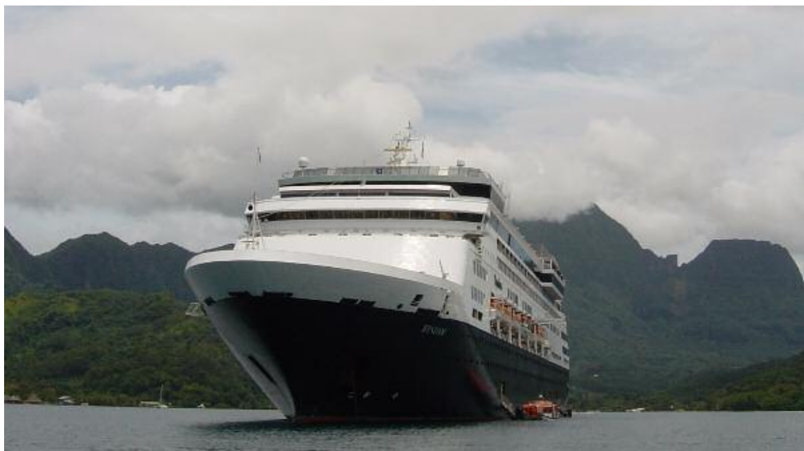
The RIJNDAM seen in Cook's Bay Moorea, French Polynesia.

De Japanse walvisvloot vertrok in november met zes schepen voor een half jaar durende jachtpartij. De Internationale Walvisvaartcommissie heeft de walvisjacht in 1986 verboden, maar voor Japan werd een uitzondering gemaakt waardoor het land walvissen mag vangen voor wetenschappelijke doeleinden. Critici stellen dat in werkelijkheid commerciële belangen meespelen, omdat het vlees van de gedode dieren verkocht wordt. Walvisvlees geldt in Japan als een delicatessen.