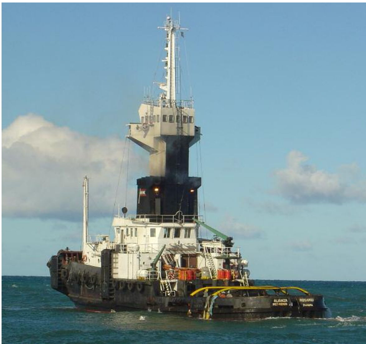
The tug ALIANZA ROSARIO

The compiler of the news clippings disclaim all liability for any loss, damage or exense however caused, arising from the sending, receipt, or use of this e-mail communication and on any reliance placed upon the information provided through this free service and does not guarantee the completeness or accuracy of the information. If you want to no longer receive this bulletin kindly reply with the word "unsubscribe" in the subject line.