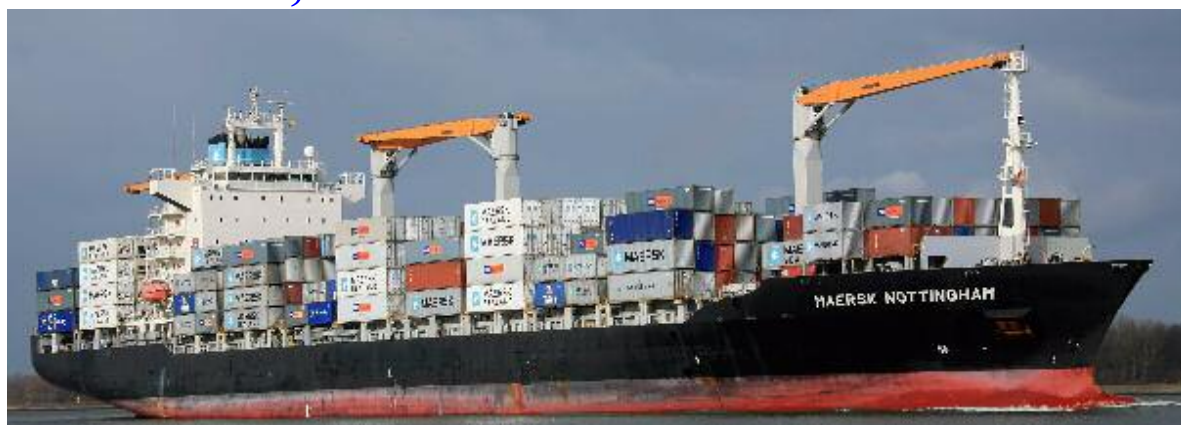
The Maersk Nottingham is the former P&O Nedlloyd Regina