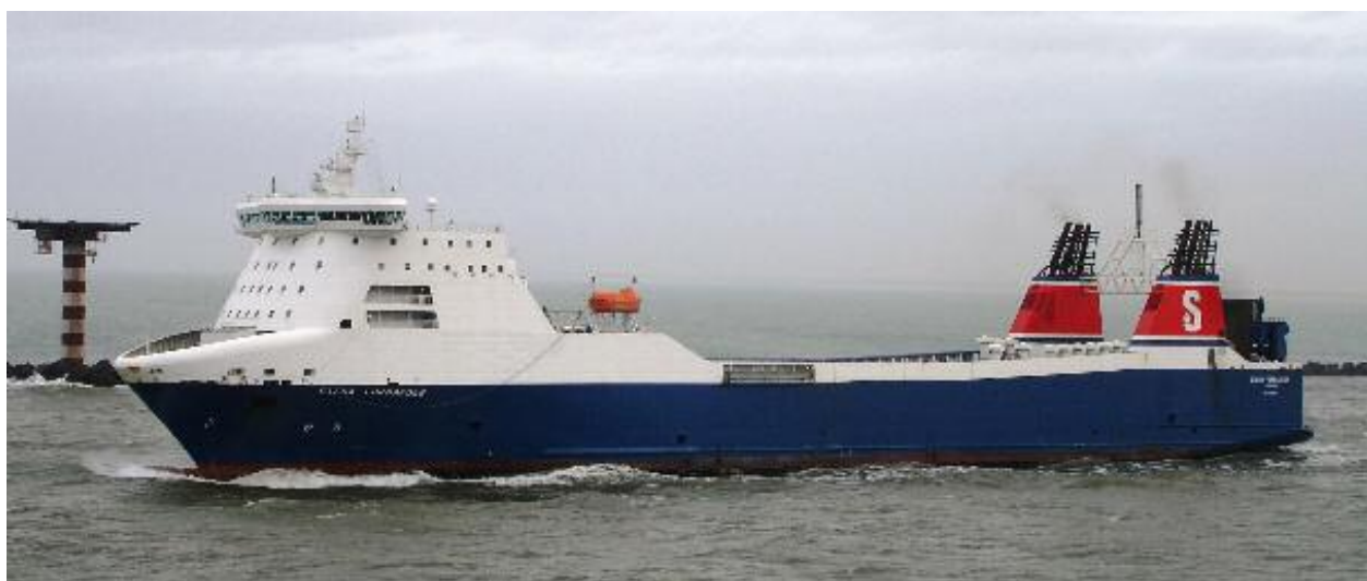
The STENA FORWARDER seen departing from Rotterdam.