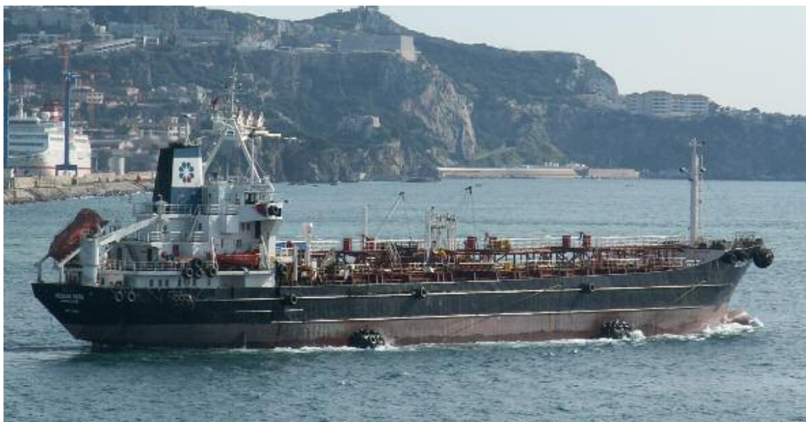
The AEGEAN ROSE seen in the bay of Gibraltar