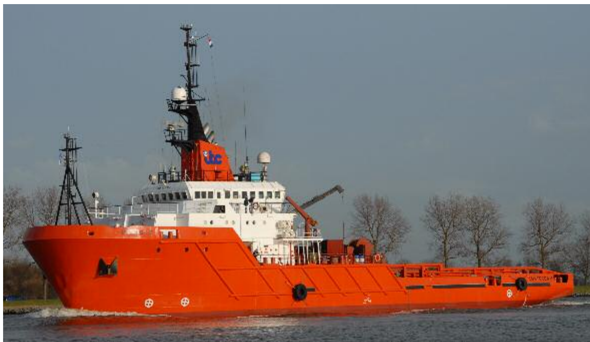
ITC's BOULDER seen departing from Shipdock in her new colours