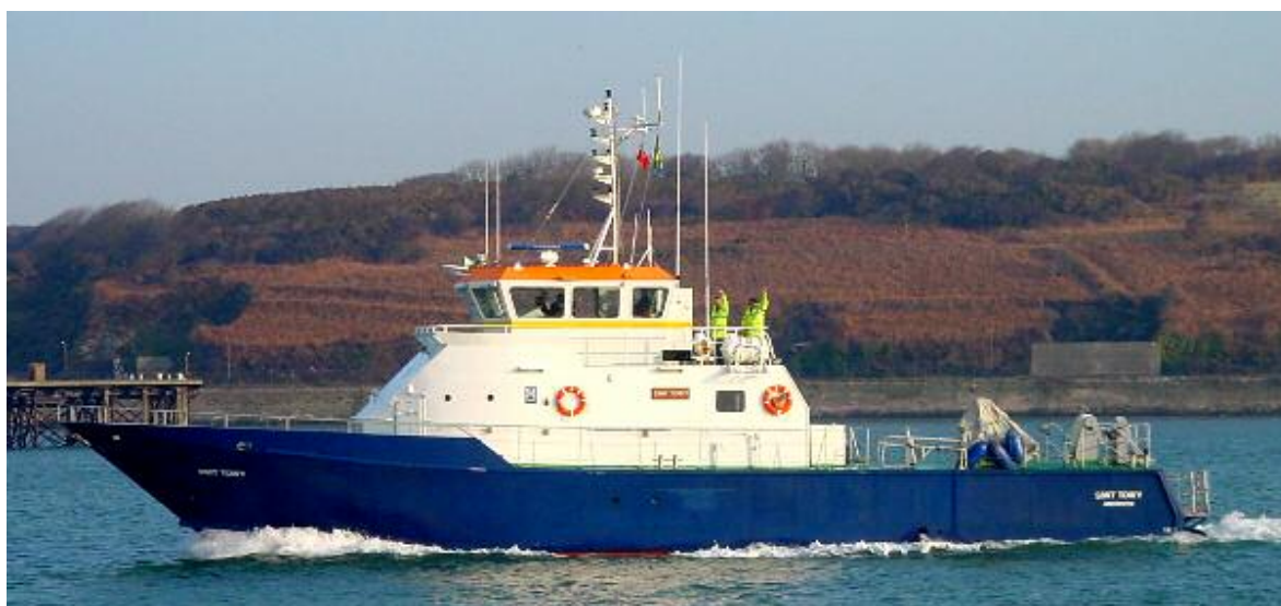
The SMIT TOWY seen in Milford Haven