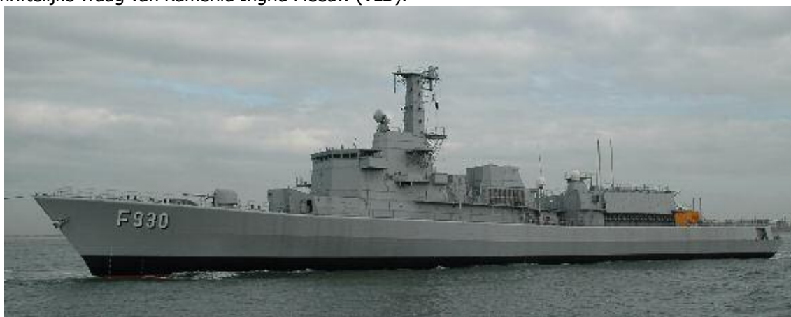
Boven : De Leopold I

De " Leopold I ", het eerste fregat dat België van de Nederlandse marine kocht, wordt op 29 maart geleverd. Het vaartuig zal in september 2008 volledig operationeel zijn. Dat heeft minister van Defensie André Flahaut geantwoord op een schriftelijke vraag van Kamerlid Ingrid Meeuw (VLD).