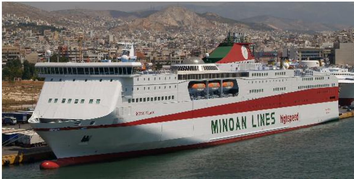
The KNOSSOS PALACE

The passenger ferry "Minoan Lines - Knossos Palace " suffered a four-metre hull tear early on Saturday morning during docking manoeuvres at Iraklio port on its arrival from Piraeus. The breach in the outer hull was about 2.5 metres above the water line. None of the 816 passengers on board were injured as a result of the impact with the pier.