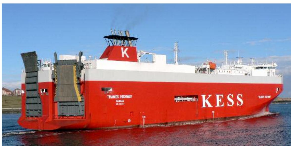
The THAMES HIGHWAY seen departing from the Tyne