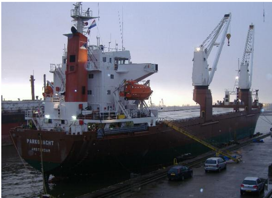
Spliethof's PARKGRACHT seen at Shipdock in Amsterdam, the vessel is sold and re-flagged to the Maltese flag, the new name is not yet painted on