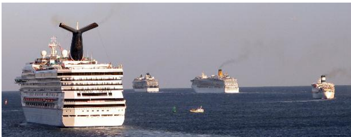
4 cruise liners seen departing from Fort Lauderdale (Florida) – Photo : Bill Hoey ©

It is estimated that the clearance of the ship's deck containers will take up to four weeks.