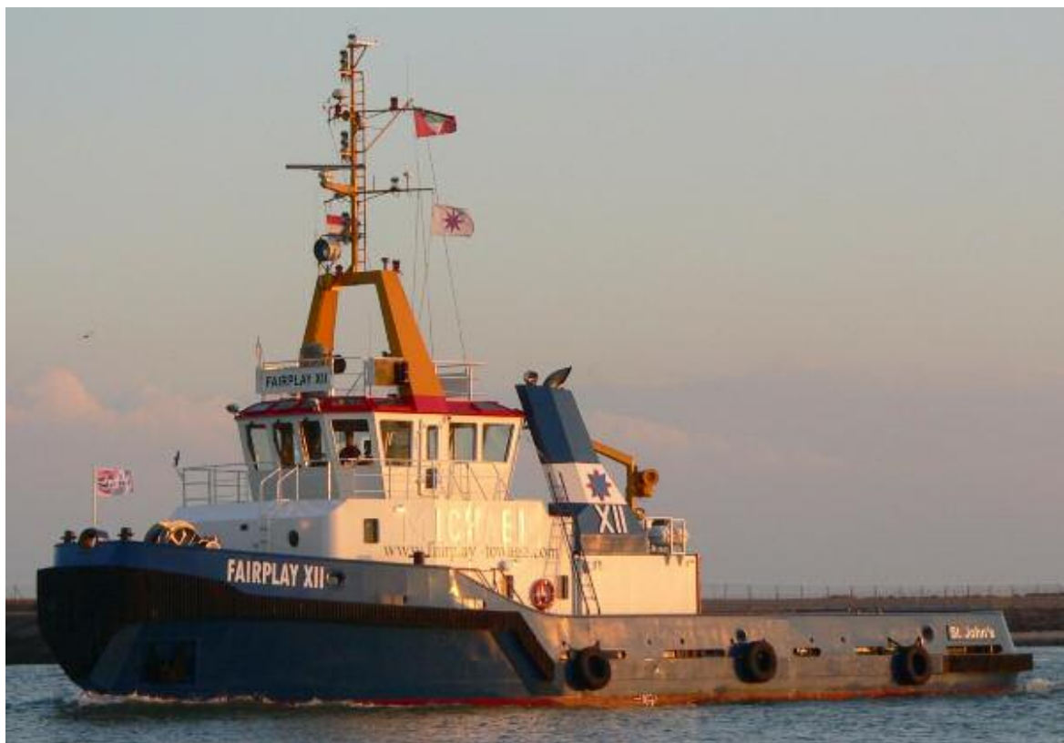
The FAIRPLAY XII seen in Rotterdam-Europoort