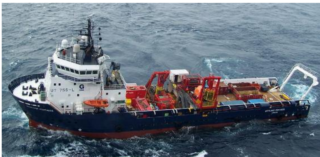
The HIGHLAND FORTRESS seen from the Solitaire Photo : Highland Fortress Bridge