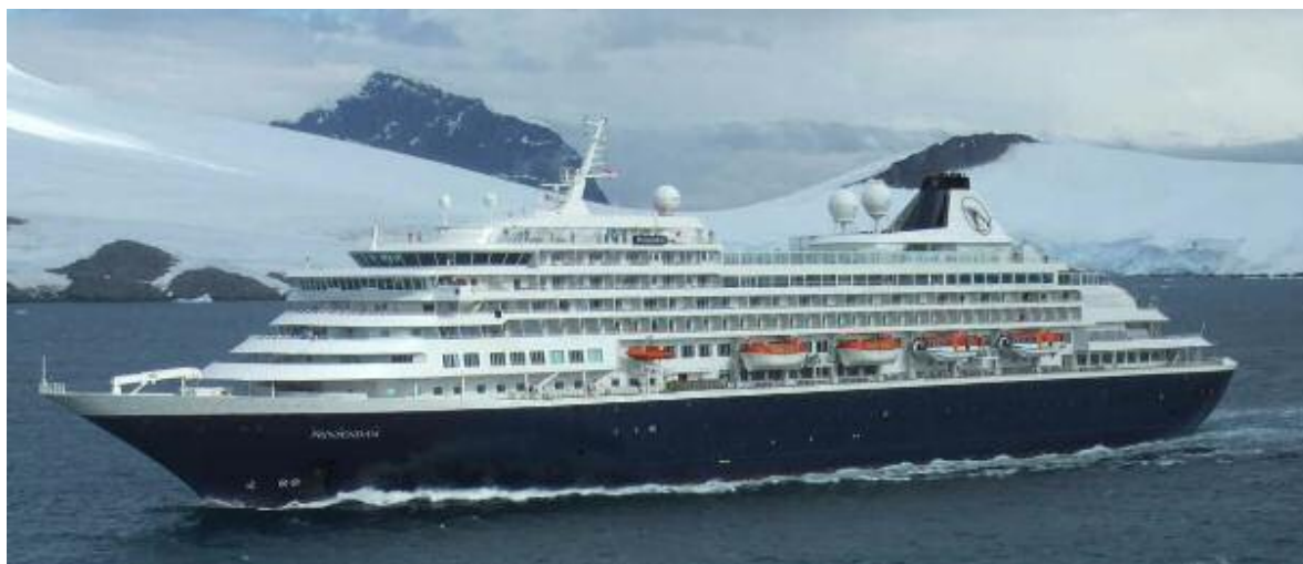
The PRINSENDAM seen cruising Antarctica