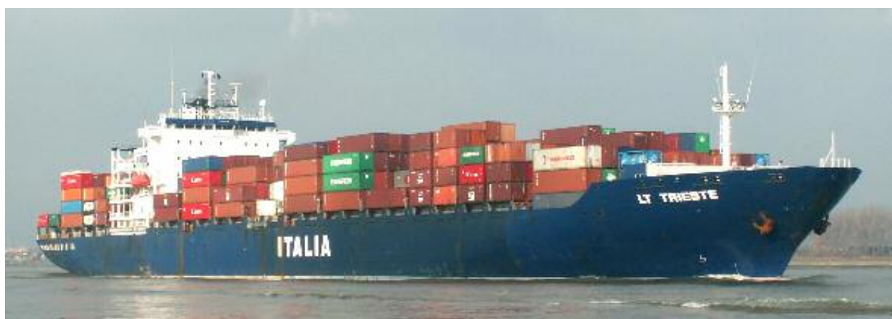
The LT TRIESTE seen arriving in the port of Rotterdam