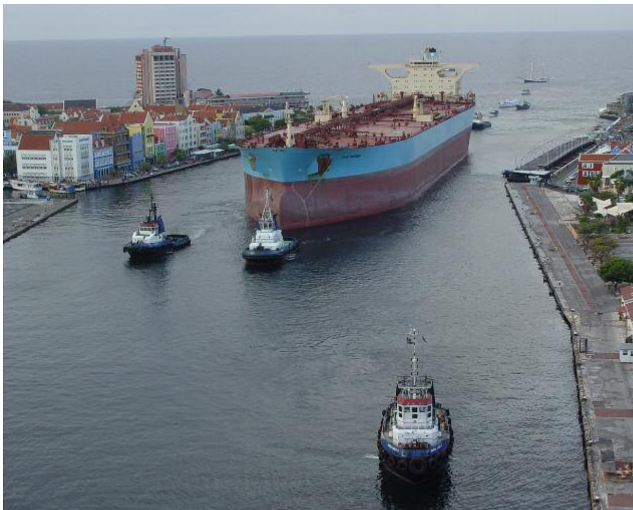
The Else Maersk entering the Port of Curacao assisted by the tugs of Curacao Towage Company

The compiler of the news clippings disclaim all liability for any loss, damage or exense however caused, arising from the sending, receipt, or use of this e-mail communication and on any reliance placed upon the information provided through this free service and does not guarantee the completeness or accuracy of the information. If you want to no longer receive this bulletin kindly reply with the word "unsubscribe" in the subject line.