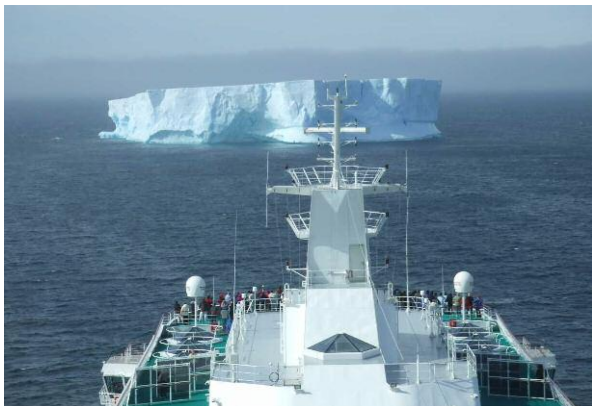
The CRYSTAL SERENITY seen approaching an iceberg in Antarctica.

This case qualifies for tax sparing relief to the said bank under Article 22(4) of the agreement for the Avoidance of Double Taxation inked between Pakistan and Netherlands. Since the clause 72(i) and exemption granted pursuant to it, constitutes a special incentive measure designed to promote economic development, the "profit on debt" qualifies for tax sparing credit set forth in Article 22(4), sources added.