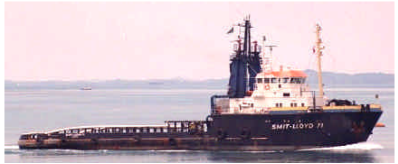
Top : The SMIT LLOYD 71 departing from Singapore for a casualty.