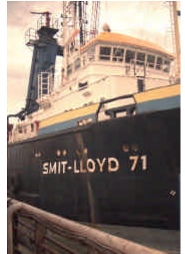
Left & right : The SMIT LLOYD 71 in drydock in Singapore after she had a tree "log" in the propeller in the Straits of Malacca.

When SMIT LLOYD was sold to SEACOR Smit Singapore kept the management of the vessel, even when the vessel was sold to NOMIS Shipping, who is the current owner of the vessel.