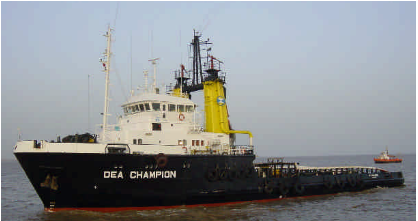
Top : The DEA CHAMPION working offshore Dahej (India)

The DEA CHAMPION started her life as the SMIT-LLOYD 71 , she was build at the Merwede Shipyard in Hardinxveld Giessendam during 1980.