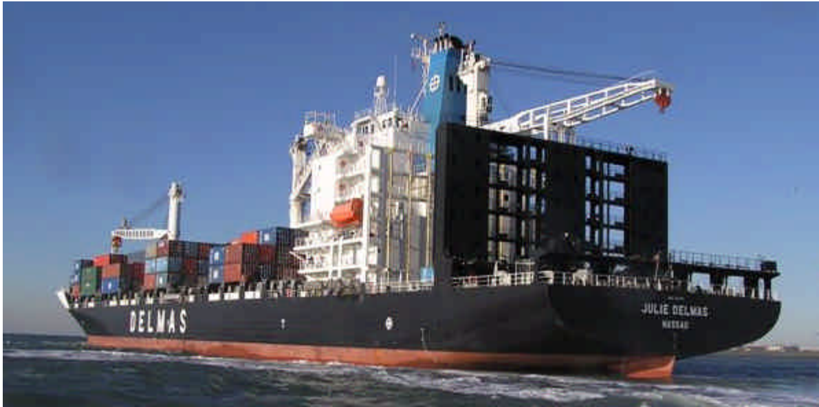
The JULIE DELMAS seen here at Flushing pilot station outward bound