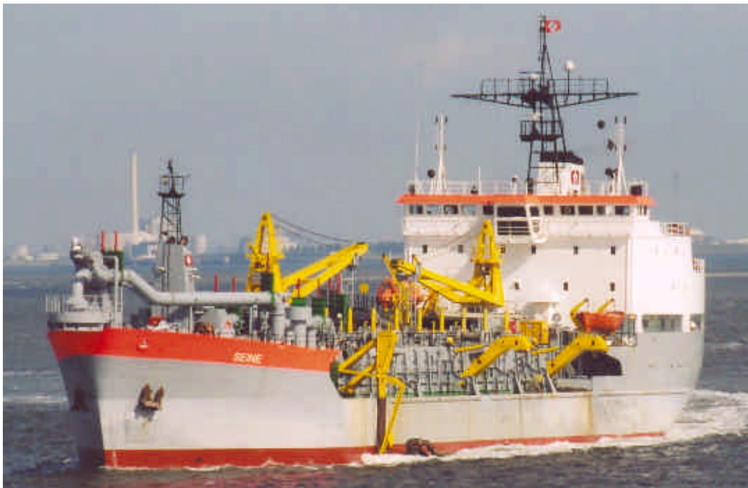
The trailer suction dredger SEINE operating at the Westerscheldt river