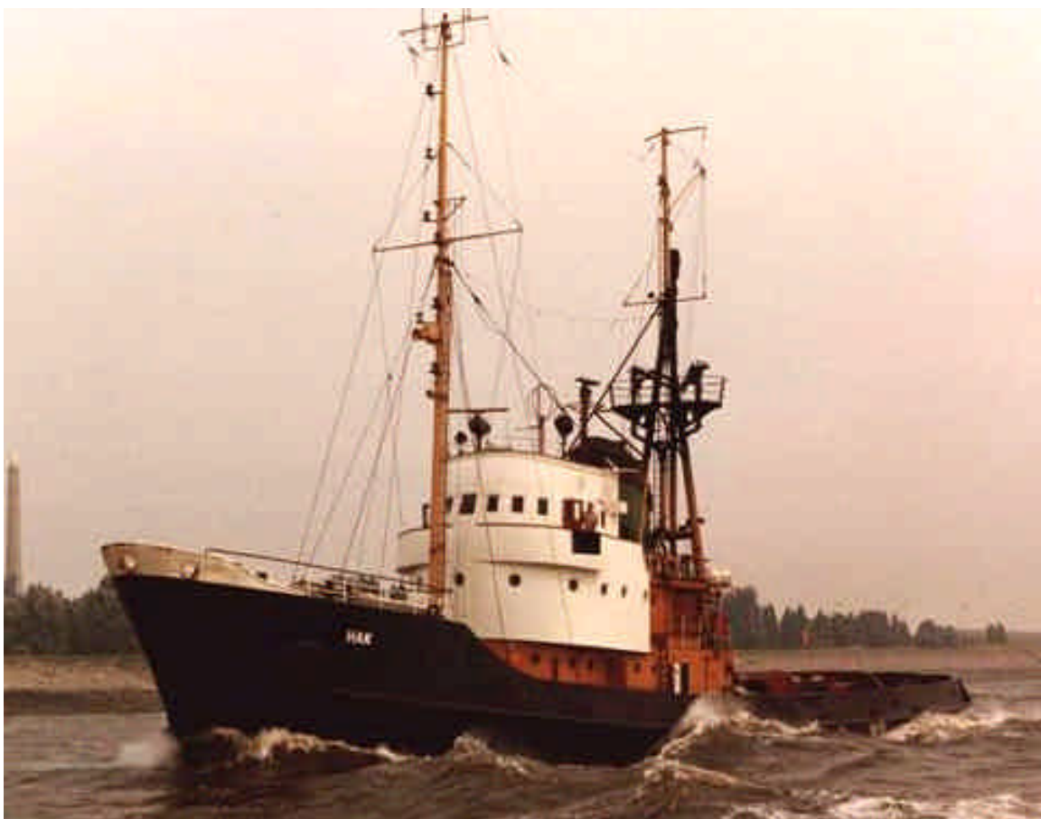
The HAK is the former SCALDIS

The HAK was original build as the tug HERMES in 1954 , she sailed under this name until 1975 when she was renamed SCALDIS , in Februari 1983 she was renamed in HAK and the new owner became a company from Nigeria and was brought under the Panamanian flag.