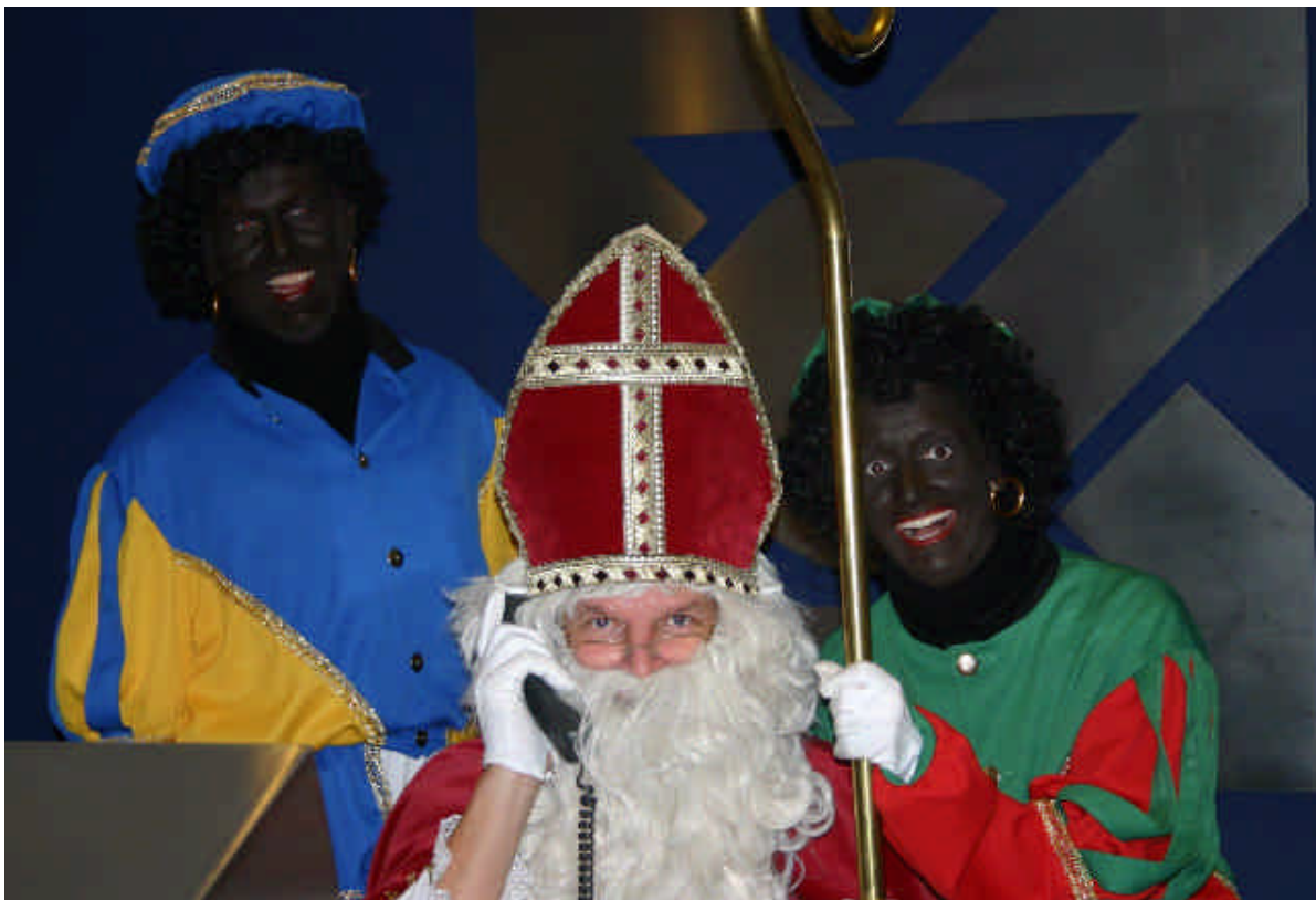
Prior his departure from Holland back to Spain Sinterklaas visited the SMIT office in Rotterdam with 2 Zwarte Pieten.