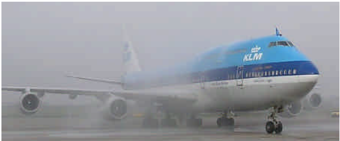
PH-BUN / GL-JK (cn 21660) The Fire department Shower with the arrival of the last KLM flight with the CLASSIC Boeing 747-200 ANTHONY H.G.FOKKER on December 3 rd .