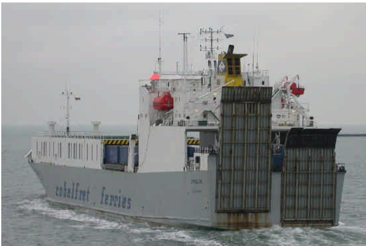
Cobelfret CYMBERLINE outward bound at the Westerscheldt river