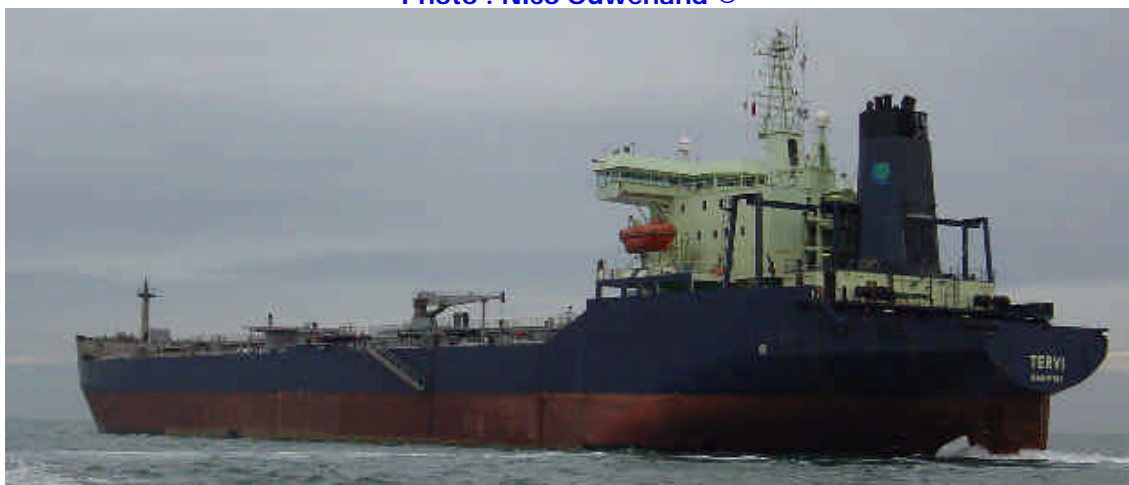
The Finnish tanker TERVI outward bound at Maas Pilot station