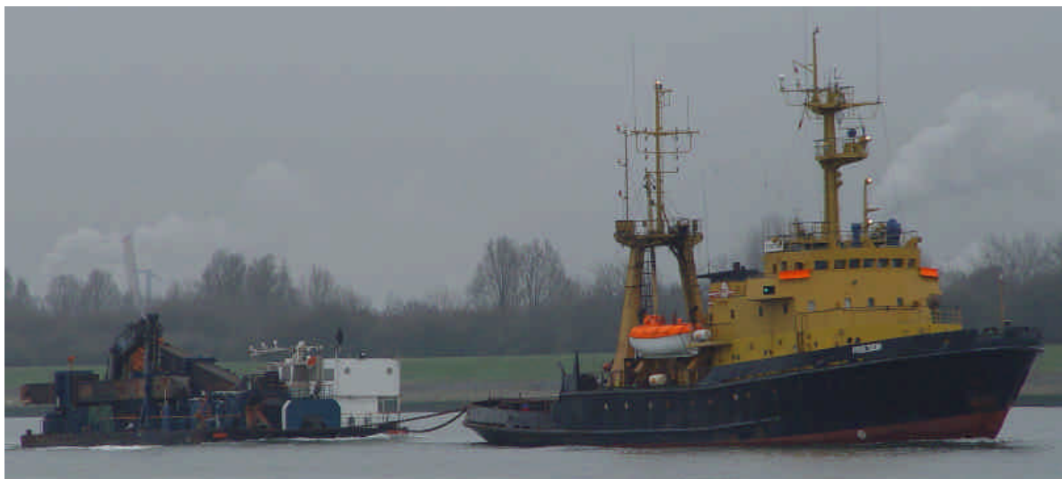
The Polish tug POSEJDON departed from Rotterdam with a small barge