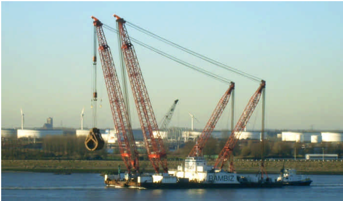
The RAMBIZ returned in Rotterdam under tow of the BEVER assisted on the river by the Texelbank