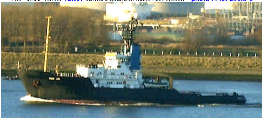
The HUA AN arrived in Rotterdam to collect the TOGMOR for Port Fourchon.