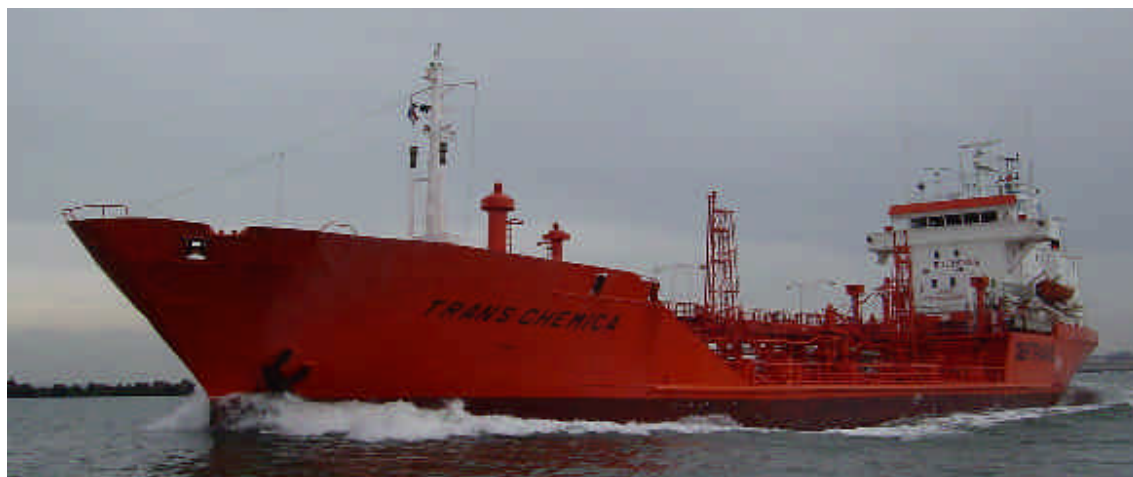
The TRANS CHEMICA outward bound from Rotterdam — photo : Piet Sinke ©