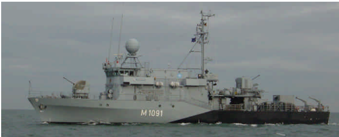
The German minehunter M 1091 KULMBACH outward bound at Maas Pilot station