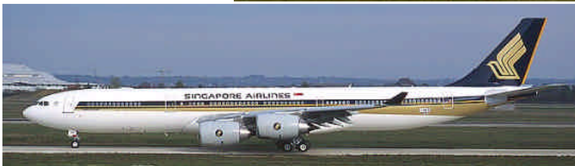
The brandnew Singapore Airlines Airbus A 340-541 (9V-SGB) seen here on taxiway at Toulouse, for his 1st flight November 15 th .