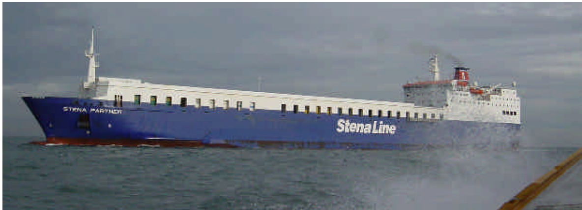
The STENA PARTNER outward bound from the Europort