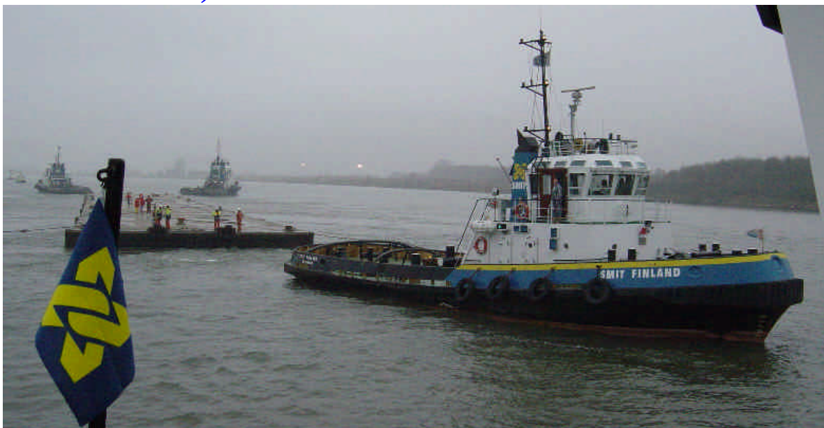
Last Saturday the 5 th element of the Dordtse Kil tunnel was transported from Barendrecht to the construction site where the element was submerged during Sunday.