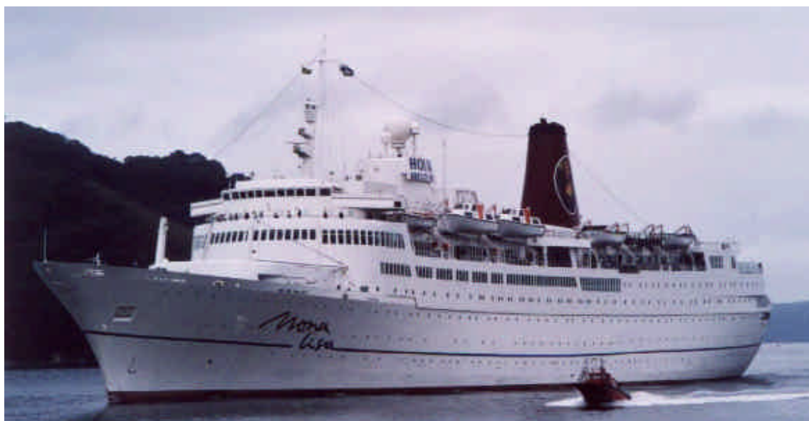
Cruise ship M/V Mona Lisa - C6RU6 - 28.891 grt - arrived in Santos November 30 th

The tug HERKLULES is enroute Rotterdam with the shoalbuster ' Amstelstroom ' The transport arrived Kiel Holtenau for daylight passage Kiel Canal Wednesday eta HvH Friday morning weather pending