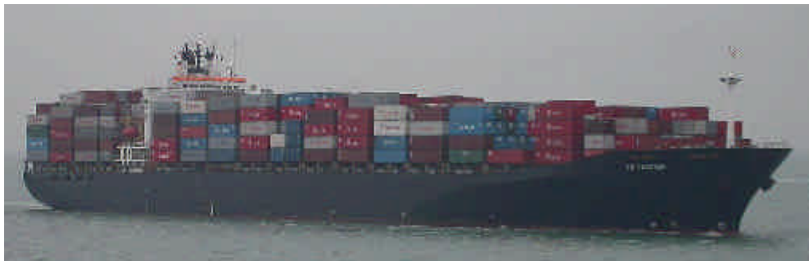
The YM YANTIAN at the Flushing pilot station – photo : Willem Kruit ©