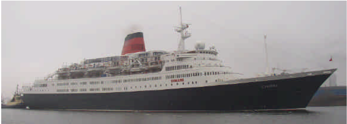
The CARONIA was the last cruise vessel for this season entering Amsterdam