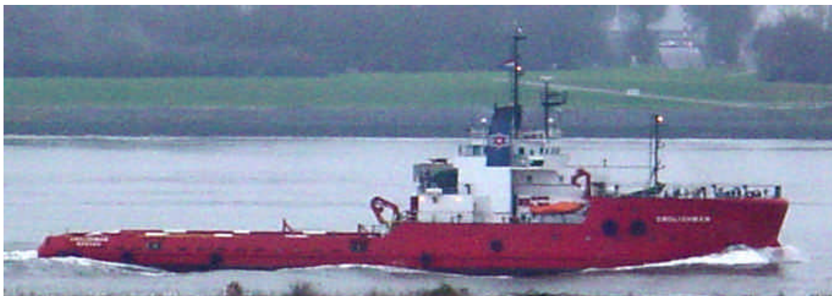
The ENGLISHMAN departed from Rotterdam