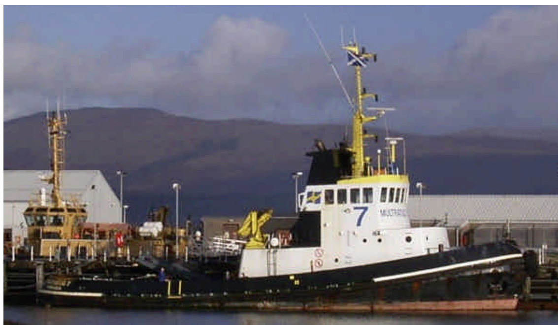
The MULTRATUG 7 arrived in Greenock, Note the SCOTTISH flag in the mast of the vessel