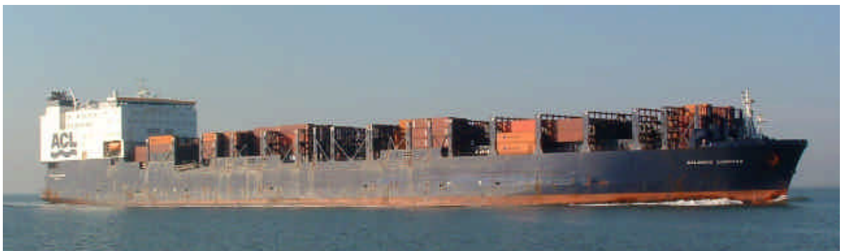
The ATLANTIC COMPASS inbound bound for Antwerp