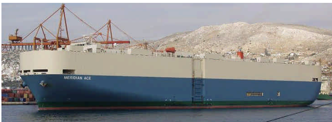
Vehicle carrier MV MERIDIAN ACE , Panama flagged, built in 2000, 55878 gross tonnage. In photos, as seen Nov 15th outbound Piraeus Greece.