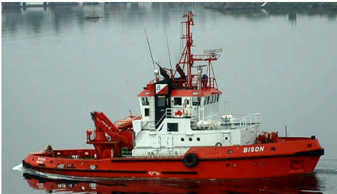
The tug Norwegian tug BISON