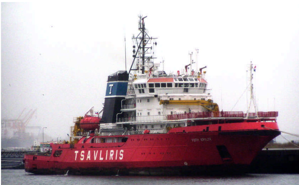
The TSAVLIRIS tug FOTIY KRYLOV moored in Flushing