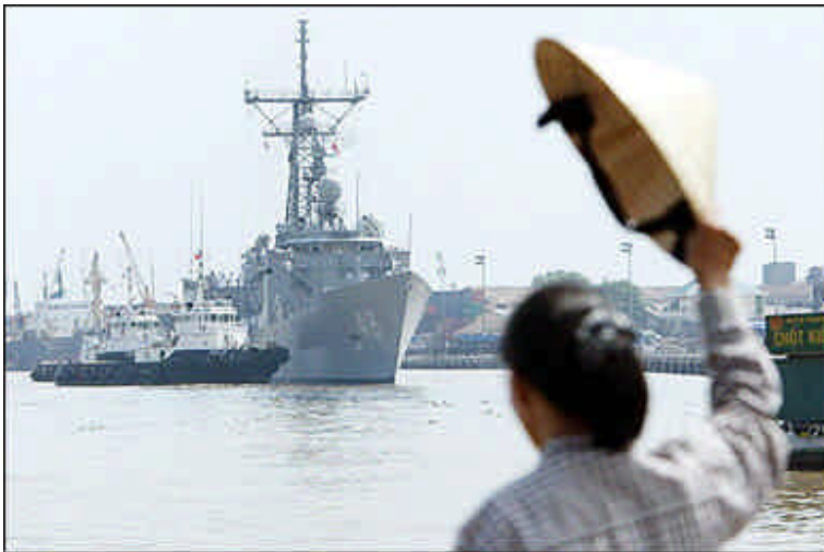
A Vietnamese woman waves at the visiting US Navy frigate USS Vandergrift as it arrives. Nearly 30 years after the Vietnam War ended, the frigate is the first US war ship to dock in Ho Chi Minh City.