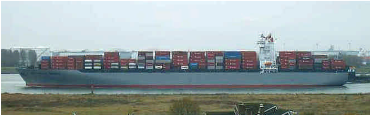
The ROTTERDAM BRIDGE arrived in Rotterdam