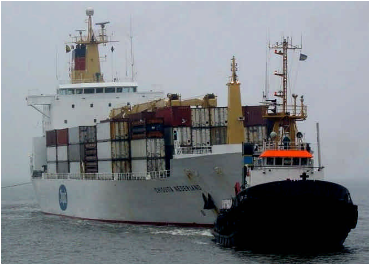
The CHIQUITA NEDERLAND was delivered by the tug FOTIY KRYLOV at the Westerscheldt River and taken over by local tugs for further transportation