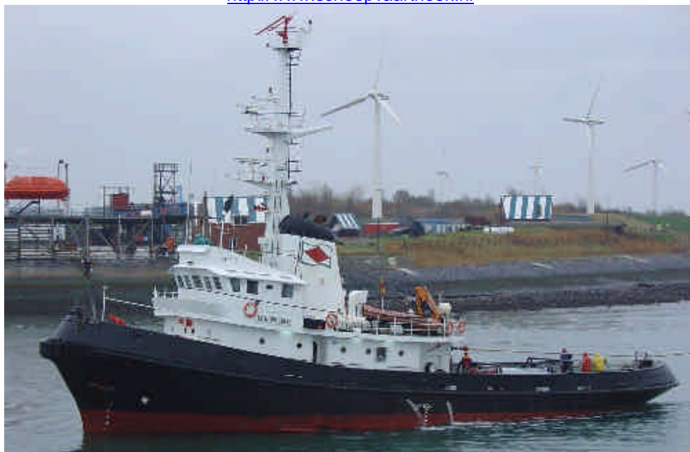
The tug FACAL DIECISIETE arriving in Flushing