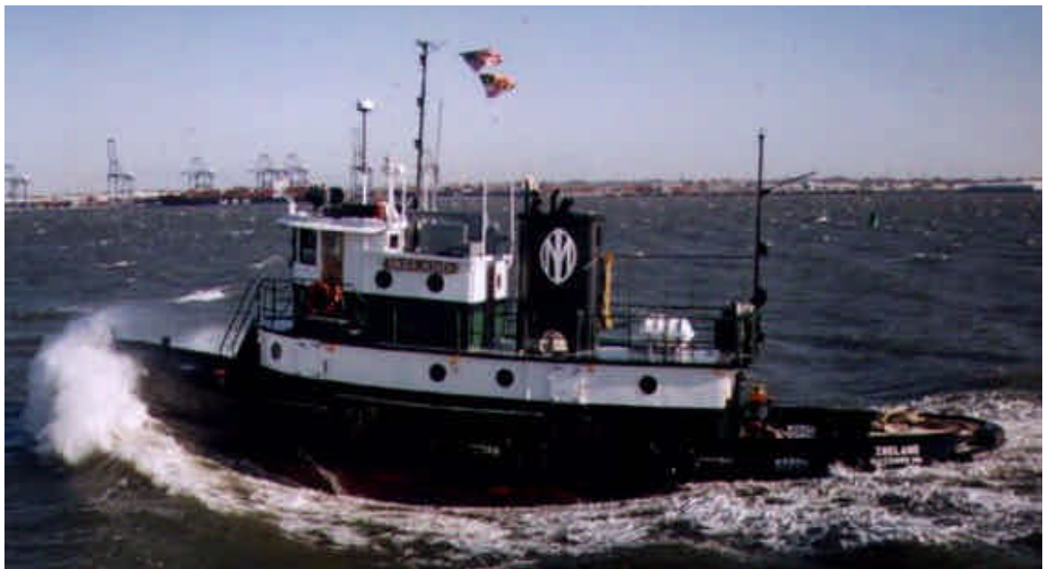
The tug IRELAND working in the port of Baltimore