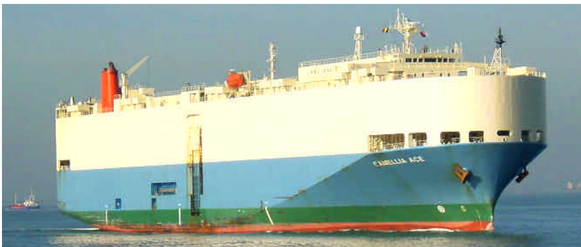
The CAMILLIA ACE at the Westerscheldt river enroute Gent