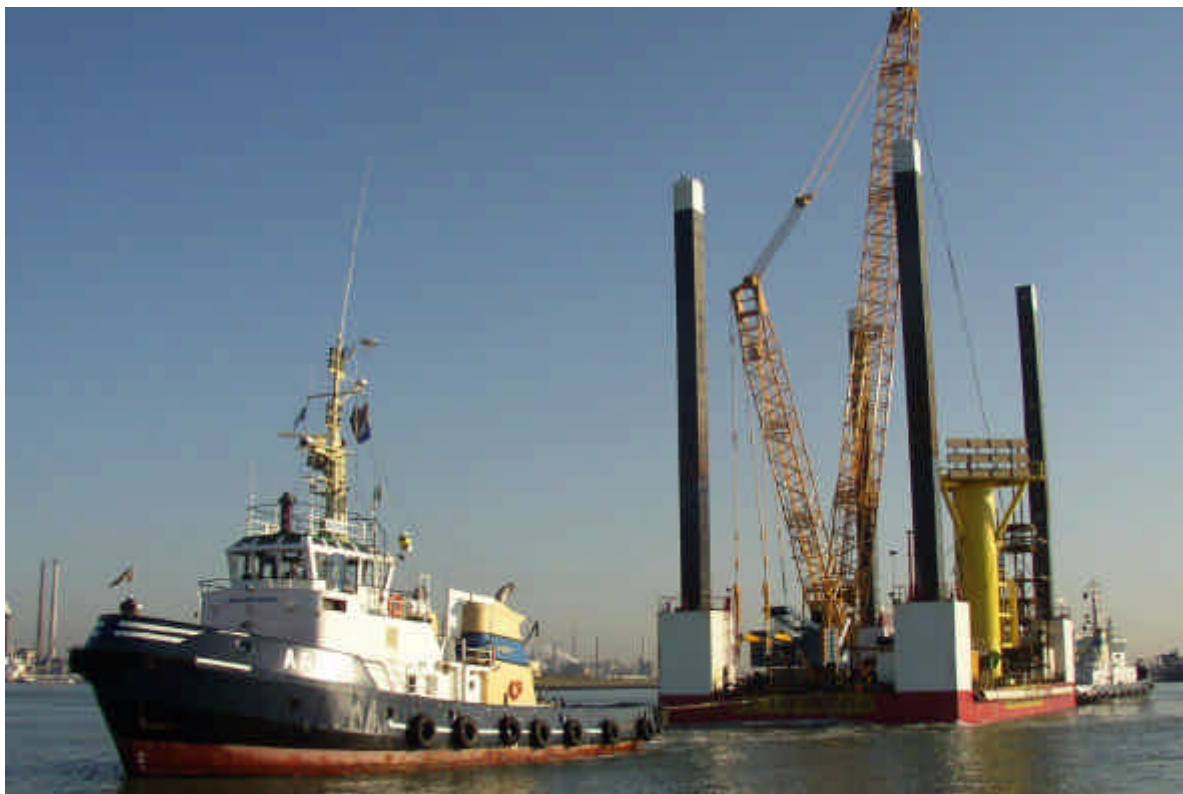
The ZEEBOUWER departed from IJmuiden to install a pole offshore IJmuiden which will measure the current and the waves, this in view of a new to build windmill farm.