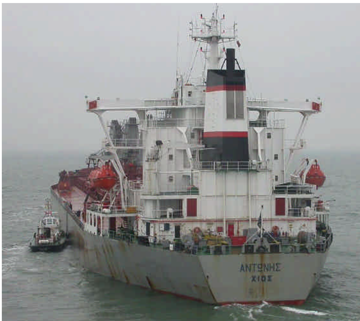
The Greek ANTONIS disembarking the pilot at Flushing pilot station – photo : Willem Kruit ©