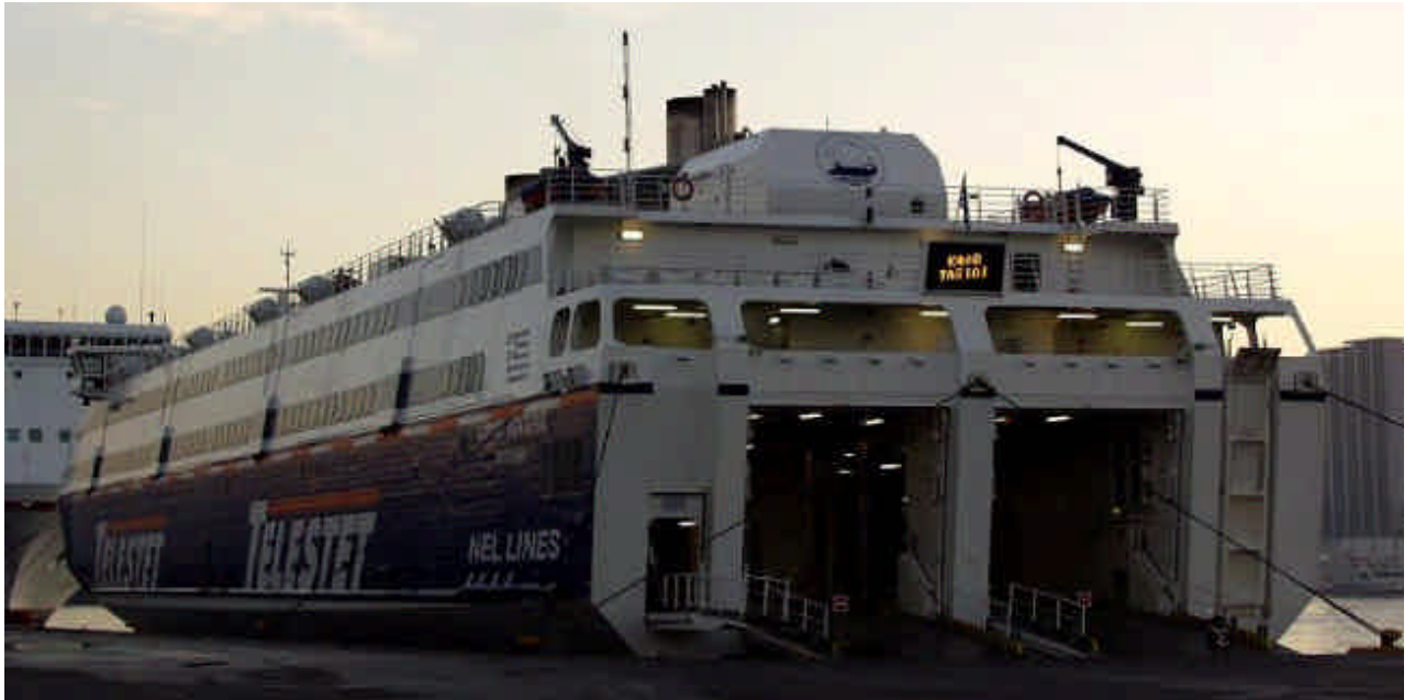
Roro passenger ferry AEOLOS KENTERIS in service between Piraeus and Chios - Mytilene islands in Greece, seen during sunset at Oct 31st 2003 at Piraeus harbour