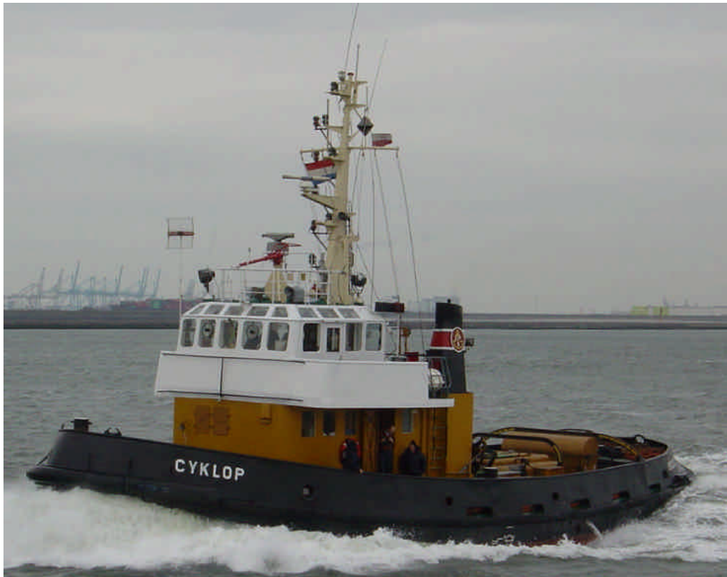
The Polish Tug CYKLOP at Hook of Holland Sunday morning – photo : Piet Sinke © ( Thanks Peter !!! )