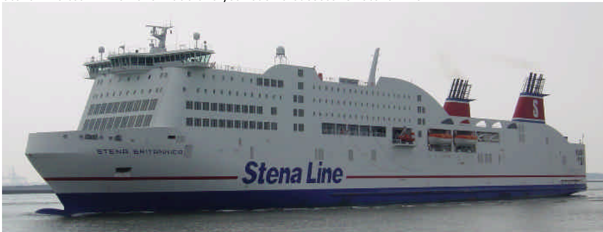
Top : The STENA BRITANNICA arriving in Hook of Holland

"We are delighted to have received these honours. It is a great credit to the hard work of the whole Stena Line team who have made this year such a success for Stena Line.