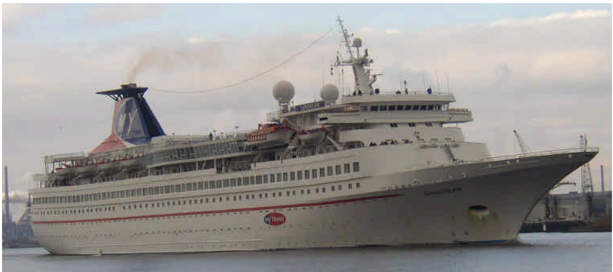
MY TRAVEL's SUNDREAM arrived in Amsterdam as one of the last passengerliners for this season