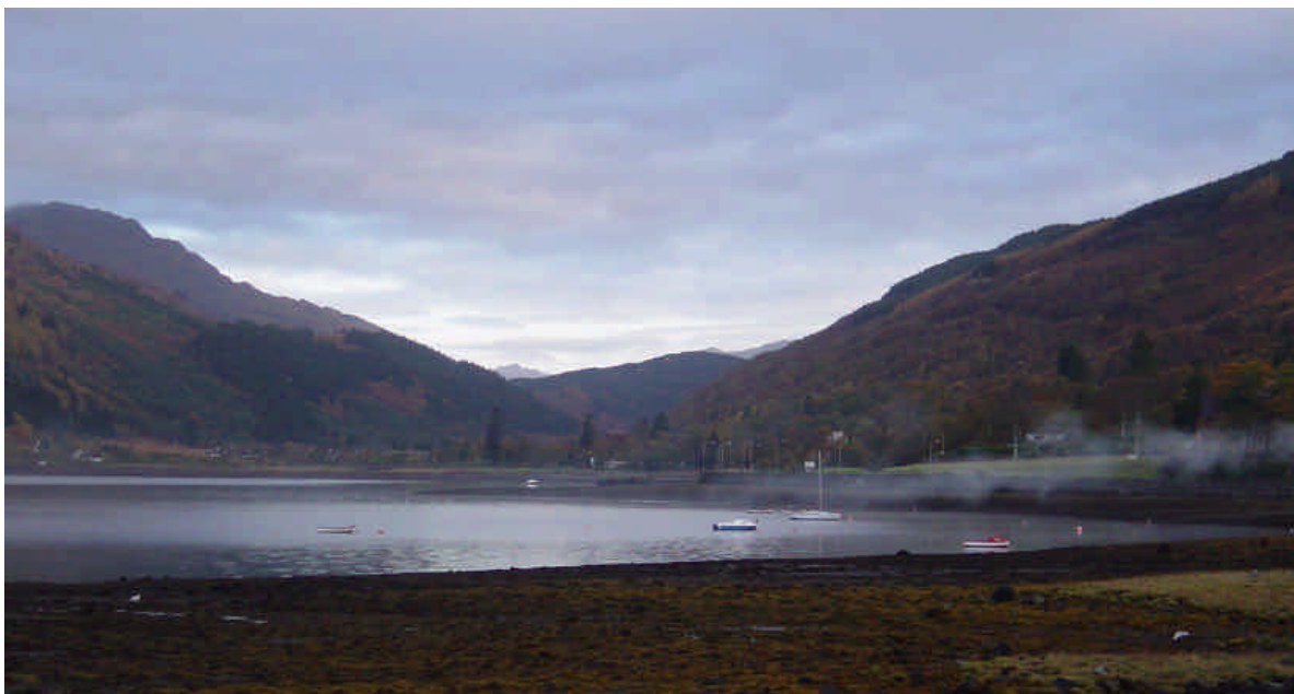
Early morning over Loch Lomond (Scotland)