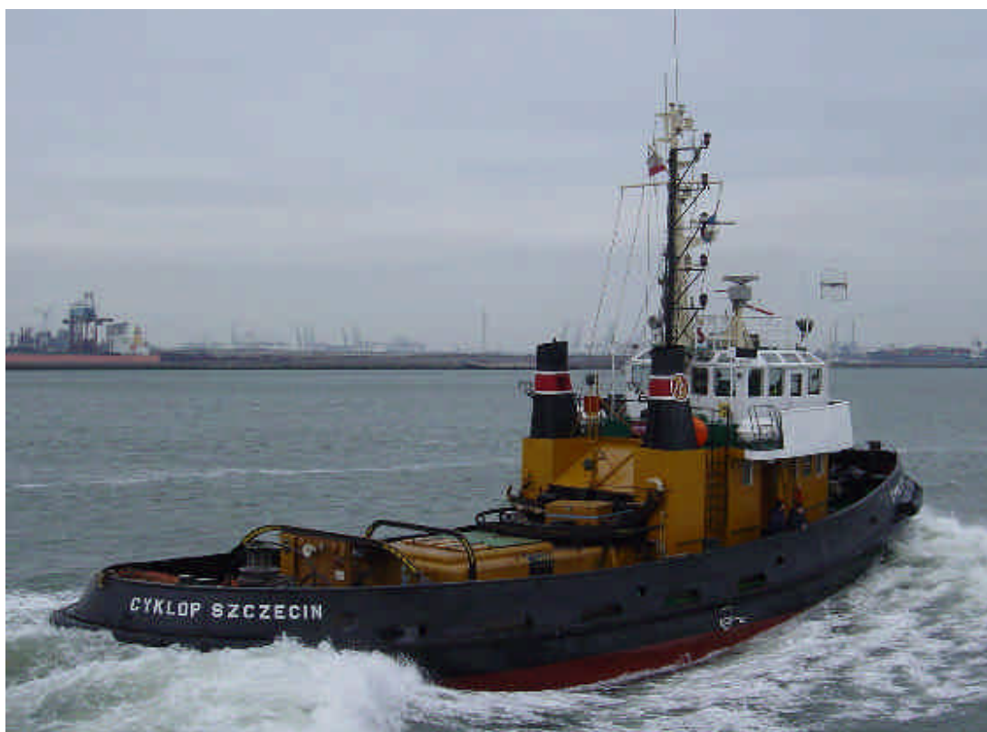
The polish tug CYKLOP outward bound at Hook of Holland.