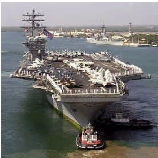
USS Nimitz (CVN 68) and her embarked Air Wing, Carrier Air Wing Eleven (CVW-11) pull into Naval Base Pearl Harbor, Hawaii as they return from deployment in support of Operation Iraqi Freedom