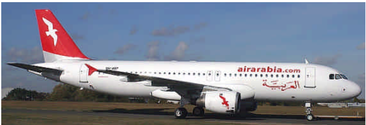
9H-ABP (A6-ABY) seen for the first time on roll out from Air Livery. Due to based at Sharjah.