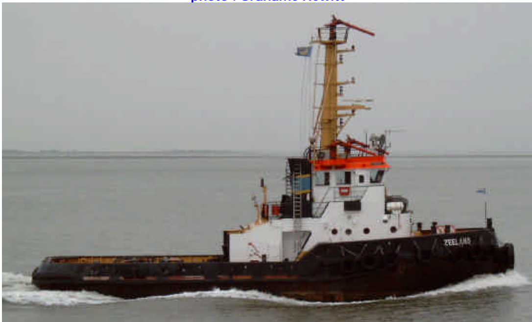
The tug ZEELAND operating at the Westerscheldt River