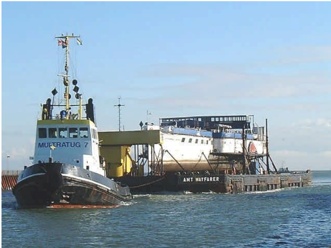
The MULTRATUG 7 with the AMT WAYFARER loaded with the Ex Humber paddle ferry TATTERSHALL CASTLE arriving at Great Yarmouth