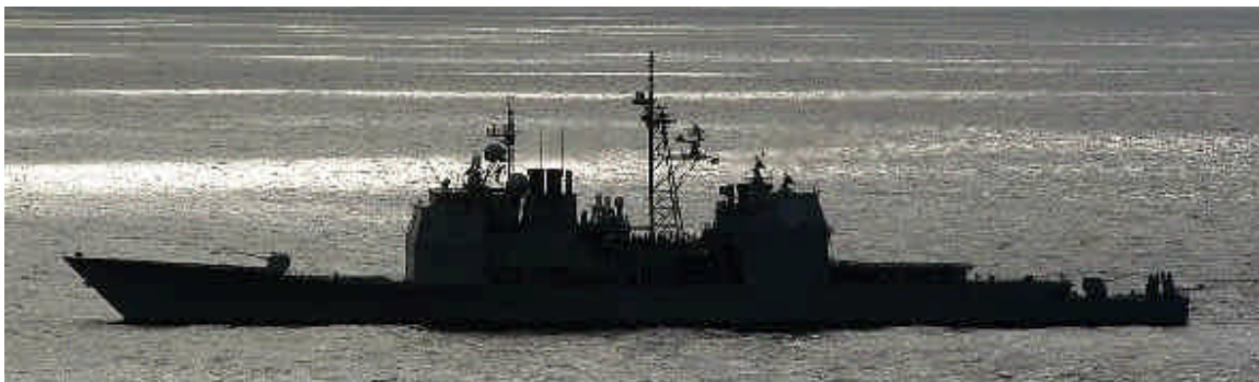
The guided missile cruiser USS Vella Gulf (CG 72) is conducting the Tailored Ship's Training Availability (TSTA) exercise in the Atlantic Ocean