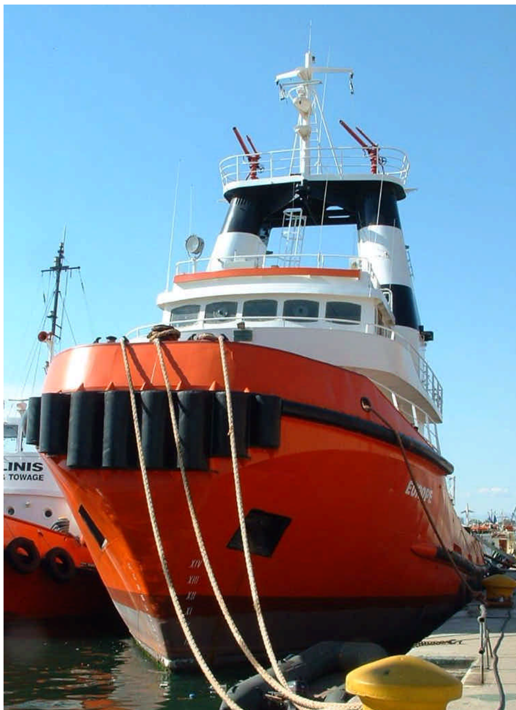
Seen at Thessaloniki in Greece October 9th the tug EUROPE , this tug is the former Italian tug NETTUNO SECUNDO from PALERMO – photo : Cees Kloppenburg ©