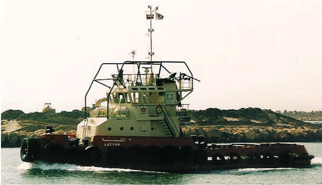
The 1996 Damen built tug LAYYAH operating in Sharjah port ( United Arab Emirates )