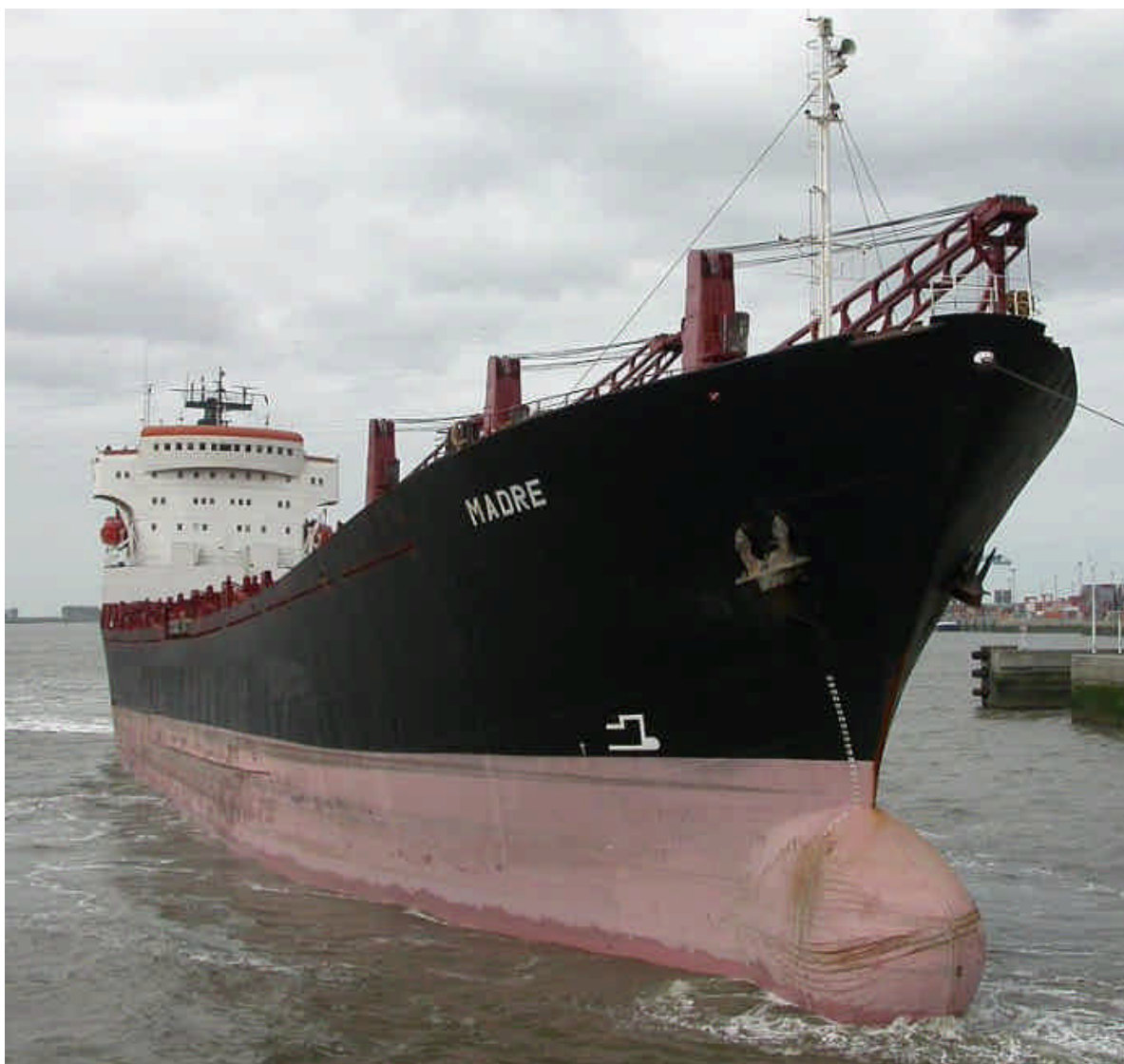
The MADRE ( former OTTO HAHN ) seen here passing the Antwerp locks – photo : Willem Kruit ©