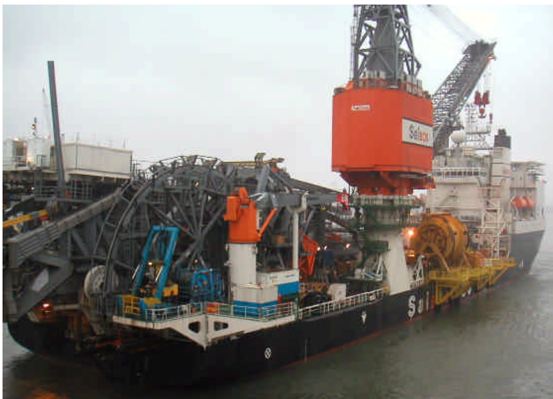
The SaiBOS FDS left the Wilheminahaven-Schiedam for her new assignment in Angola ( ExxonMobile Kizomba "A" - project to be followed by Kizomba "B" )

Photo : Alasdair McDiarmid - Master DSV Bar Protector ©