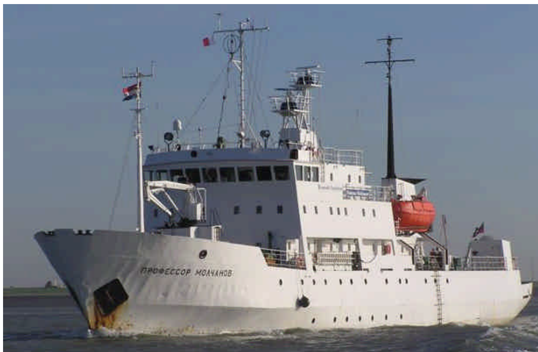
The PROFESSOR MOLCHANOV outward bound in Flushing — photo : Jamie Reurink ©

Photo : Alasdair McDiarmid - Master DSV Bar Protector ©