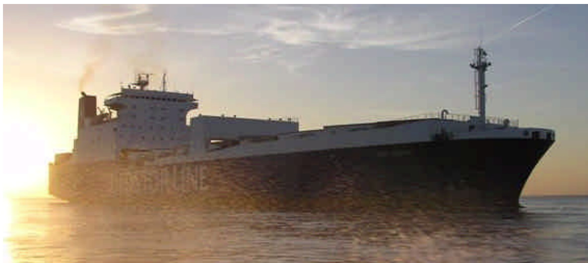
The TOR DANIA outward bound at Flushing pilot station