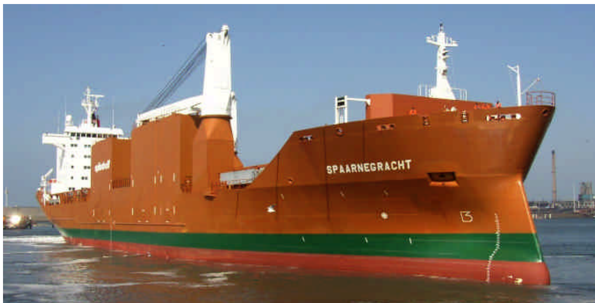
The SPAARNEGRACHT which visited the port of IJmuiden