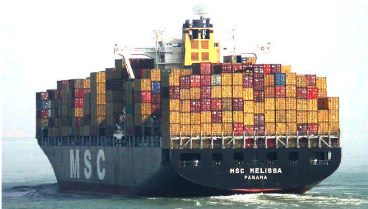
The MSC MELISSA seen at the Westerscheldt pilot station