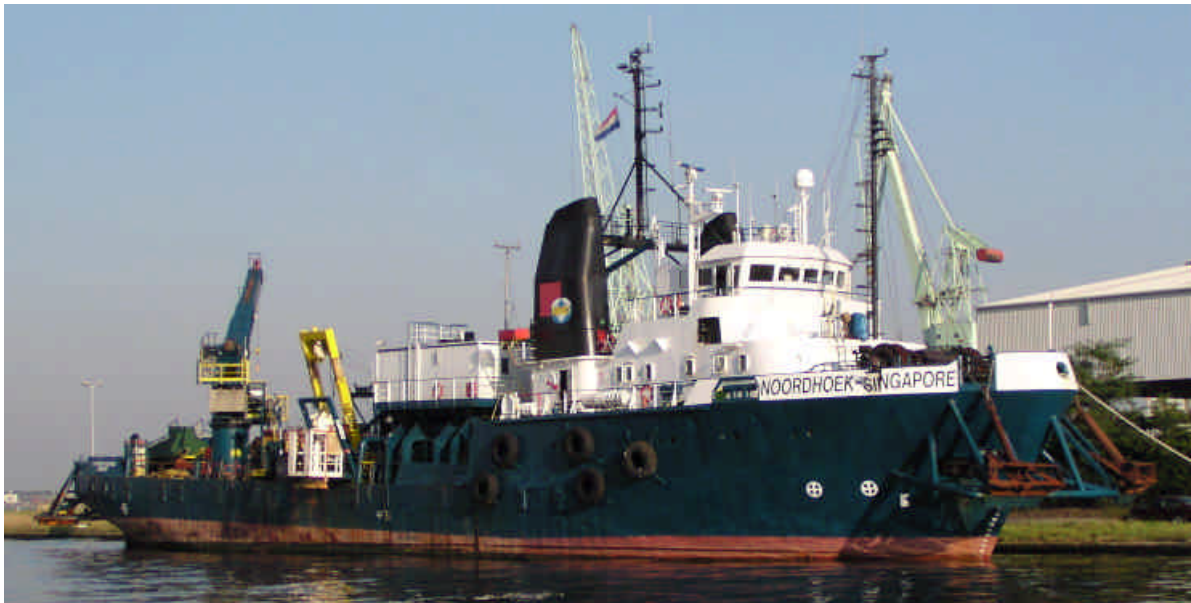
The NOORDHOEK SINGAPORE moored at Antwerp Ship repair