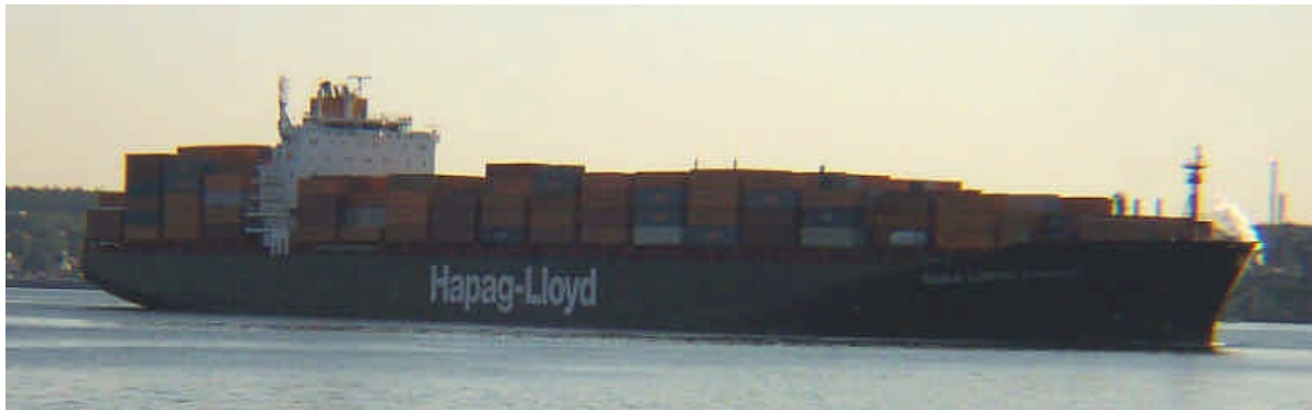
Top : The KUALA LUMPUR EXPRESS seen here departing from Halifax.