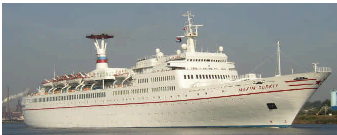
The MAXIM GORKIY arrived Monday in Amsterdam