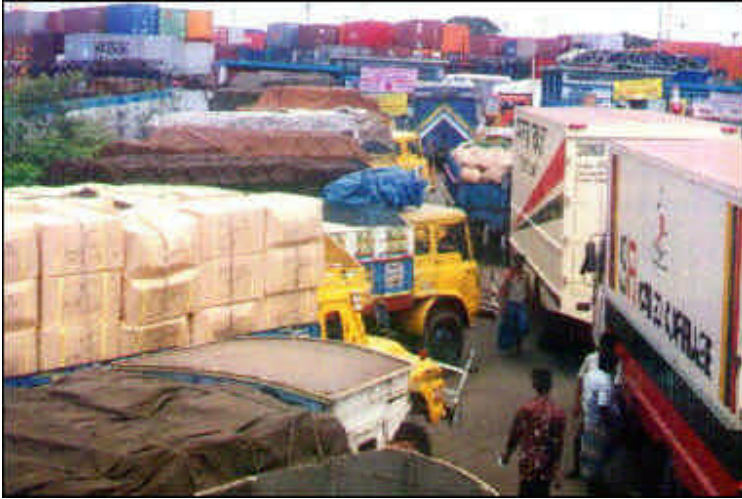
Bangladesh's Chittagong port resumed operations after being closed for 12 hours due to collisions between several vessels

Daewoo Shipbuilding shares fell as much as 4.1 percent to 13,000 won and traded at 13,200 won as of 11:06 a.m. in Seoul.