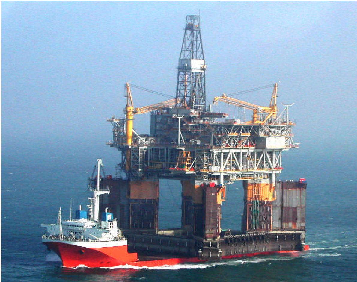
The MIGHTY SERVANT 1 with the KIZOMBA-A platform enroute Angola