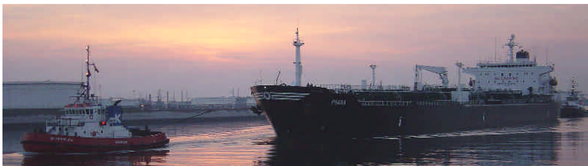
Top : The PSARA arrived in the Caland Canal