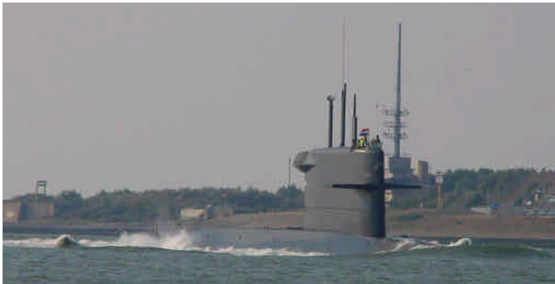
The Dutch submarine BRUINVIS (S 810) passing Hoek van Holland bound for Rotterdam to participate with the Wereldhavendagen