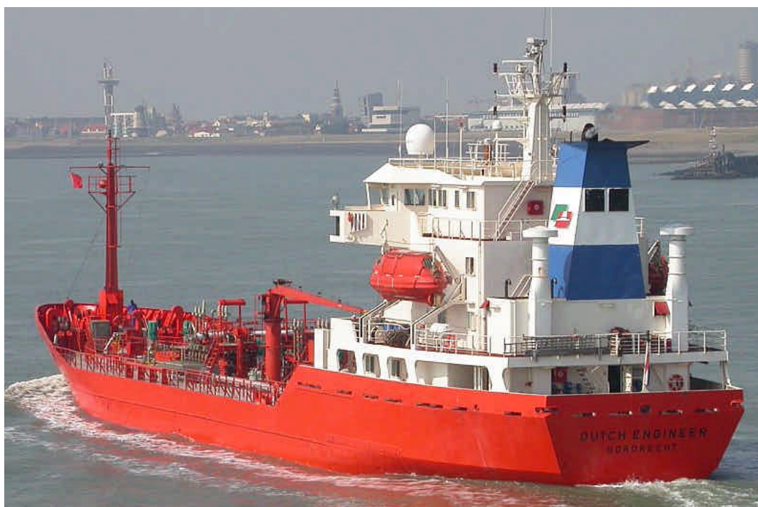
The DUTCH ENGINEER at Flushing pilot station outward bound

VLIERODAM, STRONG QUALITY IN LIFTING AND HOISTING EQUIPMENT.