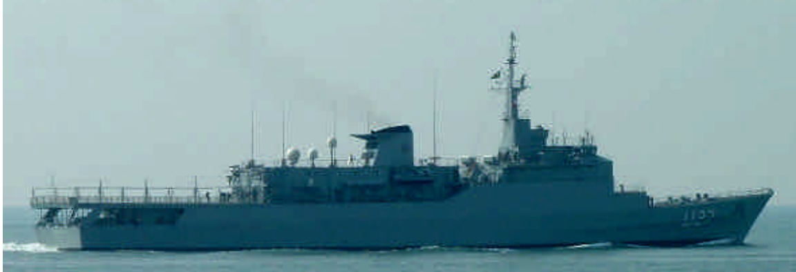
The Brazilian training frigate BRASIL (U27) seen here passing Flushing outward bound after the port visit to Antwerp.