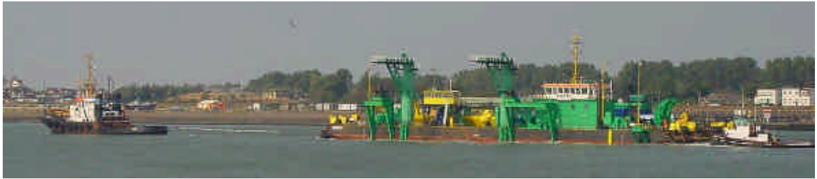
The FIGHTER departed with the MANTA from Rotterdam