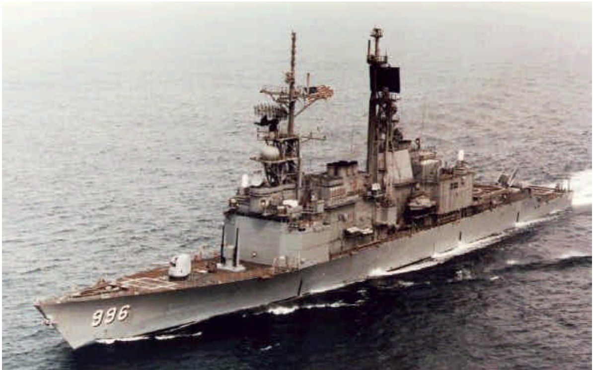
Top : The Kidd class destroyer USS CHANDLER (DDG 996) – photo : Coll. Piet Sinke ©

The Taiwanese navy announced that the a software upgrade and integration program for the combat system of the four Kidd-class destroyers it is buying from the US began on July 14.