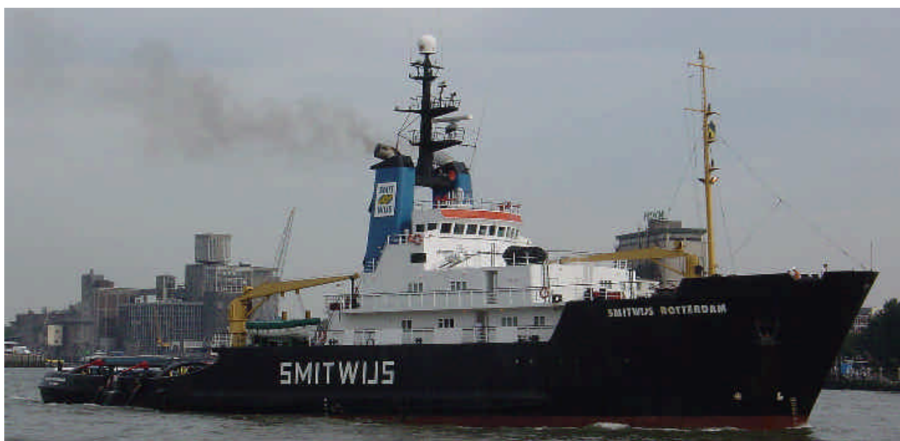
The SMITWIJS ROTTERDAM during the wereldhavendagen in Rotterdam