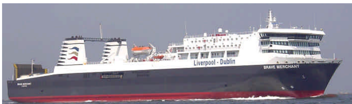
Top : The BRAVE MERCHANT

Telephone : (31) 10 - 453 03 77 Fax : (31) 10 - 453 05 24 E-mail : post@workships.nl Telex : 24390 wosh nl