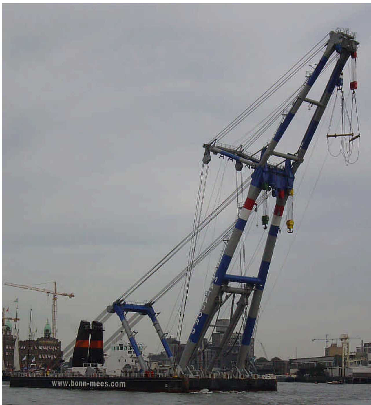
The latest addition to Bonn and Mees the MATADOR 3 seen here during the Wereldhavendagen 2003