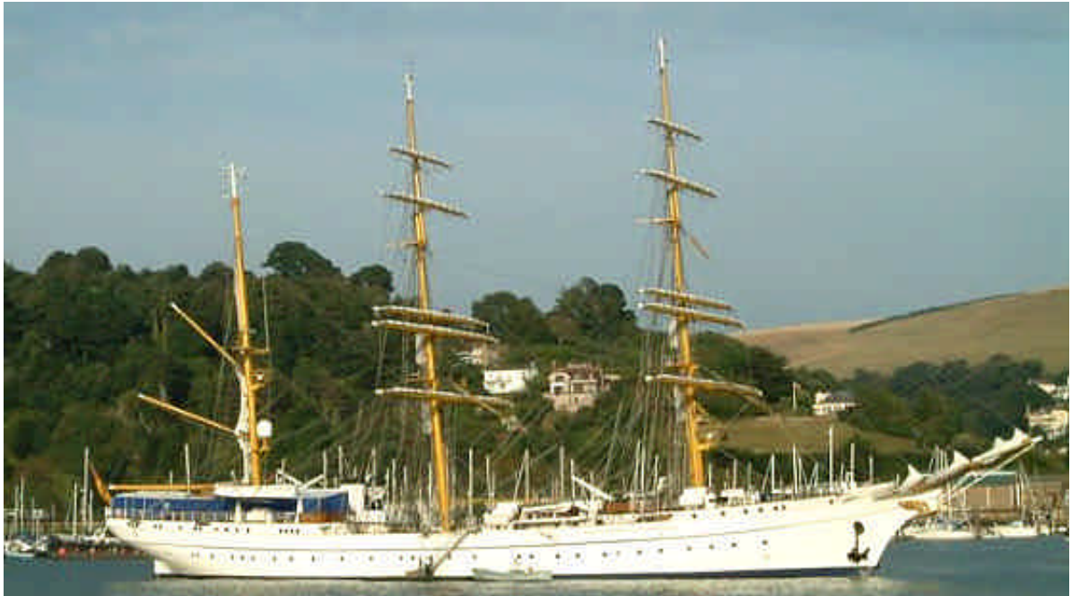
The German Sail trainings ship GORCH FOCK arrived Friday in Devon