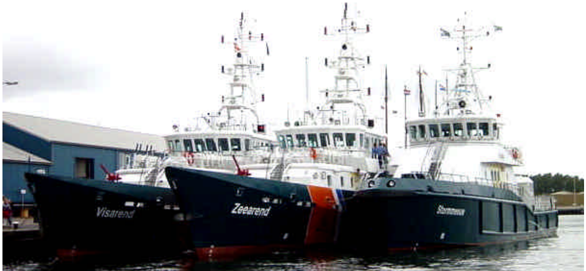
An unique picture of the three latest new vessels ( VISAREND , ZEEAREND and STORMMEEUW ) build for the Dutch customs moored together in Oudeschild at the island of Texel.