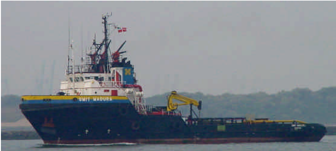
The SMIT MADURA arrived at the Waterweg bound for the Parkkade