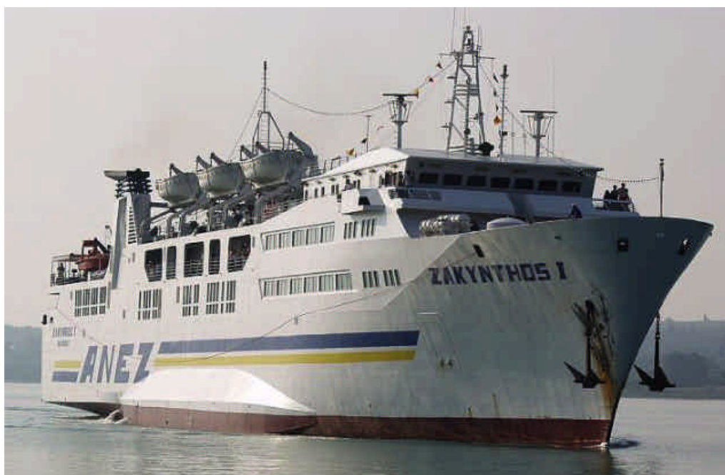
Roro passenger ZAKYNTHOS I , Greek flag, IMO 7320291, GRT 4328, built in 1973, radio callsign SW6516, as seen August 17th 2003, entering to Kilini port Greece.

The MSC CARLA is build at the Hitachi yard under number 4815 during 1986 under the name HANJIN LONGBEACH she was renamed in MSC CARLA during 2001, the 2668 TEU vessel has a DWT of 43.300 tons and has a length of 241 mtr , width of 32 mtr and a maximum draft of 11.7 mtr, the vessel is powered by a Sulzer diesel of 30.100 hp good for a speed of 24 knots