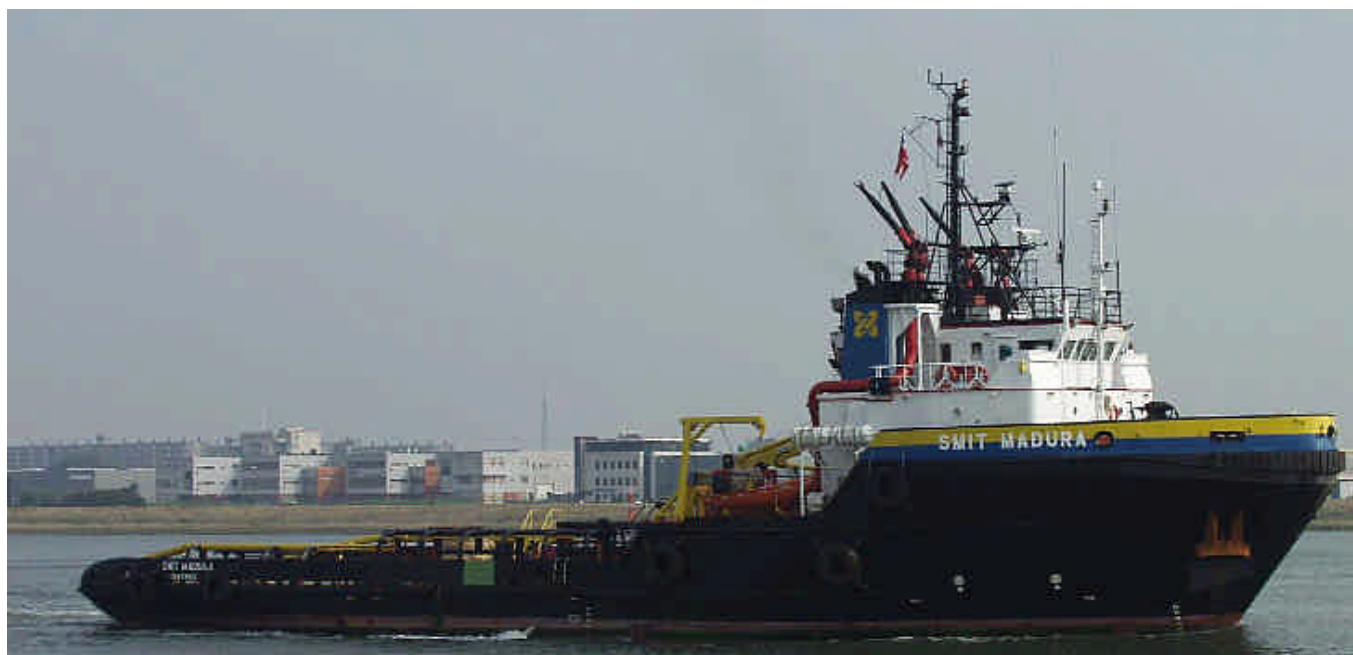
The SMIT MADURA arrived in Rotterdam from the Bahama´s