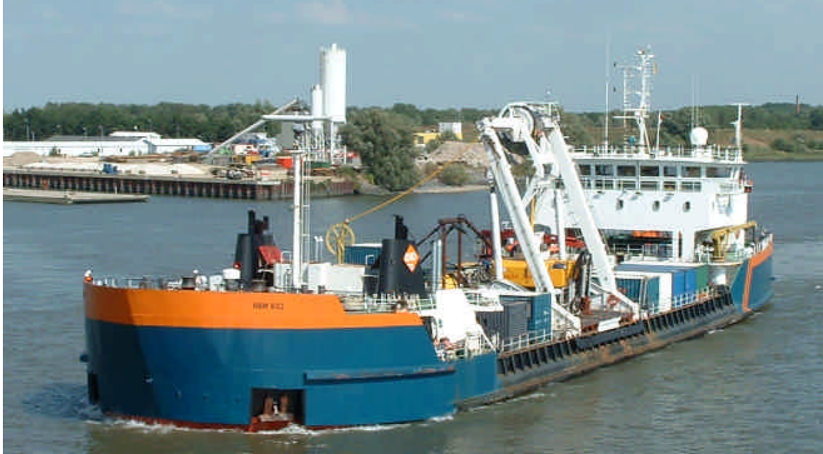
The HAM 602 passing Koedood outward bound