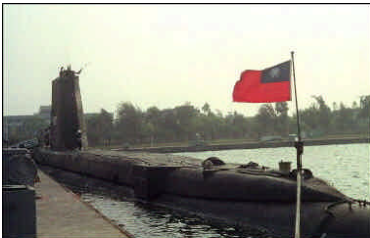
One of Taiwan's 50-year-old Guppy-class submarines. Taiwan has taken a critical step forward in its plans to acquire eight conventional submarines from the United States after paying three million dollars to kickstart the deal

These manoeuvres in Russia's Far East are the largest in five years. Over 68 ships and boats, 42 auxiliary vessels, 50 planes and helicopters , up to 30,000 servicemen and civil specialists will be engaged for the exercises. The official aim of the exercises is to polish methods of fighting against terrorism, fend against piracy and protection of biological resources (the scale of poaching is immense in the Far East, it is quite obvious).