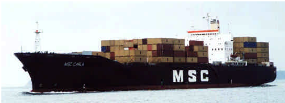
The MSC CARLA arrived in Santos

The OTTON was build during 1974 under yard number 240 at the Matsuura Tekko yard in Japan, under the name SEA NEPTUNE , she sailed under this name until 1977 when she was renamed in RIBUT until 1991, the she got the name ALBUQUERQUE and this year she was renamed OTTON , the vessel is flying the Colombian flag and is at present home ported Barranquilla , the vessel measures a gross tonnage of 447 ton, length 39 mtr , width 9.4 mtr and is powered by 2 Fuji diesels with a total output of 3828 Kw