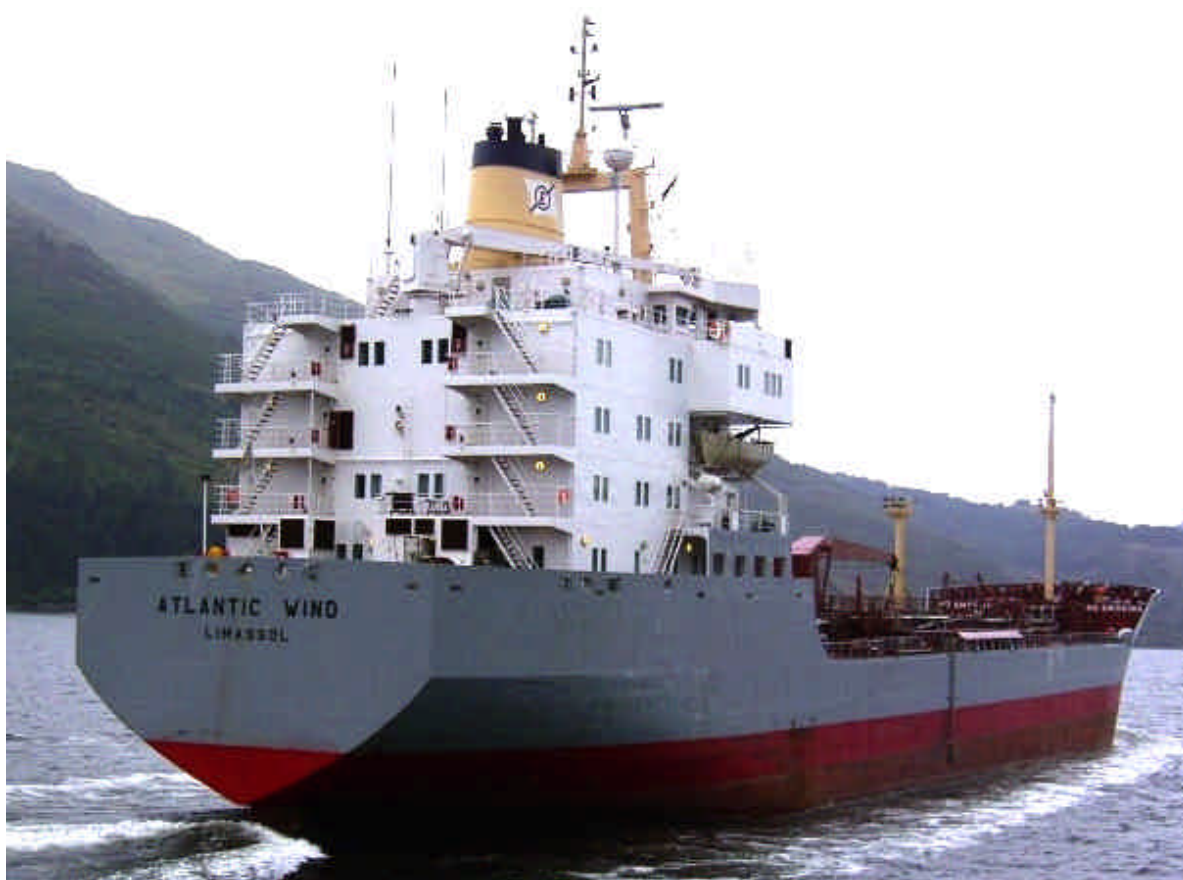
The product tanker ATLANTIC WIND on the River Clyde Monday.