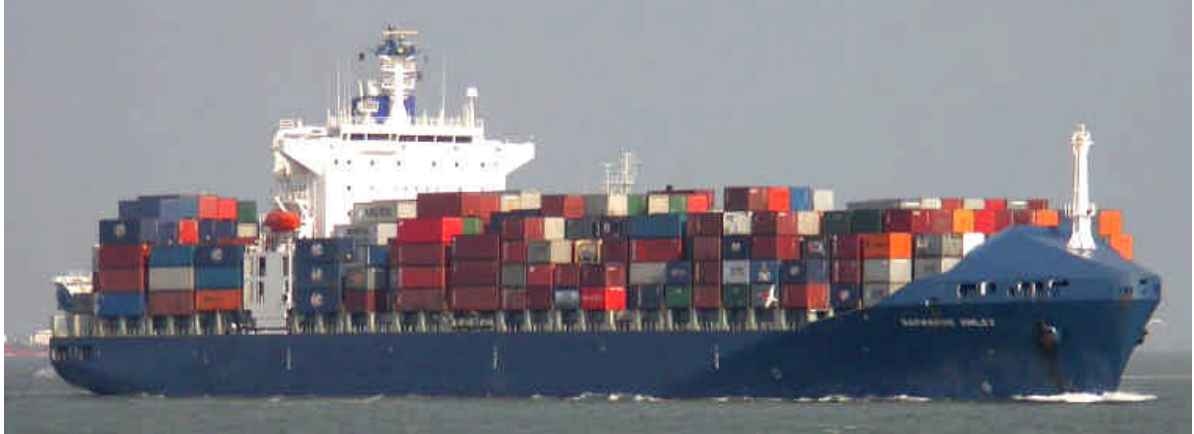
The SAFMARINE KIMLEY outward bound at Flushing pilot station

The ZHEN HUA No 6 was build during 1976 at Boelwerf Temse under yard number 1486 under the name MINERAL BELGIUM , she sailed under this name until 1979 wjen she was renamed BELGIUM , during 1983 she was renamed again in TRADE UNITY until 1985 when she received the name STRAHLHORN until 2001 when she was rebuild en renamed ZHEN HUA No 6 . The vessel has a length of 234 mtr and the width is 32 mtr, she is powered by a MAN diesel of 16100 HP which gives the vessel a speed of 12 knots