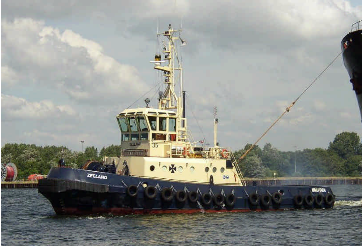
The IJmuiden based SVITSER-WIJSMULLER tug ZEELAND (35) in her new livery.