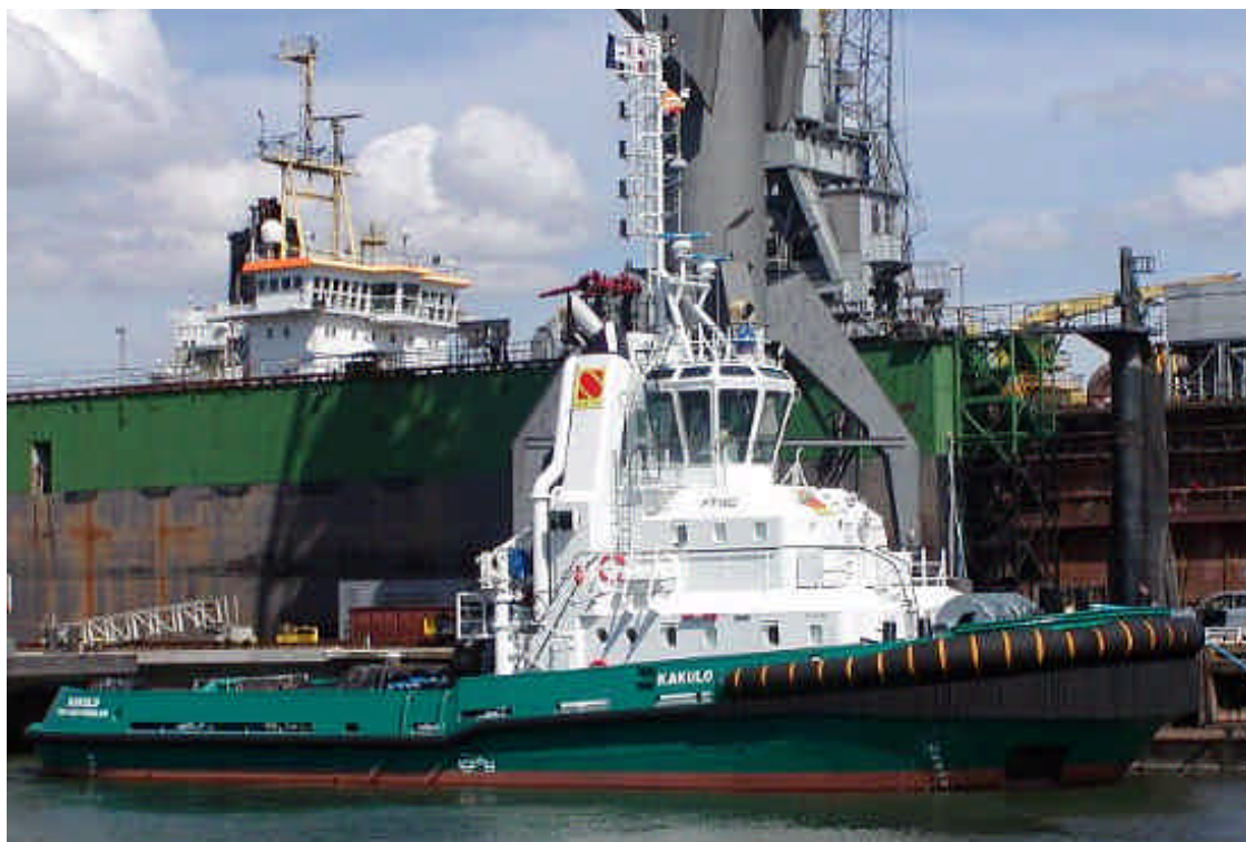
The newbuilding Damen ASD tug 3211 Sonasurf tug KAKULO homeported Port aux Francais seen at the Niehuis & van den Berg shipyard in Rotterdam to load stores before departure.