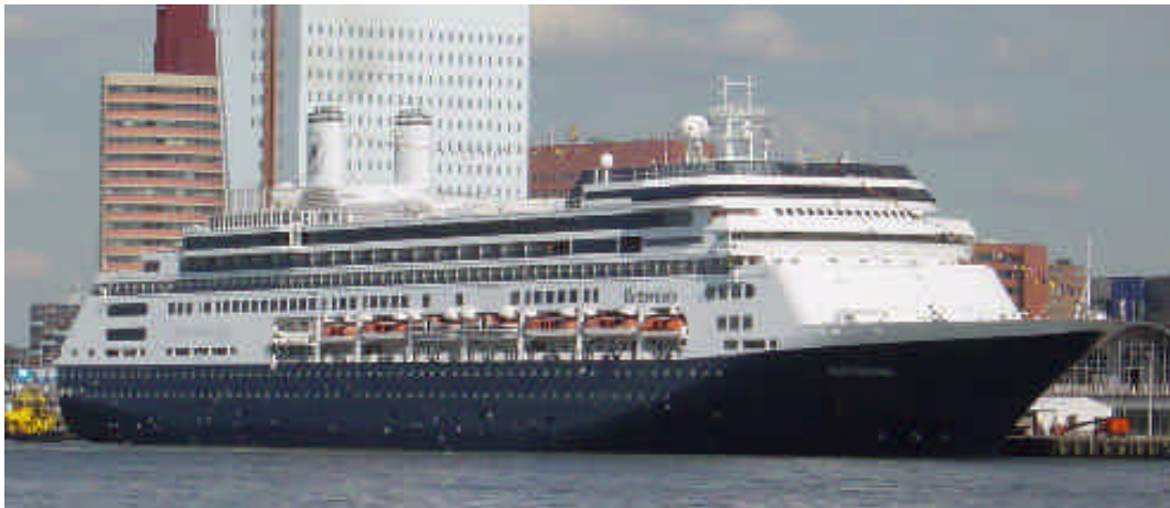
The passengerliner ROTTERDAM moored at the Wilhelmina kade in Rotterdam

The SAFMARINE KIMLEY is build during 1996 under the name WHITE SEA , she was renamed during the same year in SEA-LAND MISTRAL under which name she sailed until 2002 when she received the name SAFMARINE KIMLEY . The vessel is powered by a Sulzer diesel of 44080 HP which gives the vessel a speed of 24 knots, the vessel has a length of 245 mtr and a beam of 32,2 mtr, and can carry maximum 3660 TEU