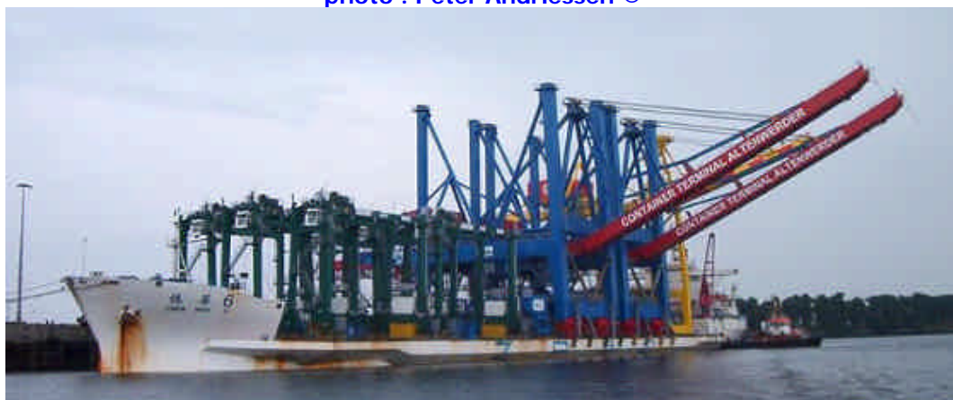
The Chinese transport vessel ZHEN HUA No 6 arrived at Hamburg with new container cranes for the Container terminal ALTENWERDER