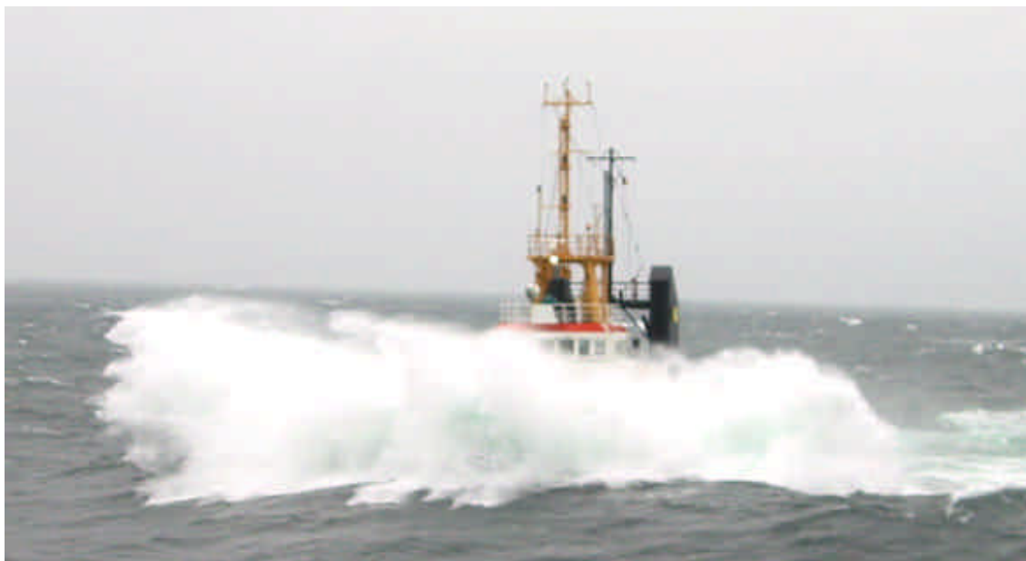
The tug BANCKERT operating near the Tricolor location.