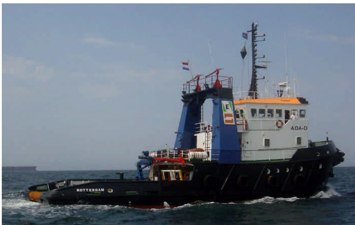
The tug ADA-D seen at Maas pilot station Sunday outward bound

VLIERODAM, STRONG QUALITY IN LIFTING AND HOISTING EQUIPMENT.