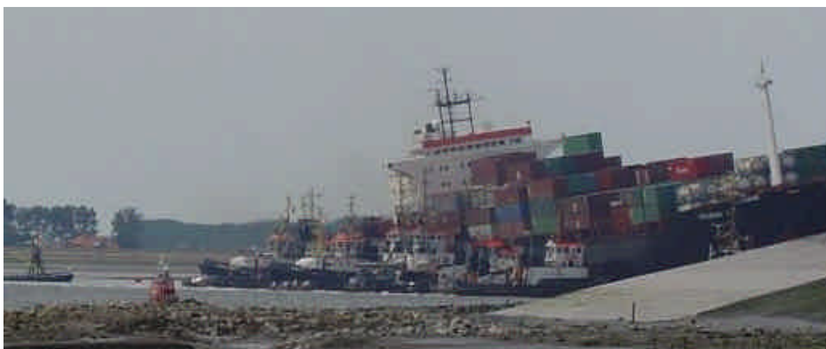
Below : The Pelican 1 get assistance from "some" tugs

SMIT SALVAGE is awarded LOF for the 202 meter long PELICAN 1 and understand from a source in Terneuzen that OVET in Terneuzen is contracted to offload the 1500 containers with their floating cranes.