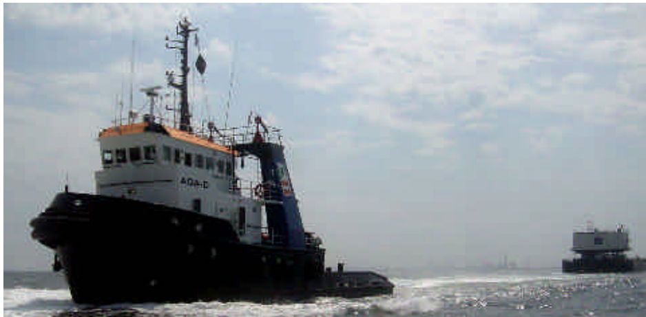
The ADA-D departed with the Pontramaris