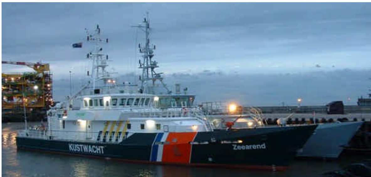
Top : The ZEEAREND and the VIGILANT moored in Lowestoft