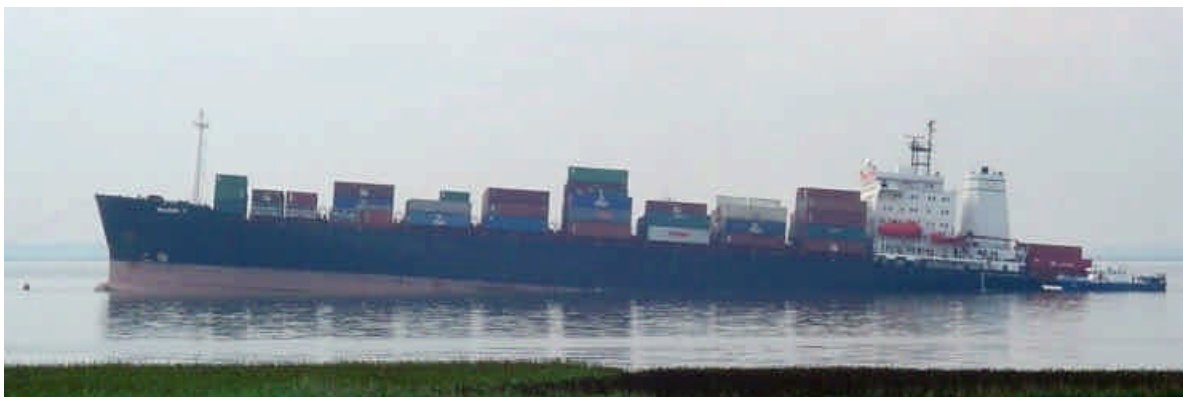
Top : The Pelican 1