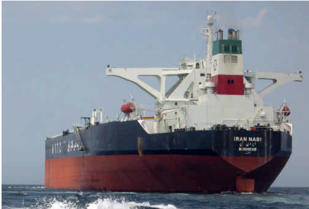
The IRAN NABI departed from Rotterdam Sunday