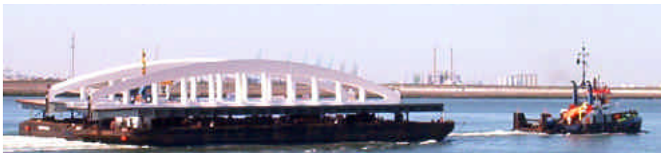
The Eerland 26 departed with the two barges E 1201/1202 loaded with bridge parts from Rotterdam bound for London.