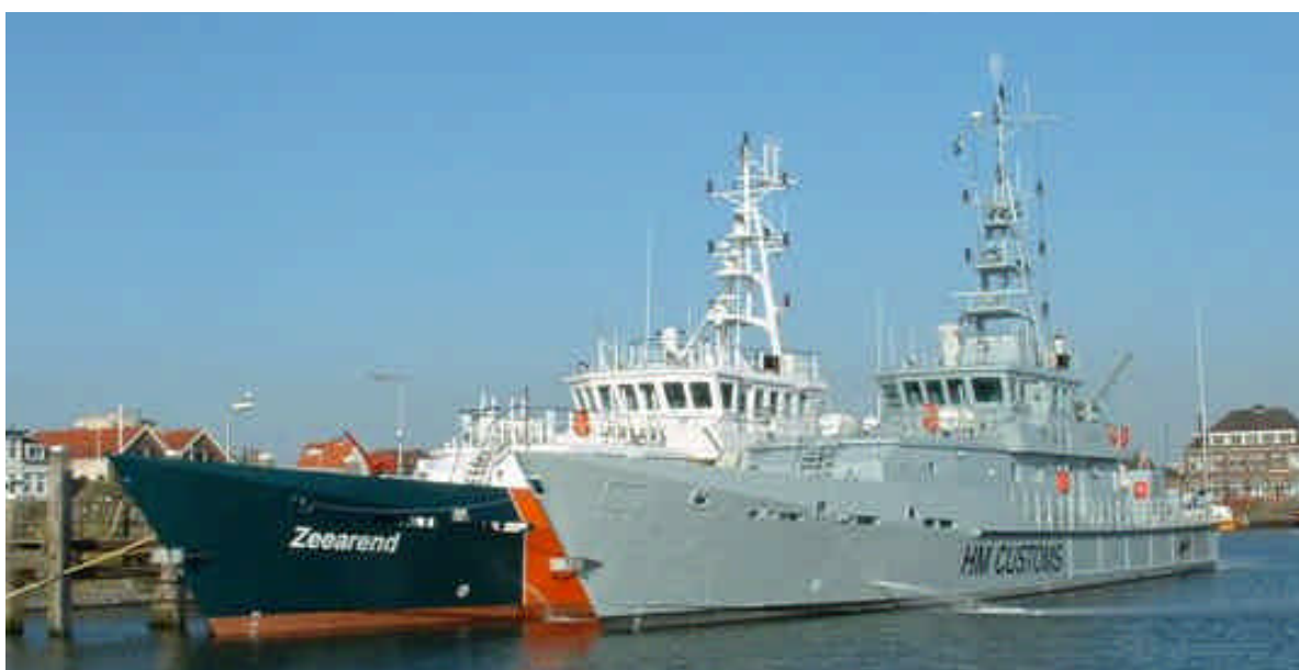
Both vessels moored in the port of Hook of Holland

Left : The VIGILANT recovers her RIB back onboard