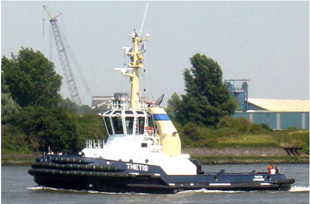
The THETIS of ISKES from IJmuiden started her seatrails