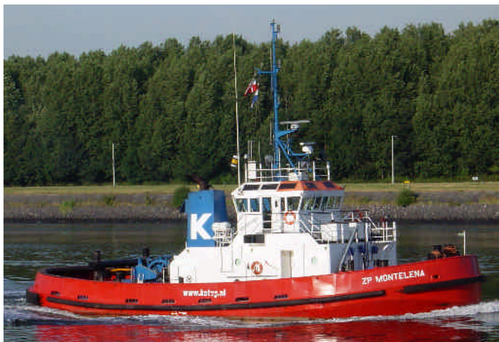
KOTUG 's ZP MONTELENA in the Caland canal

VLIERODAM, STRONG QUALITY IN LIFTING AND HOISTING EQUIPMENT.