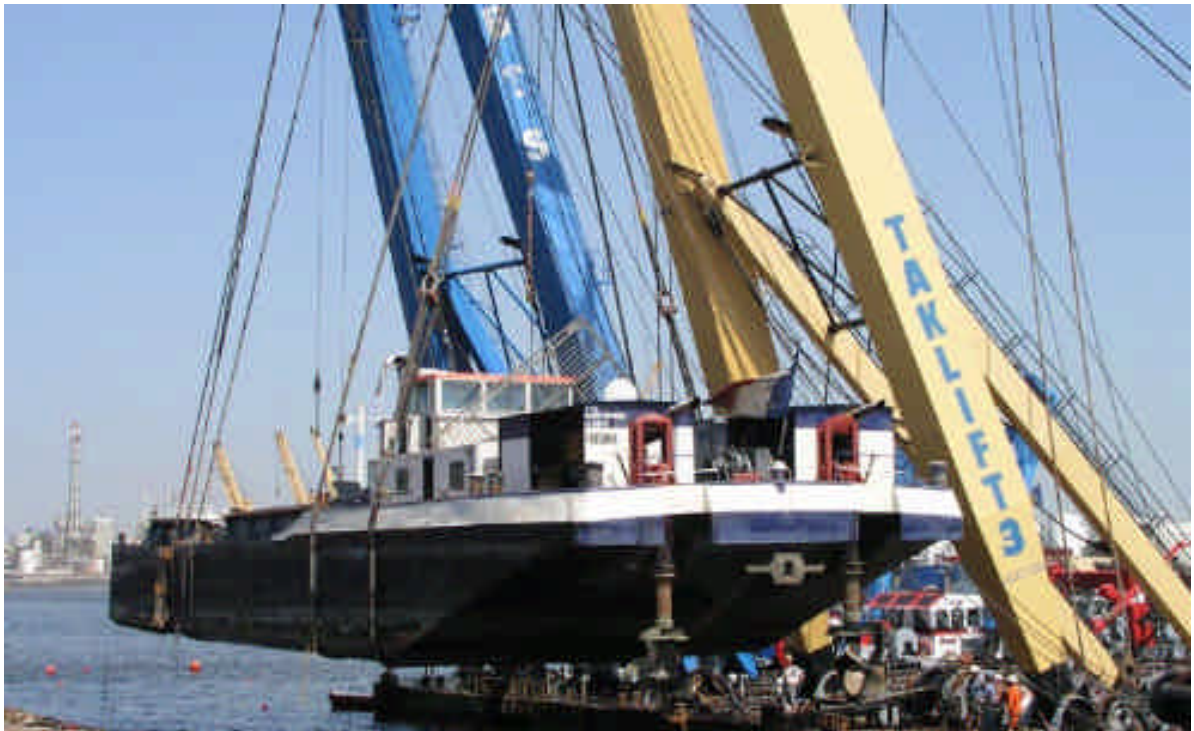
Top : The FREDINA in the tackles of the TAKLIFT 3 and the AMSTERDAM