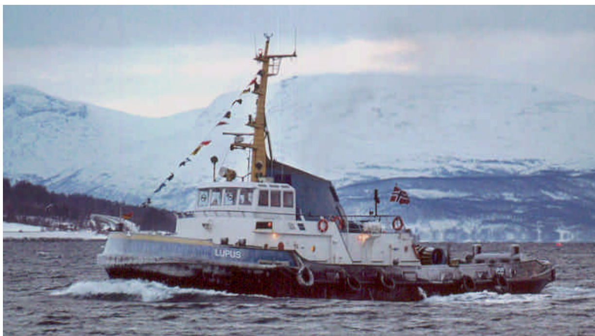
The LUPUS (former BANJAARDSBANK ) seen here operating in Norway