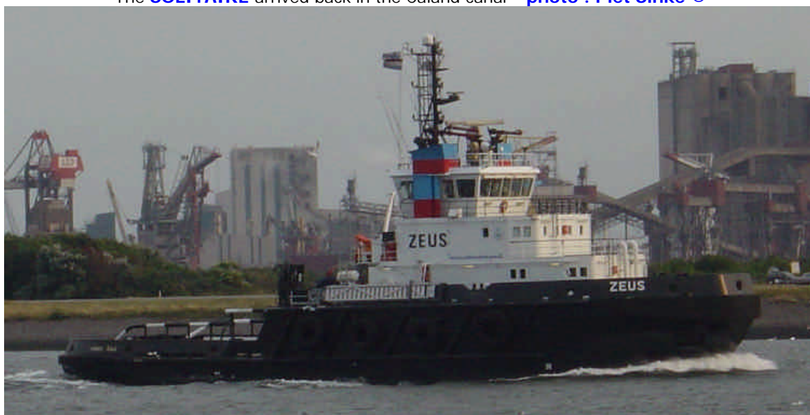
Alfons Hakans ZEUS departed again from Rotterdam Wednesday evening