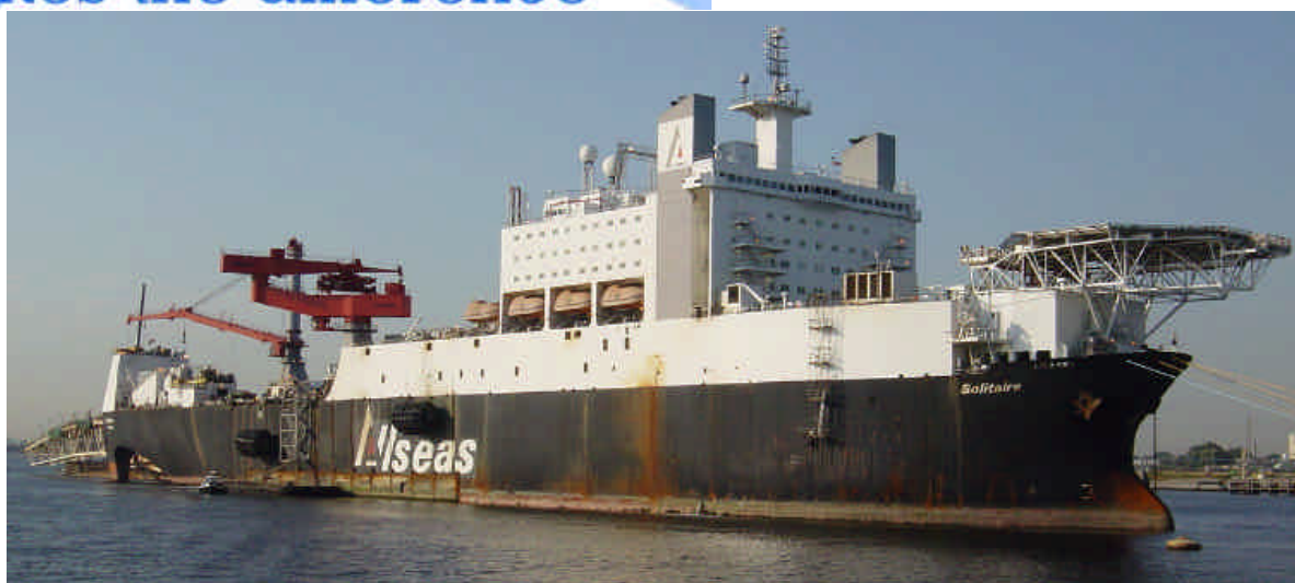
The SOLITAIRE arrived back in the Caland canal