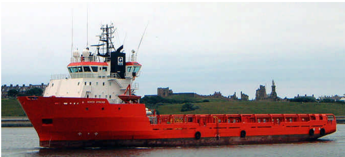
The NORTH STREAM arrived on the Tyne from Aberdeen to discharge equipment for Rowan Gorilla VII at McNulty's South Shields