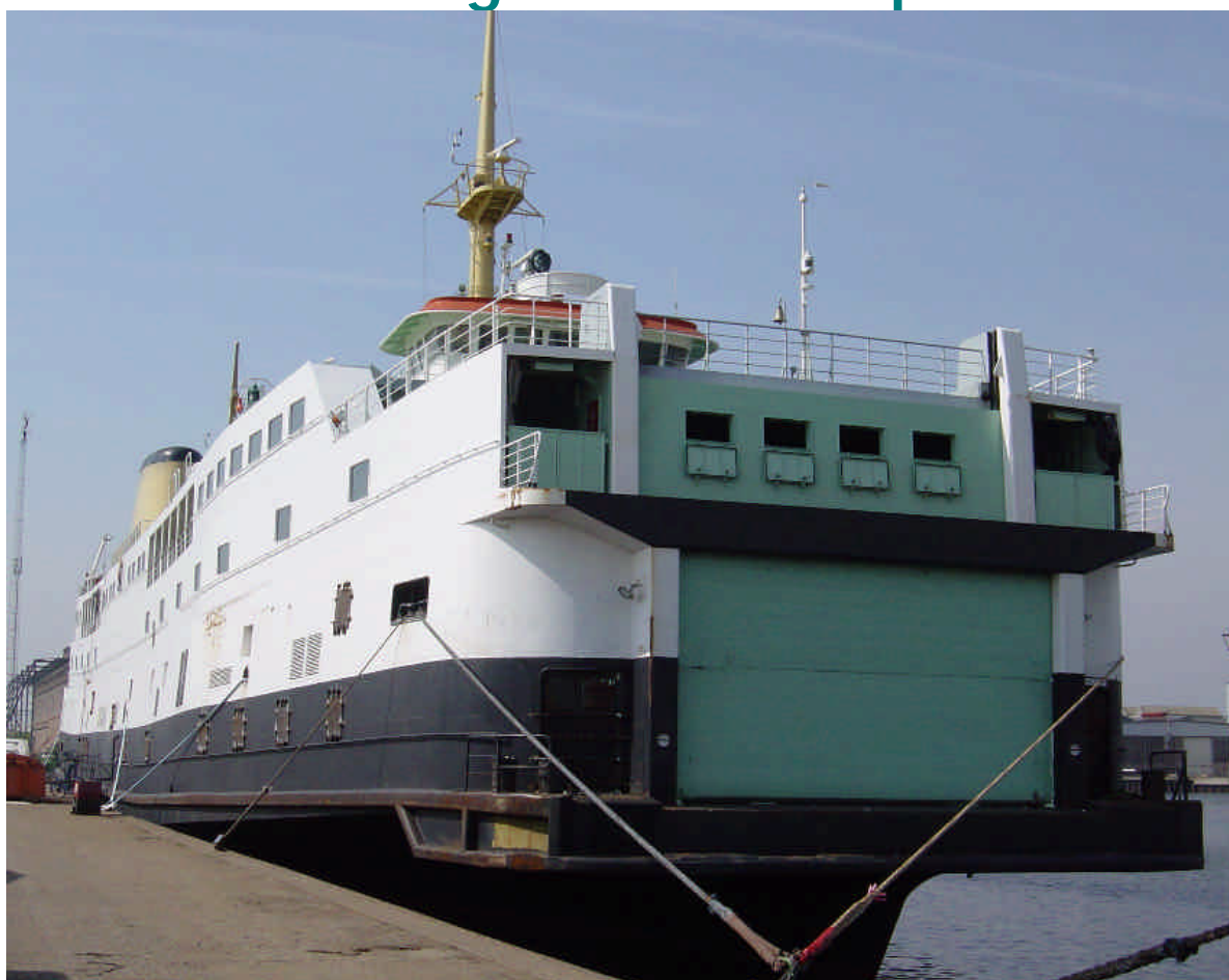
De PRINS WILLEM ALEXANDER in Vlissingen word gereed gemaakt voor vertrek naar Italy

De provincie Zeeland moet vele honderdduizenden euro's extra betalen aan de kapiteins van de inmiddels opgeheven PSD. Dat is een gevolg van een uitspraak van de rechter. Die heeft bepaald dat de dertig PSD-kapiteins de afgelopen zes jaar te weinig betaald kregen voor onregelmatige diensten. De uitspraak kan nu ook grote gevolgen hebben voor de rest van het PSD-personeel