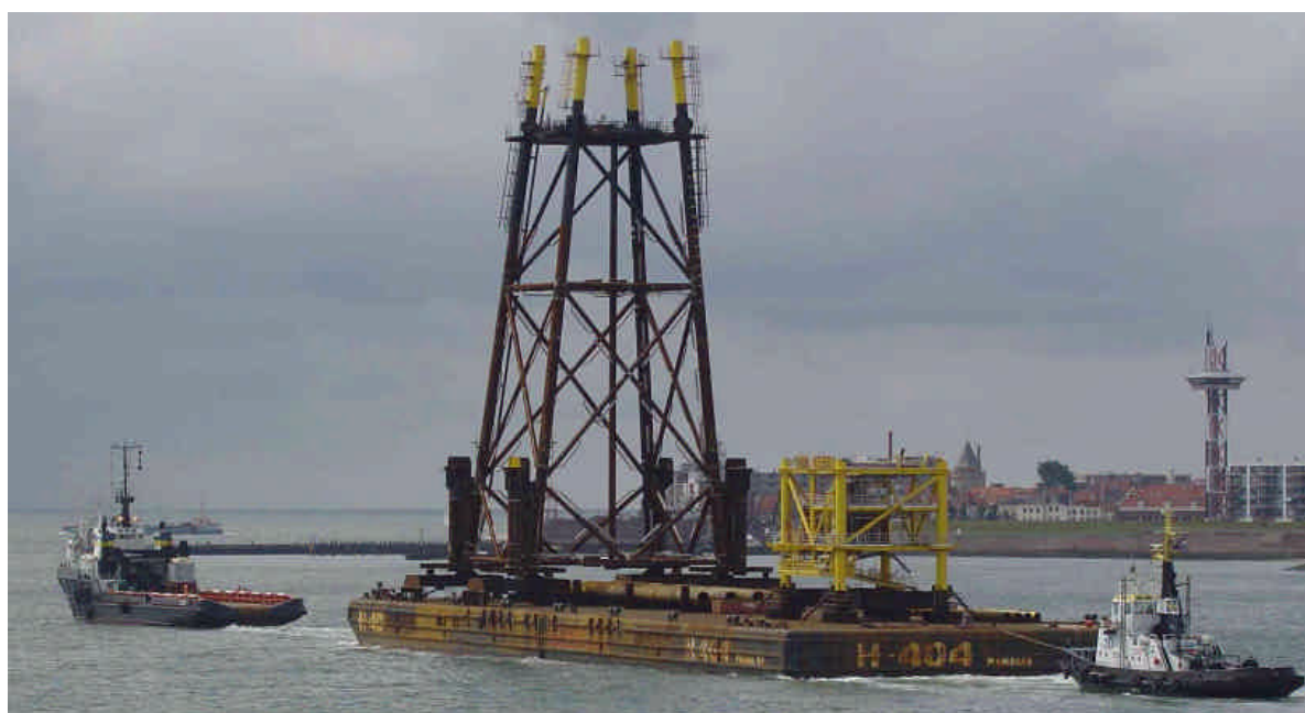
The ATREK departed with the H-404 loaded with the NAM K7 FB-1 from Flushing