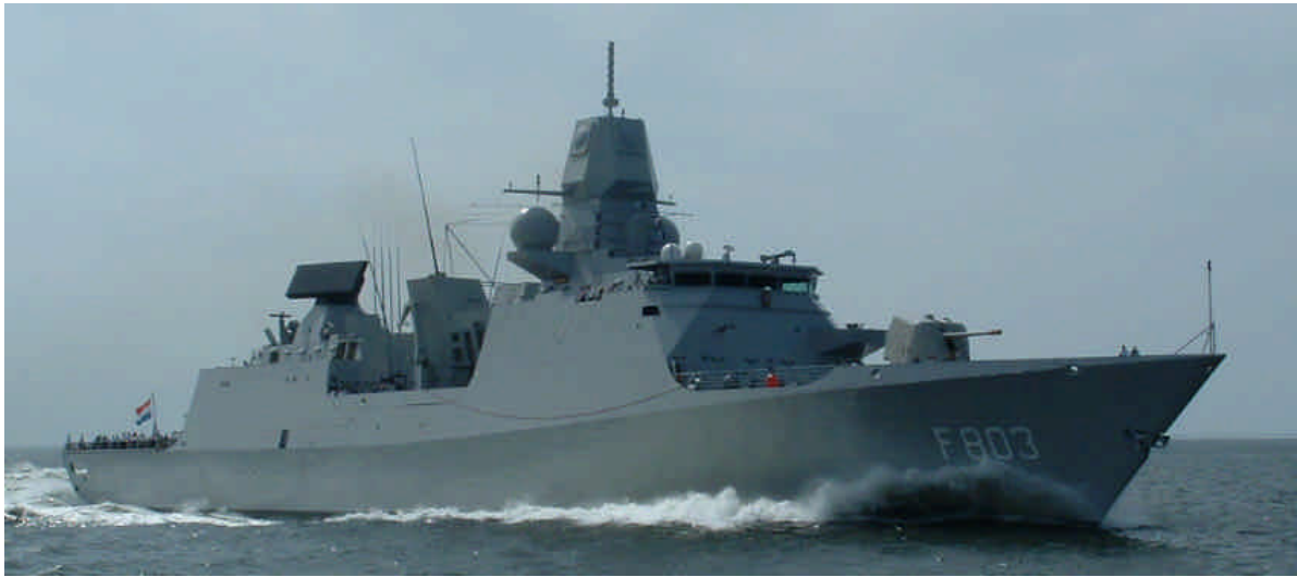
The Dutch Frigate F 803 TROMP making good speed