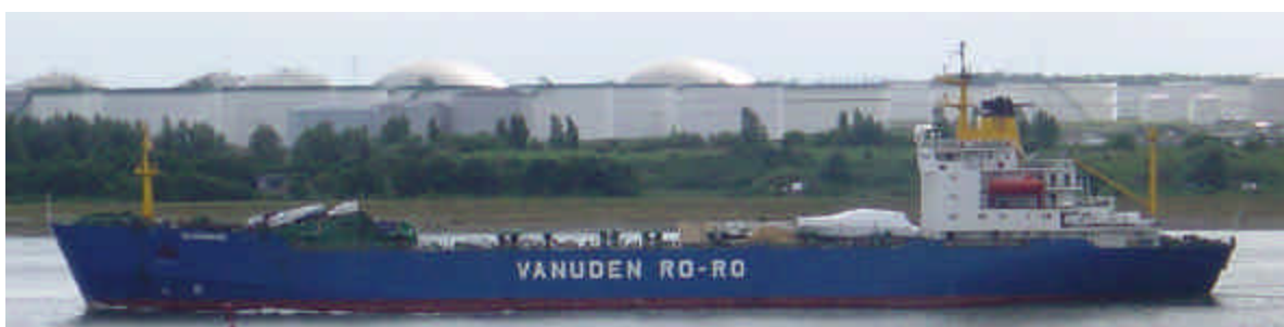
The JULIANAHAVEN of VANUDEN RO-RO arrived in Rotterdam