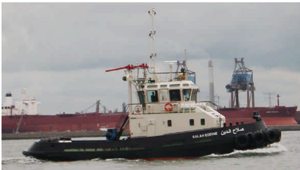
The newbuilding SALAH EDDINE departed from Rotterdam