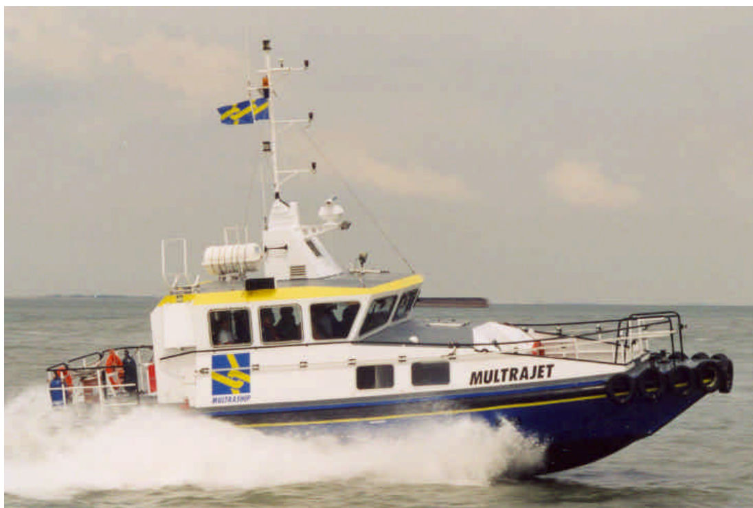
The MULTRAJET of MULTRASHIP from Terneuzen

VLIERODAM, STRONG QUALITY IN LIFTING AND HOISTING EQUIPMENT.