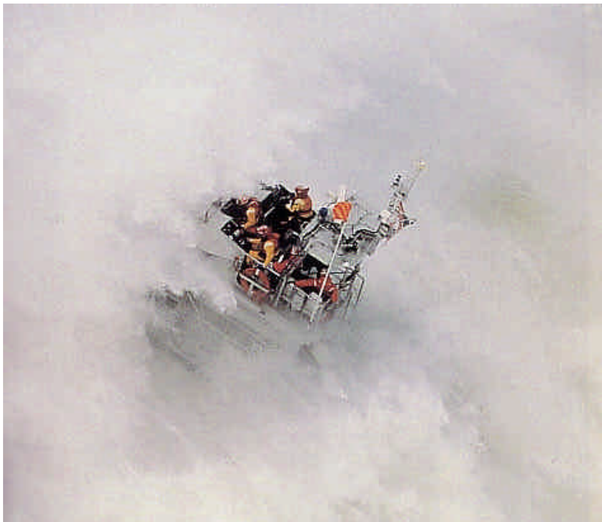
US COAST GUARD LIFE BOAT IN ACTION