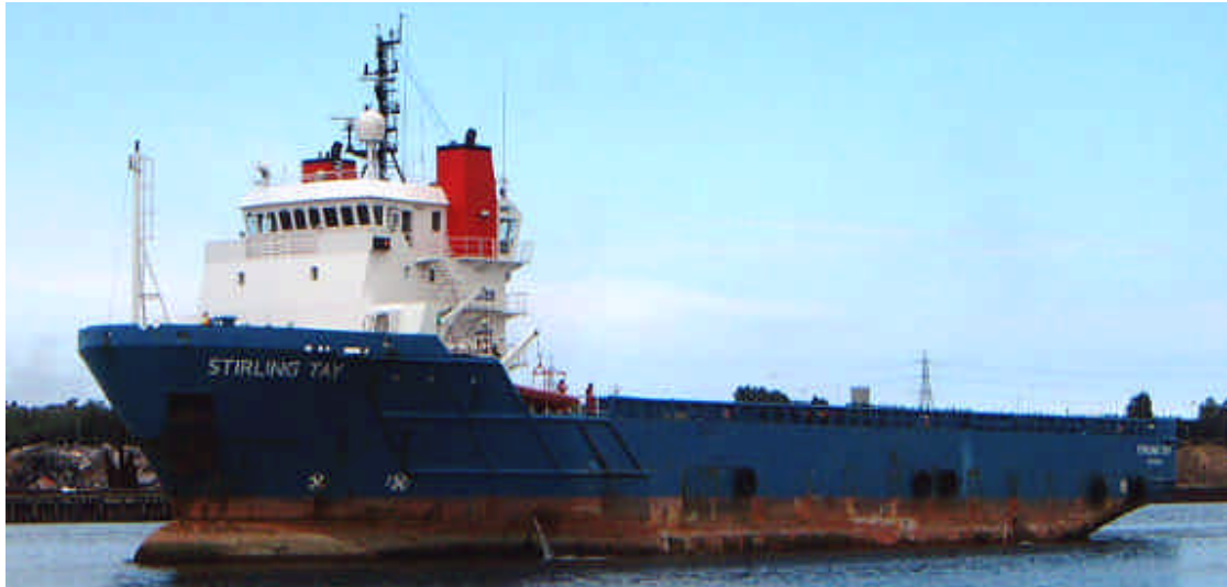
The STIRLING TAY arrived from peterhead at A&P Wallsend, note that the STIRLING logo is painted out of the funnel