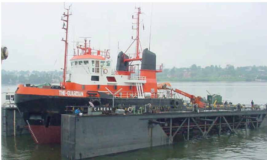
THE GUARDIAN seen here leaving a drydock, This vessel was build as the SMIT LLOYD 46 , and sold during 1985 and renamed LENGA , she was sold again during 1989 and not renamed, during 1993 she was sold to the Chilean Navy and renamed COLO COLO , during 1999 she was sold again and renamed SEA GUARDIAN , and finally she was sold again during 2002 to TOGO OIL & MARINE at LOME (TOGO) and renamed THE GUARDIAN