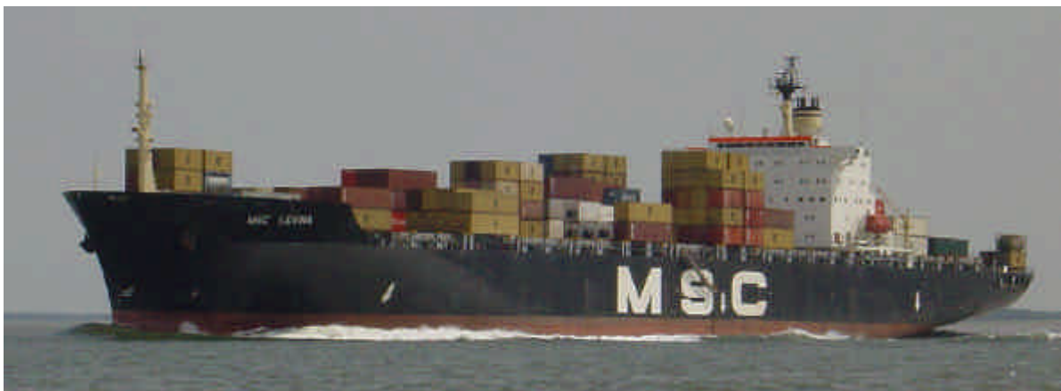
The MSC LEVINA seen here passing the Pas van Terneuzen outward bound from Antwerp.