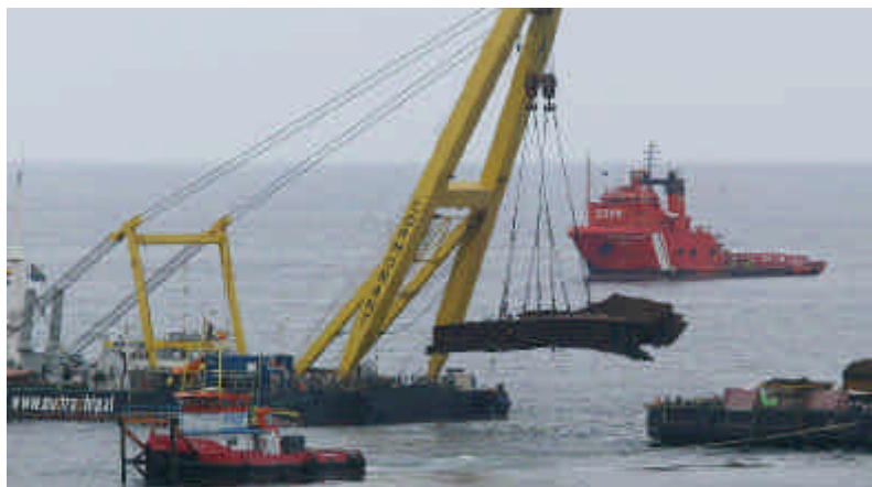
SALAS off Gijon, in the front the tug FONDA whilst a Spanish coast guard vessel is keeping an eye on the operation

MULTRASHIP 's floating sheerleg CORMORANT seen here working at the wreck removal of the CASTILLO DEL