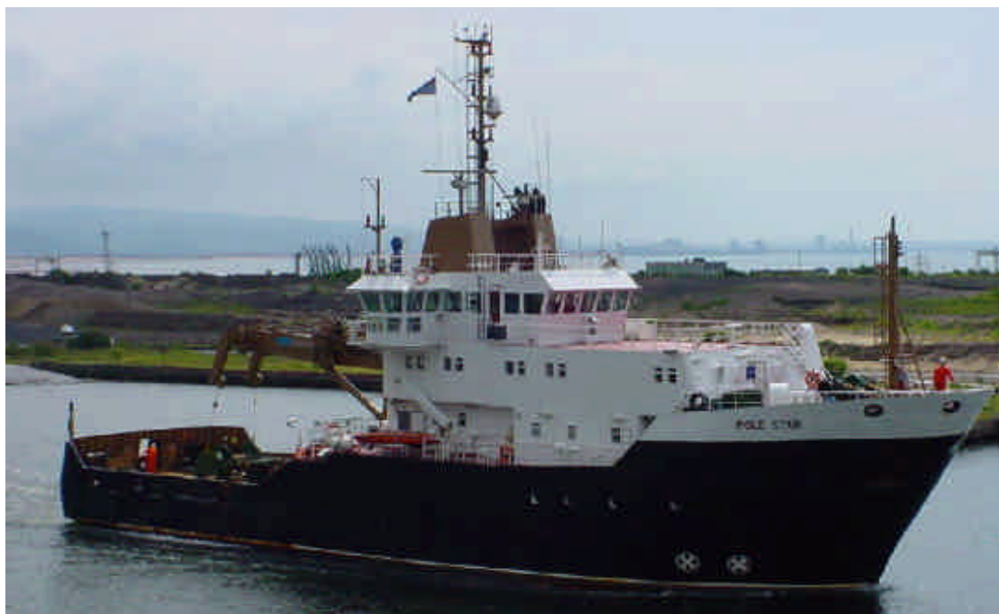
The POLE STAR working at present at the Bristol Channel – photo : Chris Jones ©

http://www.rotterdamsdagblad.nl/extra/ssrotterdam