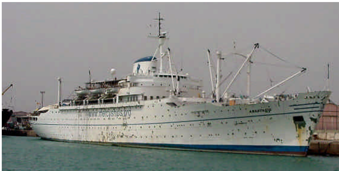
Top : The ANASTASIS moored in the port of COTONOU in BENIN January 2001

THE ANASTASIS WILL VISIT THE PORT OF ROTTERDAM FROM AUGUST 24 TH UNTIL SEPTEMBER 9 TH WHICH INCLUDES HARBOURDAYS