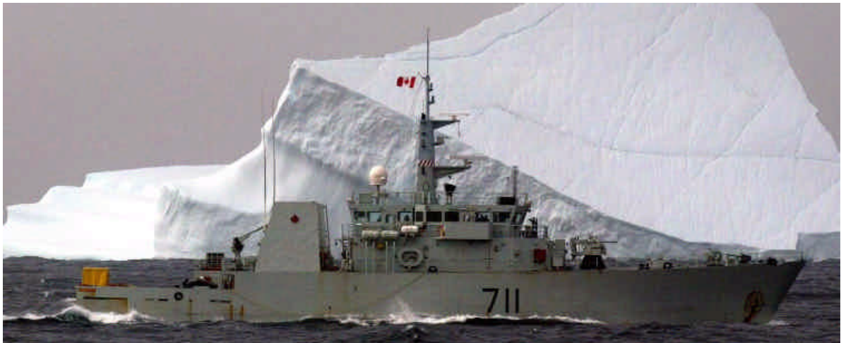
The Canadian offshore patrol vessel 711 Summerside