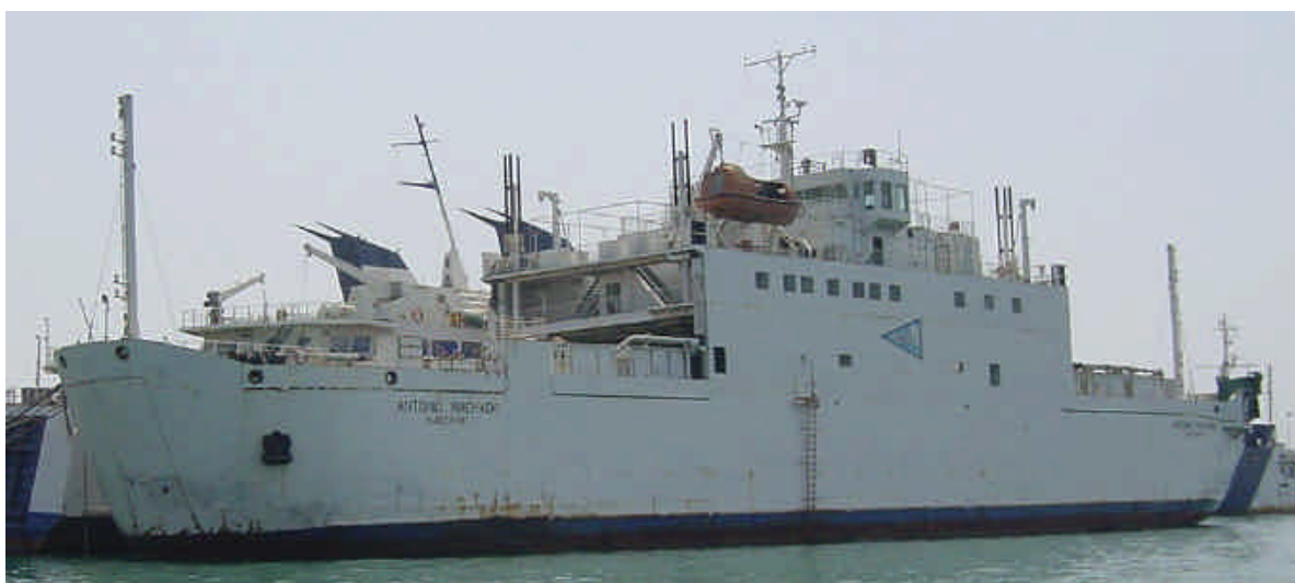
Top : The Antonio Machado laid up in the port of Algeciras

"Antonio Machado" was due to be taken by tow out of Algeciras June 18th - she is bound for Genoa. She is the first of the four former Isnasa ferries purchased by Enermar to be removed from Algeciras.