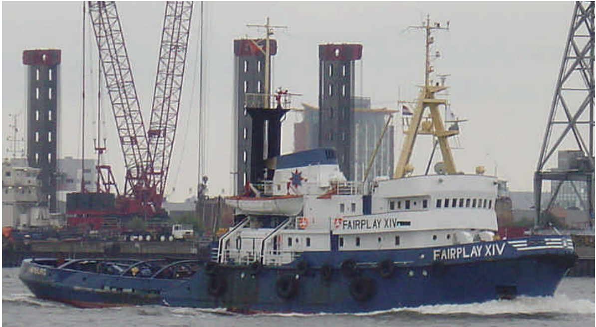
The FAIRPLAY XIV arrived in and departed again from Rotterdam – photo : Jan Simons ©