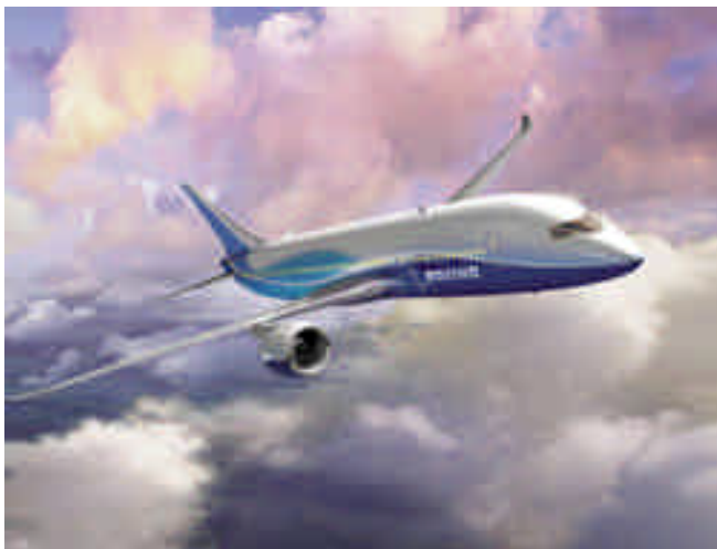
High technology: the proposed 7E7 plane (above) is now on the drawing board, but technologies that could be developed for it could be used to upgrade Boeing's classic 747 jumbo jet

(LE BOURGET, France) Boeing Co said on Monday technologies that could be developed for its planned 7E7 plane may also be used to build an advanced version of its classic 747 jumbo, allowing it to fly further with more passengers.