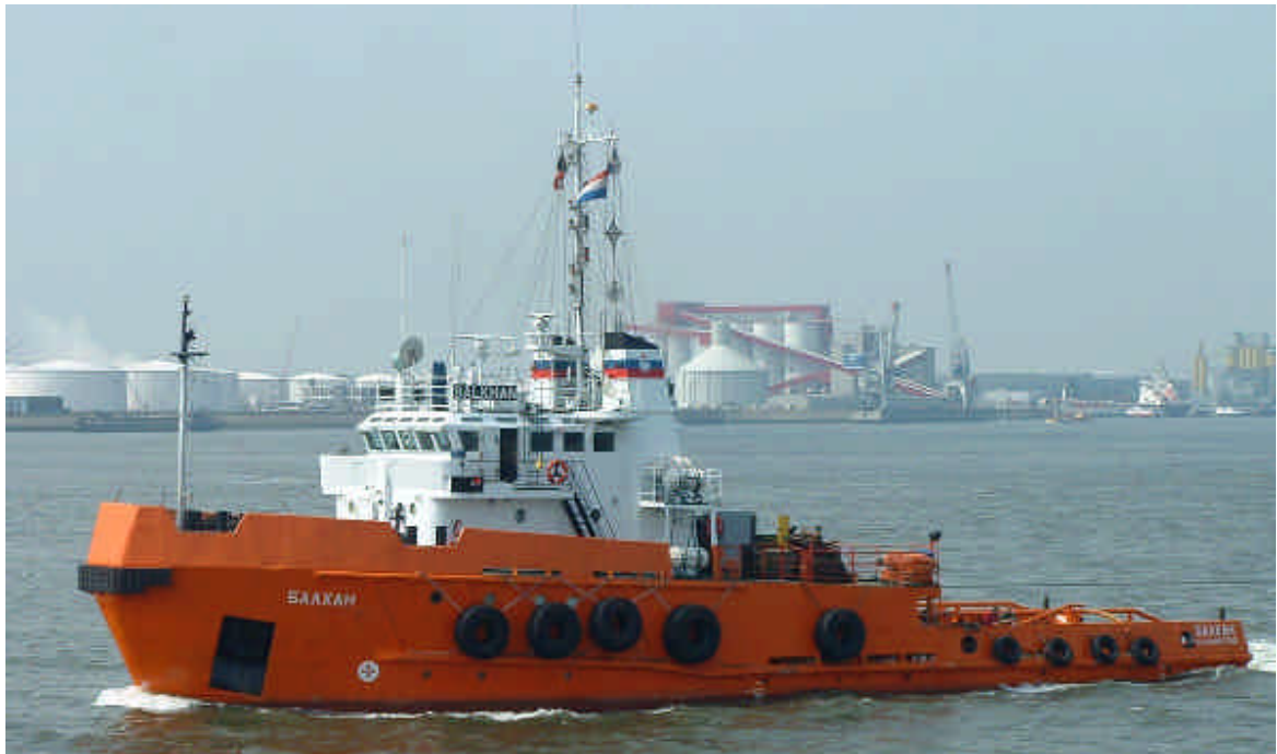
The BALKHAN arrived in Rotterdam