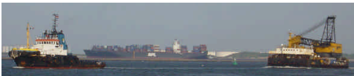
The SMIT HUNTER arrived with the ANNA 4 from Algeria in Rotterdam

"Antonio Machado" was due to be taken by tow out of Algeciras June 18th - she is bound for Genoa. She is the first of the four former Isnasa ferries purchased by Enermar to be removed from Algeciras.