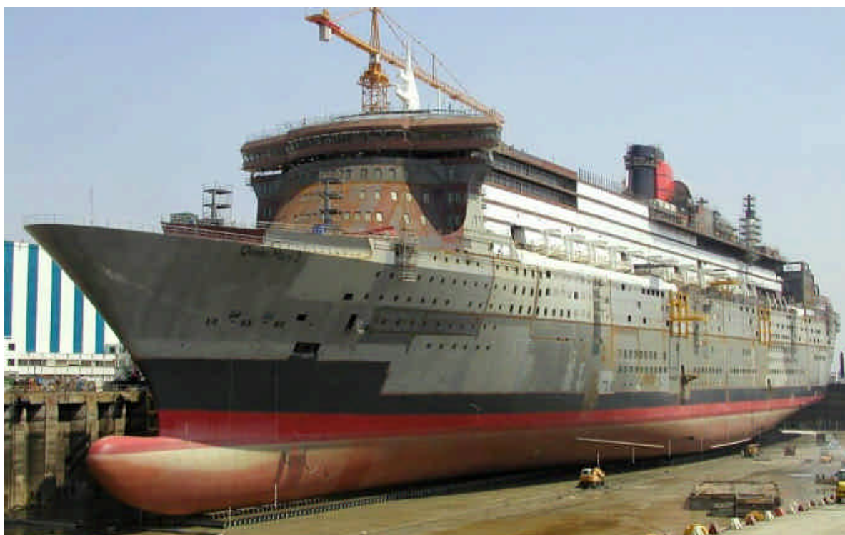
The Queen Mary 2 getting shape in St Nazaire