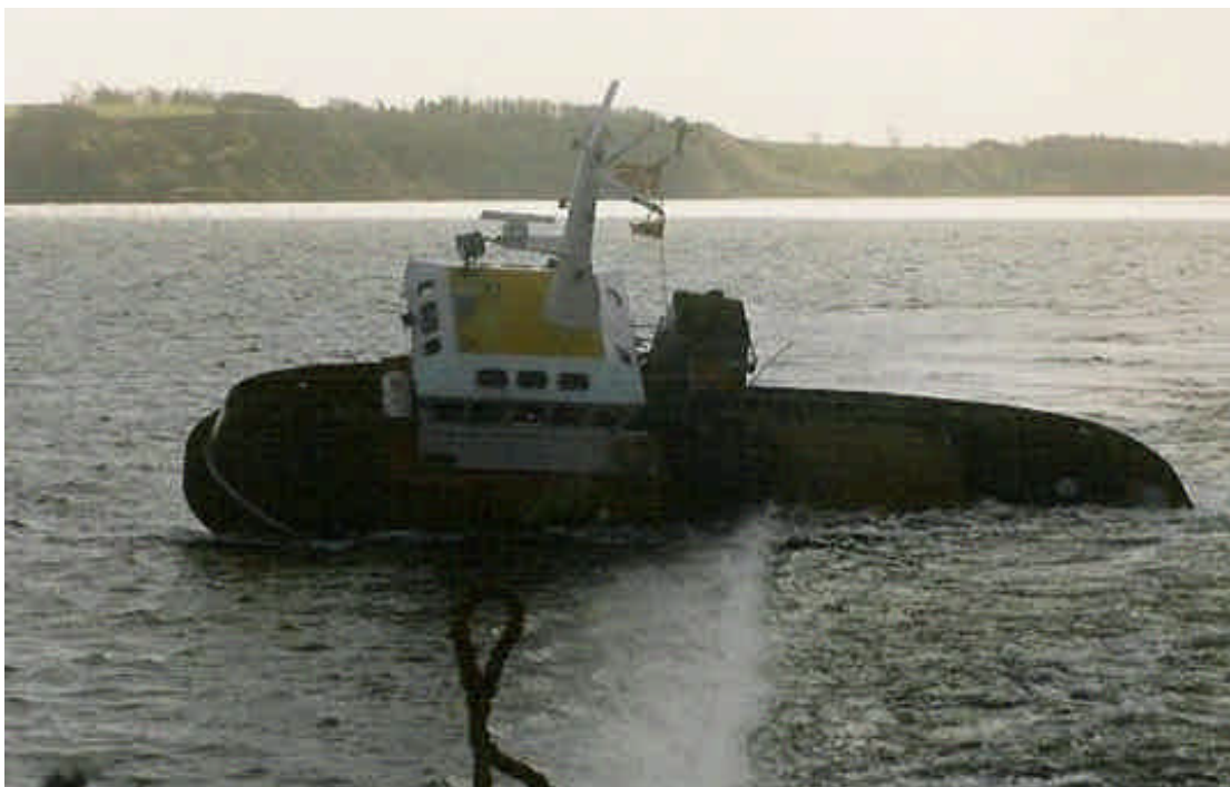
The Goliat acting as carousel tug ???