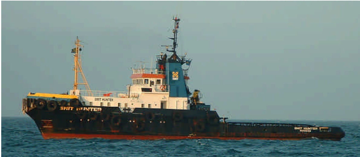
Top : The SMIT HUNTER at the Maaspilot station