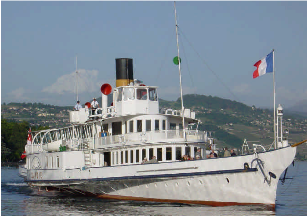
The 1914 build paddle steamer SAVOIE seen her at Lausanne (Lake Geneva) last Friday