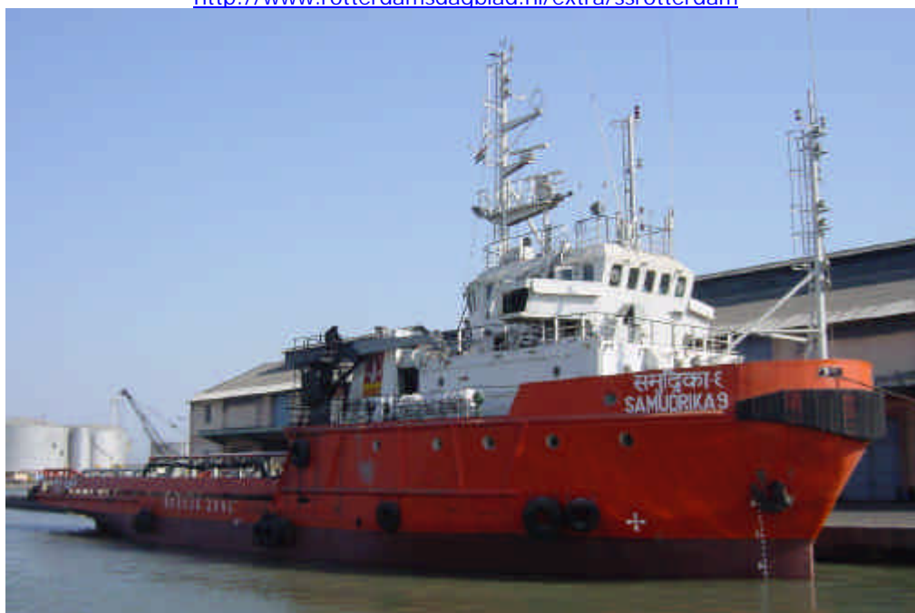
The Indian supplier SAMUDRIKA 9 moored in the Port of Mumbai

http://www.rotterdamsdagblad.nl/extra/ssrotterdam