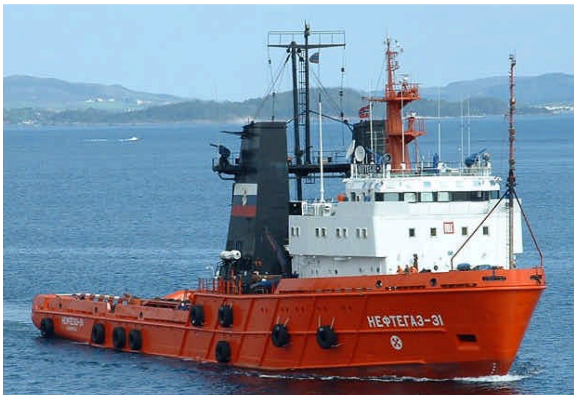
The NEFTEGAZ 31 arrived Saturday at Steinsvik (near Stavanger) to pick up a barge.