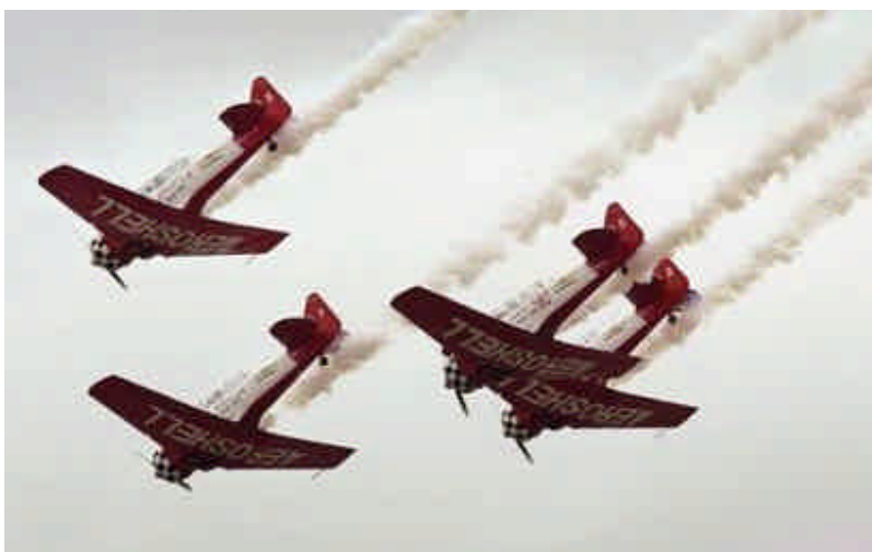
The Aeroshell T-6 Team performed at Pope Air Force Base, N.C., Saturday, May 24, 2003, during the Festival of Flight air show

Om de Fokkervloot vliegende en dus onderhoudsbehoefig te houden, heeft Stork in februari al een alliantie gesloten met motorenfabrikant Rolls-Royce met als doel Fokker F 100's die met name door de noodlijdende vliegmaatschappijen US Airways en American Airlines aan de grond waren gezet, opgelapt door te sluisen naar nieuwe gebruikers. „Op dit moment arriveert er hier elke twee, drie weken een F 100 die we aanpassen voor de Duitse vliegmaatschappij Germania,” vertelt een woordvoerder. „Voor de F 50 hebben we nog geen grote opdrachtgever, maar er zijn zeer hoopvolle contacten.” Van de tweehonderd toestellen tellende F 50-vloot zijn er wereldwijd zo'n dertig 'werkeloos'. Stork kan goed nieuws wel gebruiken, want vorig jaar werd besloten om driehonderd van de 675 banen te schrappen.