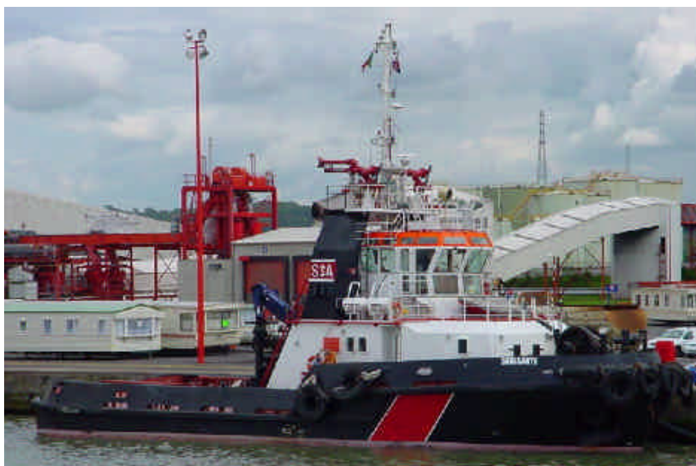
The Uran is currently on charter to Svitser in Bristol and has been renamed Danegarth .