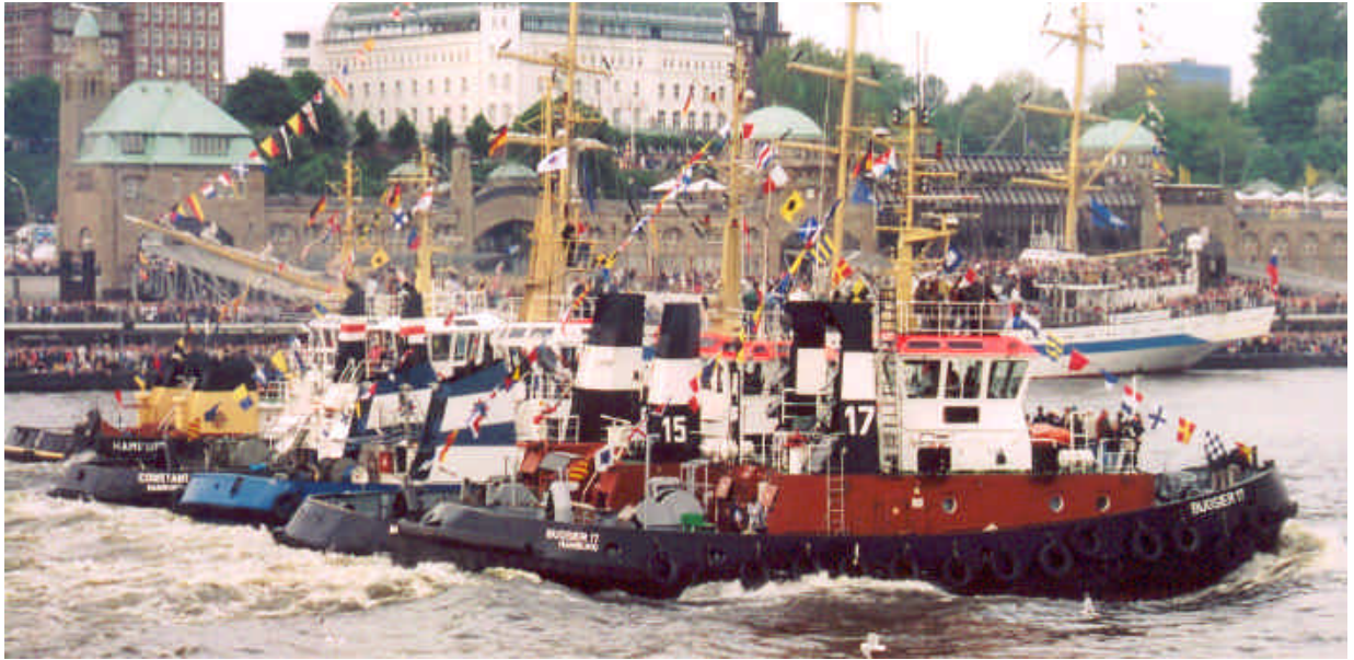
The harbour tugs in Hamburg dancing the "Sirtaki" all together during the Hafengeburtstag 2003