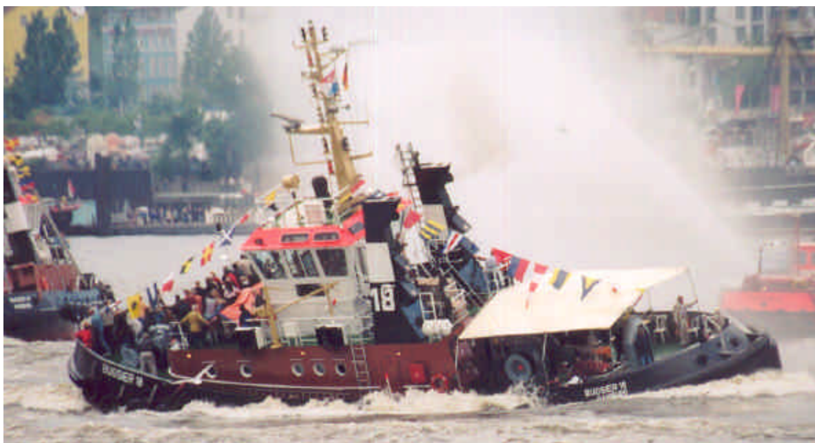
The BUGSIER 18 in action during the Schlepperballett at the Hafengeburtstag 2003 in Hamburg

VLIERODAM, STRONG QUALITY IN LIFTING AND HOISTING EQUIPMENT.