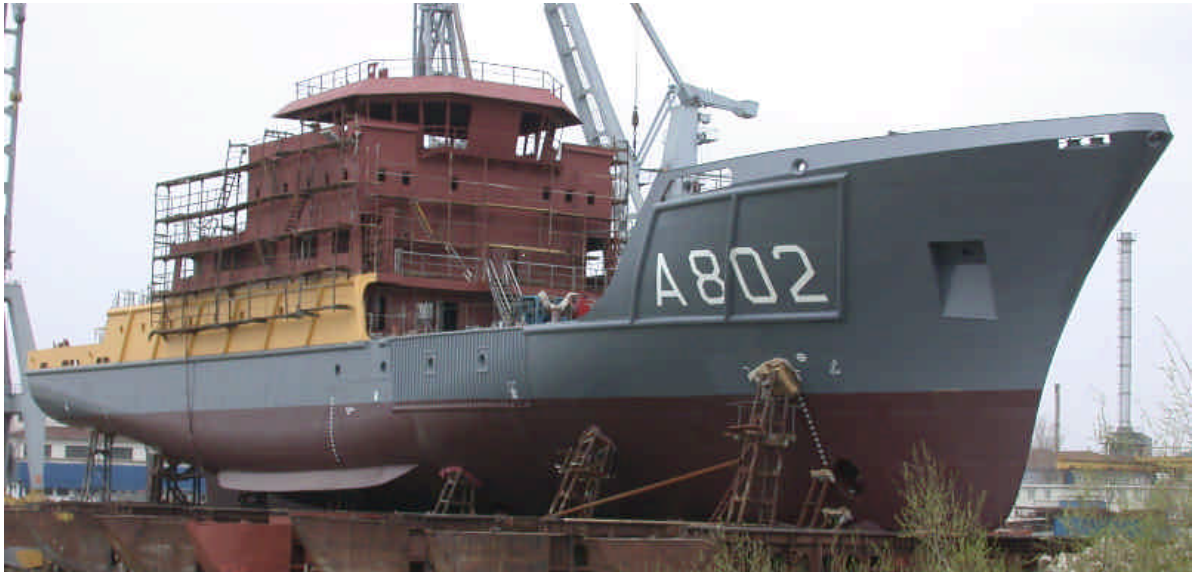
The A 802 Snellius , one the two newbuilding Survey vessels for the Dutch navy under construction