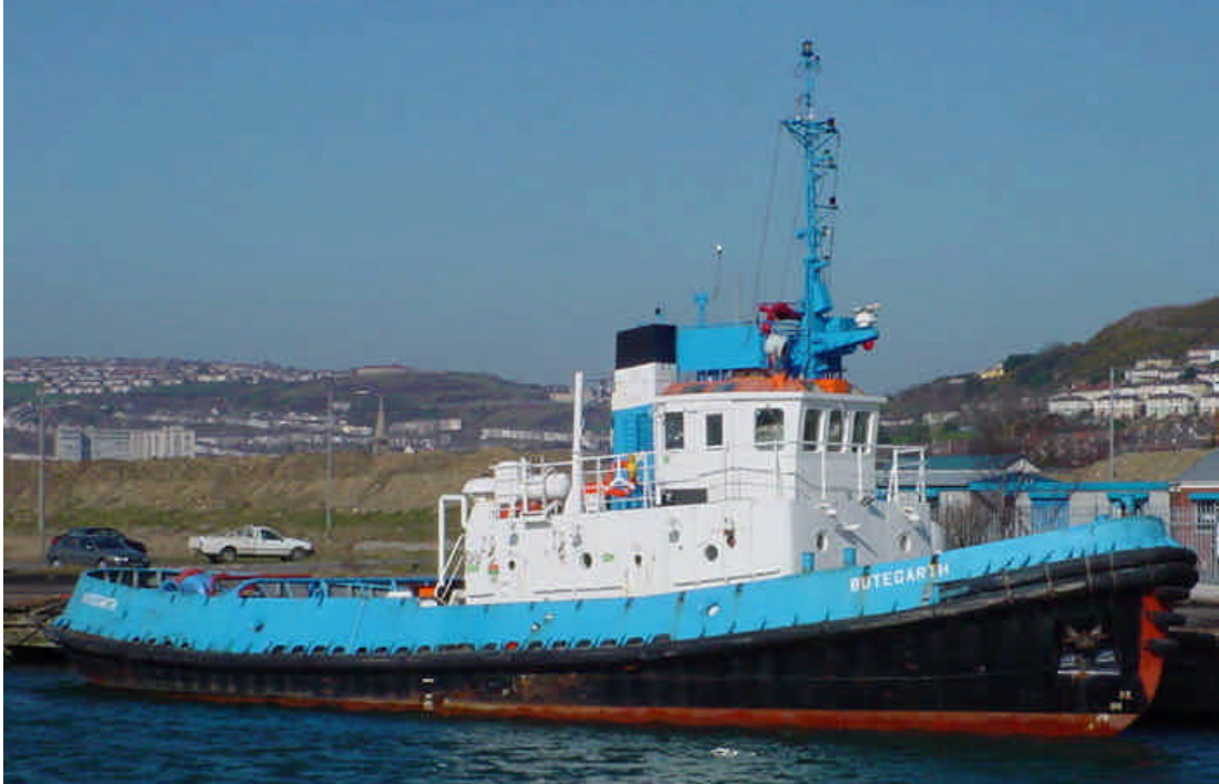
The Butegarth sailed from Swansea Saturday bound for Tallinn