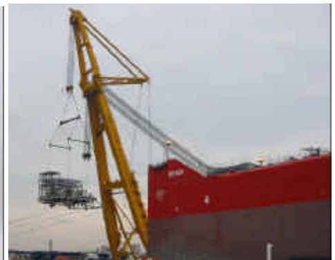
Left and top : The ASIAN HERCULES II doing some lifts at the Bonga in Newcastle on Tyne.