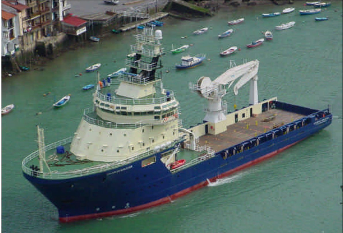
The GRAMPIAN SURVEYOR yard no 427 leaving for official sea trials last 7th of March.