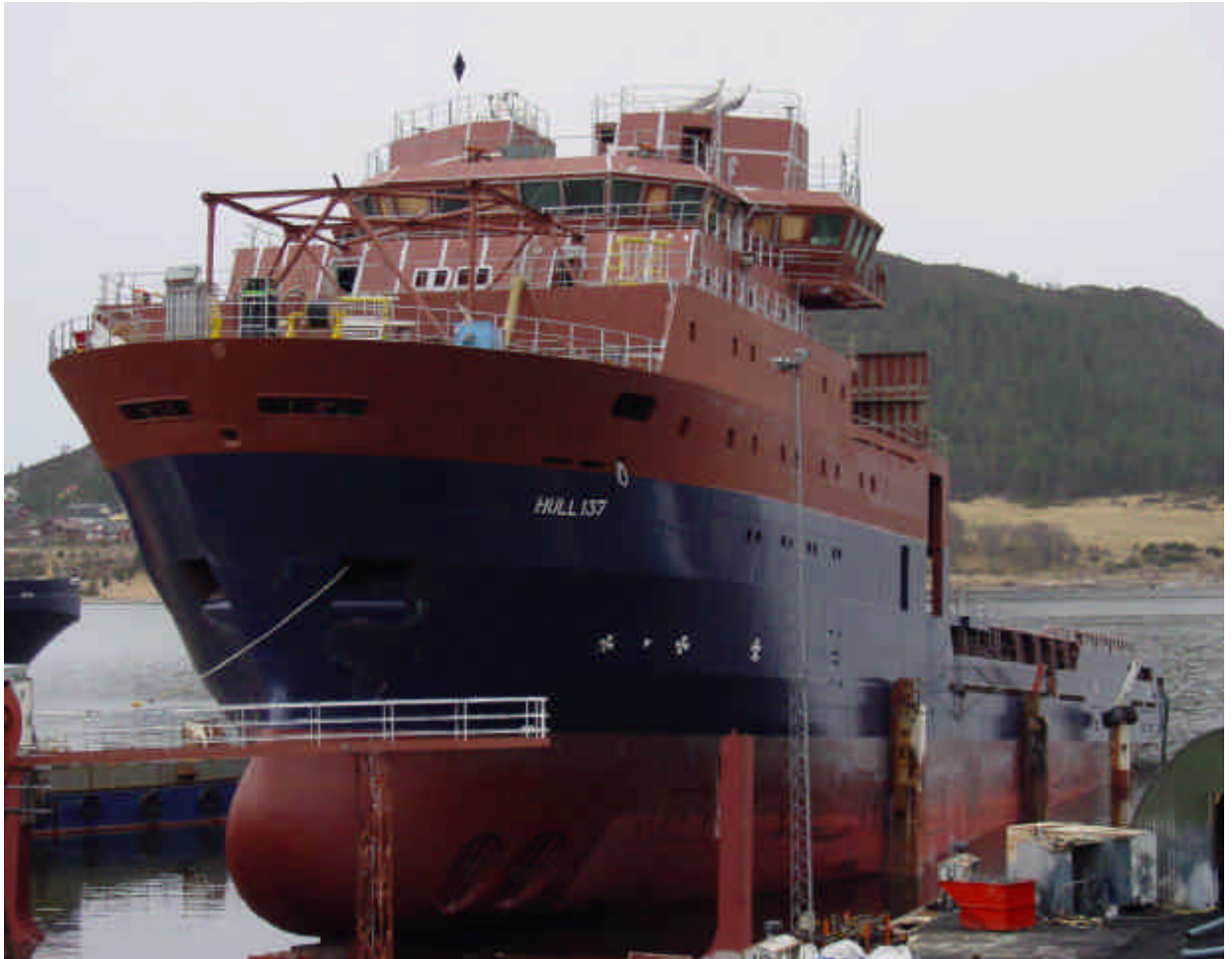
UT 737-L design, hull no 137 at the Søviknes Shipyard, to be named ISLAND FRONTIER ready to be launched