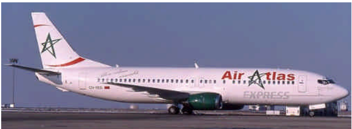
The new Air Atlas Express - Boeing 737-4Y0 at Paris - Charles de Gaulle

U.S. Defense officials last week halted testing of the V-22 Osprey tilt-rotor aircraft to replace faulty hydraulic lines, but the flight tests should resume between March 18-20, 2003 a spokesman for the V-22 program office said on March 10. The Osprey resumed flight tests in May 2002 after the $40 billion program was grounded in December 2000 after two crashes that killed 23 Marines. A test flight is shown at the Patuxent River Naval Air Station in southern Maryland, May 29, 2002.