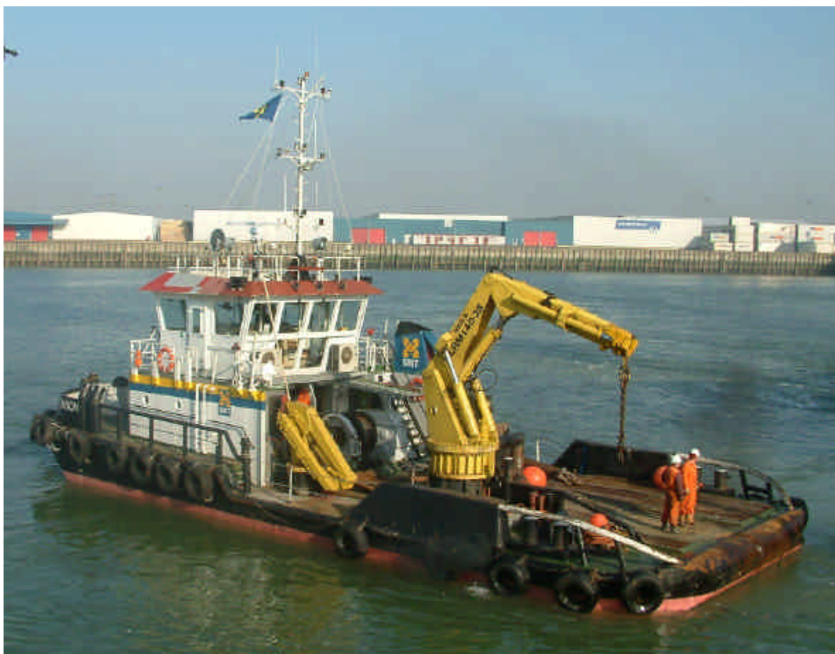
The SMIT BISON operating in Vlissingen Oost during the wreck removal operation at the Westerschelde