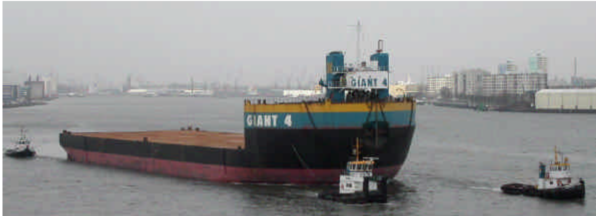
The GIANT 4 was shifted in Rotterdam by the Eerland 4 , 5 , 23 and Rijn