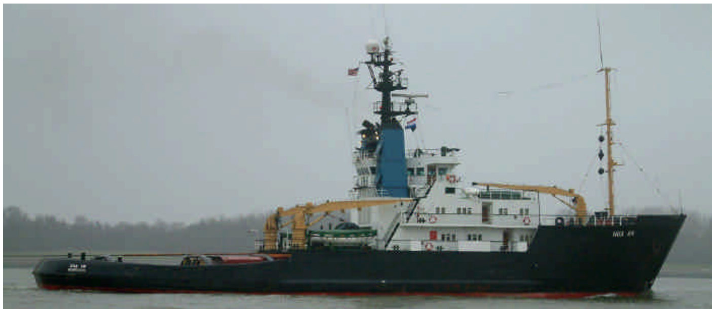
Top : The HUA AN arriving in Rotterdam with the Ocean Seal