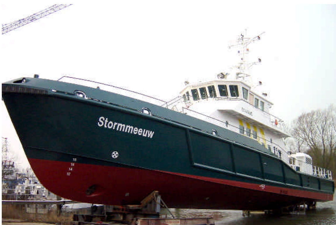
The latest new addition the Dutch Customs fleet named STORMMEEUW seen here during the launch February 1 st 2003, by the DAMEN shipyard, the ship is of the STANPATROL 3307 design.