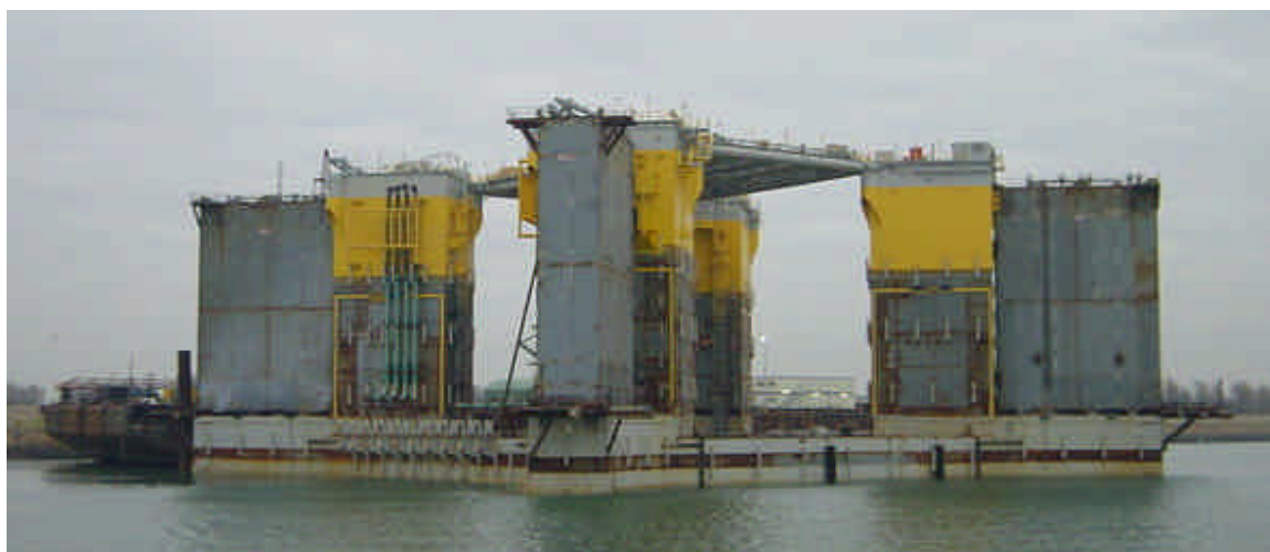
The first section of the KIZOMBA-A platform which arrived from Korea for completion, seen here moored at the HEEREMA location at the Caland Canal