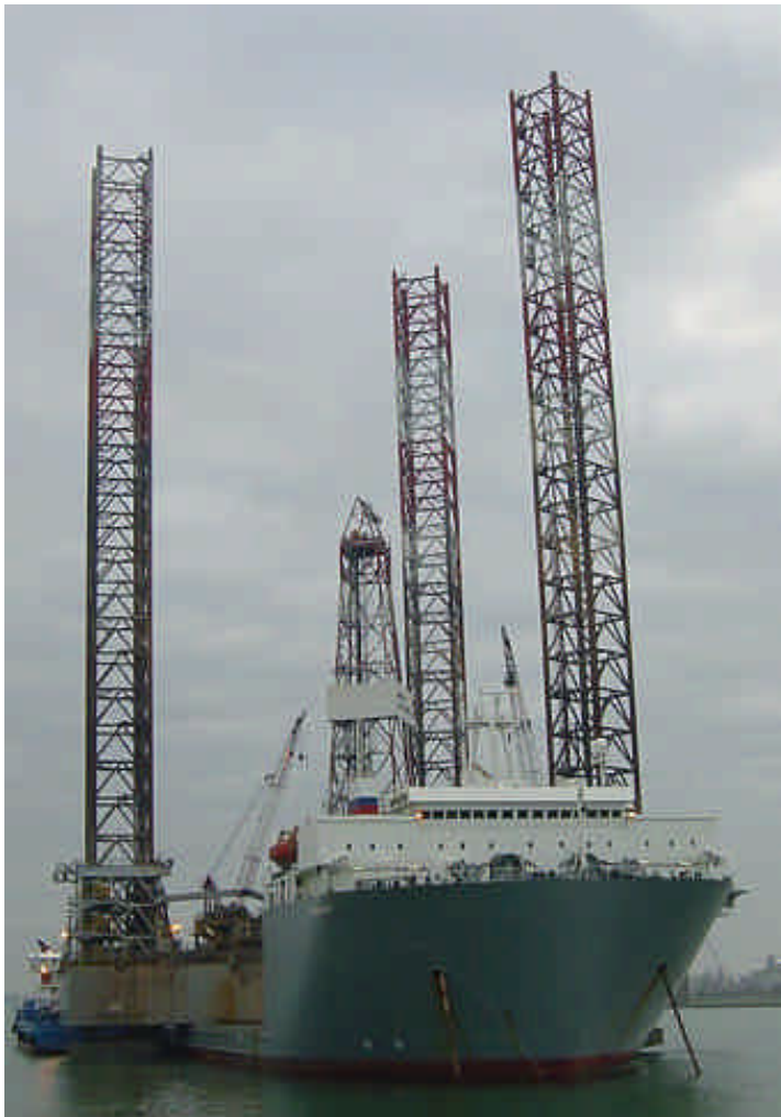
The TRANSHELF loaded the Jack Up rig TRANSOCEAN SHELF EXPLORER in the Caland Canal.