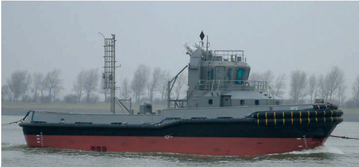
The new Damen casco no 511721 which arrived under tow of the PIETER last Saturday from Archangelsk via Murmansk and Kirkeness in Rotterdam – photo : Wim Kosten ©

The two newbuildings were towed one by one in (single tow configuration) from Severodvinsk to Murmansk, not as is done in the summer time , 2 tugs in 1 transport.