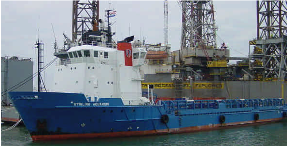
The STIRLING AQUARIUS moored alongside the TRANSHELF