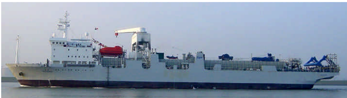
Top : The PROVIDER inward bound Monday morning bound for Keppel-Verolme Shipyard