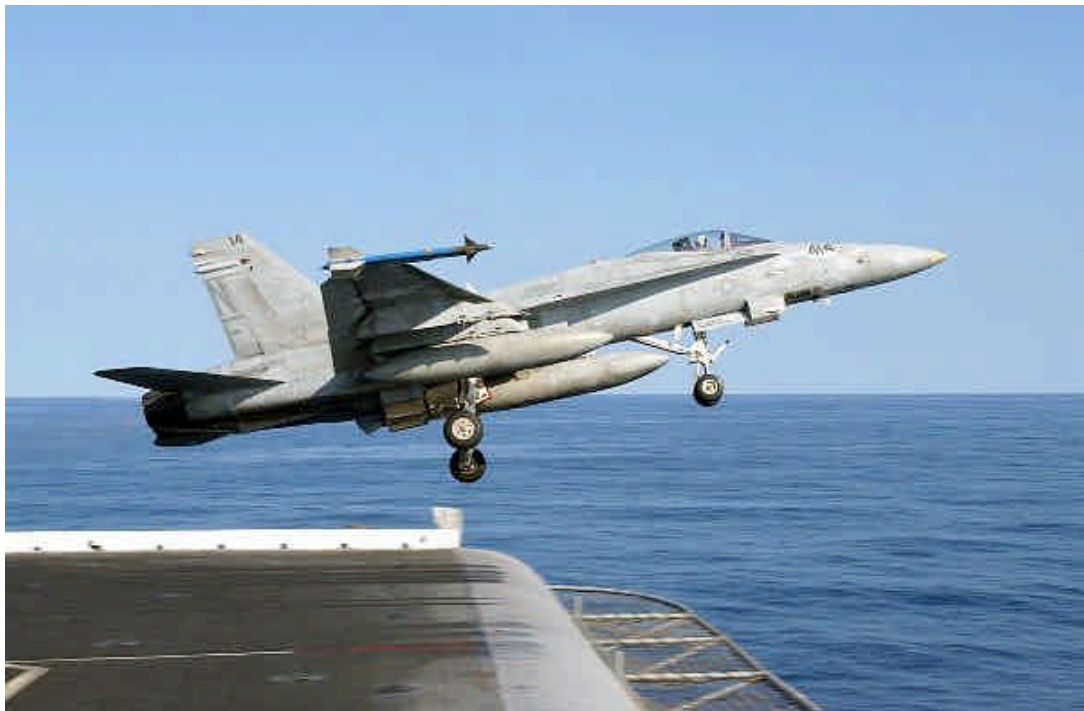
An F/A-18C "Hornet" assigned to the "Dam Busters" of Strike Fighter Squadron One Nine Five (VFA 195) launches from one of four steam-powered catapults on the Kitty Hawk's flight deck. Kitty Hawk is forward-based out of Yokosuka, Japan