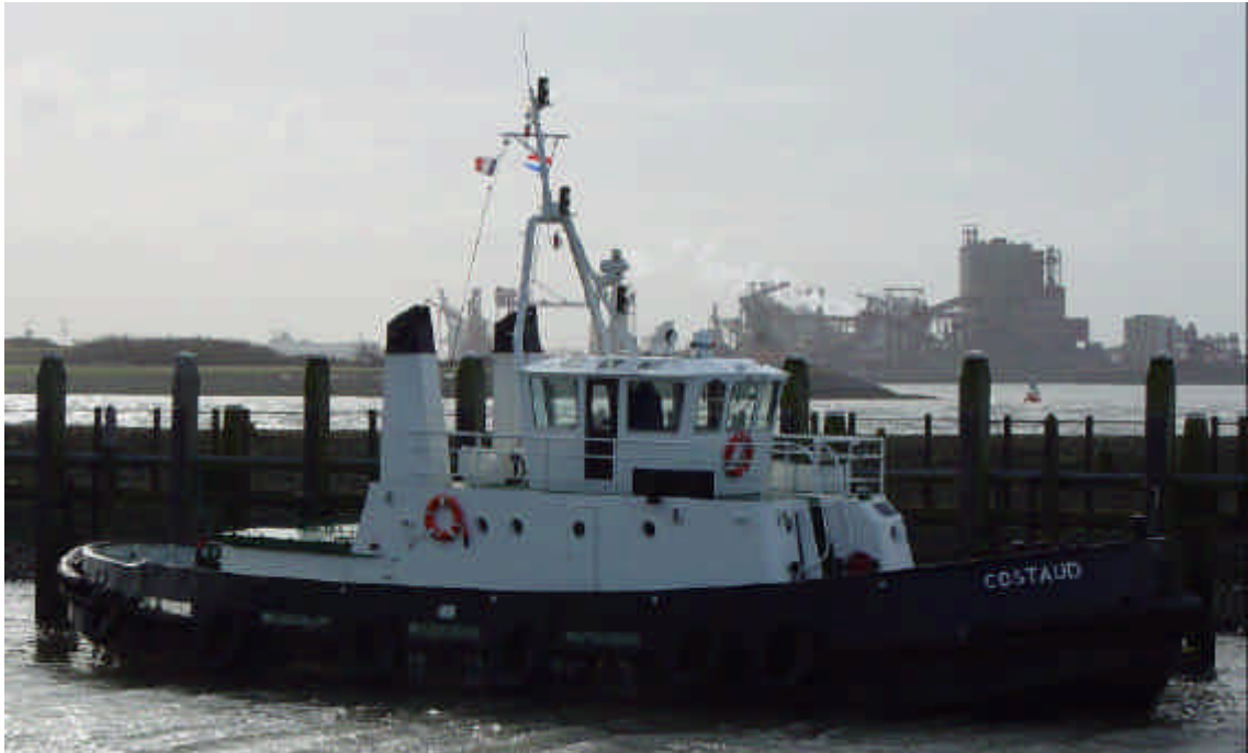
The French tug COSTAUD moored the harbour of Hoek van Holland