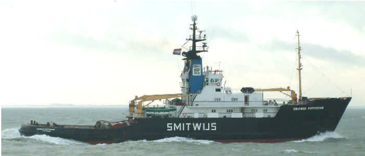
The SMITWIJS ROTTERDAM departed february 2 nd from Vlissingen bound for Rotterdam