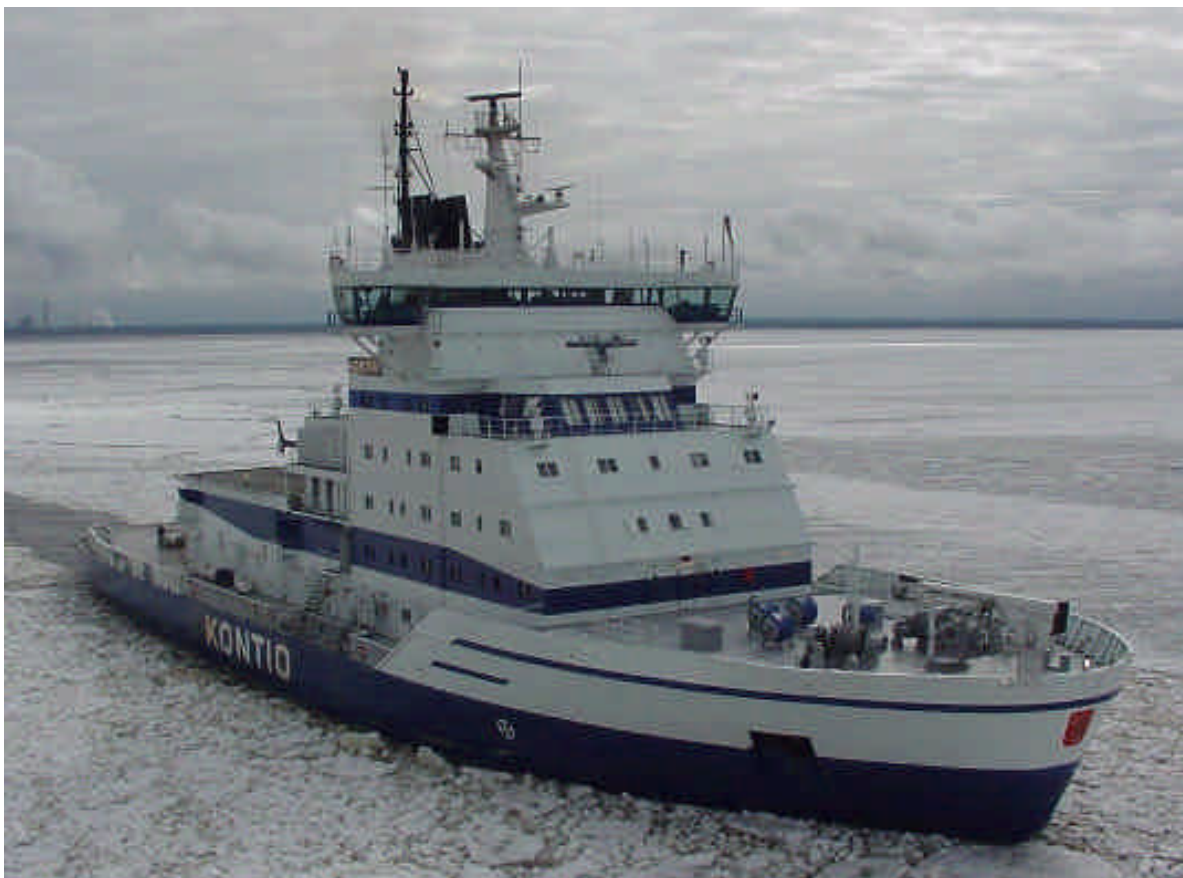
Top : The Finnish icebreaker KONTIO in action at this file picture

A FIFTH Finnish icebreaker has left its base in Helsinki as cold weather has led to rapid freezing of the Baltic. The Finnish Maritime Administration's Fennica sailed from Helsinki on December 30 to the northern part of the Gulf of Bothnia, where the ice is up to 50 cm thick. Three icebreakers operate in the region already, while one has been sent to assist shipping in the eastern part of the Gulf of Finland, where the ice is up to 45 cm thick. Temperatures fell close to -40°C in Western Finland over the New Year and the Finnish coast is covered with ice save for the southernmost port of Hanko, according to Jouni Vainio, researcher at the Finnish Institute of Maritime Research. The freeze has come a week earlier than in cold winters such as 1987, 1995 and 1996. In the very cold winter of 1987, ice covered 405,000 km 2 of the sea, while in the very mild winter of 1989 just 52,000 km 2 was frozen