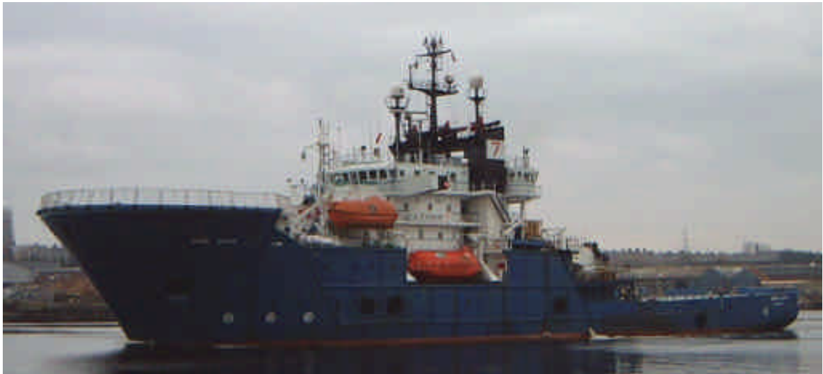
Top : The DSND MAYO one of the workvessels of Subsea 7

Subsea 7 is "in the final stages of negotiating two major contracts in the UK sector," according to a statement issued by the company at the end of December.