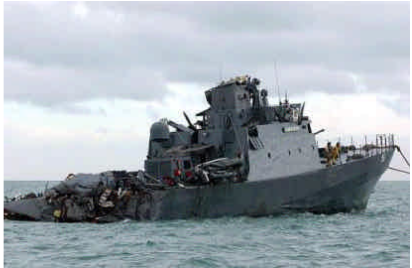
Top : The damaged 500-ton Singapore Navy ship RSS Courageous was towed back to its base in Changi, Singapore, Saturday, Jan. 4, 2003.

They both alleged that they will refer the territorial dispute to the International Court of Justice for resolution.