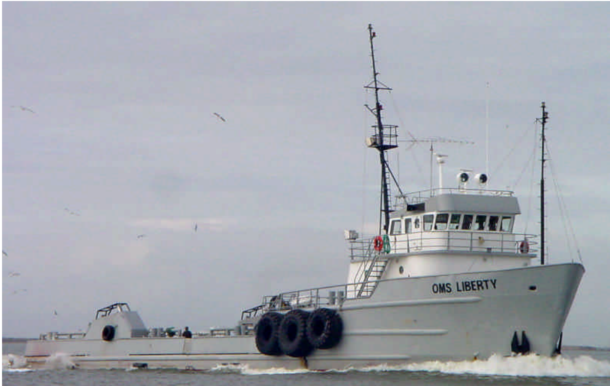
The OMS LIBERTY departing from Galveston