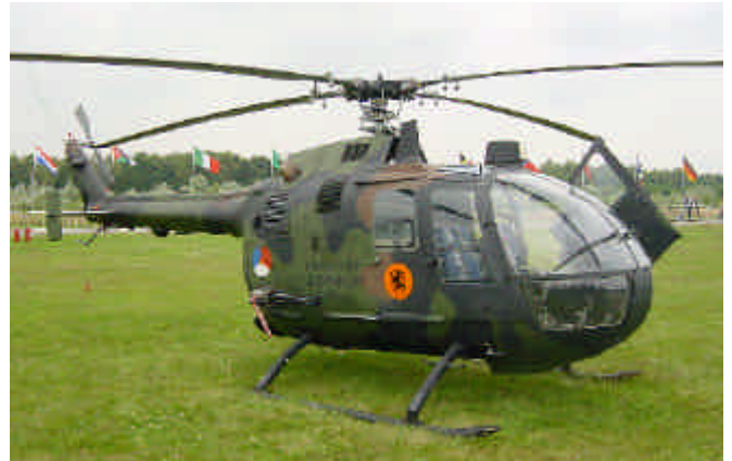
A Bolkow BO-105 helicopter of the Royal Dutch Airforce