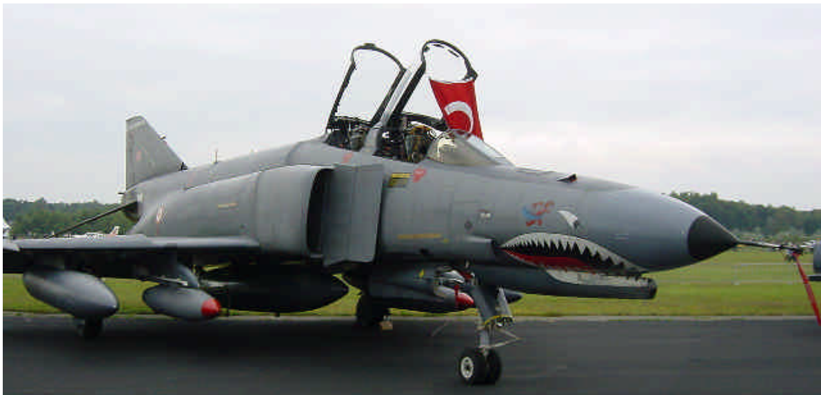
Top : The Turkish airforce was present with 2 F2E Phantoms at the static show