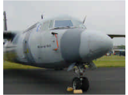
The Fokker 60 U-01 ( Marius van Meel ) transport plane of the Royal Dutch Airforce

Below : the USAF was present with two F15-E fighter aircraft, this planes are the latest new type's of the F 15 series and based at Bittburg in Germany.