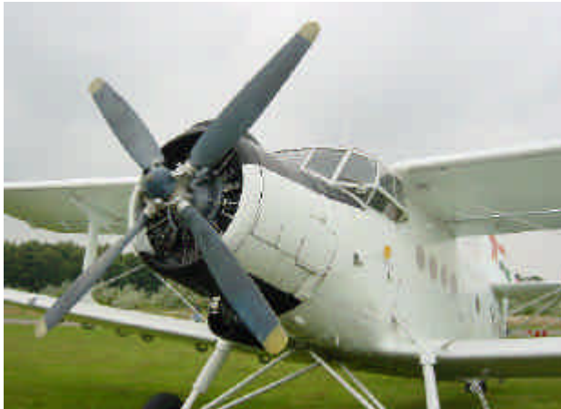
An ANTONOV plane from one of the former Soviet Republics