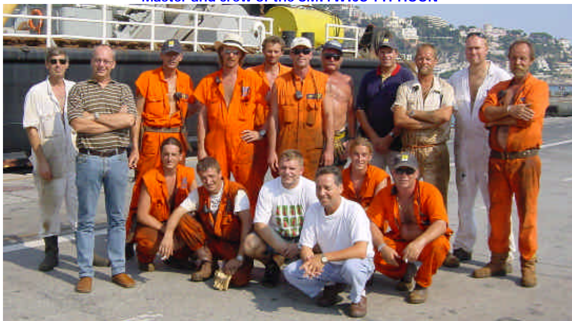
Master and crew of the TAKLIFT 4