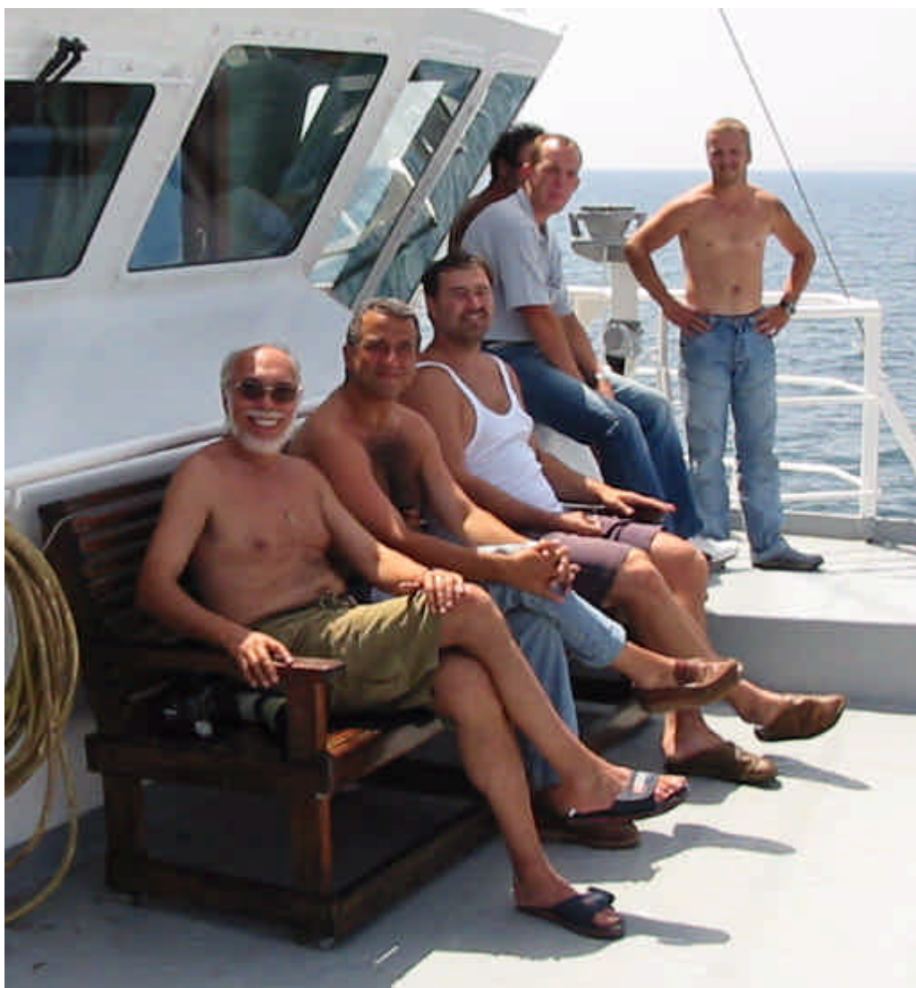
Master and crew of the SMITWIJS TYPHOON