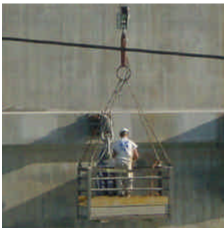
Tecnitas which was checking all the

This breakwater is build in a drydock near La Linea in Spain, the dock had the following dimensions 400 mtr long and 60 mtr wide and a depth of 15 mtrs, and when the construction was completed the breakwater was floated up and the basin was opened to the sea.