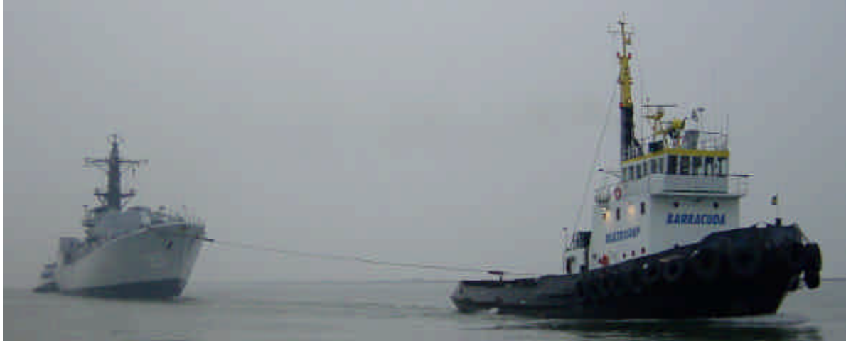
The MULTRASHIP tug BARRACUDA arrived with the former Dutch frigate DE RUYTER at the river bound for the breakers at 's Gravendeel.