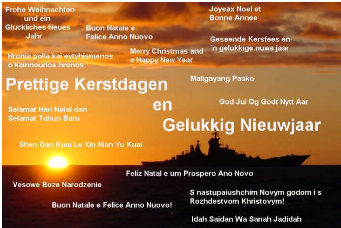
The Russian Kirov class nuclear powered guided missile cruiser Petr Velikiy near the Kursk Location