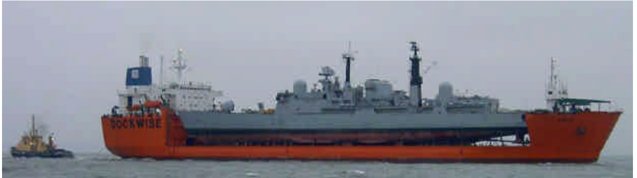
The SWAN arrives at Portsmouth with the crippled Nottingham