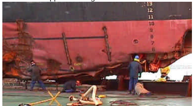
Several pictures of the damage on the HMS Nottingham