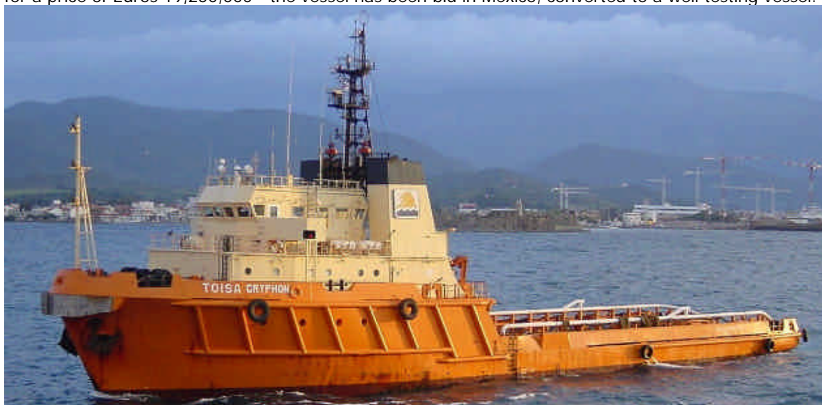
Top : The TOISA GRYPHON operating at the Rion Bridge project in Greece

Toisa Limited has purchased the French Telecom cable laying vessel Fresnel (built 1997 - 15,400 BHP) for a price of Euros 19,250,000 - the vessel has been bid in Mexico, converted to a well testing vessel.