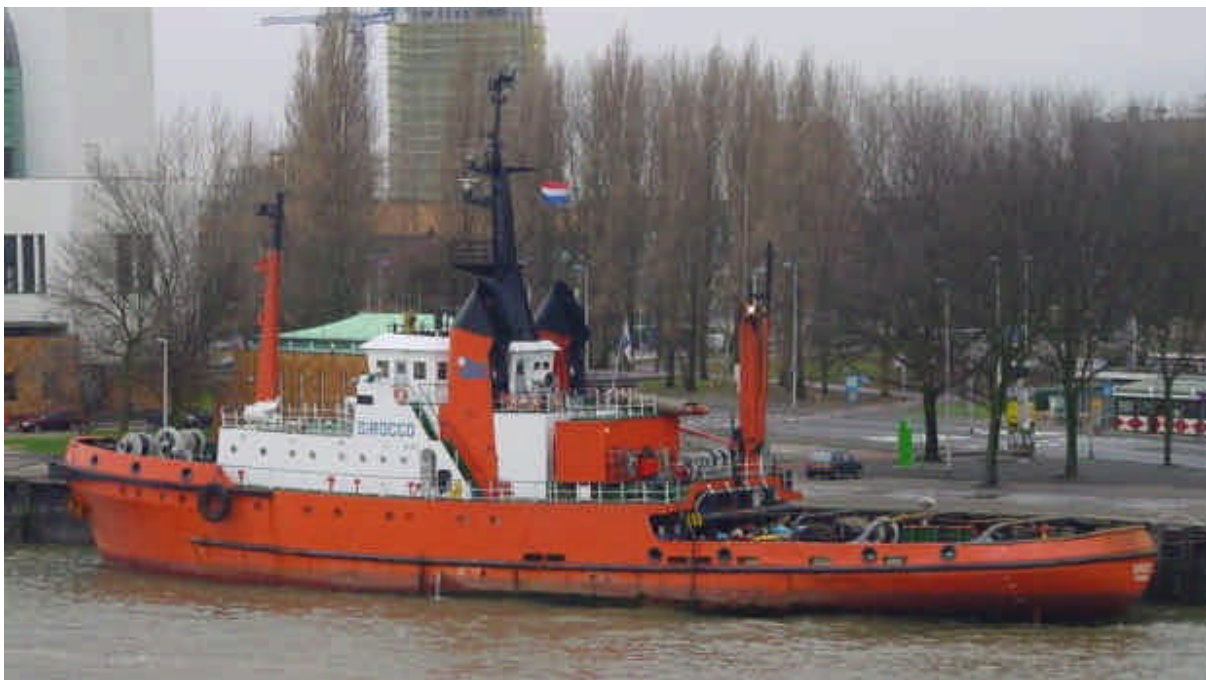
The ITC Tug SIROCCO moored at the Parkkade

SIROCCO (7613002) Int Transport Contrators Man BV Heemstede/PAN 1976 Matsuura Hiroshima GT 987 dwt 942 Loa 55m Bm 11.2m 8990 bhp 102 ttp