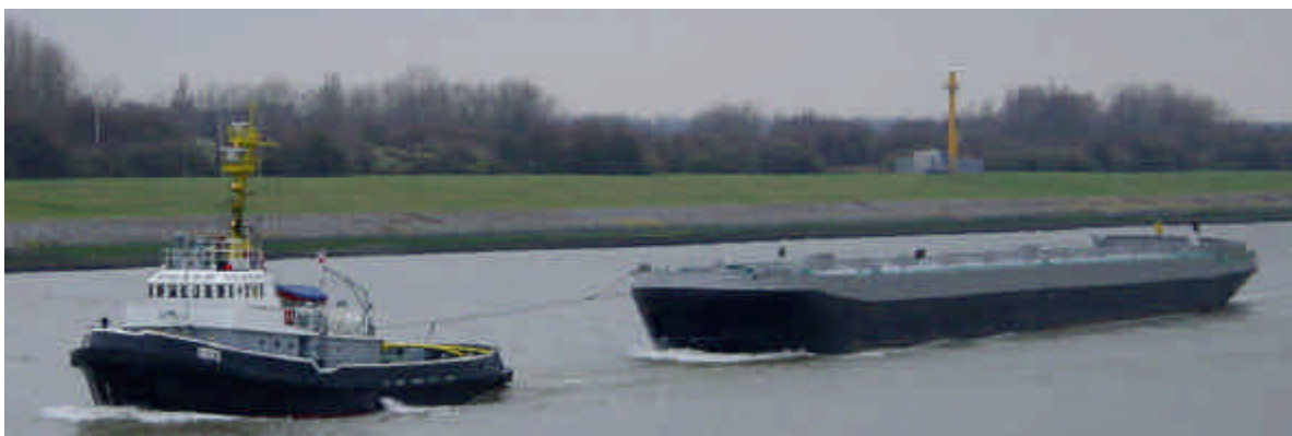
The Polish tug ODYS arrived Friday with a new building hull from Poland

SIROCCO (7613002) Int Transport Contrators Man BV Heemstede/PAN 1976 Matsuura Hiroshima GT 987 dwt 942 Loa 55m Bm 11.2m 8990 bhp 102 ttp