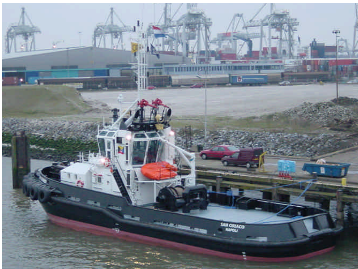
The Italian tug SAN CIRIACO is the latest newbuilding from Damen seen at the picture at the Niehuis & van den Berg Shipyard Friday December 6 th .