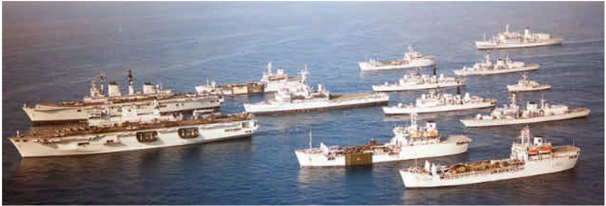
Top : The Royal Navy Task Force during 2001

The MOD announced that a Royal Navy Task Group would deploy to the Asia Pacific region in 2003 to take part in Flying Fish , an exercise with the UK's partners under the Five Power Defence Arrangements, Australia, Malaysia, New Zealand and Singapore.