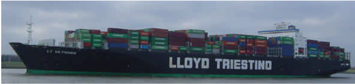
The LT Ulysses arrived Friday in Rotterdam