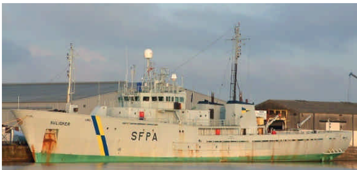
The Scottish fisheries protection vessel SULISKER moored at the Alexandra dock, Hull 18-11-2002