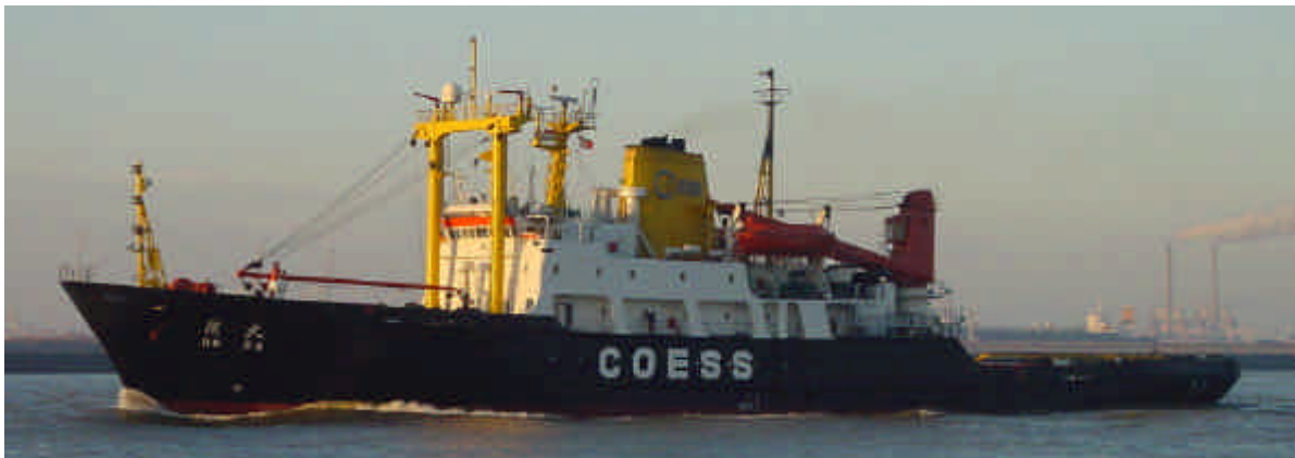
The Chinese COESS tug DE DA arrived Saturday morning in Rotterdam