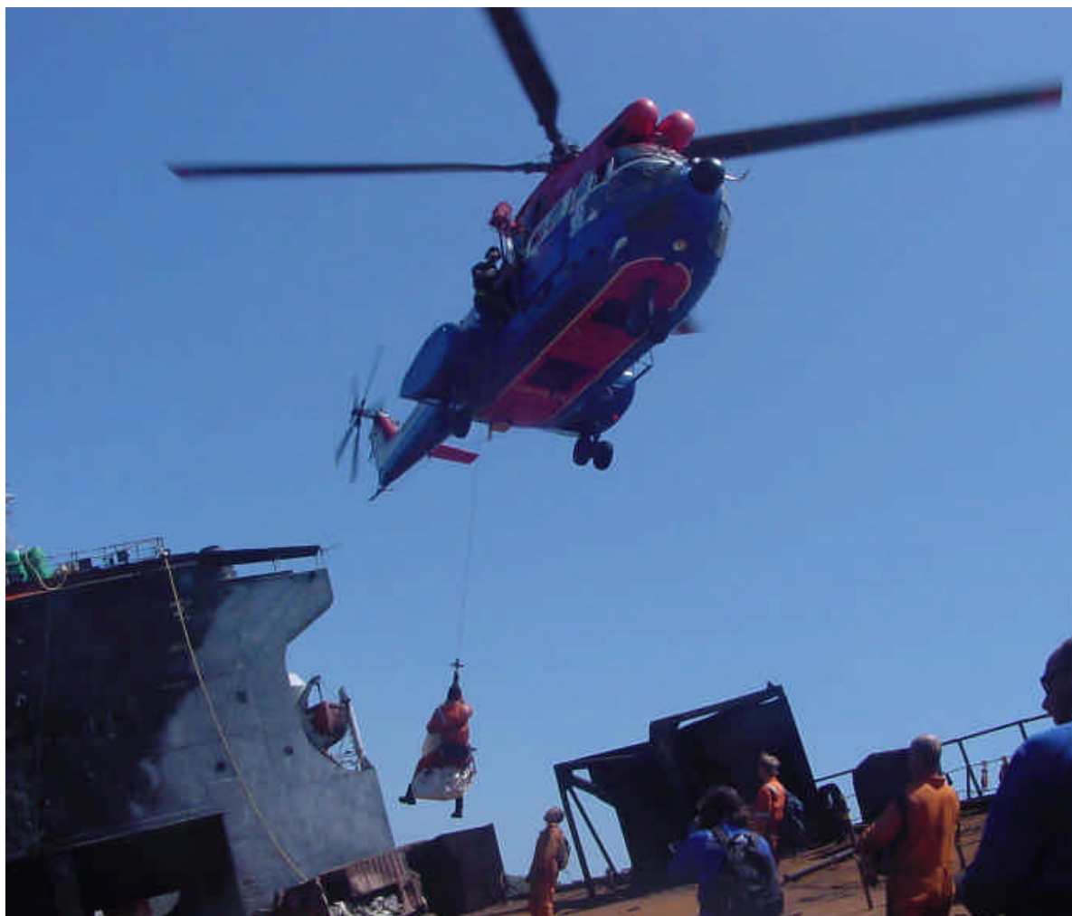
Top : File picture of a PUMA helicopter lowering the salvage team onboard the Jolly Rubino