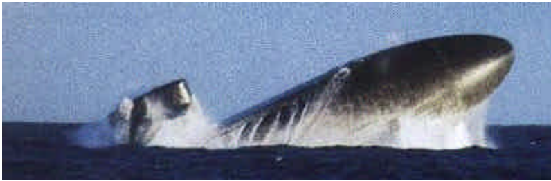
Left : LOS ANGELES class submarine surfacing

After the accident, the submarine tried to make radio contact with the other vessel involved in the accident. "However, the other vessel did not respond, did not appear to need assistance and departed the area," the news release said.