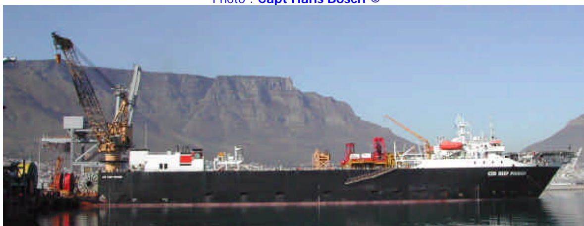
The CSO DEEP PIONEER moored at the port of Cape Town during the mobilization for the installation of the FPSO GLAS DOWR at the Sable Oilfield.