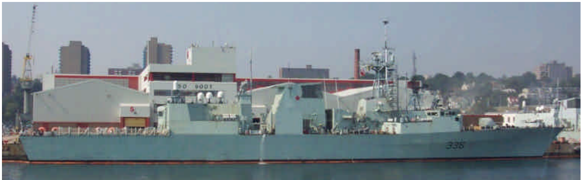
HMCS Montreal moored in Halifax during August 2002