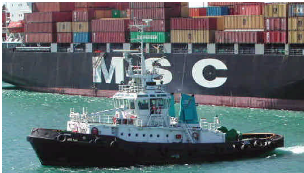
The tug SHIRAX pulls the MSC GIOVANNA from her berth in Cape Town.