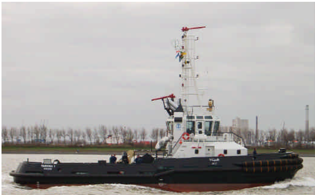
The newbuilding for Algeria named TASSINA 1 pictured during trials at the Waterweg Thursday November 14 th .