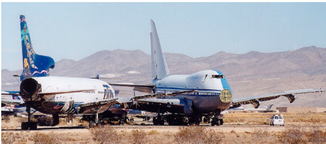
N136SW Half Air China, half Air Force One, getting dismembered at VCV Victorville - Southern California Logistics (International) (George AFB)