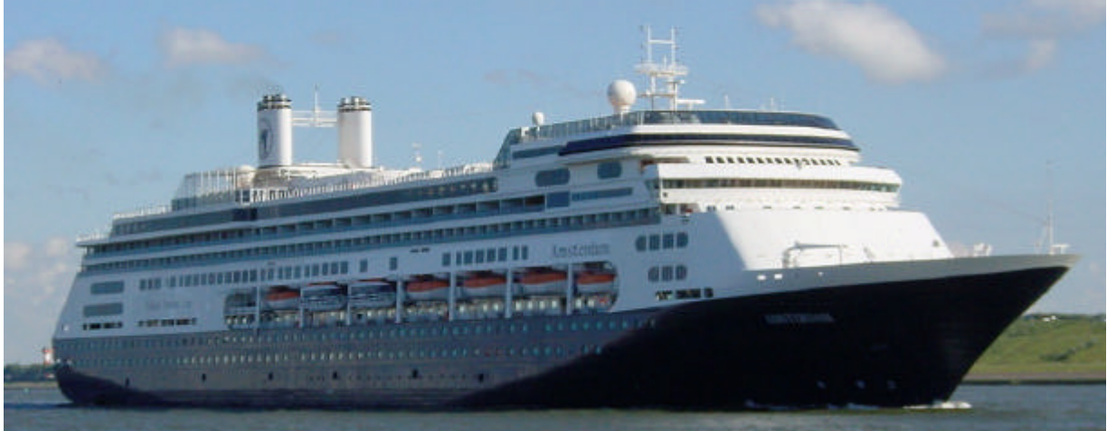
( Top : The AMSTERDAM leaving Rotterdam port 31-05-2001 --)

The fleet is expected to generate a record number of cruisers, including more first-time cruisers than ever. In research recently conducted by CLIA, "The Cruiser and Cruise Prospect Study," nearly nine out of 10 vacationers -- including 85 percent of pleasure travelers who have yet to cruise -- say they are interested in cruising.