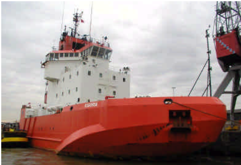
And berthed at SEABREX at the Merwehaven