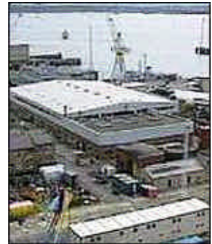
The site is preferred by both consortia