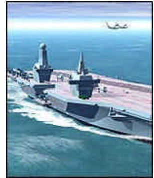
The first ship is due in service in 2012

"While there is some time before the contracts will be awarded, what is clear is that no matter the outcome - Scotland is set to be a winner."