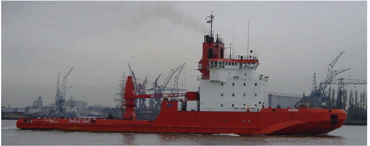
The KIGORIA arrived with the Heerema 104 at the port of Rotterdam Tuesday October 29 th.