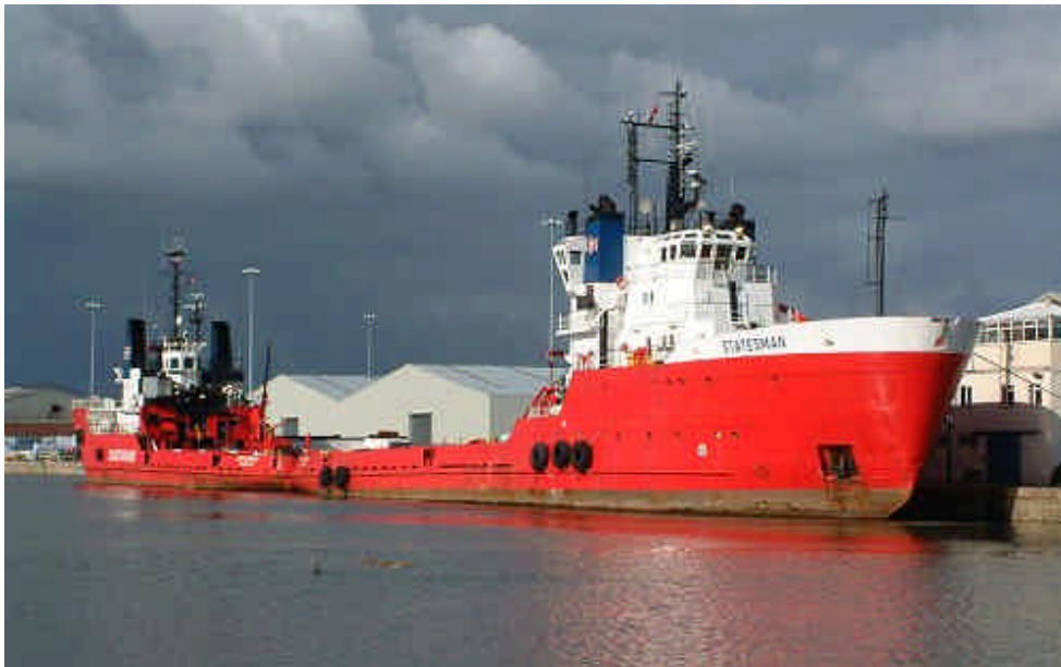
"Statesman" and "Englishman" at Alexandra dock 06/10/02.

The Netherlands-flagged ship passed under the suspension bridge, built in 1993, that soars across Tokyo Bay during its approach to Harumi wharf in Tokyo Bay.