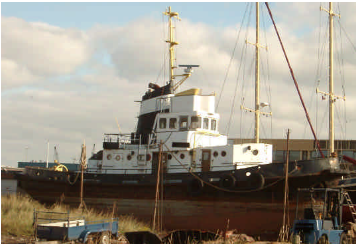
Photo : The former Eline Muller at the slips in IJMUIDEN Sunday October 6 th