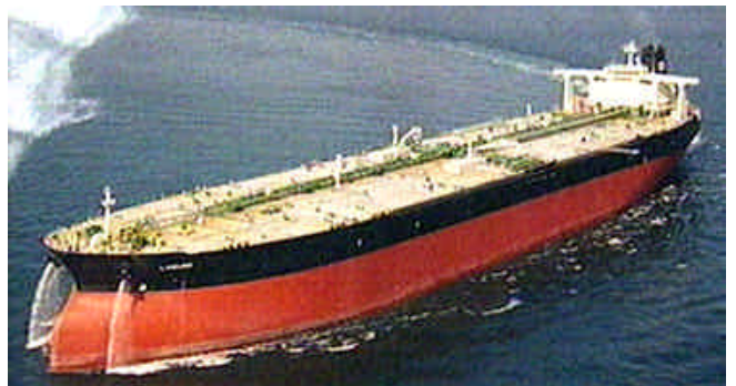
Top : The LIMBURG in better times.

the tanker in the port of Ash Shihr, at Mukallah, 570 kilometres (353 miles) east of Aden, and believes the two vessels touched before an explosion occurred.